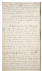
An Act relative to slaves and servants (NYSA_13036-78_L1817_Ch137_p2)