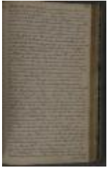
Letters patent to operate a ferry across the Hudson River (NYSA_12943-78_1752_V012_p418-p423)