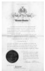
World War I - Fire Prevention Proclamation (NYSA_13035-79_B1_F1_2)