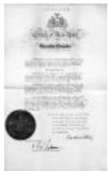
World War I - Forget Me Not Day Proclamation (NYSA_13035-79_B2F3)