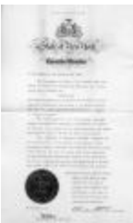
World War I - Liberty Day Proclamation (NYSA_13035-79_B2_F2_3)