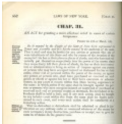
An Act for granting a more effectual relief in cases of certain trespasses (NYSA_13036-78_L1783_Ch031_printed)