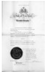
World War I - Flag Day Proclamation (NYSA_13035-79_B1_F1_1)