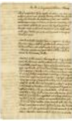
An Act for the gradual abolition of slavery (NYSA_13036-78_L1799_Ch062)