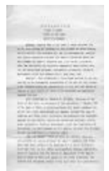
World War I - Law Chapter 625 Proclamation (NYSA_13035-79_B2F4)