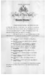
World War I - Italy Day Proclamation (NYSA_13035-79_B2_F2_1-2)