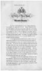
Governor's Proclamation (NYSA_13035-79_B2_1918_37)