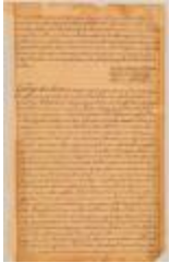
Land Patent, 1763 (NYSA_12943-78_1763_V14_p19-p23)