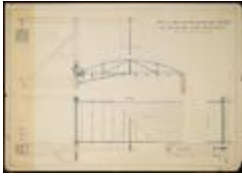
Plan of Swartz Tow-path lift Bridge over Pratts Slip, Lower Black Rock (NYSA_B0380-85_0286)