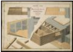
General Plan for Pier at the Head of Double Locks. Erie Canal. (NYSA_B0380-85_0657)