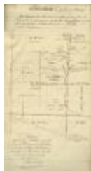
A Map of Township No. 13 in great Tract No. 1 Macomb's Purchases on the River St. Regis in the Town of Dickinson in Franklin County (NYSL_SC17820_B7_F3)