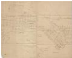
A Map of Partition of Land near the boundaries of Albany, Greene and Schoharie Counties (NYSL_SC17820_B4_F14)