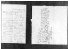
Civil War. Letter from Major General Doubleday to Lockwood Doty. (NYSA_A4111-78_B3F8_Doubleday)