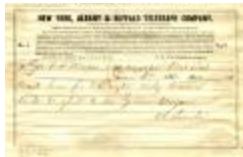
[Telegram from Abraham Lincoln to Governor Edwin D. Morgan] (NYSA_A4149-78_B3_V7_p99)