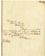
[Telegram from Governor Edwin D. Morgan to Abraham Lincoln]