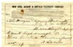
[Telegram from Abraham Lincoln to Governor Edwin D. Morgan] (NYSA_A4149-78_B3_V7_p109)