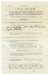
Account submitted by Putnam County, detailing monies expended, men furnished, and economic effects of the Civil War (NYSA_A4114-78_PutnamCountyReport1864)