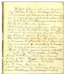
Report of examinations for exemption from military duty (NYSA_A4157-78_V1)