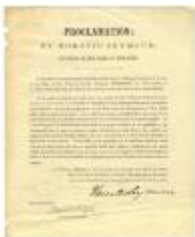
Proclamation by Horatio Seymour (NYSA_A4129-78_1863_11_10)