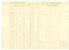
Return of Civil War Officers and Enlisted Men Who Have Been in the Military or Naval Service (NYSA_A0389-78_2_V5)