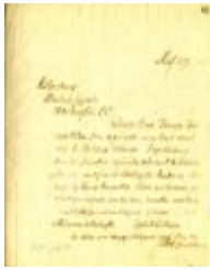
[Telegram from Governor Edwin D. Morgan to Abraham Lincoln, copy] (NYSA_A4149-78_B4_V10_p061)