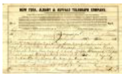
Telegram from Abraham Lincoln to Governor Edwin D. Morgan (NYSA_A4149-78_B3_V7_p111)