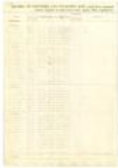
Return of Civil War Officers and Enlisted Men Who Have Died While in Service, Volume 6, pages 665-666 (NYSA_A0389-78_3_V6_p665-666)