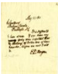
[Telegram from Governor Edwin D. Morgan to Abraham Lincoln] (NYSA_A4149-78_B4_V10_p034)