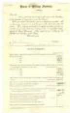
Account submitted by the town of Patterson, Putnam County, detailing monies expended and men furnished during the Civil War (NYSA_A4114-78_B3_PutnamCounty_Patterson)