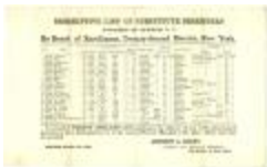
Descriptive List of Substitute Deserters (NYSA_A4111-78_B4_F2_1863_10_01)