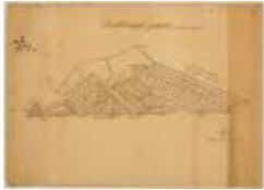
Map of Coxeborough Patent. Map #52 (NYSA_A0273-78_52)