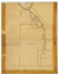
Onondaga Reservation Outbounds, Onondaga county; 1703; 82 square miles. Map #818A (NYSA_A0273-78_818A)