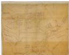
Map of Glen Bleeker and Lansing's Patent and Chase Patent, Fulton County and Hamilton County (NYSA_B1610-99_138_1)