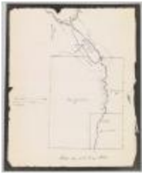
Photostat of Map #818A. Map #818B (NYSA_A0273-78_818B)