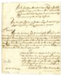
Petition of Cornelius Swits for a tract of land, 1708 (NYSA_A0272-78_V04_p120a)