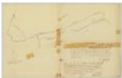
Warrant and survey for Wm. Shepard and Joshua Measereau. 2,970 acres. Map #697 (NYSA_A0273-78_697)