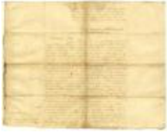
Application for Land Grant, Willem Tietsoort, Orange County, 1707 (NYSA_A0272-78_V04_p104)