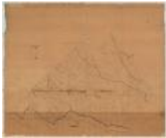
Map of several tracts of land in Orange and Ulster County. Map #237 (NYSA_A0273-78_237)