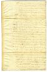
Petition of Hilletie van Olinda for a tract of land, 1704 (NYSA_A0272-78_V04_p027a)