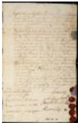
Indian deed to Isaac Swits for a tract of land, August 16, 1707 (NYSA_A0272-78_V04_p120b)