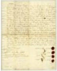
Indian deed to Hilletie Van Olinda, October 6, 1704 (NYSA_A0272-78_V04_p027b)