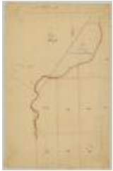
Map of Kingsborough Patent, along Cayadutta Creek. Map #860 (NYSA_A0273-78_860)