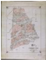
Map of Township No. 8, John Brown's Tract (NYSA_B1405-96_179)