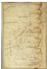
Sketch Showing the Progress of the Primary Triangulation (NYSA_B1405-96_367)