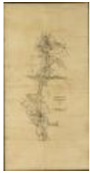
Progress Sketch Upper Saranac Lake (NYSA_B1405-96_305)