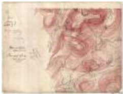
Map of Township Number 10 (Marked #3 of Series) (NYSA_B1405-96_107B2)