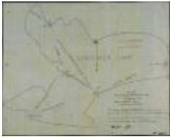
Map Showing Ice Measurements of Limekiln Lake (NYSA_B1405-96_207)