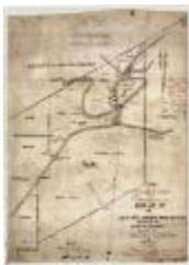
Map of Lot No. 31 Rogers Patent in Town of North Hudson (NYSA_B1405-96_105A.tif)