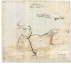
Map Showing Survey of Mud Pond and its Outlet (NYSA_B1405-96_118A13)