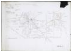
Map of Lands as Divided September 1889 (NYSA_B1405-96_239)