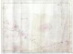
Map of Bad Luck Ponds (NYSA_B1405-96_04)