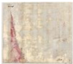
Map showing marshland, trees, and elevation, with numbered points 40-63 along an unnamed river (NYSA_B1405-96_107A1)