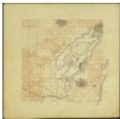
Lake Placid (NYSA_B1405-96_346)