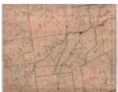
Map of the Towns of Au Sable, Franklin, Black Brook, Chesterfield, Lewis, Jay, Wilmington, Keene, North Elba, and St. Armand (NYSA_B1405-96_150A07)