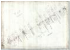
Map of Timber Lands between Totten and Crossfield's Purchase and Brown's Tract (NYSA_B1405-96_71B)