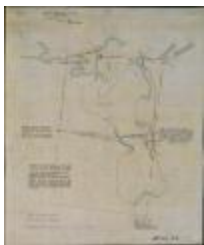
Map of Lot No. 220, T[ownshi]p No. 10, O.M.T. [Old Military Tract] Showing Property Adjoining [and Southern Portion of Loon Lake] (NYSA_B1405-96_2)