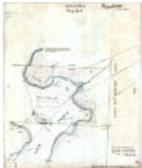
Map of a Portion of the North East Shore of Lake Placid (NYSA_B1405-96_118A03)