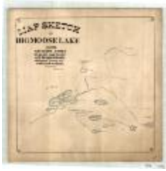
Map of Big Moose Lake and the Adjacent Lakes, Ponds, Streams and Trails (NYSA_B1405-96_14)