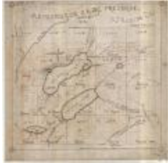
Map of the Adirondack Game Preserve, owned by the J&J Rogers Co., AuSable Forks (NYSA_B1405-96_75)