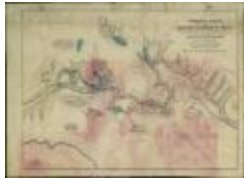
Ground Plan of Beds and Veins of Magnetic Oxide of Iron: Traversing the Hypersthene and Feldspathic Rocks at Adirondack Essex County, New York (NYSA_B1405-96_310)