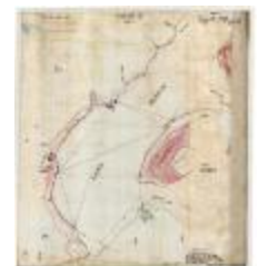
Map of a Portion of the Shore Line of Lake Placid, showing Gull Rock and Moose Island (NYSA_B1405-96_118A05)