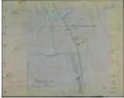
Topographical map of the Salmon River, Clinton County, N.Y. (NYSA_B1405-96_18)