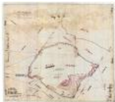
Map of Moose Island, Located in Lake Placid (NYSA_B1405-96_118A09)