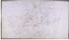
Central Adirondack Triangulation Network Diagram with Primary Triangulation Station Names (NYSA_B1405-96_46)