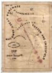
Map Showing the Western Boundary Line of Totten and Crossfield's Purchase (NYSA_B1405-96_2B01)