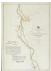
Map of the Survey of the Sacondaga [sic] River Between Station 484 and Station 551 (NYSA_B1405-96_395)