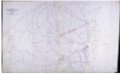
Progress Sketch of the Primary Triangulation (NYSA_B1405-96_174)