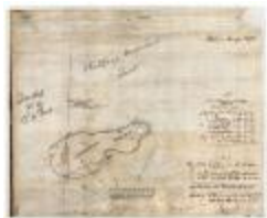
Map of Connery Pond (NYSA_B1405-96_118A)