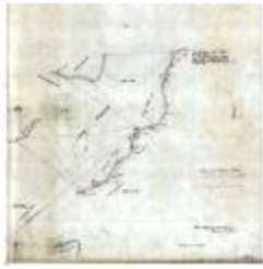
Map of Eastern Coast of Lake Placid (NYSA_B1405-96_118A01)