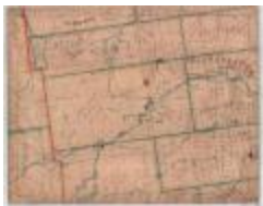
Map of the Towns of Plattsburgh, Beekmantown, Schuyler Falls, Peru and Au Sable, Ellensburg, Bellmont, Franklin, Black Brook, Saranac and Dannemora (NYSA_B1405-96_150A05)