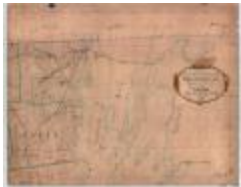
Map of North Eastern New York near Lake Champlain (NYSA_B1405-96_150A02)