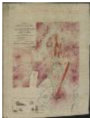
A Map exhibiting the relative position of the Veins of Iron Ore in and adjoining the Village of McIntyre, Essex County, New York, belonging to the Adirondack Iron and Steel Co. (NYSA_B1405-96_311)