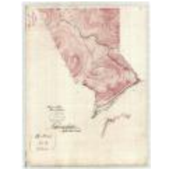
Map of Township Number 10 (Marked #4 of Series) (NYSA_B1405-96_107B3)