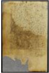
Patent of Peter Harmse for a house and lot in New Orange (NYSA_A1881-78_V23_0433_36)