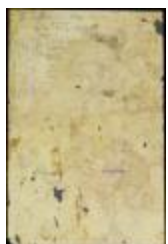
Complaint of the fiscal against Asser Levy (NYSA_A1881-78_V23_0301)