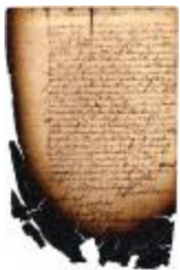
Letter of Jeremias van Rensselaer to Gov. Anthony Colve (NYSL_sc7079-b05-f57_p1_ncn)