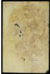
Complaint of the fiscal against James ———, sent from Flushing as a public disturber (NYSA_A1881-78_V23_0391)