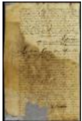
Patent of Gerrit Hendrickse for a house and lot in New Orange (NYSA_A1881-78_V23_0433_38)