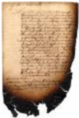
Letter of Jeremias van Rensselaer to Oloff Stevensen van Cortlandt (NYSL_sc7079-b05-f56_p2_ncn)