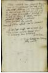
Certificate of the magistrates in favor of granting certain land on the west side of Staten Island to Henderick Rycken (NYSA_A1881-78_V23_0403)