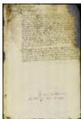
Complaint against George Demis for smuggling rum into Long Island (NYSA_A1881-78_V23_0355b)