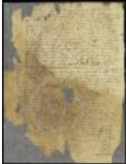
Patent of Peter Stoutenbergh for a lot in New Orange (NYSA_A1881-78_V23_0433_22)