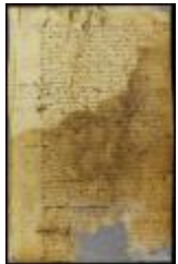
Patent of Jacobus van de Water for a house and lot in New Orange (NYSA_A1881-78_V23_0433_37)