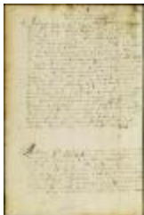
Commission of Jacobus van de Water to be town major of New Orange (NYSA_A1881-78_V23_0188a)