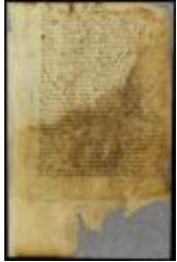
Patent of Lodewyck Post for a house and lot in New Orange (NYSA_A1881-78_V23_0433_35)