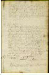
Letter from gov. Colve to the magistrates of Schenectady (NYSA_A1881-78_V23_0189a)