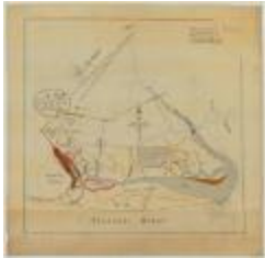
Map of the Town of Gravesend. Map #429 (Copy) (NYSA_A0273-78_429_copy)