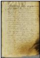
Pass to Lourens Sachariassen, skipper of the ship Welfare, for a voyage to Surinam (NYSA_A1881-78_V23_0433_07)