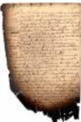
Letter of Jeremias van Rensselaer to Jan Baptist van Rensselaer