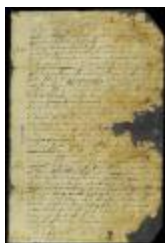
Letter from gov. Andros to gov. Colve (NYSA_A1881-78_V23_0415)