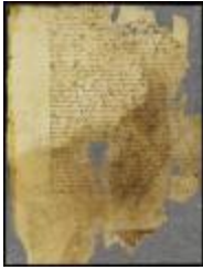
Patent of Paulus Regrinar for land on Staten Island (NYSA_A1881-78_V23_0433_21)