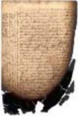
Letter of Jeremias van Rensselaer to Jan Baptist van Rensselaer (NYSL_sc7079-b05-f57_p2-f58_p2_ncn)