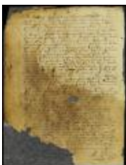
Patent of the Lutheran congregation for a lot in New Orange (NYSA_A1881-78_V23_0433_26)