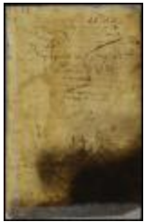
Register of Dutch patents and deeds from 29 November 1673 to 3 November 1674 (NYSA_A1881-78_V23_0433)