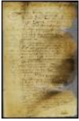
List of articles presented by capt. Knyff to the Lutheran church (NYSA_A1881-78_V23_0424b)