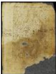
Patent of George Cobbet for a lot in New Orange (NYSA_A1881-78_V23_0433_25)