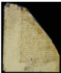
Petition of children and heirs of Cornelis Melyn concerning Staten Island (NYSA_A1881-78_V23_0406)