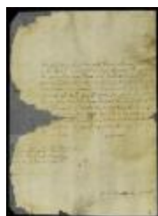
Letter from gov. Andros to gov. Colve (NYSA_A1881-78_V23_0412)