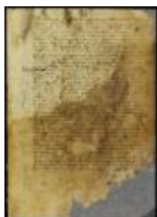
Patent of Ephraim Herman for a lot in New Orange (NYSA_A1881- 78_V23_0433_33)