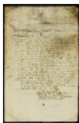
Petition of Gerrit Janz Roos to purchase a piece of ground in New Orange (NYSA_A1881-78_V23_0410)