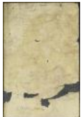
Complaint of the fiscal against capt. Fleet and Walter Webly (NYSA_A1881-78_V23_0300)