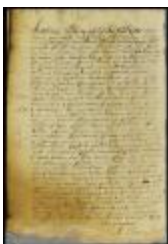
Bill of sale of the confiscated ship Neptune to Dirck van Clyff (NYSA_A1881-78_V23_0433_08)