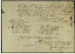
Nomination of magistrates for Gravesend (NYSA_A1881-78_V23_0402)