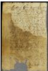
Patent of Ephraim Herman for a lot outside the city of New Orange (NYSA_A1881-78_V23_0433_40)