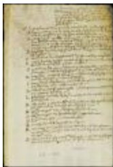
Inventory of papers delivered in the case of Jacob Varrevanger vs. Cornelis Steenwyck (NYSA_A1881-78_V23_0353)