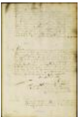
Instructions for captain Vonck (NYSA_A1881-78_V23_0191b)