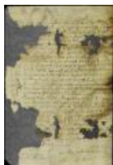
Letter from gov. Andros to gov. Colve (NYSA_A1881-78_V23_0416)