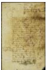
Petition of the minister and elders of the Lutheran church at Willemstadt to be allowed to bury their own dead (NYSA_A1881-78_V23_0408)