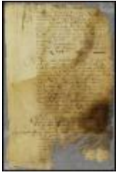
Patent of Elizabeth Drisius for a lot in New Orange (NYSA_A1881-78_V23_0433_57a)