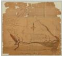
Map of the Town of Gravesend. Map #429 (NYSA_A0273-78_429)