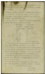
Typewritten translation of report of Jacob Leisler and Dirck van der Clyff of amounts due workmen at the fort (NYSA_A1881-78_V23_0298)