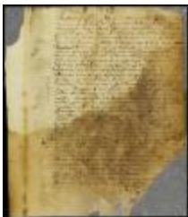
Patent of Andries Meyer for a lot in New Orange (NYSA_A1881- 78_V23_0433_31)