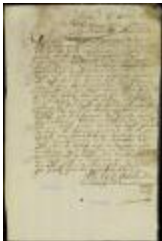
Petition of Peter Stoutenburgh for a piece of land to be used as a kitchen garden (NYSA_A1881-78_V23_0394)