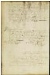
Instructions for the officers of militia at the Esopus (NYSA_A1881- 78_V23_0190b)