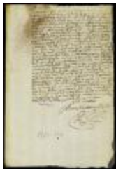
Declaration of Metjie Wessels as to the trespass committed by schout De Milt (NYSA_A1881-78_V23_0352)