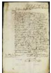
Petition of Balthazar Bayard to be appointed commissary of exports and imports (NYSA_A1881-78_V23_0333)