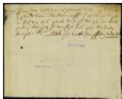
Return of survey of a parcel of land on Staten Island for Jan Scholten (NYSA_A1881-78_V23_0411)