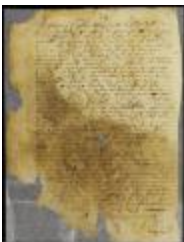
Patent of William van Vredenburgh for a lot in New Orange (NYSA_A1881-78_V23_0433_24)