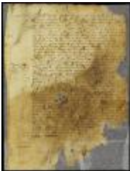
Patent of Gerrit Janse Roos for a lot in New Orange (NYSA_A1881-78_V23_0433_23)