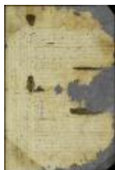
Letter from gov. Andros to gov. Colve (NYSA_A1881-78_V23_0414)