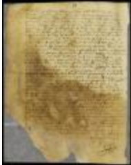
Patent of Simon Barentse Blanck for a lot in New Orange (NYSA_A1881-78_V23_0433_28)