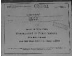
Public utilities annual report of Kings County Lighting Company, 1951 (NYSA_13345-81_B232_F10_Kings_County_Lighting_Company_1951)