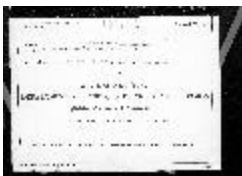
Public utilities annual report of New Amsterdam Gas Company, 1931 (NYSA_13345-81_B287_F05_New_Amsterdam_Gas_Company_1931)