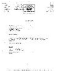
Municipal electric utilities annual report of the Village of Rouses Point to the Public Service Commission, 2007 (NYSA_13345-13_Village_of_Rouses_Point_2007)