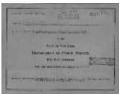
Public utilities annual report of Kings County Lighting Company, 1956 (NYSA_13345-81_B233_F03_Kings_County_Lighting_Company_1956)