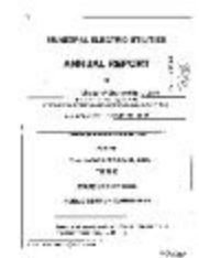
Municipal electric utilities annual report of the Village of Churchville to the Public Service Commission, 2006 (NYSA_13345-13_Village_of_Churchville_2006)