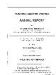
Municipal electric utilities annual report of the Village of Richmondville to the Public Service Commission, 2006 (NYSA_13345-13_Village_of_Richmondville_2006)