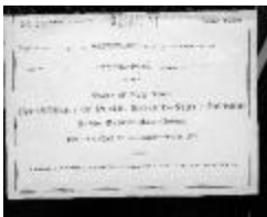
Public utilities annual report of New Amsterdam Gas Company, 1929 (NYSA_13345-81_B287_F03_New_Amsterdam_Gas_Company_1929)