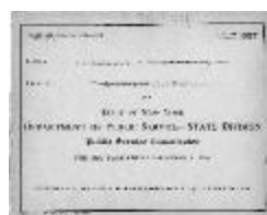
Public utilities annual report of Brooklyn Borough Gas Company, 1927 (NYSA_13345- 81_B049_F06_Brooklyn_Borough_Gas_Company_1927)