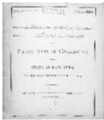
Public utilities annual report of The Astoria Light, Heat and Power Company, 1924 (NYSA_13345-81_B030_F04_Astoria_Light_Heat_Power_Company_1924)