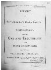
Report of the Suffolk Gas and Electricity Company to the Commission of Gas and Electricity of the State of New York, 1906 (NYSA_13345-81_B466_F01_1906-08-17)