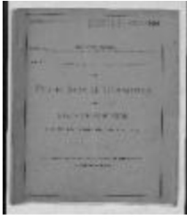
Public utilities annual report of Kings County Lighting Company, 1924 (NYS 13345- 81_B230_F07_Kings_County_Lighting_Company_1924)