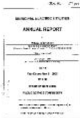
Municipal electric utilities annual report of the Village of Endicott to the Public Service Commission, 2005 (NYSA_13345-13_Village_of_Endicott_2005)