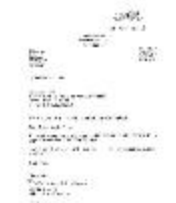
Municipal electric utilities annual report of the Village of Hamilton to the Public Service Commission, 2006 (NYSA_13345-13_Village_of_Hamilton_2006)