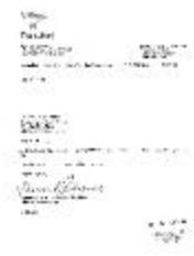
Municipal electric utilities annual report of the Village of Frankfort to the Public Service Commission, 2006 (NYSA_13345-13_Village_of_Frankfort_2006)