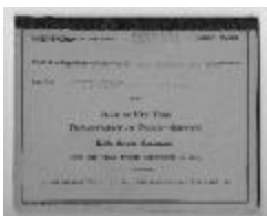
Public utilities annual report of The Astoria Light, Heat and Power Company, 1933 (NYSA_13345-81_B029_F04_Astoria_Light_Heat_Power_Company_1933)