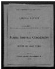
Public utilities annual report of Kings County Lighting Company, 1922 (NYSA_13345-81_B230_F05_Kings_County_Lighting_Company_1922)