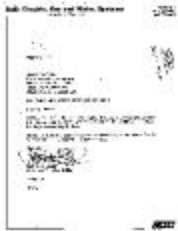
Municipal electric utilities annual report of the Bath Electric, Gas and Water Systems, 2006 (NYSA_13345-13_Bath_Electric_2006)