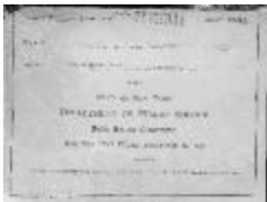
Report of the Long Island Lighting Company to the State of New York Department of Public Service Public Service Commission for the Year Ended December 31, 1932 (NYSA_13345-89_B41_F24_1932-12- 31)