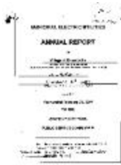
Municipal electric utilities annual report of the Village of Churchville to the Public Service Commission, 2007 (NYSA_13345-13_Village_of_Churchville_2007)