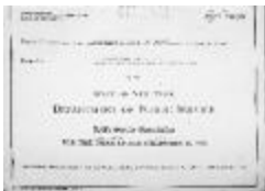
Public utilities annual report of The Astoria Light, Heat and Power Company, 1936 (NYSA_13345-81_B029_F01_Astoria_Light_Heat_Power_Company_1936)