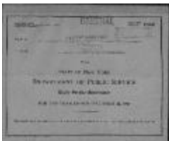
Public utilities annual report of Kings County Lighting Company, 1946 (NYSA_13345- 81_B232_F05_Kings_County_Lighting_Company_1946)