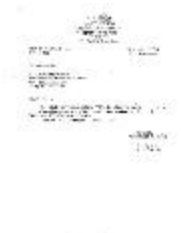
Municipal electric utilities annual report of the Village of Castile to the Public Service Commission, 2006 (NYSA_13345-13_Village_of_Castile_2006)