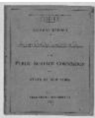
Public utilities annual report of Kings County Lighting Company, 1923 (NYSA_13345-81_B230_F06_Kings_County_Lighting_Company_1923)