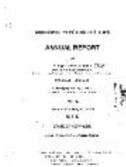
Municipal electric utilities annual report of the Village of Philadelphia to the Public Service Commission, 2006 (NYSA_13345-13_Village_of_Philadelphia_2006)