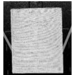
Public utilities annual report of Kings County Lighting Company, 1933 (NYSA_13345- 81_B230_F16_Kings_County_Lighting_Company_1933)