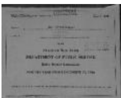
Public utilities annual report of Kings County Lighting Company, 1948 (NYSA_13345- 81_B232_F07_Kings_County_Lighting_Company_1948)