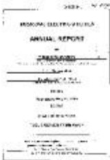
Municipal electric utilities annual report of the Village of Skaneateles to the Public Service Commission, 2005 (NYSA_13345-13_Village_of_Skaneateles_2005)