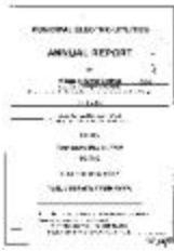
Municipal electric utilities annual report of the Village of Silver Springs to the Public Service Commission, 2006 (NYSA_13345-13_Village_of_Silver_Springs_2006)