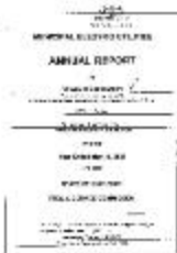
Municipal electric utilities annual report of the Village of Spencerport to the Public Service Commission, 2005 (NYSA_13345-13_Village_of_Spencerport_2005)