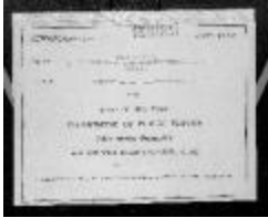
Public utilities annual report of Kings County Lighting Company, 1932 (NYSA_13345- 81_B230_F15_Kings_County_Lighting_Company_1932)