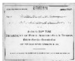
Public utilities annual report of Brooklyn Borough Gas Company, 1930 (NYSA_13345- 81_B049_F09_Brooklyn_Borough_Gas_Company_1930)