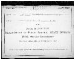
Public utilities annual report of The Astoria Light, Heat and Power Company, 1929 (NYSA_13345-81_B029_F08_Astoria_Light_Heat_Power_Company_1929)