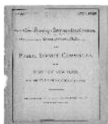
Public utilities annual report of Brooklyn Borough Gas Company, 1925 (NYSA_13345- 81_B049_F04_Brooklyn_Borough_Gas_Company_1925)