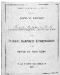
Public utilities annual report of The Astoria Light, Heat and Power Company, 1922 (NYSA_13345-81_B030_F06_Astoria_Light_Heat_Power_Company_1922)