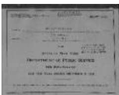
Public utilities annual report of Kings County Lighting Company, 1949 (NYSA_13345- 81_B232_F08_Kings_County_Lighting_Company_1949)