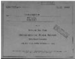
Public utilities annual report of Kings County Lighting Company, 1953 (NYSA_13345-81_B232_F12_Kings_County_Lighting_Company_1953)