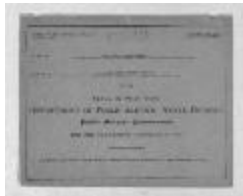
Public utilities annual report of Kings County Lighting Company, 1928 (NYS 13345- 81_B230_F11_Kings_County_Lighting_Company_1928)