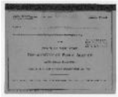
Public utilities annual report of Brooklyn Borough Gas Company, 1944 (NYSA_13345-81_B050_F08_Brooklyn_Borough_Gas_Company_1944)