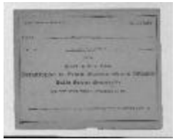
Public utilities annual report of Kings County Lighting Company, 1927 (NYS 13345- 81_B230_F10_Kings_County_Lighting_Company_1927)