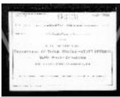
Public utilities annual report of New Amsterdam Gas Company, 1930 (NYSA_13345-81_B287_F04_New_Amsterdam_Gas_Company_1930)