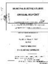
Municipal electric utilities annual report of the City of Salamanca Board of Public Utilities to the Public Service Commission, 2006 (NYSA_13345-13_City_of_Salamanca_Board_of_Public_Uilities_2006)