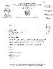
Municipal electric utilities annual report of the Village of Sherburne to the Public Service Commission, 2008 (NYSA_13345-15_Village_of_Sherburne_Electric_Department_2008)