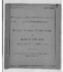
Public utilities annual report of Kings County Lighting Company, 1925 (NYS 13345- 81_B230_F08_Kings_County_Lighting_Company_1925)