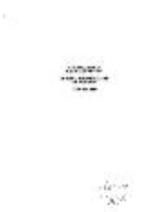
Municipal electric utilities annual report of the City of Salamanca Board of Public Utilities to the Public Service Commission, 2005 (NYSA_13345-13_City_of_Salamanca_Board_of_Public_Uilities_2005)