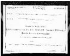
Public utilities annual report of Central Union Gas Company, 1931 (NYSA_13345-81_B082_F10_Central_Union_Gas_Company_1931)