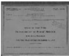
Public utilities annual report of Kings County Lighting Company, 1945 (NYSA_13345- 81_B232_F04_Kings_County_Lighting_Company_1945)