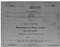
Public utilities annual report of Kings County Lighting Company, 1954 (NYSA_13345-81_B233_F01_Kings_County_Lighting_Company_1954)