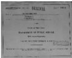
Public utilities annual report of Kings County Lighting Company, 1955 (NYSA_13345-81_B233_F02_Kings_County_Lighting_Company_1955)