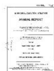
Municipal electric utilities annual report of the Village of Richmondville to the Public Service Commission, 2005 (NYSA_13345-13_Village_of_Richmondville_2005)