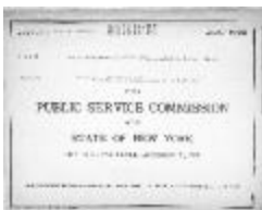
Public utilities annual report of The Astoria Light, Heat and Power Company, 1926 (NYSA_13345-81_B030_F02_Astoria_Light_Heat_Power_Company_1926)