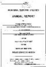
Municipal electric utilities annual report of the Village of Skaneateles to the Public Service Commission, 2007 (NYSA_13345-13_Village_of_Skaneateles_2007)