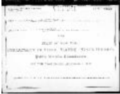
Public utilities annual report of The Astoria Light, Heat and Power Company, 1930 (NYSA_13345-81_B029_F07_Astoria_Light_Heat_Power_Company_1930)