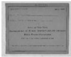
Public utilities annual report of Kings County Lighting Company, 1929 (NYS 13345- 81_B230_F12_Kings_County_Lighting_Company_1929)