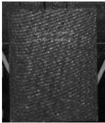
Public utilities annual report of Kings County Lighting Company, 1934 (NYSA_13345- 81_B231_F01_Kings_County_Lighting_Company_1934)