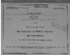
Public utilities annual report of Kings County Lighting Company, 1952 (NYSA_13345-81_B232_F11_Kings_County_Lighting_Company_1952)