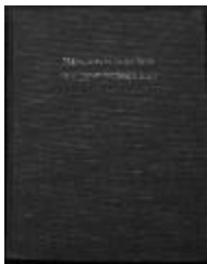
Public utilities annual report of Kings County Lighting Company, 1936 (NYSA_13345- 81_B231_F03_Kings_County_Lighting_Company_1936)