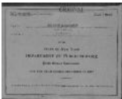
Public utilities annual report of Kings County Lighting Company, 1947 (NYSA_13345- 81_B232_F06_Kings_County_Lighting_Company_1947)