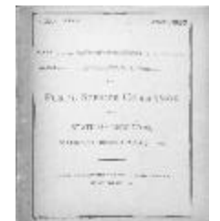
Public utilities annual report of The Astoria Light, Heat and Power Company, 1925 (NYSA_13345-81_B030_F03_Astoria_Light_Heat_Power_Company_1925)