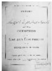
Report of the Suffolk Light, Heat and Power Company to the Commission of Gas and Electricity of the State of New York, 1906 (NYSA_13345-81_B466_F01_1906-09-10)