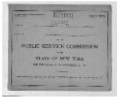
Public utilities annual report of Kings County Lighting Company, 1926 (NYS 13345- 81_B230_F09_Kings_County_Lighting_Company_1926)