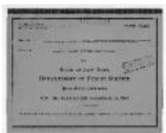
Public utilities annual report of Brooklyn Borough Gas Company, 1943 (NYSA_13345- 81_B050_F07_Brooklyn_Borough_Gas_Company_1943)