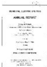
Municipal electric utilities annual report of the Village of Theresa to the Public Service Commission, 2008 (NYSA_13345-15_Village_of_Theresa_2008)