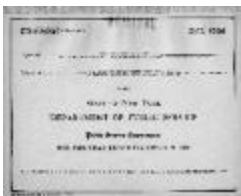
Public utilities annual report of Brooklyn Borough Gas Company, 1936 (NYSA_13345- 81_B049_F15_Brooklyn_Borough_Gas_Company_1936)