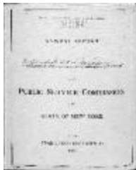
Public utilities annual report of The Astoria Light, Heat and Power Company, 1923 (NYSA_13345-81_B030_F05_Astoria_Light_Heat_Power_Company_1923)