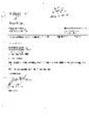
Municipal electric utilities annual report of the Village of Frankfort to the Public Service Commission, 2007 (NYSA_13345-13_Village_of_Frankfort_2007)