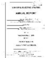
Municipal electric utilities annual report of the Village of Westfield to the Public Service Commission, 2008 (NYSA_13345-15_Village_of_Westfield_2008)