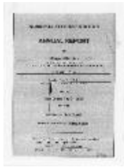
Municipal electric utilities annual report of the Village of Brocton to the Public Service Commission, 2006 (NYSA_13345-13_Village_of_Brocton_2006)