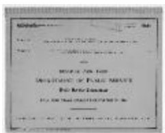
Public utilities annual report of Brooklyn Borough Gas Company, 1941 (NYSA_13345- 81_B050_F05_Brooklyn_Borough_Gas_Company_1941)