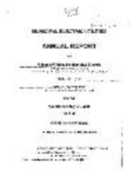
Municipal electric utilities annual report of the Village of Wellsville to the Public Service Commission, 2008 (NYSA_13345-15_Village_of_Wellsville_2008)