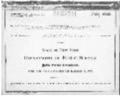
Public utilities annual report of New Amsterdam Gas Company, 1935 (NYSA_13345-81_B287_F09_New_Amsterdam_Gas_Company_1935)