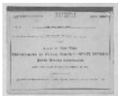
Public utilities annual report of Kings County Lighting Company, 1930 (NYS 13345- 81_B230_F13_Kings_County_Lighting_Company_1930)