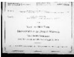
Public utilities annual report of The Astoria Light, Heat and Power Company, 1934 (NYSA_13345-81_B029_F03_Astoria_Light_Heat_Power_Company_1934)