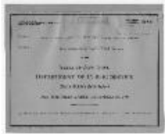
Public utilities annual report of Brooklyn Borough Gas Company, 1946