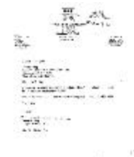
Municipal electric utilities annual report of the Village of Hamilton to the Public Service Commission, 2005 (NYSA_13345-13_Village_of_Hamilton_2005)