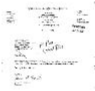
Municipal electric utilities annual report of the Village of Rouses Point to the Public Service Commission, 2005 (NYSA_13345-13_Village_of_Rouses_Point_2005)