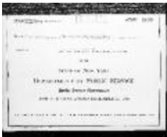
Public utilities annual report of The Astoria Light, Heat and Power Company, 1935 (NYSA_13345-81_B029_F02_Astoria_Light_Heat_Power_Company_1935)