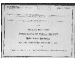
Public utilities annual report of New Amsterdam Gas Company, 1933 (NYSA_13345-81_B287_F07_New_Amsterdam_Gas_Company_1933)