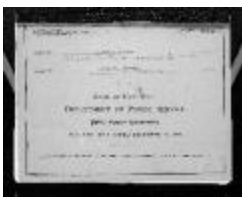
Public utilities annual report of New Amsterdam Gas Company, 1932 (NYSA_13345-81_B287_F06_New_Amsterdam_Gas_Company_1932)