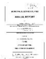
Municipal electric utilities annual report of the Village of Castile to the Public Service Commission, 2007 (NYSA_13345-13_Village_of_Castile_2007)