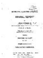
Municipal electric utilities annual report of the Village of Philadelphia to the Public Service Commission, 2007 (NYSA_13345-13_Village_of_Philadelphia_2007)