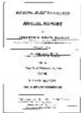
Municipal electric utilities annual report of the Village of Sherburne to the Public Service Commission, 2005 (NYSA_13345-13_Village_of_Sherburne_2005)