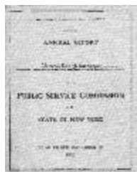
Public utilities annual report of Brooklyn Borough Gas Company, 1922 (NYSA_13345-81_B049_F01_Brooklyn_Borough_Gas_Company_1922)