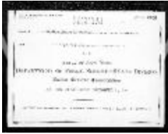
Public utilities annual report of The Astoria Light, Heat and Power Company, 1931 (NYSA_13345-81_B029_F06_Astoria_Light_Heat_Power_Company_1931)