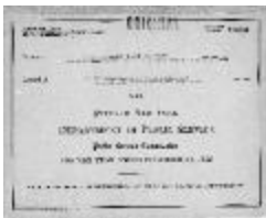
Public utilities annual report of Brooklyn Borough Gas Company, 1934 (NYSA_13345- 81_B049_F13_Brooklyn_Borough_Gas_Company_1934)