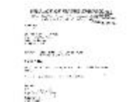
Municipal electric utilities annual report of the Village of Silver Springs to the Public Service Commission, 2005 (NYSA_13345-13_Village_of_Silver_Springs_2005)