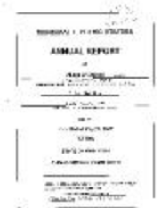
Municipal electric utilities annual report of the Village of Brocton to the Public Service Commission, 2007 (NYSA_13345-13_Village_of_Brocton_2007)