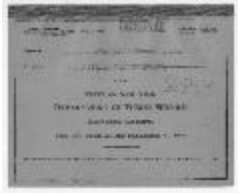
Public utilities annual report of Brooklyn Borough Gas Company, 1945 (NYSA_13345-81_B050_F09_Brooklyn_Borough_Gas_Company_1945)