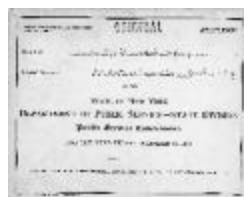
Public utilities annual report of Brooklyn Borough Gas Company, 1931 (NYSA_13345- 81_B049_F10_Brooklyn_Borough_Gas_Company_1931)