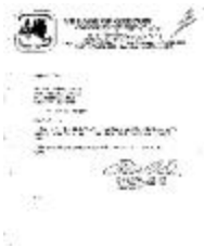
Municipal electric utilities annual report of the Village of Groton to the Public Service Commission, 2005 (NYSA_13345-13_Village_of_Groton_2005)