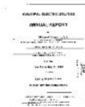
Municipal electric utilities annual report of the Village of Groton to the Public Service Commission, 2006 (NYSA_13345-13_Village_of_Groton_2006)