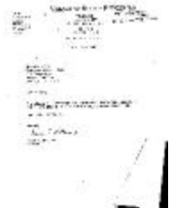
Municipal electric utilities annual report of the Village of Rouses Point to the Public Service Commission, 2006 (NYSA_13345-13_Village_of_Rouses_Point_2006)