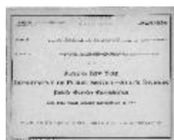
Public utilities annual report of Brooklyn Borough Gas Company, 1928 (NYSA_13345- 81_B049_F07_Brooklyn_Borough_Gas_Company_1928)