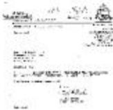
Municipal electric utilities annual report of the Village of Skaneateles to the Public Service Commission, 2008 (NYSA_13345-15_Village_of_Skaneateles_2008)