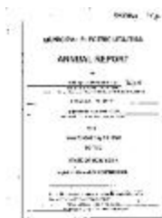
Municipal electric utilities annual report of the Village of Philadelphia to the Public Service Commission, 2005 (NYSA_13345-13_Village_of_Philadelphia_2005)