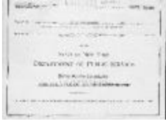
Public utilities annual report of New Amsterdam Gas Company, 1936 (NYSA_13345-81_B287_F10_New_Amsterdam_Gas_Company_1936)