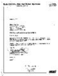
Municipal electric utilities annual report of the Bath Electric, Gas and Water Systems to the Public Service Commission, 2005 (NYSA_13345-13_Bath_Electric_2005)