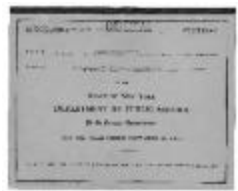
Public utilities annual report of Brooklyn Borough Gas Company, 1947