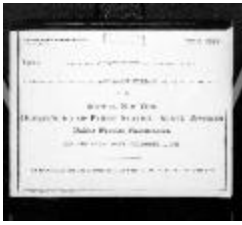
Public utilities annual report of New Amsterdam Gas Company, 1927 (NYSA_13345-81_B287_F01_New_Amsterdam_Gas_Company_1927)