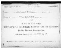
Public utilities annual report of The Astoria Light, Heat and Power Company, 1927 (NYSA_13345-81_B030_F01_Astoria_Light_Heat_Power_Company_1927)