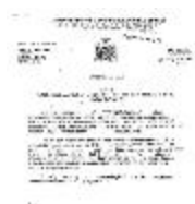
Municipal electric utilities annual report of the Village of Richmondville to the Public Service Commission, 2007 (NYSA_13345-13_Village_of_Richmondville_2007)