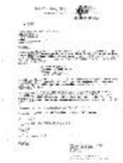
Municipal electric utilities annual report of the Village of Frankfort to the Public Service Commission, 2005 (NYSA_13345-13_Village_of_Frankfort_2005)