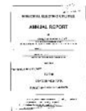
Municipal electric utilities annual report of the Village of Hamilton to the Public Service Commission, 2007 (NYSA_13345-13_Village_of_Hamilton_2007)