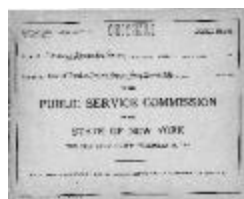
Public utilities annual report of Brooklyn Borough Gas Company, 1926 (NYSA_13345- 81_B049_F05_Brooklyn_Borough_Gas_Company_1926)