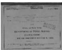
Public utilities annual report of Kings County Lighting Company, 1950 (NYSA_13345- 81_B232_F09_Kings_County_Lighting_Company_1950)