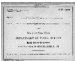
Public utilities annual report of Brooklyn Borough Gas Company, 1935 (NYSA_13345- 81_B049_F14_Brooklyn_Borough_Gas_Company_1935)