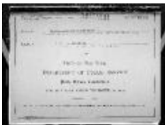
Public utilities annual report of The Astoria Light, Heat and Power Company, 1932 (NYSA_13345-81_B029_F05_Astoria_Light_Heat_Power_Company_1932)