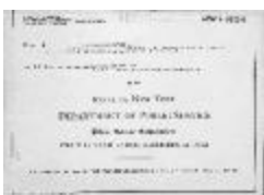
Public utilities annual report of New Amsterdam Gas Company, 1934 (NYSA_13345-81_B287_F08_New_Amsterdam_Gas_Company_1934)