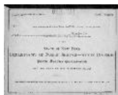
Public utilities annual report of Brooklyn Borough Gas Company, 1929 (NYSA_13345- 81_B049_F08_Brooklyn_Borough_Gas_Company_1929)