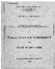
Public utilities annual report of Brooklyn Borough Gas Company, 1923 (NYSA_13345-81_B049_F02_Brooklyn_Borough_Gas_Company_1923)