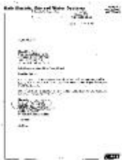
Municipal electric utilities annual report of the Bath Electric, Gas and Water Systems to the Public Service Commission, 2006 (NYSA_13345-13_Bath_Electric_2006_part2)