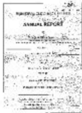
Municipal electric utilities annual report of the Village of Silver Springs to the Public Service Commission, 2008 (NYSA_13345-15_Village_of_Silver_Springs_2008)