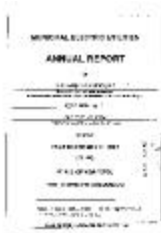
Municipal electric utilities annual report of the Village of Endicott to the Public Service Commission, 2007 (NYSA_13345-13_Village_of_Endicott_2007)