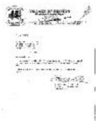
Municipal electric utilities annual report of the Village of Groton to the Public Service Commission, 2007 (NYSA_13345-13_Village_of_Groton_2007)