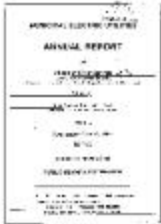
Municipal electric utilities annual report of the Village of Silver Springs to the Public Service Commission, 2007 (NYSA_13345-13_Village_of_Silver_Springs_2007)