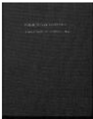
Public utilities annual report of Kings County Lighting Company, 1935 (NYSA_13345- 81_B231_F02_Kings_County_Lighting_Company_1935)