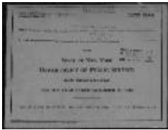
Public utilities annual report of Kings County Lighting Company, 1943 (NYSA_13345- 81_B232_F02_Kings_County_Lighting_Company_1943)