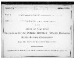
Public utilities annual report of The Astoria Light, Heat and Power Company, 1928 (NYSA_13345-81_B029_F09_Astoria_Light_Heat_Power_Company_1928)