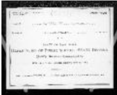
Public utilities annual report of New Amsterdam Gas Company, 1928 (NYSA_13345-81_B287_F02_New_Amsterdam_Gas_Company_1928)