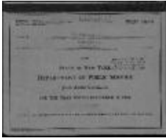
Public utilities annual report of Kings County Lighting Company, 1944 (NYSA_13345- 81_B232_F03_Kings_County_Lighting_Company_1944)