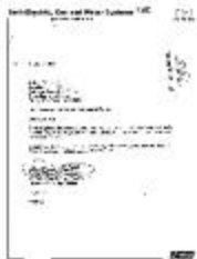
Municipal electric utilities annual report of the Bath Electric, Gas and Water Systems to the Public Service Commission, 2007 (NYSA_13345-13_Bath_Electric_2007)