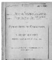
Public utilities annual report of Brooklyn Borough Gas Company, 1924 (NYSA_13345-81_B049_F03_Brooklyn_Borough_Gas_Company_1924)