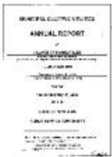
Municipal electric utilities annual report of the Village of Skaneateles to the Public Service Commission, 2006 (NYSA_13345-13_Village_of_Skaneateles_2006)