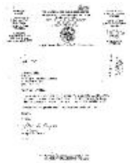
Municipal electric utilities annual report of the Village of Sherburne to the Public Service Commission, 2007 (NYSA_13345-13_Village_of_Sherburne_2007)