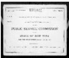
Public utilities annual report of New Amsterdam Gas Company, 1926 (NYSA_13345-81_B286_F20_New_Amsterdam_Gas_Company_1926)