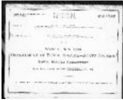
Public utilities annual report of Kings County Lighting Company, 1931 (NYSA_13345- 81_B230_F14_Kings_County_Lighting_Company_1931)