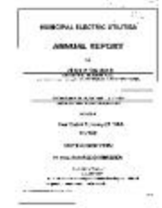
Municipal electric utilities annual report of the Village of Churchville to the Public Service Commission, 2005 (NYSA_13345-13_Village_of_Churchville_2005)