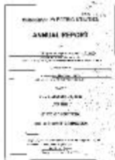
Municipal electric utilities annual report of the Village of Spencerport to the Public Service Commission, 2008 (NYSA_13345-15_Village_of_Spencerport_2008)