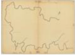
Delaware river, copied from a map by Metcalfe. Map #725 (NYS_A0273-78_725)