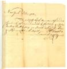
Certificate affirming James Ross's military service, 1766 (NYSA_A0272-78_V21_p066b)