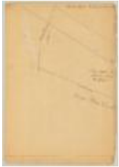
Survey of land for Sara Magin et al. (Adjoining map No. 647) Map #648A and Map #648B (NYSA_A0273-78_648)