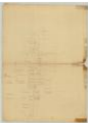
Land Patents north from the Batten kill, Washington county. Map #753 (NYSA_A0273-78_753)