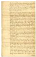
Exemplification of deed, dated 1729, to Coenradt Borghart, 1762 (NYSA_A0272-78_V16_p110c_1)