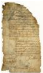
Proclamation adjourning the General Assembly to the 13th day of July (NYSA_A1894-78_V091_005)