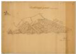
Map of Coxeborough Patent. Map #52 (NYSA_A0273-78_52)