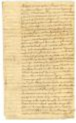
Exemplification of an Indian deed to Henry Remsen, 1764 (NYSA_A0272-78_V17_p145)