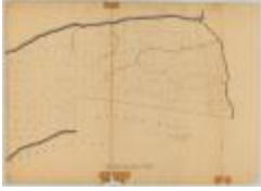
Romulus, No. 11, Seneca county. Map #841 (NYSA_A0273-78_841)