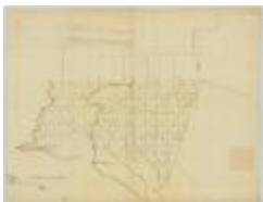
Map of subdivison of Fonda's Patent, Oneida county. Map #723 (NYSA_A0273-78_723)