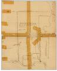
Survey of land for Donald and others; by Vrooman, 1763. Map #779 (NYS A0273-78_779)