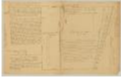
Land of Major Aug. Prevoorst and gore adjoining; 5,000 acres. Map #802 (NYSA_A0273-78_802)