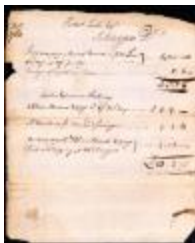
Account of the expenses in surveying a tract of land, 1763 (NYSA_A4016-77_V7_F126a)