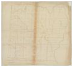
Lands near Schroon Lake; Platt's Road Patent; Hoffman, etc. Map #793 (NYSA_A0273-78_793)