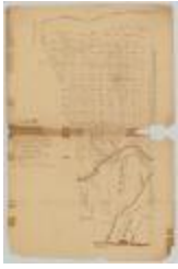
Map of Pittstown, Rensselaer county, granted to Isaac Sawyer. Map #758 (NYSA_A0273-78_758)