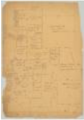
Survey of land on the east side of Lake Champlain near Six Mile Point. Map #702 (NYSA_A0273-78_702)