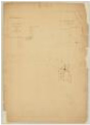
Survey of land for Philip Skenet, 3000 acres on Lake Champlain in Essex county. Map #719 (NYSA_A0273-78_719)