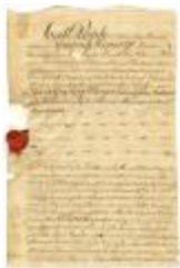
Indian deed for land on the south of the Mohawk River, 1769 (NYSA_A0272-78_V25_p057c)