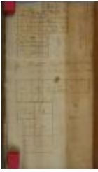
Map of Duerville Patent (NYSA_B1610-99_156)