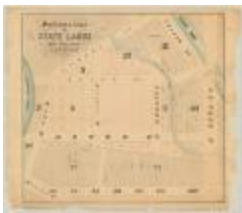
Map of Subdivisions of lands near Church Street, Syracuse. Map #458B (NYSA_A0273-78_458B)