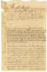
Indian deed for land near Sacandaga river, 1769 (NYSA_A0272-78_V25_p057b)