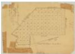
Map of Hoffman Township on Scaron lake. Essex county. Map #806 (NYSA_A0273-78_806)