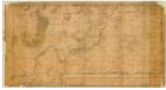
A Scheme for dividing the Artillery Patent. Map #146 (NYSA_A0273-78_146)