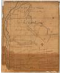
Map of lands on the east side of the Hudson River between the Deep Kill and Seachticook. Map #333 (NYSA_A0273-78_333)