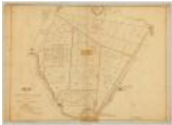
Map of Clifton Park, 1765. Map #869 (NYSA_A0273-78_869)