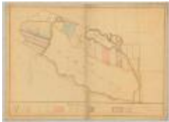
Kayaderosera Patent, 8th, 9th and 10th allotment. Part of Saratoga Patent. Map #882 (NYSA_A0273-78_882)