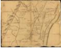
Map of Lockerman Tract in Ulster County (NYSA_B1773-01_B3_F25)