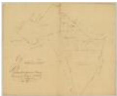
Map of DuBois's Tract from a survey by Wm. Cockburn. Map #729 (NYS_A0273-78_729)