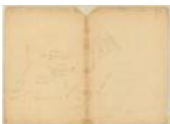
Map of Kingsborough, granted to James Stewart, 1755. Map #707 (NYSA_A0273-78_707)