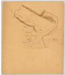
Map of Wallomsack Patent and lands adjoining, Rensselaer Co. Map #883 (NYSA_A0273-78_883)