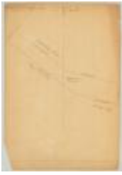
Survey of land for Coenradt and Fred'k Franck. Map #645 (NYSA_A0273-78_645)