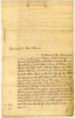
Report of the committee of council relating to Philipse Manor, 1765 (NYSA_A0272-78_V18_p142)