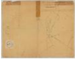
Kingsborough Patent, Lots 7, 8, 9, and 10, Fulton Co. Map #891B (NYSA_A0273-78_891B)