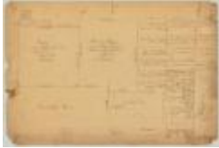
Map of Kingsbury. Also Provincial Patents and various grants adjacent thereto Washington county. Map #685 (NYSA_A0273-78_685)