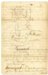
Survey for Francis Legge of land west of Lake Champlain, 1769 (NYSA_A0272-78_V25_p104b)