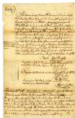
Copy of a land agreement, 1766-1767 (NYSA_A4016-77_V7_F124a)