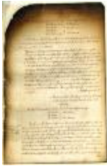
Council minutes, November 2, 1765 (NYSA_A1895-78_V026_025)