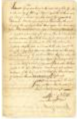
Survey for Francis Legge of land west of Lake Champlain, 1769 (NYSA_A0272-78_V25_p104a)