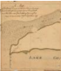
Small map attached to Map #704. 250 acres of land at Six Mile Point for Thomas Mason and Peter Carean. Map #704A (NYSA_A0273-78_704A)