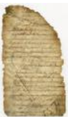
Proclamation regarding sailors (NYSA_A1894-78_V091_007)