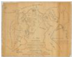
Map of Alexandria, being two tracts of land situate at the north end of Lake George. Map #96 (NYSA_A0273-78_96)