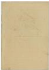
Survey of land for Jesse Woodhull, 1,500 acres in Orange county and others. Map #787 (NYS A0273-78_787)