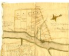
Map of a tract of land granted Francis Harrison and four others, 1767 (NYSA_A0272-78_V23_p034)