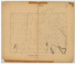
Cato, No. 3, Cayuga county. Map #833 (NYSA_A0273-78_833)