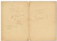
Survey of land for various persons on Poultny creek in Vermont. Map #705 (NYSA_A0273-78_705)