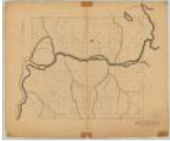
Brutus, No. 4, Cayuga county. Map #834 (NYSA_A0273-78_834)