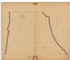
Ovid, No. 16, Seneca county. Map #846 (NYSA_A0273-78_846)