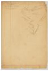
Survey of land for Philip Livingston and others. 20,000 acres. Map #655 (NYSA_A0273-78_655)