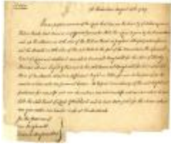
Exemplification of deed, dated 1729, to Coenradt Borghart, 1762 (NYSA_A0272-78_V16_p110a)