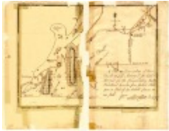
Map of two tracts of land surveyed for Robert Harpur, 1765 (NYSA_A0272-78_V18_p152)