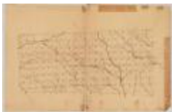
Old Military Tract, Township 6, Clinton county and Township 7, Franklin county. Map #798 (NYSA_A0273-78_798)