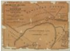
Corner Location of Benson Township, Jerseyfield Patent and Lawrence Patent. Map #512 (NYSA_A0273-78_512)