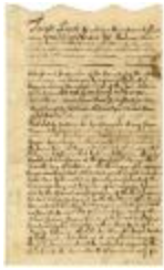
Indian deed for land near Schoharie creek, 1769 (NYSA_A0272-78_V25_p057a)