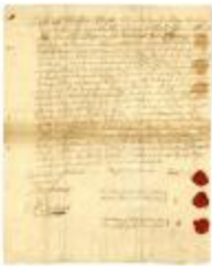
Indian deed to David Prym, 1766 (NYSA_A0272-78_V21_p165_s1)