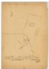
Survey of land for Henry (Lord) Holland, Holland Patent and Hezekiah Summers. Map #650 (NYSA_A0273-78_650)