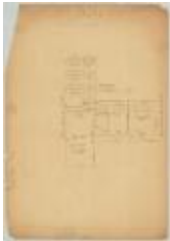
Survey of land for various persons, said to be in Vermont. Map #710 (NYSA_A0273-78_710)