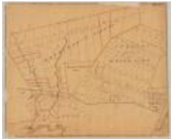
Map of Wallomsack Patent; also Snyders Patent called Mapletown. Map #884 (NYSA_A0273-78_884)