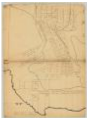
Survey of land near Platt Rogers and others, on Lake Champlain. Map #794 (NYSA_A0273-78_794)