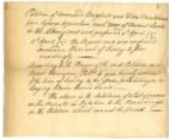
Copy of petition of Coenraat Borghardt and Elias Van Schaack, to purchase land, 1762 (NYSA_A0272-78_V16_p110b)