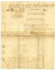
Certification of Indian deed to David Prym, 1766 (NYSA_A0272-78_V21_p165_s2)