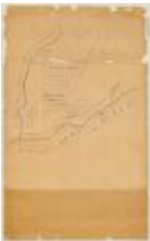
Map of Morris Patent, between the Susquehanna and Unadilla. Map #33 (NYSA_A0273-78_33)