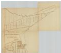
Lands of Philip Schuyler, with others adjoining. Map #811 (NYSA_A0273-78_811)