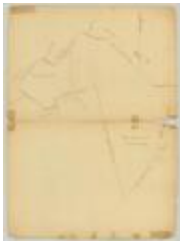
Land of Ph. Livingston, 7,000 acres. Also the Dubois tract. Map #730 (NYS_A0273-78_730)