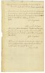
Receipts from George Croghan for land purchased by John Bradstreet, 1769 (NYSA_A0272-78_V40_p125e)