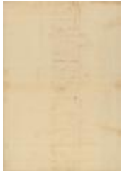
Map of Lynottville, between Goldsboro and Franklin townships. Map #773 (NYS A0273-78_773)