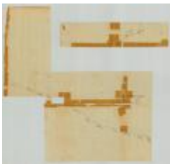
Map of road from Fort George to the river Chazy. Map #777B (NYS A0273-78_777B)