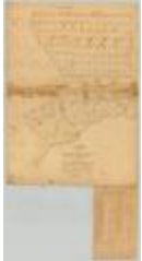
Rudolph Staley's tract, 34,000 acres, also Conradt Frank's tract, 3000 acres at Burnet Field. Map #873 (NYSA_A0273-78_873)