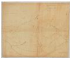
Map of Stone Arabia Patent, Alexander's Patent, Depeyster's and Van Slyck's patent. Map #879 (NYSA_A0273-78_879)