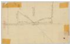
Peter Hasenclever's 1,000 acres in the Highlands. 1767. Map #785 (NYS A0273-78_785)