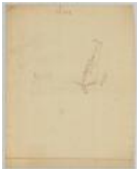
Survey of land for Samuel Adams on Lake George. 300 acres. Map #714 (NYSA_A0273-78_714)