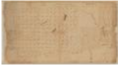
Map of Canadian Refugee Lands in Clinton county and Township of Mooers on Lake Champlain. Map #789 (NYSA_A0273-78_789)