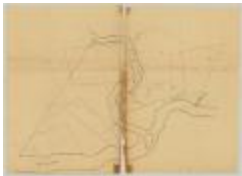
Maps of Corporation Lands at Fort Hunter, Montgomery county. Map #828 (NYS_A0273-78_828)