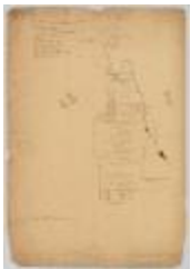
Survey of land for various persons on west side of Lake Champlain. Map #699 (NYSA_A0273-78_699)