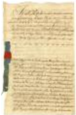
Indian deed for land at the mouth of Adiga creek, 1769 (NYSA_A0272-78_V25_p057d)