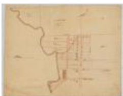
Map of the village of Johnstown, Fulton county. Map #880 (NYSA_A0273-78_880)