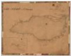
Map of Lake Ontario or Cataraqui, ca. 1800 (NYSA_A0273-78_896)