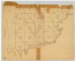
Hasenclever's Patent on Canada creek, Herkimer county, adjoins Cosby's Manor. Map #784 (NYS A0273-78_784)