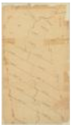
Map of part of the Hoosick Patent, Rensselaer county; by Beeker. Map #750 (NYSA_A0273-78_750)