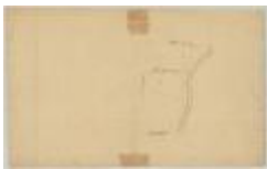
Survey of land for John Garnsey; 1000 acres. Map #765 (NYSA_A0273-78_765)