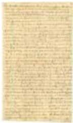
Copy of an Indian deed of land on the north of the Mohawk river, 1769 (NYSA_A0272-78_V25_p128)