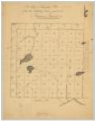
Old Military Tract, Township 3, Clinton county; granted to Benj. Birdsall. Map #799 (NYSA_A0273-78_799)