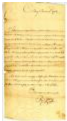
Correspondence from Robert Yates regarding a tract of land, 1763 (NYSA_A4016-77_V7_F126b)