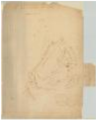
Survey of land for Arent Bradt ; 2,000 acres, and Walter Franklin; 9,000 acres on the Susquehanna. Map #683 (NYSA_A0273-78_683)