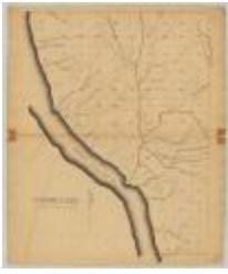
Milton, No. 17, Tompkins and Cayuga counties. Map #847 (NYSA_A0273-78_847)