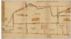
Coxe's Patent, also Hamden Tract, on Susquehanna river. Map #820 (NYS_A0273-78_820)