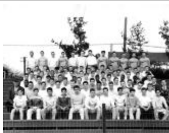
Hempstead High School track team (NYSA_B0496-05_Decision_5407_Photo_04)