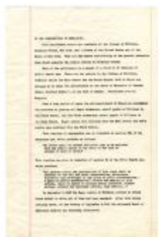
Petition submitted by residents of the village of Hillburn to the New York State Education Commissioner (NYSA_B0496-