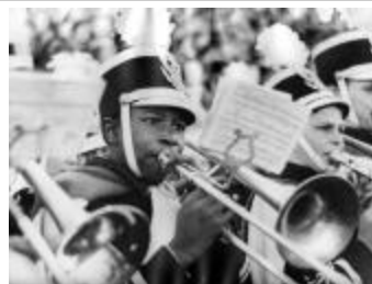
Hempstead High School band (NYSA_B0496-05_Decision_5407_Photo_12)