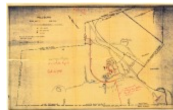
Map showing locations of residences of white and "negro" pupils in Hillburn, NY (NYSA_B0496-05_04915_Hillburn_map)