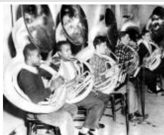
Hempstead High School band (NYSA_B0496-05_Decision_5407_Photo_08)