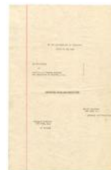
Memorandum Brief for Petitioners: "In the Matter of Petition of Certain Parents and Taxpayers of Hillburn, N.Y." (NYSA_B0496-