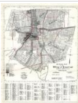
Elementary school zone map for the village of Hempstead (NYSA_B0496-05_Decision_5407_Hempstead_map)