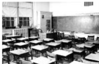
Classroom at Prospect School in Hempstead (NYSA_B0496-05_Decision_5407_Photo_02)