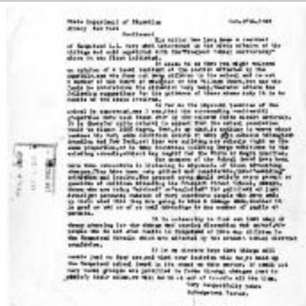
Letter to the Education Department regarding the Prospect School boundary appeal (NYSA_B0496-05_Decision_5407-01)