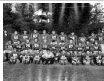
Hempstead High School varsity football team (NYSA_B0496-05_Decision_5407_Photo_07)