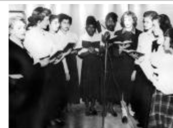
Hempstead High School choral reading group (NYSA_B0496-05_Decision_5407_Photo_05)