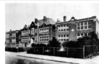
Prospect School in Hempstead (NYSA_B0496-05_Decision_5407_Photo_01)