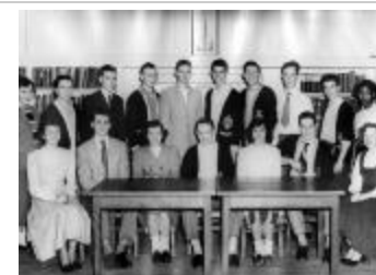
Hempstead High School student council (NYSA_B0496-05_Decision_5407_Photo_09)