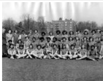
Hempstead High School girls softball team (NYSA_B0496-05_Decision_5407_Photo_11)