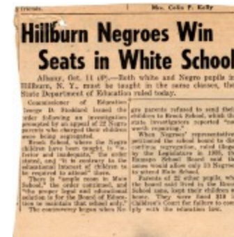
Newspaper clipping, "Hillburn Negroes Win Seats in White School" (NYSA_B0496-05_04915_clipping_1943-10-11)