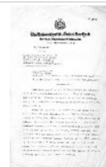
In the matter of the appeal from the action of the Board of Education of School District No. 1, Village of Hempstead (NYSA_B0496-