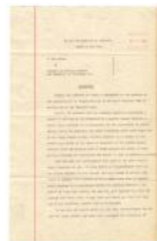
Memorandum: "In the Matter of Petition of Certain Parents and Taxpayers of Hillburn, N.Y." (NYSA_B0496-