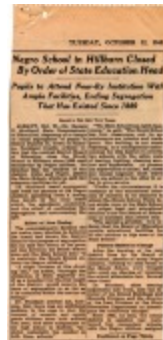
Newspaper clipping, "Negro School in Hillburn Closed by Order of State Education Head" (NYSA_B0496-