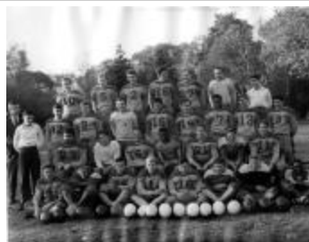
Hempstead High School freshman football team (NYSA_B0496-05_Decision_5407_Photo_06)