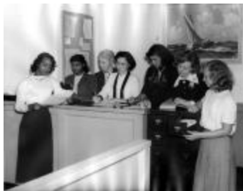
Hempstead High School junior secretary club (NYSA_B0496-05_Decision_5407_Photo_10)