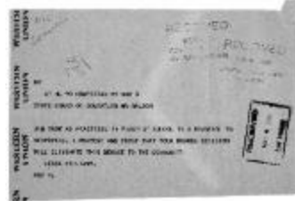
Telegram to Associate Education Commissioner regarding the Prospect School boundary appeal (NYSA_B0496-05_Decision_5407_p121)