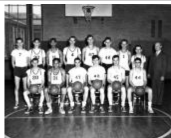
Hempstead High School varsity basketball team (NYSA_B0496-05_Decision_5407_Photo_03)