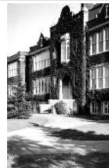
Prospect School in Hempstead (NYSA_B0496-05_Decision_5407_Photo_13)