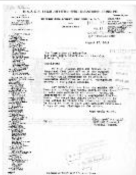
Letter from Thurgood Marshall to the Education Department regarding the investigation into Hempstead's public