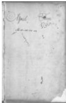
Engrailed minutes of the Supreme Court of Judicature, April 1790 (NYSA_JN531-17_R007_1790-04-20_1790-04-24)