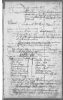
Engrailed minutes of the Supreme Court of Judicature, July - August 1788 (NYSA_JN531-17_R007_1788-07-29_1788-08-09)