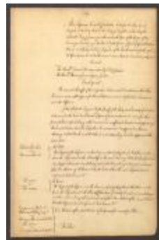
Minutes of the Supreme Court of Judicature of the State of New York, January 1776 (NYSA_JN531-17_V14_03_p059-078)