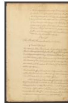
Minutes of the Supreme Court of Judicature of the State of New York, April 1776. Pages 100-106 are blank. (NYSA_JN531-