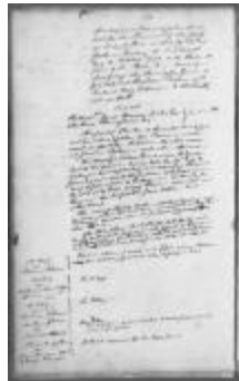
Rough minutes of the Supreme Court of Judicature, October 1773 - July 1774 (NYSA_JN531-17_R005_1773-10-19_1774-