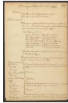
Minutes of the Supreme Court of Judicature of the State of New York, November 1779 (NYSA_JN531-17_V14_12_p245-267)