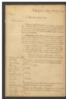
Minutes of the Supreme Court of Judicature of the State of New York, April 1783 (NYSA_JN531-17_V15_16_p379-395)