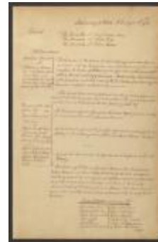
Minutes of the Supreme Court of Judicature of the State of New York, August 1781 (NYSA_JN531-17_V15_02_p0029-046)