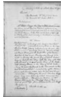
Engrailed minutes of the Supreme Court of Judicature, April - May 1790 (NYSA_JN531-17_R007_1790-04-26_1790-05-03)