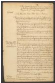
Minutes of the Supreme Court of Judicature of the State of New York, October 1780 (NYSA_JN531-17_V14_18_p401-445)