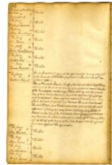
Minutes of the Supreme Court of Judicature, April 29, 1780 - supplementary indictments (NYSA_JN531-17_V14_p434-438)