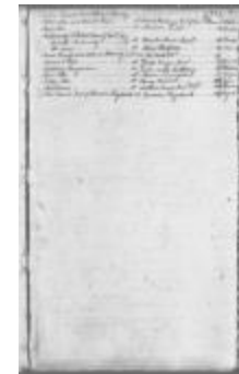
Index to Engrailed minutes of the Supreme Court of Judicature, April 1790 (NYSA_JN531-17_R007_1790-04-20_1790-04-24)