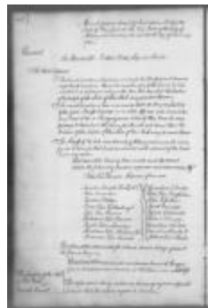
Engrossed minutes of the Supreme Court of Judicature, January 1781 (NYSA_JN531-17_R005_1781-01-16_1781-01-20)