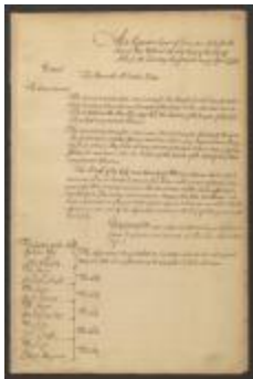
Minutes of the Supreme Court of Judicature of the State of New York, April 1783 (NYSA_JN531-17_V15_15_p359-378)