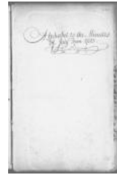
Index to Engrossed minutes of the Supreme Court of Judicature, July 1785 (NYSA_JN531-17_R006_1785-