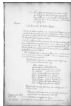
Engrossed minutes of the Supreme Court of Judicature, July - October 1782 (NYSA_JN531-17_R005_1782-07-30_1782-10-20)