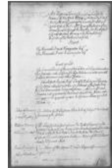
Rough minutes of the Supreme Court of Judicature, April - August 1772 (NYSA_JN531-17_R005_1772-04-21_1772-