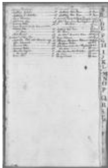
Index to Engrailed minutes of the Supreme Court of Judicature, January 1790 (NYSA_JN531-17_R007_1790-01-19_1790-01-23)