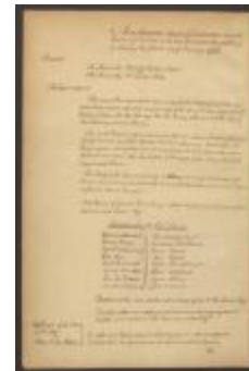
Minutes of the Supreme Court of Judicature of the State of New York, January 1782 (NYSA_JN531-17_V15_05_p084-097)