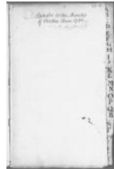
Index to Engrossed minutes of the Supreme Court of Judicature, October 1786 (NYSA_JN531-17_R006_1786-