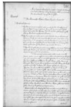
Engrossed minutes of the Supreme Court of Judicature, April 1781 (NYSA_JN531-17_R005_1781-04-17_1781-04-28)