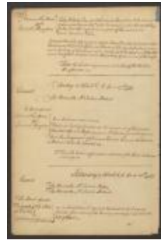
Minutes of the Supreme Court of Judicature of the State of New York, 28 April 1781 (NYSA_JN531-17_V14_23_p544-570)