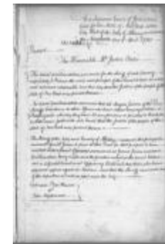
Engrossed minutes of the Supreme Court of Judicature, April 1785 (NYSA_JN531-17_R006_1785-04-19)