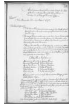
Engrossed minutes of the Supreme Court of Judicature, January - May 1779 (NYSA_JN531-17_R005_1779-01-19_1779-