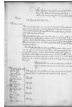
Engrossed minutes of the Supreme Court of Judicature, April - May 1783 (NYSA_JN531-17_R005_1783-04-15_1783-05-03)