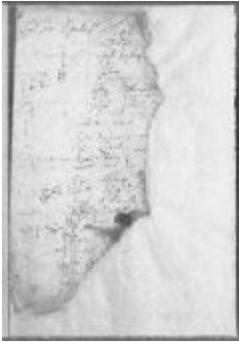
Engrossed minutes of the Supreme Court of Judicature, October 1691-October 1692 (NYSA_JN531-17_R001_1691-10-06_1692-