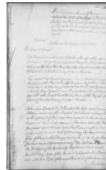
Engrailed minutes of the Supreme Court of Judicature, October 21-27, 1788 (NYSA_JN531-17_R007_1788-10-21_1788-10-27)