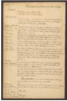
Minutes of the Supreme Court of Judicature of the State of New York, 25-27 April 1781 (NYSA_JN531-17_V14_22_p524-544)