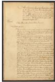
Minutes of the Supreme Court of Judicature of the State of New York, November 1779 (NYSA_JN531-17_V14_11_p225-244)