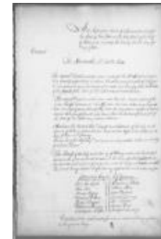
Engrossed minutes of the Supreme Court of Judicature, July - August 1783 (NYSA_JN531-17_R005_1783-07-29_1783-