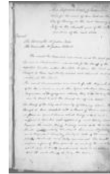
Engrossed minutes of the Supreme Court of Judicature, July 1786 (NYSA_JN531-17_R006_1786-07-25)