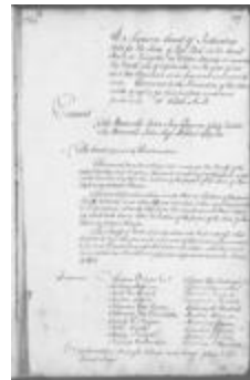
Engrossed minutes of the Supreme Court of Judicature, September 1777 - October 1778 (NYSA_JN531-17_R005_1777-09-09_1778-