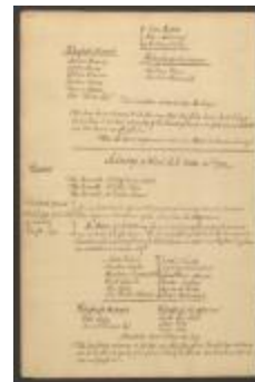
Minutes of the Supreme Court of Judicature of the State of New York, 26 October 1782 (NYSA_JN531-17_V15_13_p284-318)