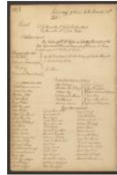
Minutes of the Supreme Court of Judicature of the State of New York, November 1779 (NYSA_JN531-17_V14_13_p268-281)