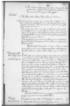
Engrossed minutes of the Supreme Court of Judicature, October 1780 (NYSA_JN531-17_R005_1780-10-17_1780-10-28)