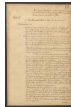
Minutes of the Supreme Court of Judicature of the State of New York, 17-24 April 1781 (NYSA_JN531-17_V14_21_p491-523)