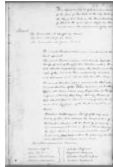
Engrossed minutes of the Supreme Court of Judicature, April - May 1786 (NYSA_JN531-17_R006_1786-04-18_1786-05-06)