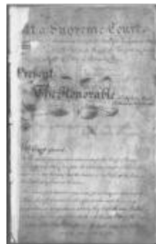
Engrailed minutes of the Supreme Court of Judicature, January 1790 (NYSA_JN531-17_R007_1790-01-19_1790-01-23)