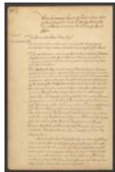
Minutes of the Supreme Court of Judicature of the State of New York, April 1780 (NYSA_JN531-17_V14_15_p302-326)