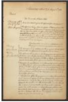
Minutes of the Supreme Court of Judicature of the State of New York, August 1783 (NYSA_JN531-17_V15_19_p443-475)