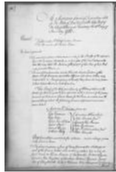
Engrossed minutes of the Supreme Court of Judicature, January 1780 (NYSA_JN531-17_R005_1780-01-18_1780-01-22)