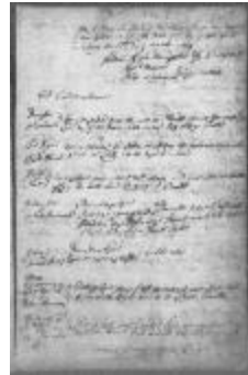
Minutes of the Supreme Court of Judicature, March 1704-September 1708 (NYSA_JN531-17_R001_1704-03-13_1708-