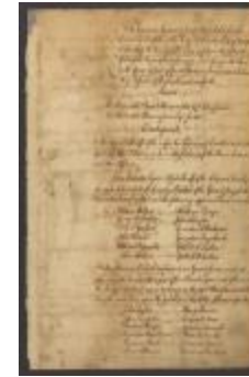
Minutes of the Supreme Court of Judicature of the State of New York, July 1775 (NYSA_JN531-17_V14_01_p001-029)