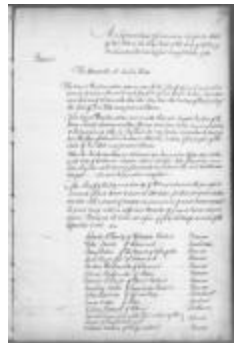
Engrossed minutes of the Supreme Court of Judicature, October - November 1783 (NYSA_JN531-17_R005_1783-10-21_1783-