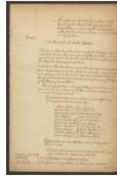
Minutes of the Supreme Court of Judicature of the State of New York, July-August 1782 (NYSA_JN531-17_V15_09_p187-205)