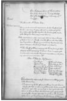
Engrossed minutes of the Supreme Court of Judicature, July - November 1779 (NYSA_JN531-17_R005_1779-07-27_1779-11-22)