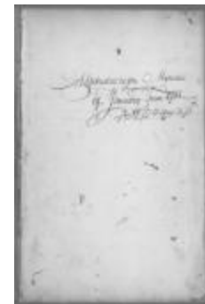
Index to Engrossed minutes of the Supreme Court of Judicature, January 1785 (NYSA_JN531-17_R006_1785-