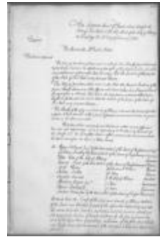
Engrossed minutes of the Supreme Court of Judicature, January 1783 (NYSA_JN531-17_R005_1783-01-21)