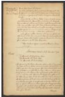
Minutes of the Supreme Court of Judicature of the State of New York, November 1783 (NYSA_JN531-17_V15_23_p536-558)