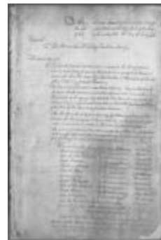
Engrossed minutes of the Supreme Court of Judicature, July - August 1781 (NYSA_JN531-17_R005_1781-07-31_1781-08-20)