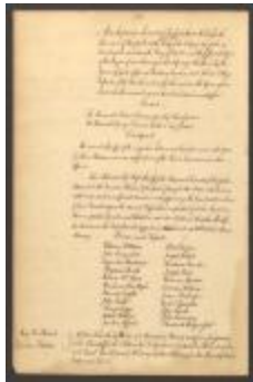
Minutes of the Supreme Court of Judicature of the State of New York, October 1775 (NYSA_JN531-17_V14_02_p030-058)