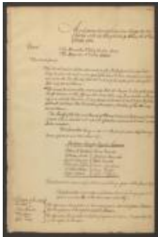
Minutes of the Supreme Court of Judicature of the State of New York, 15-18 October 1782 (NYSA_JN531-17_V15_11_p241-258)