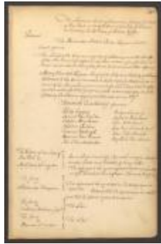
Minutes of the Supreme Court of Judicature of the State of New York, October 1778 (NYSA_JN531-17_V14_06_p123-149)