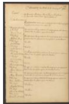
Minutes of the Supreme Court of Judicature of the State of New York, January 1781 (NYSA_JN531-17_V14_20_p457-490)