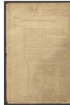
Minutes of the Supreme Court of Judicature of the State of New York, July-August 1781 (NYSA_JN531-17_V15_01_p001-028)