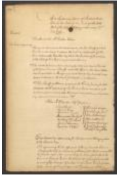
Minutes of the Supreme Court of Judicature of the State of New York, July 1779 (NYSA_JN531-17_V14_10_p208-224)