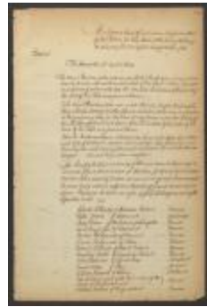
Minutes of the Supreme Court of Judicature of the State of New York, 21-22 October 1783 (NYSA_JN531-17_V15_20_p479-492)