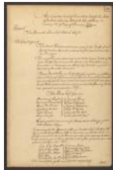
Minutes of the Supreme Court of Judicature of the State of New York, January 1779 (NYSA_JN531-17_V14_07_p150-168)