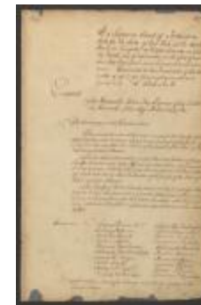
Minutes of the Supreme Court of Judicature of the State of New York, September 1777 (NYSA_JN531-17_V14_05_p107-116)