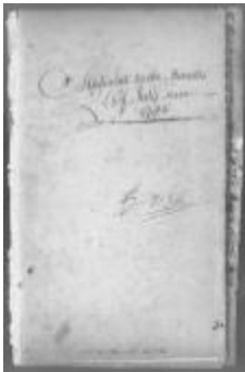
Index to Engrossed minutes of the Supreme Court of Judicature, July 1786 (NYSA_JN531-17_R006_1786-