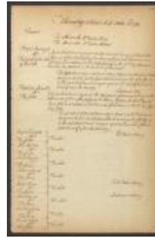
Minutes of the Supreme Court of Judicature of the State of New York, 23-24 October 1783 (NYSA_JN531-17_V15_21_p493-508)