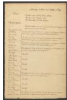
Minutes of the Supreme Court of Judicature of the State of New York, 19-25 October 1782 (NYSA_JN531-17_V15_12_p259-284)