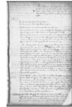
Engrossed minutes of the Supreme Court of Judicature, October 1785 (NYSA_JN531-17_R006_1785-10-18)