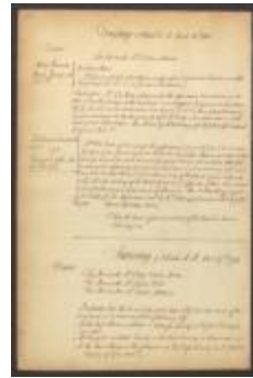
Minutes of the Supreme Court of Judicature of the State of New York, 27 April 1782 (NYSA_JN531-17_V15_08_p154-186)