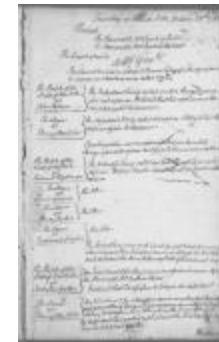
Engrailed minutes of the Supreme Court of Judicature, October 28-31, 1788 (NYSA_JN531-17_R007_1788-10-28_1788-10-31)