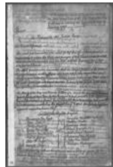
Engrossed minutes of the Supreme Court of Judicature, January 1785 (NYSA_JN531-17_R006_1785-01)