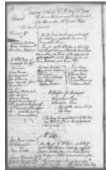
Engrailed minutes of the Supreme Court of Judicature, August 1788 (NYSA_JN531-17_R007_1788-08-05_1788-08-09)