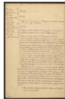
Minutes of the Supreme Court of Judicature of the State of New York, May 1783 (NYSA_JN531-17_V15_17_p396-425)