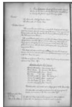
Engrossed minutes of the Supreme Court of Judicature, January 1782 (NYSA_JN531-17_R005_1782-01-15_1782-01-19)