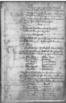
Engrossed minutes of the Supreme Court of Judicature, July - October 1775 (NYSA_JN531-17_R005_1775-07-25_1775-