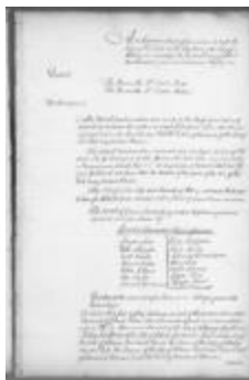
Engrossed minutes of the Supreme Court of Judicature, April 1782 (NYSA_JN531-17_R005_1782-04-16_1782-04-27)