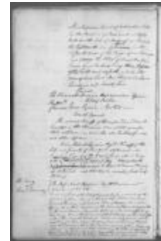
Rough minutes of Supreme Court of Judicature, April 1775 - January 1776 (NYSA_JN531-17_R005_1775-04-18_1776-