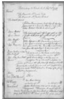
Engrailed minutes of the Supreme Court of Judicature, November 1788 (NYSA_JN531-17_R007_1788-11-01)