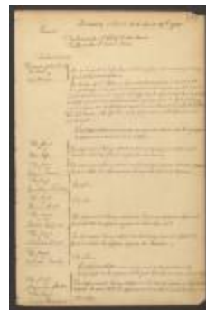
Minutes of the Supreme Court of Judicature of the State of New York, April 1780 (NYSA_JN531-17_V14_16_p327-358)