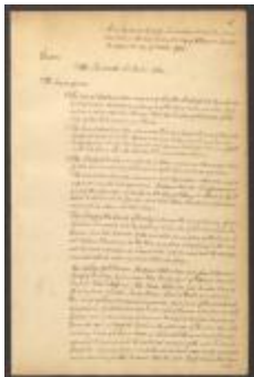
Minutes of the Supreme Court of Judicature of the State of New York, October 1781 (NYSA_JN531-17_V15_03_p047-061)