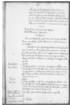
Engrossed minutes of the Supreme Court of Judicature, January - April 1776 (NYSA_JN531-17_R005_1776-01-16_1776-