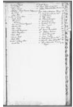
Index to Engrossed minutes of the Supreme Court of Judicature, April 1785 (NYSA_JN531-17_R006_1785-