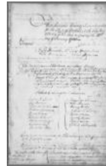
Engrossed minutes of the Supreme Court of Judicature, January 1788 (NYSA_JN531-17_R007_1788-01-15_1788-01-26)