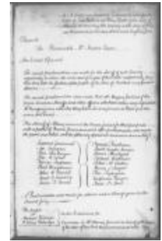
Engrossed minutes of the Supreme Court of Judicature, July 1785 (NYSA_JN531-17_R006_1785-07-26)