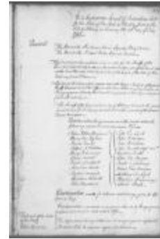
Engrossed minutes of the Supreme Court of Judicature, July 1780 (NYSA_JN531-17_R005_1780-07-25_1780-07-29)