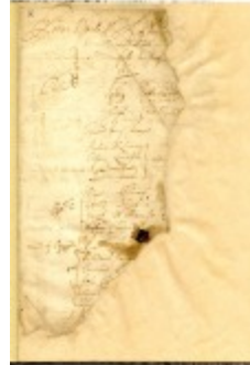
Minutes of the Supreme Court of Judicature, 1691 (NYSA_JN531-17_V01_p001)