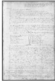
Engrossed minutes of the Supreme Court of Judicature, January 1786 (NYSA_JN531-17_R006_1786-01-17)