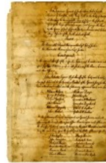
Minutes of the Supreme Court of Judicature, July 25, 1775 (NYSA_JN531-17_V14_p001)