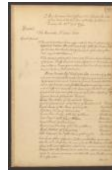
Minutes of the Supreme Court of Judicature of the State of New York, April 1779 (NYSA_JN531-17_V14_08_p169-189)