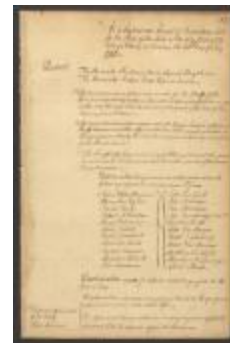
Minutes of the Supreme Court of Judicature of the State of New York, July 1780 (NYSA_JN531-17_V14_17_p359-400)