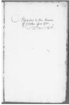
Index to Engrossed minutes of the Supreme Court of Judicature, October 1785 (NYSA_JN531-17_R006_1785-