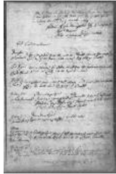
Minutes of the Supreme Court of Judicature, March 1704-October 1706 (NYSA_JN531-17_R001_1704-03-13_1706-10-12)