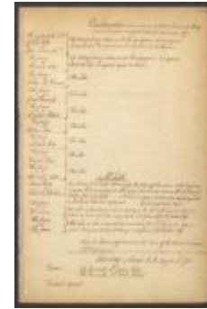
Minutes of the Supreme Court of Judicature of the State of New York, August 1782 (NYSA_JN531-17_V15_10_p205-240)