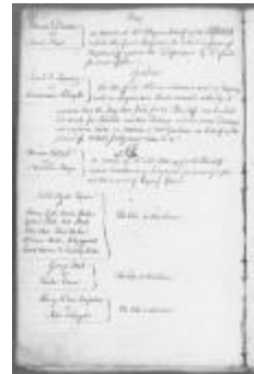
Engrossed minutes of the Supreme Court of Judicature, October 1786 (NYSA_JN531-17_R006_1786-10-28)