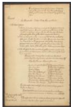
Minutes of the Supreme Court of Judicature of the State of New York, January 1781 (NYSA_JN531-17_V14_19_p446-456)