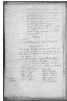
Rough minutes of the Supreme Court of Judicature, October 1774 - January 1775 (NYSA_JN531-17_R005_1774-10-18_1775-