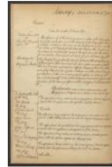
Minutes of the Supreme Court of Judicature of the State of New York, 25-31 October 1783 (NYSA_JN531-17_V15_22_p509-536)