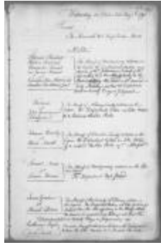
Engrossed minutes of the Supreme Court of Judicature, May 1790 (NYSA_JN531-17_R007_1790-05-05_1790-05-07)