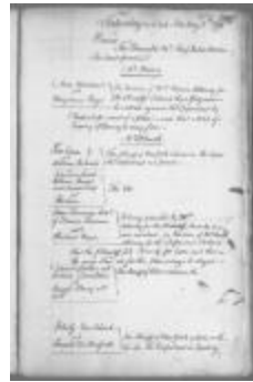
Engrossed minutes of the Supreme Court of Judicature, May 1790 (NYSA_JN531-17_R007_1790-05-08)