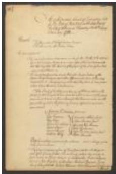
Minutes of the Supreme Court of Judicature of the State of New York, January 1780 (NYSA_JN531-17_V14_14_p282-301)