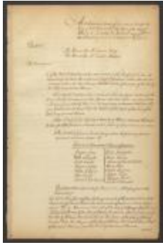
Minutes of the Supreme Court of Judicature of the State of New York, 16-26 April 1782 (NYSA_JN531-17_V15_07_p129-154)