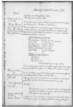
Engrossed minutes of the Supreme Court of Judicature, October 1782 (NYSA_JN531-17_R005_1782-10-19_1782-10-26)