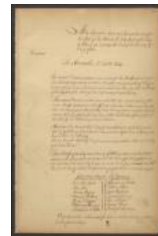
Minutes of the Supreme Court of Judicature of the State of New York, July-August 1783 (NYSA_JN531-17_V15_18_p427-442)