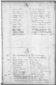
Index to Engrossed minutes of the Supreme Court of Judicature, January 1788 (NYSA_JN531-17_R007_1788-