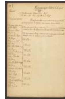
Minutes of the Supreme Court of Judicature of the State of New York, April-May 1779 (NYSA_JN531-17_V14_09_p190-207)