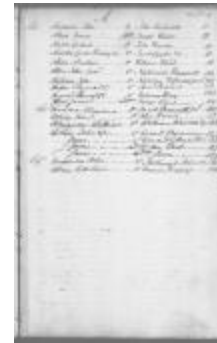
Index to Engrossed minutes of the Supreme Court of Judicature, April 1788 (NYSA_JN531-17_R007_1788-