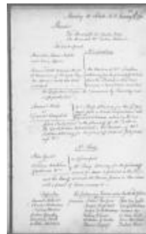
Engrailed minutes of the Supreme Court of Judicature, January 1790 (NYSA_JN531-17_R007_1790-01-25_1790-01-29)