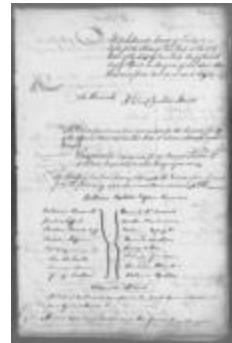
Engrossed minutes of the Supreme Court of Judicature, April 15-24, 1788 (NYSA_JN531-17_R007_1788-04-15_1788-04-24)