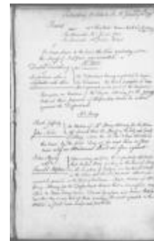
Engrailed minutes of the Supreme Court of Judicature, January 1790 (NYSA_JN531-17_R007_1790-01-30)