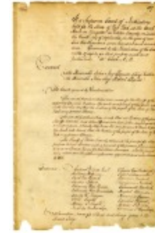
Minutes of the Supreme Court of Judicature, September 9, 1777 (NYSA_JN531-17_V14_p107)