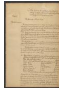
Minutes of the Supreme Court of Judicature of the State of New York, January 1783 (NYSA_JN531-17_V15_14_p321-348)