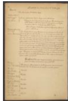
Minutes of the Supreme Court of Judicature of the State of New York, October 1781 (NYSA_JN531-17_V15_04_p062-083)