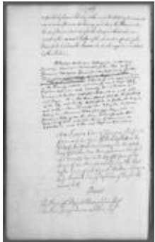
Rough minutes of the Supreme Court of Judicature, October 1772 - July 1773 (NYSA_JN531-17_R005_1772-10-20_1773-