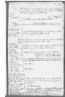
Engrossed minutes of the Supreme Court of Judicature, April 26-30, 1788 (NYSA_JN531-17_R007_1788-04-26_1788-04-30)