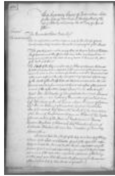
Engrossed minutes of the Supreme Court of Judicature, April 1780 (NYSA_JN531-17_R005_1780-04-18_1780-04-29)