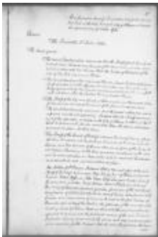
Engrossed minutes of the Supreme Court of Judicature, October 1781 (NYSA_JN531-17_R005_1781-10-16_1781-10-27)