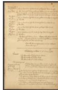
Minutes of the Supreme Court of Judicature of the State of New York, January 1782 (NYSA_JN531-17_V15_06_p097-123)