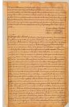
Land Patent, 1763 (NYSA_12943-78_1763_V14_p19-p23)