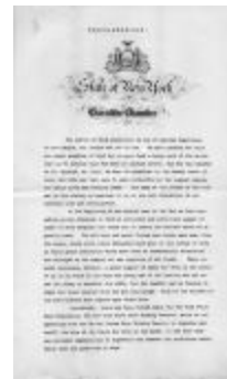
Governor's Proclamation (NYSA_13035-79_B2_1918_37)