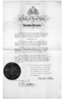
World War I - Forget Me Not Day Proclamation (NYSA_13035-79_B2F3)