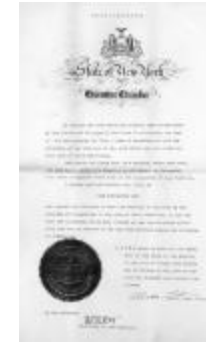
World War I - Fire Prevention Proclamation (NYSA_13035-79_B1_F1_2)