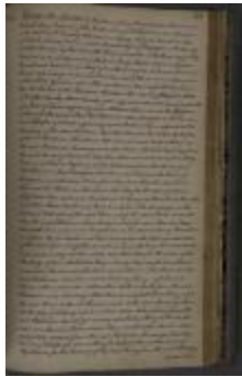
Letters patent to operate a ferry across the Hudson River (NYSA_12943-78_1752_V012_p418-p423)