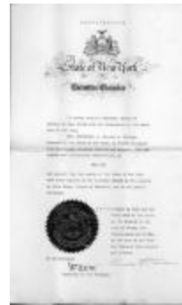
World War I - Flag Day Proclamation (NYSA_13035-79_B1_F1_1)