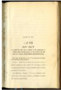
An Act to amend the labor law, in relation to the employment of children under fourteen years old in or for a factory, the definition of