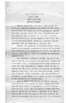
World War I - Law Chapter 625 Proclamation (NYSA_13035-79_B2F4)