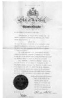
World War I - Liberty Day Proclamation (NYSA_13035-79_B2_F2_3)