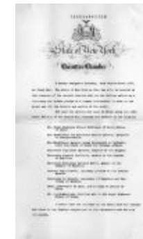
World War I - Italy Day Proclamation (NYSA_13035-79_B2_F2_1-2)