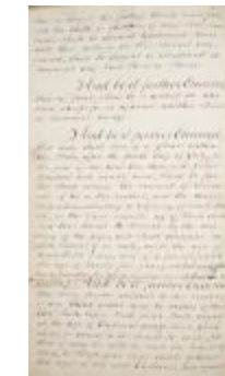
An Act relative to slaves and servants (NYSA_13036-78_L1817_Ch137_p2)