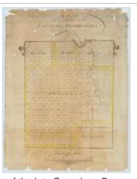
A map of the late Onondaga Reservation laid into lots of 250 acres each, 1795 (NYSA_B1610-99_27)