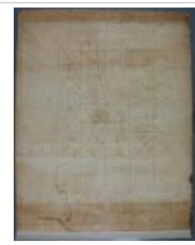
Map of Small's Patent, 1795 (NYSA_B1610-99_71)