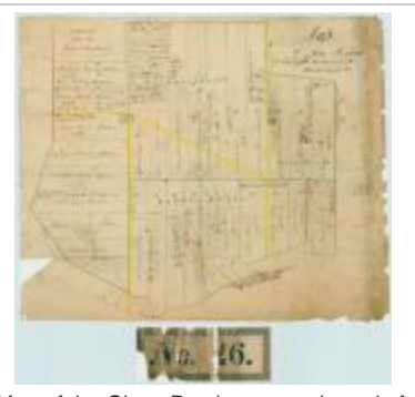
Map of the Glens Purchase, purchased of the Indians in 1734, Herkimer County, N.Y. (NYSA_B1610-99_58)