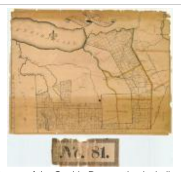
A map of the Oneida Reservation including the lands leased to Peter Smith, ca. 1860 (NYSA_B1610-99_59)