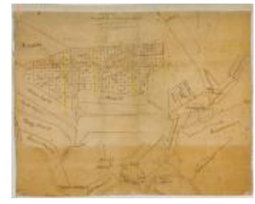
Map of Glen Bleeker and Lansing's Patent and Chase Patent, Fulton County and Hamilton County (NYSA_B1610-99_138_1)