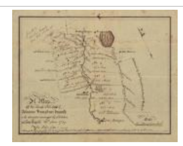
A Map of the lands of the late Johannis Trumpbour deceased (NYSL_SC7004_B9_F20)