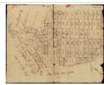
Map [of] Clarks Bush (NYSL_SC7004_B3_F21)