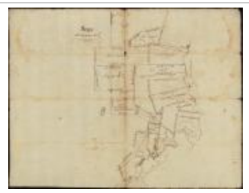
Map of [ill] Tract of Land on West Side of Lake Champlain between Crown Point & Ticonderoga (NYSL_SC7004_B2_F58)