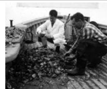
Doctor and Man Examining Shells (NYSA_14655-88_B19_shells)