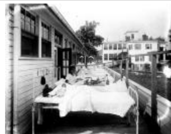
Outdoor Hospital (NYSA_14655-88_B58_02)