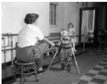
Physical therapist with disabled children, 1954 (NYSA_14655-88_B04_1954_081)