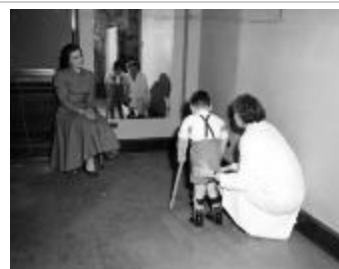
Nurse assisting a handicapped child on crutches (NYSA_14655- 88_B19_1953_193A)