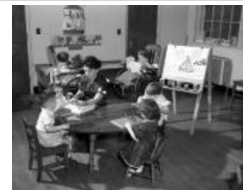
Woman in class with six recovering children, 1954 (NYSA_14655-88_B04_1954_053)