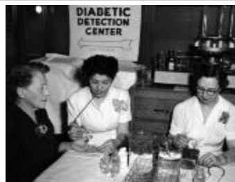
Two nurses testing for diabetes, 1954 (NYSA_14655-88_B04_1954_017)