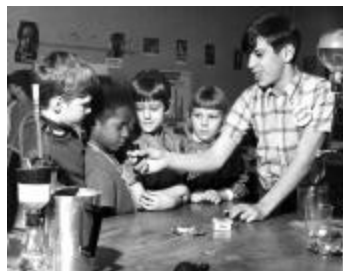
New York State Fair Demonstration of the Harmful Effects of Smoking (NYSA_14655-88_B01_F58_smoking2)