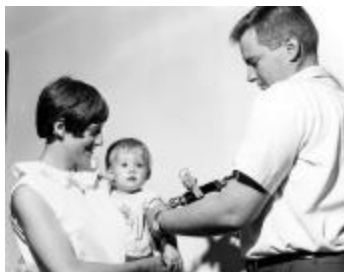
Buffalo Measles vaccination (NYSA_14655-88_measles_2)