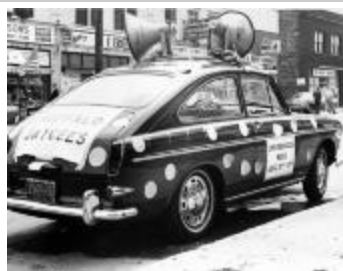
Medical campaign to End Measles (NYSA_14655-88_measles_3)