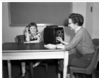
Hearing test, 1954 (NYSA_14655-88_B04_1954_183)