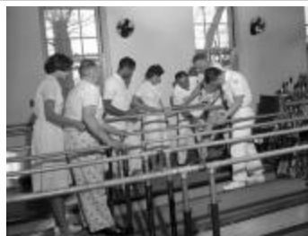
Nurses assisting patients with walking exercises, 1962 (NYSA_14655-88_B11_1962_234)