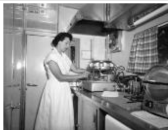
Woman with scientific equipment and test tubes, 1959 (NYSA_14655-88_B08_1959_206)