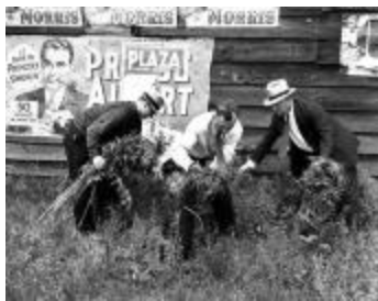
Local officials pull up marijuana plants, Schenectady County (NYSA_14655-88_001)