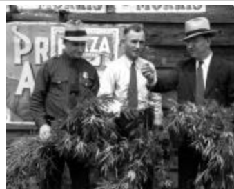
Local officials pull marijuana plants, Schenectady County. (NYSA_14655-88_003)