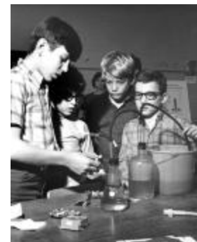
New York State Fair Demonstration of the Harmful Effects of Smoking (NYSA_14655-88_B01_F58_smoking4)