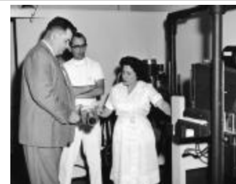
Two men and a woman inspecting scientific equipment, 1961 (NYSA_14655-88_B10_1961_224)