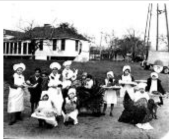
Children dressed for Thanksgiving Pageant (NYSA_14655-88_B58_01)