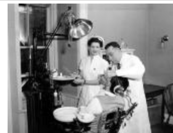
People in Dentist's Office (NYSA_14655-88_B19_1953_014A)