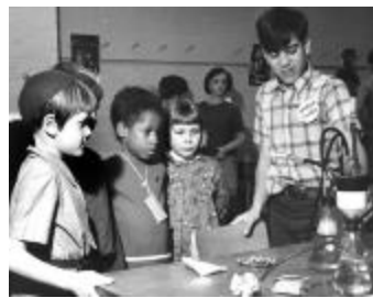
New York State Fair Demonstration of the Harmful Effects of Smoking (NYSA_14655-88_B01_F58_smoking3)