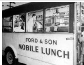
Ford and Son Mobile Lunch Truck (NYSA_14655-88_B19_1953_180)