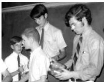
New York State Fair Demonstration of the Harmful Effects of Smoking (NYSA_14655-88_B01_F58_smoking5)