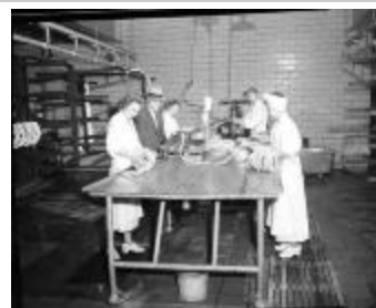
Workers Around Table Making Sausages (NYSA_14655-88_B19_sausages)