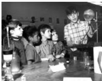
New York State Fair Demonstration of the Harmful Effects of Smoking (NYSA_14655-88_B01_F58_smoking1)