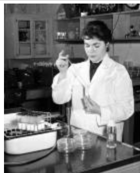
Scientist in a laboratory, 1956 (NYSA_14655-88_B05_1956_086)