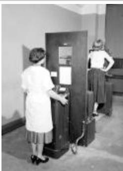
Woman working the X-Ray Machine on Another Woman (NYSA_14655- 88_B19_1953_157A)