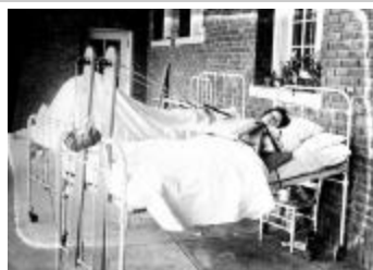
Child in Hospital Bed (NYSA_14655-88_B58_05)