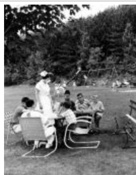
NYS Health Photo, unidentified child (NYSA_14655-88_childrenoutside)