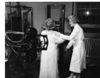
Patient undergoing X-ray, 1950 (NYSA_14655-88_B01_1950_798)