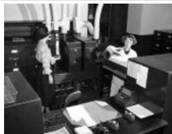
Two Department of Health office workers, 1953 (NYSA_14655-88_B19_1953_009)