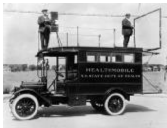
Medical - Healthmobile, 1919 (NYSA_14655-88_002)