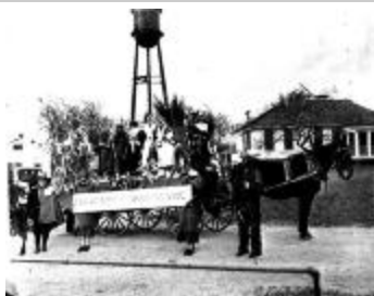
Children reenacting Thanksgiving with sign of Friendship and Peace between Pilgrims and Indians (NYSA_14655-88_B58_04)