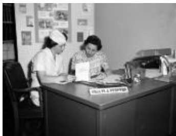
Two Health Department employees reading a book about meal planning, 1959 (NYSA_14655-88_B07_1959_104)