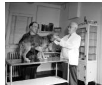
Dog being examined by Vet (NYSA_14655- 88_B19_dogvet)