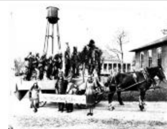
Native American Demonstration from Kids' Reenactment of Thanksgiving (NYSA_14655-88_B58_03)