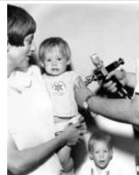
Buffalo Measles vaccination (NYSA_14655-88_measles_1)