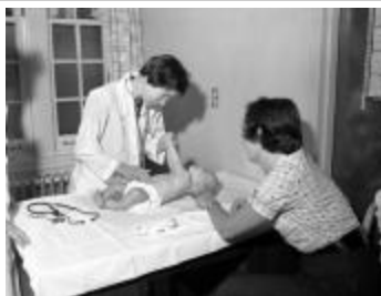
Doctor examining baby, 1961 (NYSA_14655-88_B10_1961_267)