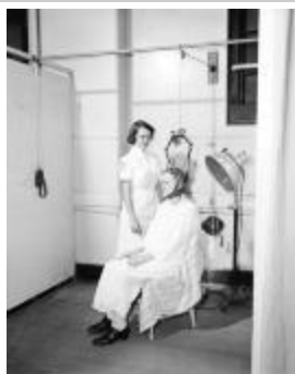
Woman in Neck Traction Device (NYSA_14655-88_B19_neckbrace)