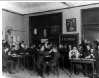
Medical - Opticians (NYSA_14655-88_Opticians)