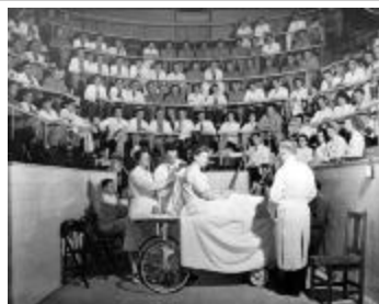
Albany Medical School Amphitheater with Medical Students and Patient-Based Demonstration (NYSA_14655-88_B58)