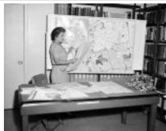
Community resources worker looking at a map of Hempstead, 1961 (NYSA_14655-88_B10_1961_204)