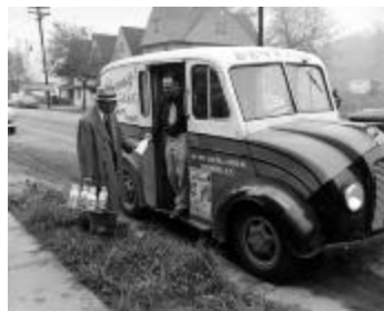
Milk Truck (NYSA_14655-88_B19_milktruck)