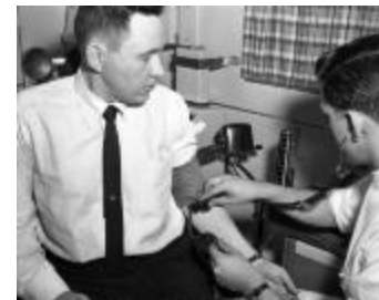
Man having blood pressure checked, 1959 (NYSA_14655-88_B07_1959_092)