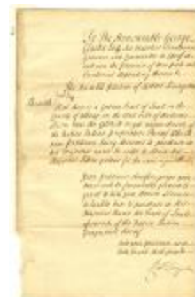
Petition of Roberts Livingston for land (NYSA_A0272-78_V13_p061)