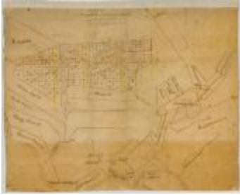
Map of Glen Bleeker and Lansing's Patent and Chase Patent, Fulton County and Hamilton County (NYSA_B1610-99_138_1)