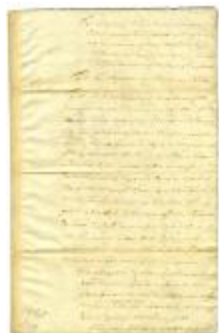
Petition of Hilletie van Olinda for a tract of land, 1704 (NYSA_A0272-78_V04_p027a)