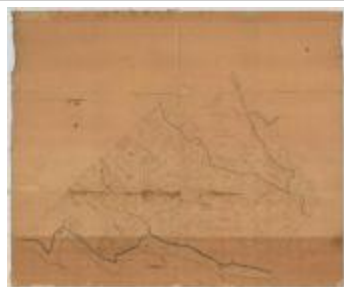
Map of several tracts of land in Orange and Ulster County. Map #237 (NYSA_A0273-78_237)