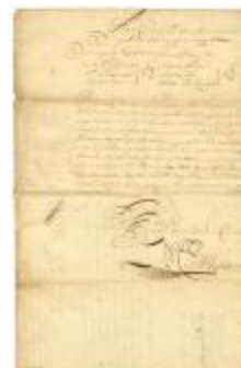
Council minutes regarding survey for Richard Sackett, 1704 (NYSA_A0272-78_V04_p020d)