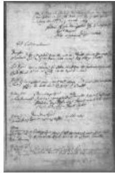
Minutes of the Supreme Court of Judicature, March 1704-October 1706 (NYSA_JN531-17_R001_1704-03-13_1706-10-12)