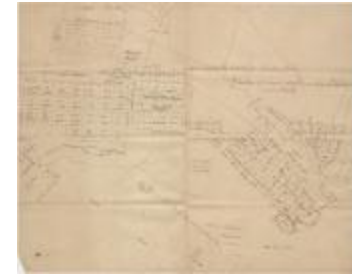
A Map of Partition of Land near the boundaries of Albany, Greene and Schoharie Counties (NYSL_SC17820_B4_F14)