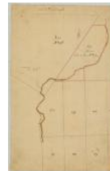
Map of Kingsborough Patent, along Cayadutta Creek. Map #860 (NYSA_A0273-78_860)