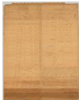
Map of a certain tract of land in Westchester County, commonly called the East Patent. Map #416 (NYSA_A0273-78_416)