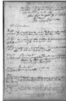
Minutes of the Supreme Court of Judicature, March 1704-September 1708 (NYSA_JN531-17_R001_1704-03-13_1708-)