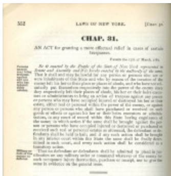
An Act for granting a more effectual relief in cases of certain trespasses (NYSA_13036-78_L1783_Ch031_printed)