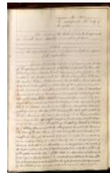
An act to incorporate the city of Kingston (NYSA_13036-78_L1872_Ch150)