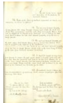
An act for the more effectual protection of the property of married women (NYSA_13036-78_L1848_Ch200)