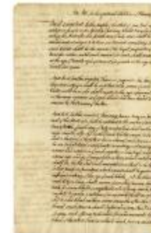
An Act for the gradual abolition of slavery (NYSA_13036-78_L1799_Ch062)