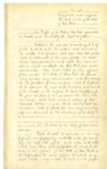
An Act to regulate and improve the civil service of the state of New York (NYSA_13036-78_L1883_Ch354)