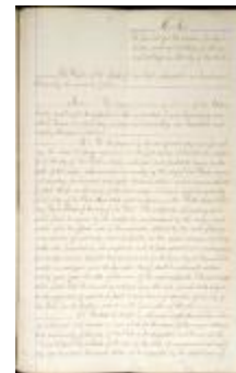
An Act to provide the erection of school houses and a building for the normal college in the City of New York, 1871 (NYSA_13036-78_L1872_Ch150)