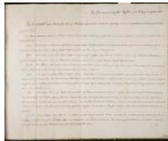
An Act concerning the rights of the citizens of this state (NYSA_13036-78_L1787_Ch001)