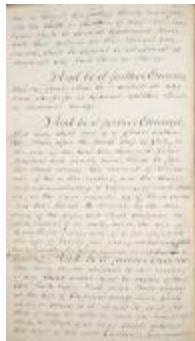
An Act relative to slaves and servants (NYSA_13036-78_L1817_Ch137_p2)