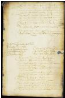
Actions of debt (NYSA_A1876-78_V16_pt2_0031)