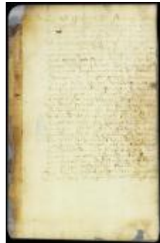
Ordinance prohibiting the employment of Christians as brokers among the Indians in the woods (NYSA_A1876-