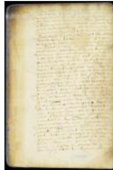
Sentence of William Hoffmeyer for conveying beer up the river and selling it to Indians (NYSA_A1876-78_V16_pt2_0005)