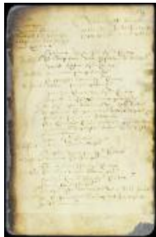
Sundry actions for debt (NYSA_A1876-78_V16_pt3_0139)