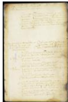
Actions of debt; application of Thomas Jansen Mingal for a building (NYSA_A1876-78_V16_pt2_0019)