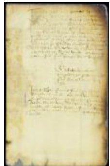
Minute of the presentation of a petition that the Indian trade may be free, and that Dutch as well as Indian brokers may be employed