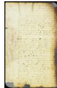
Answer to proposals of the Senecas (NYSA_A1876-78_V16_pt3_0196)