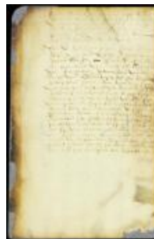
Order on a petition that Dutch brokers may be employed to trade with the Indians (NYSA_A1876-78_V16_pt3_0171)