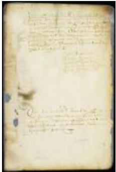
Minute of the conveyance of a drunken Indian to the fort on a brewer's dray and his confinement there (NYSA_A1876-78_V16_pt2_0008)