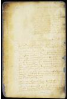
Complaint against Hendrick Hendricksen, baker, for selling bread below the regular weight (NYSA_A1876-78_V16_pt2_0001)