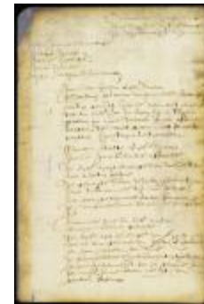
Actions of debt (NYSA_A1876-78_V16_pt2_0045)