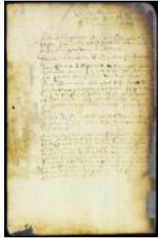
Votes and opinions of the magistrates on the petition that only Indian brokers be allowed in the Indian trade (NYSA_A1876-