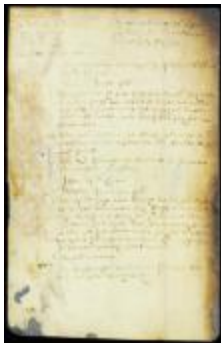
Complaints against various citizens for going to the woods or employing Dutchmen as brokers to trade there with Indians