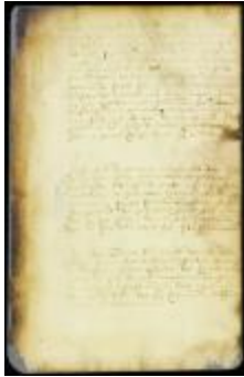
Advice and opinions of the several magistrates on proposals on employment of Dutch brokers in the woods (NYSA_A1876-