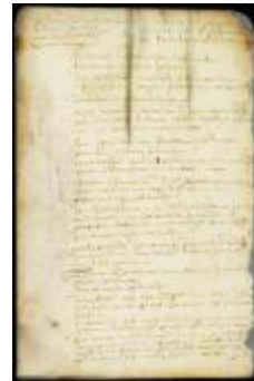
Sundry actions for recovery of debts (NYSA_A1876-78_V16_pt2_0010)