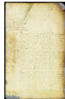
Proposals of the Mohawks protesting against the employment of Dutch brokers in the woods (NYSA_A1876-