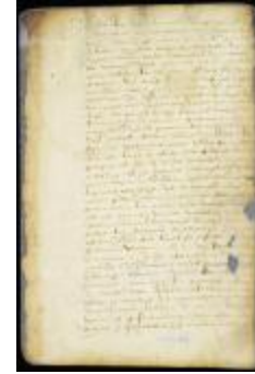
Sentence of Dirckje Harmens for selling beer to Indians (NYSA_A1876-78_V16_pt2_0007)