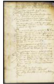
Actions of debt; attachment issued against the ship of Harmen Jacobsen Bambus (NYSA_A1876-78_V16_pt2_0086)