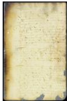
Ordinance for the regulation of the Indian trade at Fort Orange (NYSA_A1876-78_V16_pt3_0191)