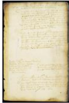
Actions of debt (NYSA_A1876-78_V16_pt2_0023)