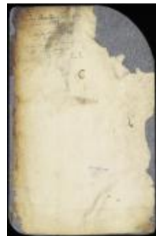
Title pages (NYSA_A1876-78_V16_pt2_i)