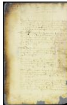
Proposals of the Senecas (NYSA_A1876-78_V16_pt3_0193)