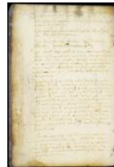
Actions of debt; information against Barent Pietersen for selling liquor to an Indian (NYSA_A1876-78_V16_pt2_0020)