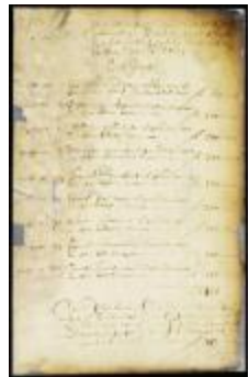
Account of the fines received and expenses incurred at Fort Orange from 4th October, 1656, to 28th March, 1658 (NYSA_A1876-