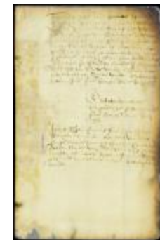
Order permitting the inhabitants of the town to employ Indian brokers (NYSA_A1876-78_V16_pt3_0168a)