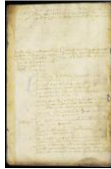
Actions of debt and prosecutions for being found in the tavern after the ringing of the bell (NYSA_A1876-78_V16_pt2_0025)