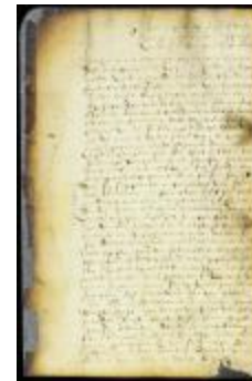
Petition of several citizens, on behalf of the commonalty legally assembled, that only Indian brokers be allowed in the Indian trade