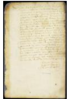
Examination of a drunken Indian conveyed to the fort (NYSA_A1876-78_V16_pt2_0009)