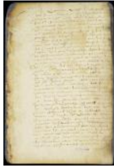
Sentence of Egbertje Egberts for selling beer to Indians (NYSA_A1876-78_V16_pt2_0003)