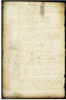
Actions of debt; action of damages against Thomas Chombert (NYSA_A1876-78_V16_pt2_0022)