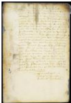
Ordinance for the sweeping of chimneys (NYSA_A1876-78_V16_pt2_0016)