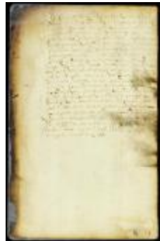
Ordinance directing that no brokers be allowed in the Indian trade, but the Indians be allowed to offer their beavers for sale in