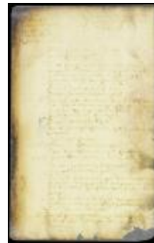
Actions for debt (NYSA_A1876-78_V16_pt3_0181)