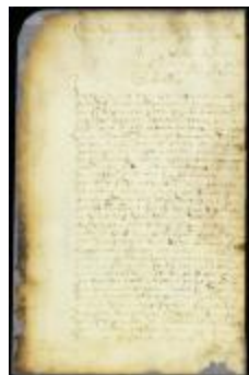
Petition of several citizens that Dutch as well as Indian brokers may be employed to trade with the Indians (NYSA_A1876-