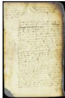
Inauguration of the new magistrates for the ensuing year; oath of office (NYSA_A1876-78_V16_pt3_0146)