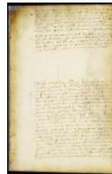
Actions of debt; Reyndert Hoorn vs. Adriaen Symonsen (NYSA_A1876-78_V16_pt2_0103a)