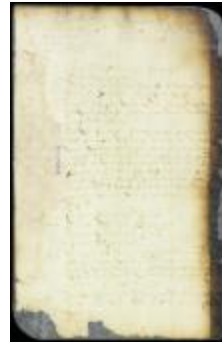
Actions for debt (NYS A1876-78_V16_pt3_0218)