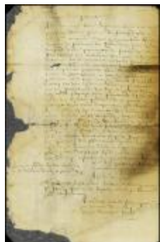
Letter from gov. Colve to Isaac Greveraedt (NYSA_A1881-78_V23_0423)