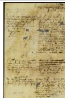
Trial and sentence of two soldiers for fighting (NYSA_A1881-78_V23_0305)