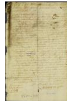
Petition of Elizabeth de Potter to be admitted as a preferred creditor of the late gov. Lovelace (NYSA_A1881-78_V23_0318)