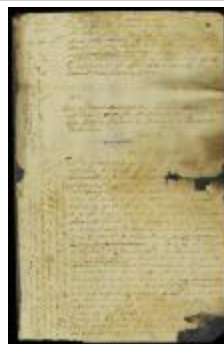
Letter from gov. Andros to gov. Colve (NYSA_A1881-78_V23_0420)