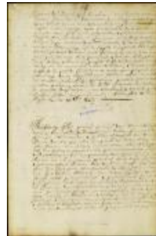
Commission of William Knyff to be fiscal of New Netherland (NYSA_A1881-78_V23_0177)