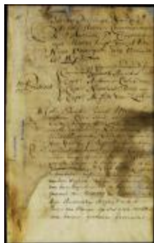
Order allowing Elizabethtown, Newark, Woodbridge and Piscataway, New Jersey to send delegates to surrender to the Dutch