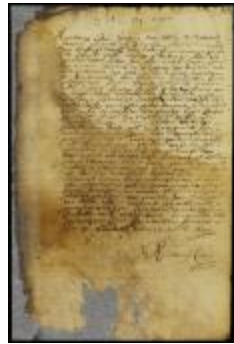
Patent of Jan Teunissen van Pelt for land on Staten Island (NYSA_A1881-78_V23_0433_54)