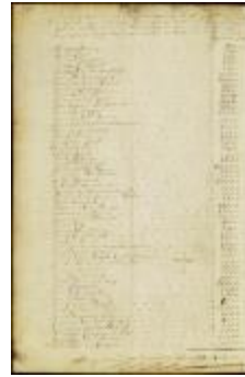
Return of estates in New Orange exceeding 1,000 guilders in value (NYSA_A1881-78_V23_0228)