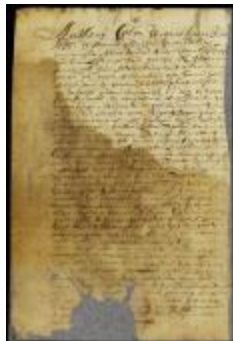
Patent of Ephraim Herman for a lot outside the city of New Orange (NYSA_A1881-78_V23_0433_40)