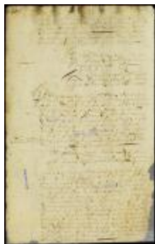
Commission for schout and secretary of Achter Col (NYSA_A1881-78_V23_0050)