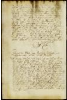
Oath of office taken by Walton Wharton (NYSA_A1881-78_V23_0084)