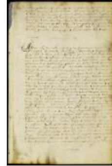
Order furloughing one-third of each of the militia companies that came to New Orange (NYSA_A1881-78_V23_0185)