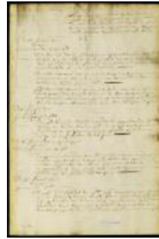
Court minutes (NYSA_A1881-78_V23_0213)