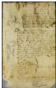
Summons to the English towns on Long Island and Westchester to send delegates to New Orange (NYSA_A1881-78_V23_0005)