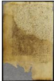
Patent of Peter Harmse for a house and lot in New Orange (NYSA_A1881-78_V23_0433_36)