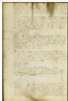
Minute of the capture of sundry New England vessels (NYSA_A1881- 78_V23_0250a)