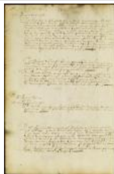
Court minutes (NYSA_A1881-78_V23_0262)