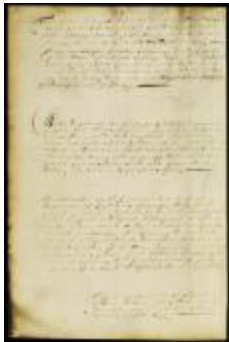
Order defining the jurisdiction of the magistrates of Huntington and Seatalcot (NYSA_A1881-78_V23_0164)