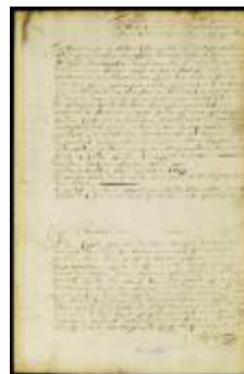
Minute of the appearance of certain Indian sachems of New Jersey before the council (NYSA_A1881-78_V23_0201a)