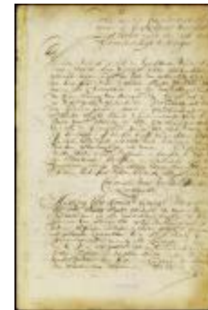
Commission of Walter Wharton to be land surveyor at the South river (NYSA_A1881-78_V23_0083b)