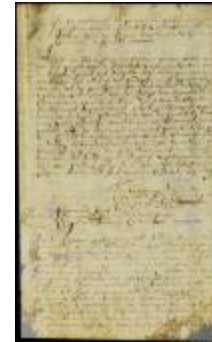
Proclamation confiscating all property in New Netherland belonging to the kings of France and England or their subjects