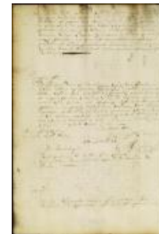
Resolution to detain New England ships and cargoes brought in by captain Ewoutsen (NYSA_A1881-78_V23_0168a)