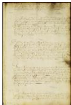
Order confirming to the consistory of the Dutch Reformed religion the church standing in Fort William Hendrick, New