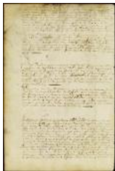
Order releasing property in New Netherland belonging to inhabitants of New England, Virginia and Maryland from confiscation