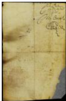
Balance sheet on the fortifications of New Orange with list of persons whose assessments remain unpaid (NYSA_A1881-