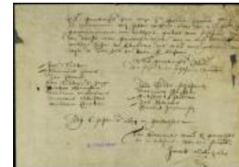
Nomination of magistrates for Gravesend (NYSA_A1881-78_V23_0402)