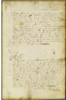
Resolution to send a second embassy to the towns on the east end of Long Island (NYSA_A1881-78_V23_0137a)