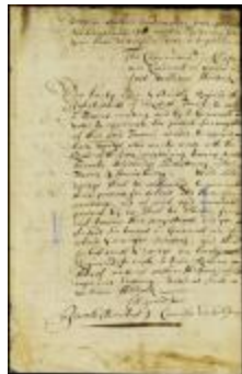
Order to the inhabitants of Elizabethtown and five neighboring towns to nominate magistrates (NYSA_A1881-78_V23_0019)