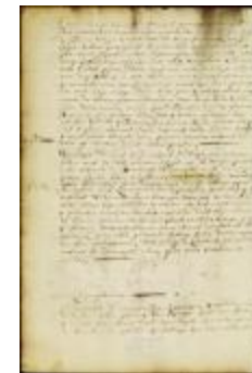
Proclamation for a day of Humiliation and Thanksgiving (NYSA_A1881-78_V23_0156)