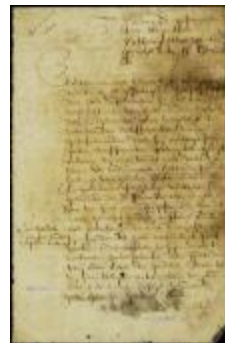
Petition of the minister and elders of the Lutheran church at Willemstadt to be allowed to bury their own dead