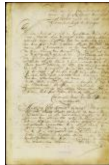
Order to administer the oath of allegiance to the inhabitants of the South river (NYSA_A1881-78_V23_0083a)