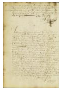
Commission of Isaac Grevenraet to be schout at Esopus (NYSA_A1881-78_V23_0144)