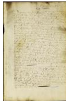
Minute of the meeting of the delegates from the several Dutch towns, with their names (NYSA_A1881-78_V23_0231)