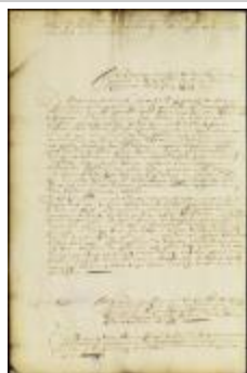
Minute of the return and attendance of the Mohawk chiefs at the council; order to forward them home (NYSA_A1881-