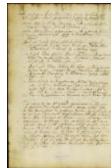
Minute that instructions for the schout and magistrates have been sent to Long Island, the South river, Esopus, and New Jersey