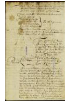
Appointment of magistrates for Bergen, N. J. (NYSA_A1881-78_V23_0018)