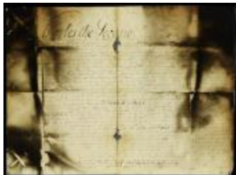
Grant to James, duke of York, of the province of New York and territories (NYSA_A1881-78_V23_0362)