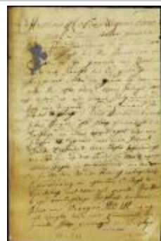
Condemnation of the ship Dolphin, captured by commanders Evertze and Benckes in the bay of Virginia (NYSA_A1881-78_V23_0303)