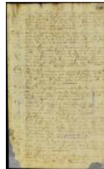
Privileges granted to the inhabitants of the South river (Delaware) (NYSA_A1881-78_V23_0065)