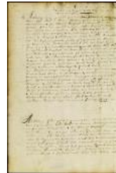
Commission of Francis de Bruyn to be auctioneer for the five Dutch towns on Long Island (NYSA_A1881-78_V23_0188b)