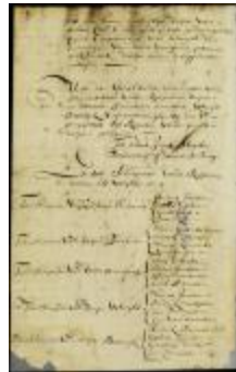
Appointment of magistrates for Brooklyn and adjoining towns (NYSA_A1881-78_V23_0014)