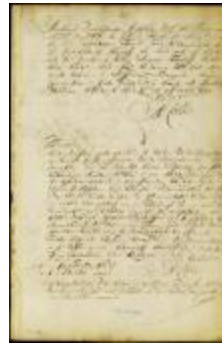
Appointment of magistrates and militia officers for Swaenenburgh (Kingston), Marletown and Hurley (NYSA_A1881-