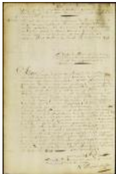
Proclamation sent to the South river on an invasion of those parts from Maryland (NYSA_A1881-78_V23_0194)