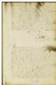
Mortgage of sundry pieces of cannon for the re-payment of money borrowed by the government (NYSA_A1881-78_V23_0243b)