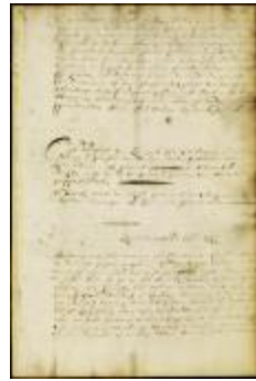
Appointment of Lodewyck Cobbes to be notary public at Willemstadt (NYSA_A1881-78_V23_0147a)