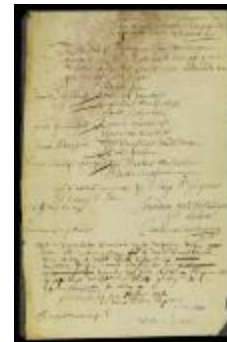
Nomination of magistrates for the town of Bergen and dependencies (NYSA_A1881-78_V23_0401)