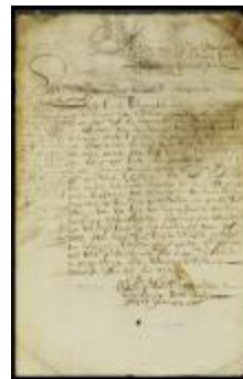
Petition of Gerrit Janz Roos to purchase a piece of ground in New Orange (NYSA_A1881-78_V23_0410)