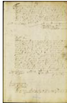
Letter from the town of Seatacott to the commissioners (NYSA_A1881-78_V23_0129)