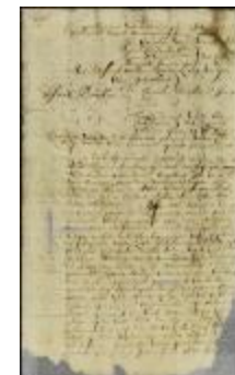
Commission of Anthony Colve to be governor of New Netherland (NYSA_A1881-78_V23_0072b)