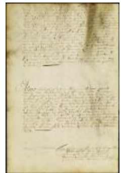
Commission of Jacobus van de Water to be receiver of moneys advanced for completing the fortification of New Orange