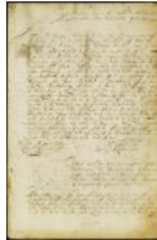
Order for delinquents at Hempstead to take the oath of allegiance (NYSA_A1881- 78_V23_0085b)