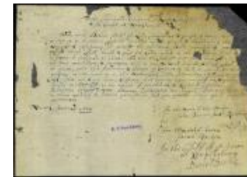
Petition of Newark, Elizabethtown and Piscataway for a confirmation of their rights and possessions (NYSA_A1881-78_V23_0361)