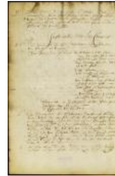
Instructions for the commissary (NYSA_A1881-78_V23_0102)