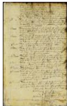
Petition of delegates from the five English towns on Long Island (NYSA_A1881-78_V23_0027)