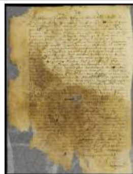
Patent of William van Vredenburg for a lot in New Orange (NYSA_A1881-78_V23_0433_24)