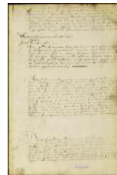
Order to the militia of the Dutch towns adjoining New Orange to appear armed at the city on the first notice (NYSA_A1881-