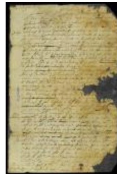
Letter from gov. Andros to gov. Colve (NYSA_A1881-78_V23_0415)