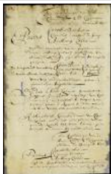
Appointment of magistrates for East and Westchester (NYSA_A1881-78_V23_0044)