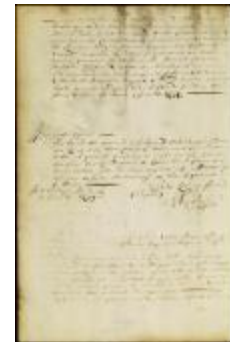
Instructions for the officers of militia at the Esopus (NYSA_A1881-78_V23_0190b)