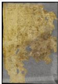
Patent of Nicholas Bayard of a lot in New Orange (NYSA_A1881-78_V23_0433_19)