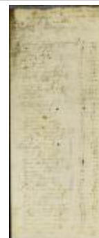
List of creditors of the fortifications of New Orange (NYSA_A1881-78_V23_0297)