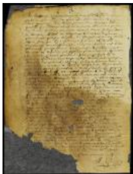
Patent of the Lutheran congregation for a lot in New Orange (NYSA_A1881-78_V23_0433_26)