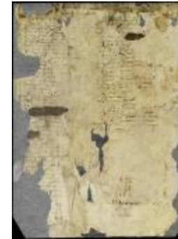
Names of persons who have taken the oath at Elizabethtown, Shrewsbury, Middletown, Piscataway, Newworke, Woodbridge and