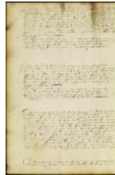
Minute of the hearing of a claim lodged by some Indians to Secaucus (NYSA_A1881-78_V23_0238d)