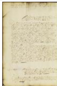
Various orders on petitions of private persons; peace between Holland and England proclaimed in New England