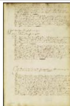
Order for the payment of the salaries due to rev. Johannes Megapolensis and rev. Samuel Megapolensis (NYSA_A1881-