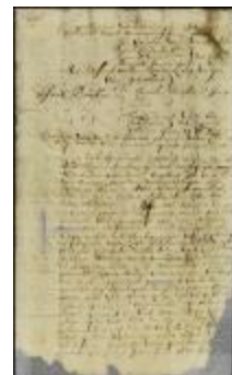
Appointment of magistrates for Schanegtade (NYSA_A1881-78_V23_0072a)