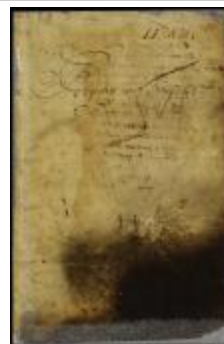
Register of Dutch patents and deeds from 29 November 1673 to 3 November 1674 (NYSA_A1881-78_V23_0433)