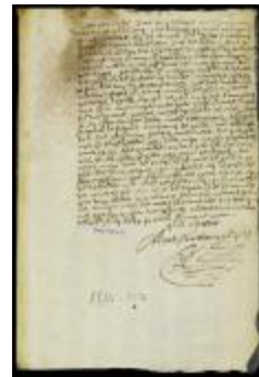
Declaration of Metjie Wessels as to the trespass committed by schout De Milt (NYSA_A1881-78_V23_0352)