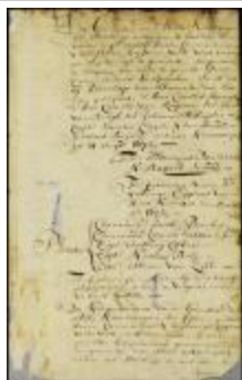
Order for the nomination of burgomasters and schepens for the city of New Orange (NYSA_A1881-78_V23_0007b)