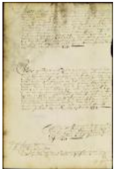
Order respecting vessels in port (NYSA_A1881-78_V23_0232b)