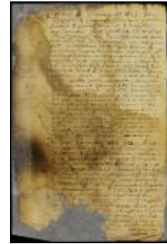
Patent of Ephraim and Casparus Hermans for land below New Amstel (NYSA_A1881-78_V23_0433_56a)