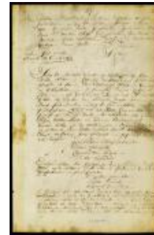
Appointment of magistrates for Willemstadt and Renselaerswyck (NYSA_A1881-78_V23_0107)