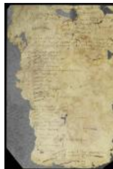
Names of persons who took the oath of allegiance at Harlem (NYSA_A1881-78_V23_0276)