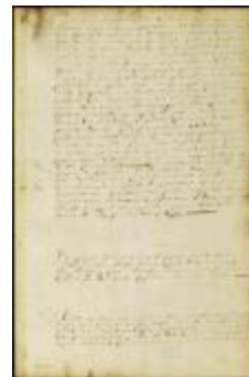
Order for the nomination of additional magistrates for Staten Island (NYSA_A1881-78_V23_0207)