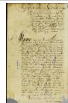
Proclamation altering the form of government of the city of New Orange (NYSA_A1881-78_V23_0010)