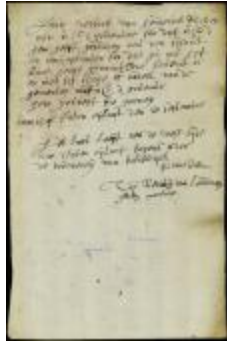
Certificate of the magistrates in favor of granting certain land on the west side of Staten Island to Henderick Rycken