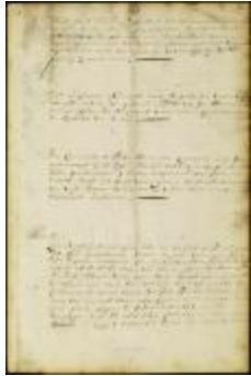
Council minutes (NYSA_A1881-78_V23_0161a)