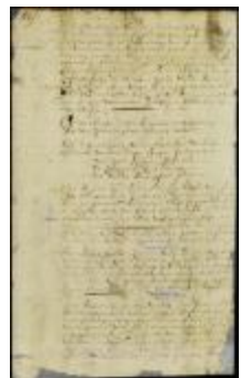
Appointment of militia officers for the town of Bergen (NYSA_A1881-78_V23_0054)