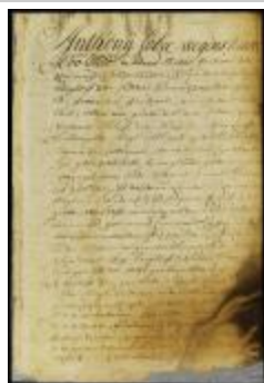
Pass to Lourens Sachariassen, skipper of the ship Welfare, for a voyage to Surinam (NYSA_A1881-78_V23_0433_07)