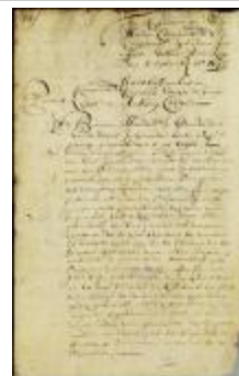
Order on a petition from Esopus for the government of that district (NYSA_A1881-78_V23_0046)