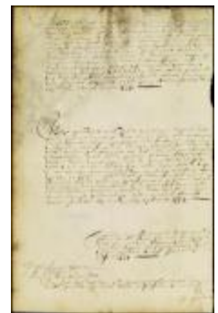
Court minutes (NYSA_A1881-78_V23_0232c)