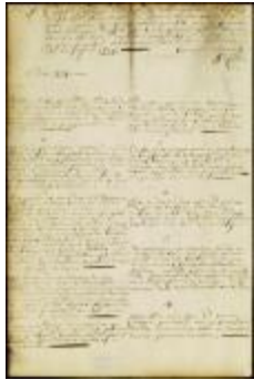
Points submitted by the magistrates of Willemstadt and order thereupon (NYSA_A1881-78_V23_0240)