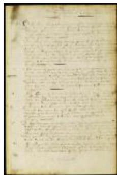
Instructions for the schout, burgomasters and schepens of the city of New Orange (NYSA_A1881-78_V23_0195)