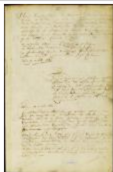
Minute of arrangements for removal of houses near the fort (NYSA_A1881-78_V23_0113)