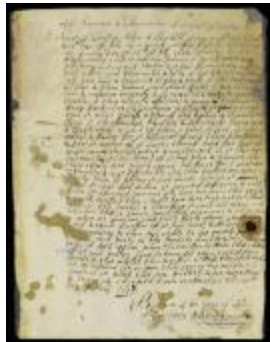
Judgment of a court held at Elizabethtown in a case between the town of Piscataway and the town of Woodbridge (NYSA_A1881-