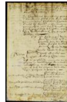
Appointment of magistrates for Elizabethtown, Woodbridge, Shrewsbury and Newark (N. J.) and Mamaroneck