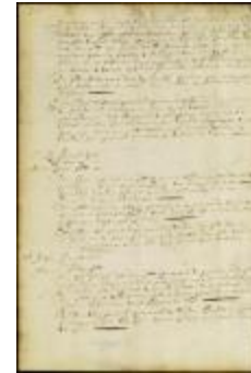
Court minutes (NYSA_A1881-78_V23_0204)