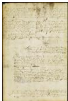
Orders on various petitions from Aghter Col (New Jersey) (NYSA_A1881-78_V23_0248)