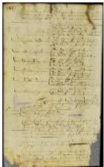
Names of the militia officers of said towns (NYSA_A1881-78_V23_0070)