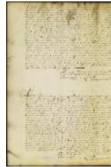
Sentence of Isaac Melyn to hard labor at the fort for uttering seditious language (NYSA_A1881-78_V23_0242a)