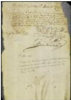
Report of referees as to the value of the ground allotted to Peter Stoutenburgh (NYSA_A1881-78_V23_0370)