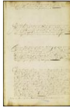
Ordinance against shooting or catching hogs in the woods on Manhattan Island without a permit (NYSA_A1881-