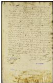
Reply from the commander and council of war to the governor and general assembly of Connecticut (NYSA_A1881-