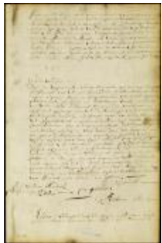
Letter from gov. Colve to the magistrates of Schenectady (NYSA_A1881-78_V23_0189a)