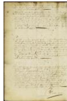
Report of the commissioners sent to the east end of Long Island (NYSA_A1881-78_V23_0152)