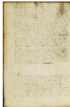
Proceedings of gov. Colve towards the burgomasters of New Orange (NYSA_A1881-78_V23_0198)