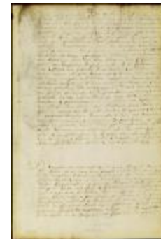
Submission of the burgomasters of New Orange to gov. Colve (NYSA_A1881-78_V23_0199)