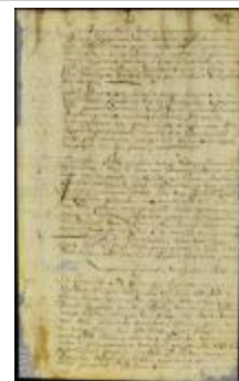
Confiscation of a ship lying sunk in Westchester creek (NYSA_A1881- 78_V23_0061)