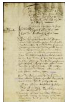
Order to the towns on the east end of Long Island to nominate magistrates; appointment of magistrates for Staten Island