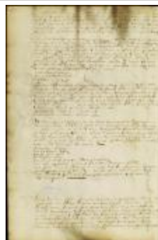
Order confiscating captured New England vessels (NYSA_A1881-78_V23_0250b)