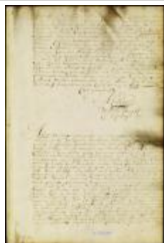
Order confiscating all property in New Netherland belonging to inhabitants of New England, Virginia, and Maryland