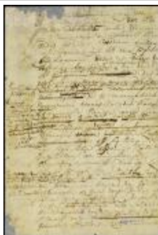
Part of the rough draft of the journal of the commissioners' visit to the east end of Long Island (NYSA_A1881-78_V23_0271)