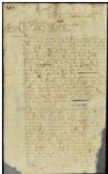
Renewal of the peace with the Indigenous Peoples of Hackensack (NYSA_A1881-78_V23_0068a)