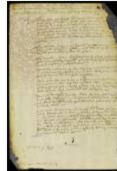
Objections of the inhabitants of Gommoenepan against a decision of arbitrators (NYSA_A1881-78_V23_0369)