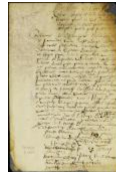
Petition of inhabitants of the town of Bergen protesting against certain agreement of their delegates (NYSA_A1881-78_V23_0364)