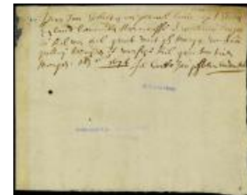
Return of survey of a parcel of land on Staten Island for Jan Scholten (NYSA_A1881-78_V23_0411)