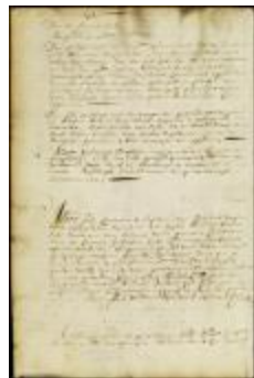
Order continuing the case of the fiscal vs. Doxy (NYSA_A1881-78_V23_0216a)