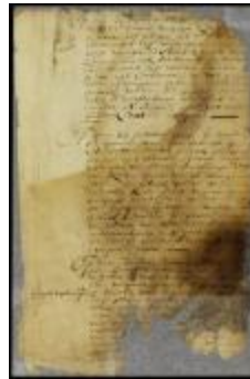
Patent of Jan Scholten for land on the Kil van Col, Staten Island (NYSA_A1881-78_V23_0433_57b)