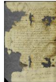
Letter from gov. Andros to gov. Colve (NYSA_A1881-78_V23_0416)