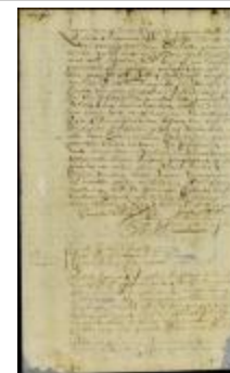
Orders respecting New Jersey and Harlem (NYSA_A1881-78_V23_0062)