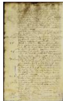
Answer of the Dutch authorities to the petition of delegates from the five English towns on Long Island (NYSA_A1881-