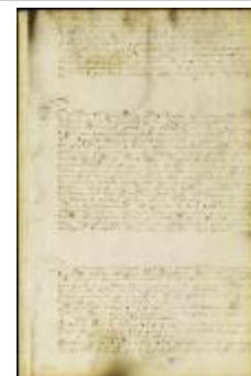
Judgment in a suit for possession of the public bouwery at Ahsymus (N. J.) (NYSA_A1881-78_V23_0251a)