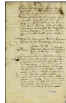
Appointment of magistrates for Piscataway (N. J.) (NYSA_A1881-78_V23_0034)