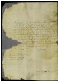
Letter from gov. Andros to gov. Colve (NYSA_A1881-78_V23_0412)