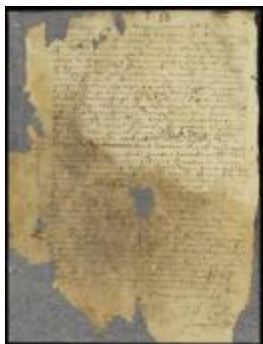
Patent of Peter Stoutenbergh for a lot in New Orange (NYSA_A1881-78_V23_0433_22)