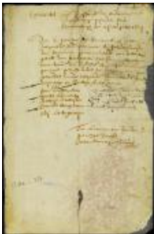
Nomination of magistrates for Swaenenburgh (NYSA_A1881-78_V23_0374)