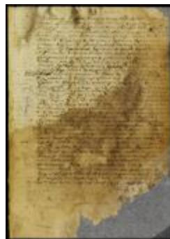
Patent of Ephraim Herman for a lot in New Orange (NYSA_A1881-78_V23_0433_33)