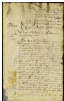
Order for the settlement of the late gov. Lovelace's accounts (NYSA_A1881-78_V23_0035)