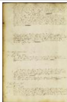
Court minutes (NYSA_A1881-78_V23_0258)