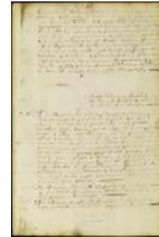
Instructions for town major Van de Water (NYSA_A1881-78_V23_0193)