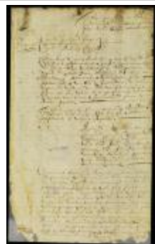
Order for administering the oath of allegiance to the inhabitants of the towns in Achter Col (New Jersey) (NYSA_A1881-