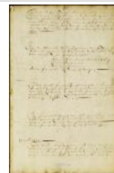
Appointment of clerk and magistrates for Fordham (NYSA_A1881-78_V23_0125a)