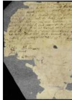
Declaration of allegiance signed by Quakers living at Westchester (NYSA_A1881-78_V23_0277c)