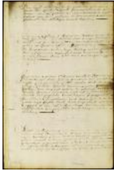
Order making further provision for a correct assessment of the real estate in New Orange (NYSA_A1881-78_V23_0211b)