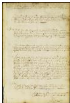
Order for the restoration of three captured New England vessels to their owners (NYSA_A1881-78_V23_0265)