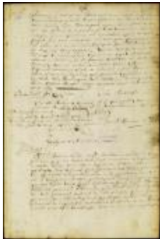
Letter from gov. Colve to the gov. and council of Massachusetts (NYSA_A1881-78_V23_0175b)