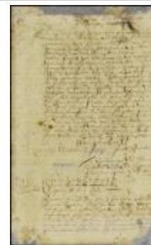
Answer granting petition of the schout, burgomasters and schepens of New Orange (NYSA_A1881-78_V23_0058)