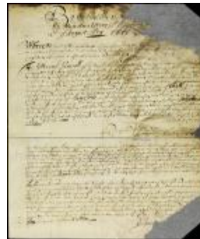
Declaration of the governor and council of New Plymouth accepting the proposal of gov. Colve (NYSA_A1881-78_V23_0376)