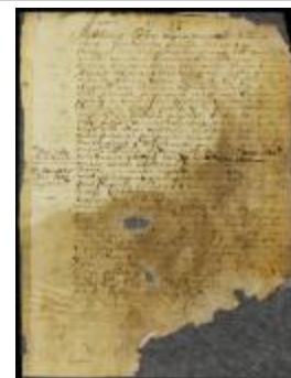
Patent of George Cobbet for a lot in New Orange (NYSA_A1881-78_V23_0433_25)