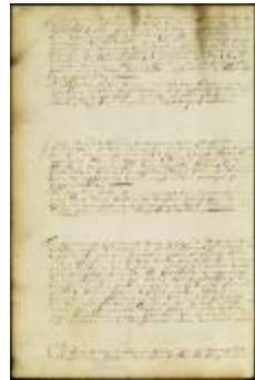
Order approving an ordinance of the town of Middletown against people leaving without notice (NYSA_A1881-78_V23_0238c)