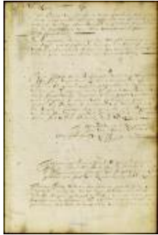
Order referring a dispute between Jan Jansen Veryn and the town of New Utrecht to commissioners (NYSA_A1881-