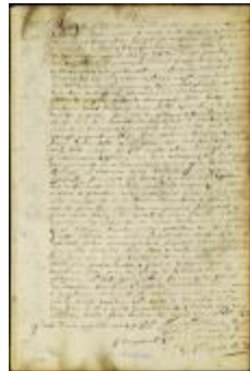
Order for the preservation and security of New Orange (NYSA_A1881-78_V23_0187)