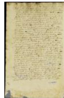
Letter from the governor and general assembly of Connecticut to the Dutch authorities at New Orange (NYSA_A1881-