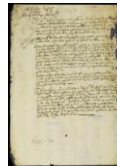
Complaint against Isaac Melyn for coming to New Orange and spreading reports of peace and the restoration of the city