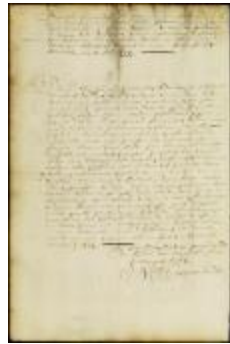
Ordinance for the exclusive use of Amsterdam weights and measures (NYSA_A1881-78_V23_0212)