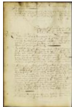
Instructions for the schout and magistrates of Willemstadt and Renselaerswyck (NYSA_A1881-78_V23_0150)