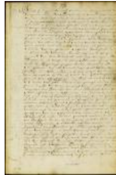
Proclamation ordering all strangers to depart the province and forbidding all correspondence with New England