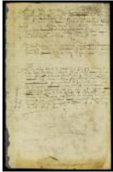
Commission of Cornelis Steenwyck, Johannes van Brugh, Johannes de Peyster and Egidius Luyck to value certain lots