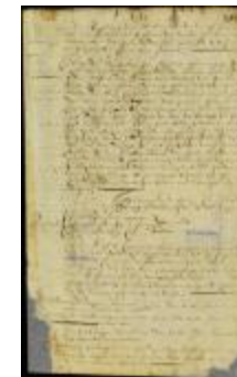
Census of the several towns at Achter Col (NYSA_A1881-78_V23_0069b)