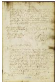
Letter from N. Bayard to lieut. Drayer (NYSA_A1881-78_V23_0245b)