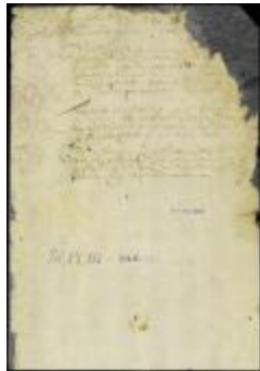
Complaint against Francis Rombouts for holding correspondence with the enemy (NYSA_A1881-78_V23_0328)