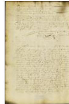
Letter from the magistrates to gov. Colve (NYSA_A1881-78_V23_0130)