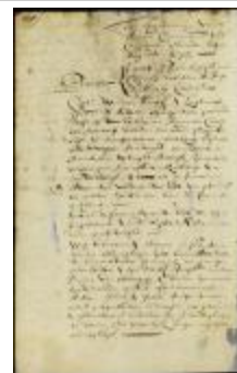
Oath of allegiance and order to administer the oath to the inhabitants of Long Island (NYSA_A1881-78_V23_0040)