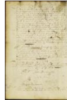
Letter from gov. Colve to gov. Winthrop (NYSA_A1881-78_V23_0148)