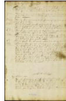
Reasons why the major part of the town of Southold refuse to come under the Dutch (NYSA_A1881-78_V23_0127a)