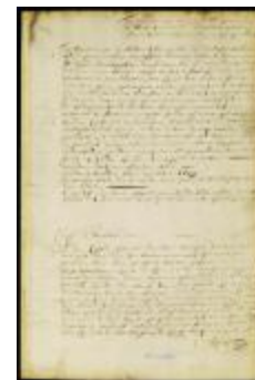
Order for the punishment of a refractory seaman (NYSA_A1881-78_V23_0201b)