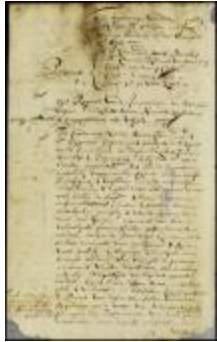
Privileges granted to the several towns in New Jersey (NYSA_A1881-78_V23_0012)