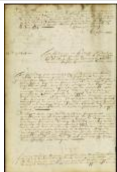
Order to pay moneys for repairs of the fortifications (NYSA_A1881-78_V23_0246a)