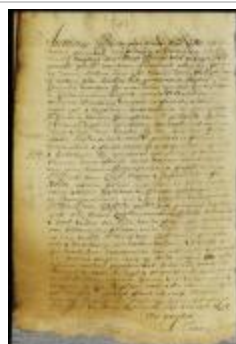
Bill of sale of the confiscated ship Neptune to Dirck van Clyff (NYSA_A1881-78_V23_0433_08)