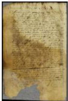
Patent of the consistory of New Orange for the use of the church standing in Fort William Hendrick for divine service