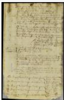
Appointment of magistrates for the towns on the east end of Long Island (NYSA_A1881- 78_V23_0059)