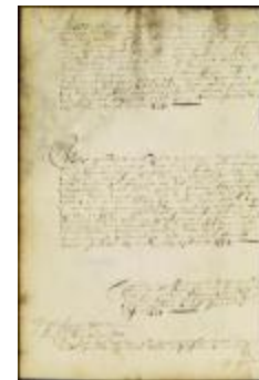
Order to provide boats to convey the out people to New Orange on the approach of the enemy (NYSA_A1881-78_V23_0232a)