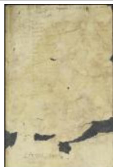
Complaint of the fiscal against capt. Fleet and Walter Webly (NYSA_A1881-78_V23_0300)