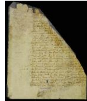
Petition of children and heirs of Cornelis Melyn concerning Staten Island (NYSA_A1881-78_V23_0406)