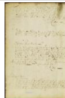
Letter from gov. Colve to schout Ogden (NYSA_A1881-78_V23_0118b)