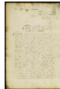
Order confiscating the four New England ships brought in by capt. Ewoutsen (NYSA_A1881-78_V23_0170)