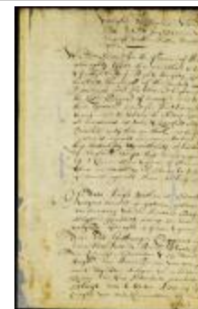
Patent to Nathaniel Silvester for Shelter Island (NYSA_A1881-78_V23_0041)