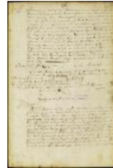
Letter from the gov. and council of Massachusetts to gov. Colve (NYSA_A1881-78_V23_0175a)