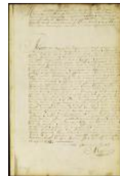
Ordinance against hogs, horses and cows running at large in New Orange (NYSA_A1881-78_V23_0235)