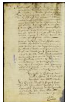
Grant of Shelter Island to Nathaniel Silvester (NYSA_A1881-78_V23_0036)