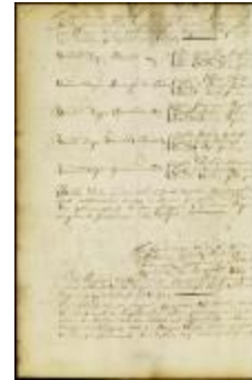
Appointment of militia officers for the towns of Midwout, Amesfoort, Breuckelen, Utrecht, Bushwyck and Gravesend (NYSA_A1881-