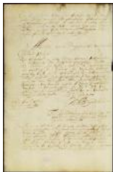
Letter from gov. Colve to the magistrates of Swaenenburgh (NYSA_A1881-78_V23_0112)