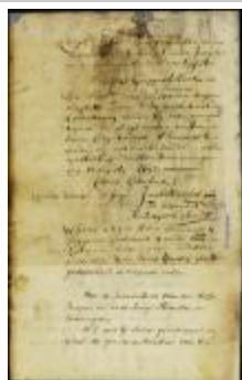
Order to the village of Bergen to send delegates to surrender to the Dutch (NYSA_A1881-78_V23_0002)