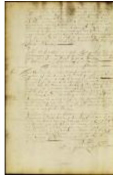
Answer of the town of Southampton, refusing to swear allegiance to the Dutch government (NYSA_A1881-78_V23_0126)