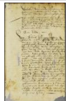
Oath of office of the municipal authorities (NYSA_A1881-78_V23_0009)