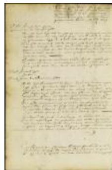
Court minutes (NYSA_A1881-78_V23_0210)