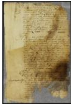
Patent of Elizabeth Drisius for a lot in New Orange (NYSA_A1881-78_V23_0433_57a)