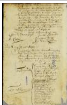
Nomination of burgomasters and schepens (NYSA_A1881-78_V23_0008)