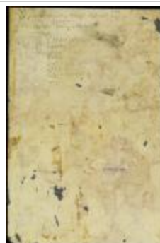
Complaint of the fiscal against Asser Levy (NYSA_A1881-78_V23_0301)