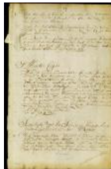
Instructions for the schout and commandant of the South river (NYSA_A1881- 78_V23_0089b)