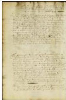
Minute of the appearance before the council of magistrates of towns on Long Island (NYSA_A1881-78_V23_0132b)