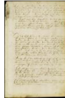
Grant of the free exercise of their religious worship to the Lutherans at Willemstadt (Albany) (NYSA_A1881-78_V23_0087)