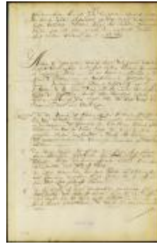
Orders extracted from the articles of war (NYSA_A1881-78_V23_0099)