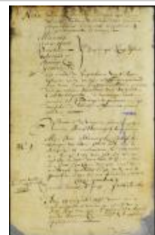
Orders to the burghers of New Orange to send delegates to confer with the Dutch commanders (NYSA_A1881-78_V23_0007)