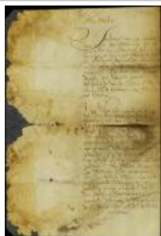
Proposals sent by gov. Colve to gov. Andros, previous to the surrender (NYSA_A1881-78_V23_0419)