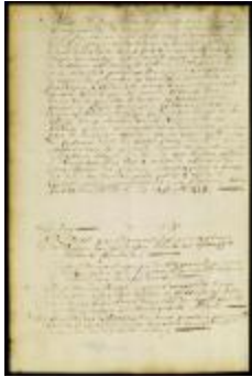
Order prohibiting the sale of strong liquors to soldiers and sailors in the public service (NYSA_A1881-78_V23_0202a)