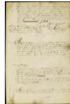
Order forbidding the export of provisions and other articles (NYSA_A1881-78_V23_0181b)