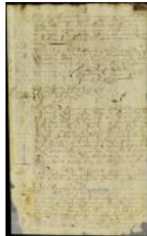
Proclamation against the sojourn of strangers within the city of New Orange (NYSA_A1881-78_V23_0063b)