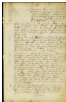
Instructions for the schout and magistrates of Brooklyn and adjoining towns on the west end of Long Island (NYSA_A1881-