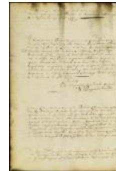
Council minutes (NYSA_A1881-78_V23_0160b)