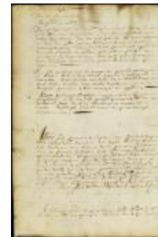
Pass for the ship Welvaert to sail to Surinam (NYSA_A1881-78_V23_0216c)