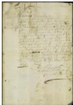
Commission of Samuel Willis and John Winthrop to prevent the Dutch forces using hostility towards the people on the east end