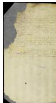
Complaint of the fiscal against _____ for having corresponded with the enemy (NYSA_A1881-78_V23_0380)