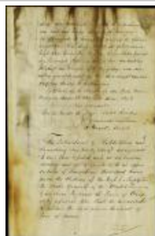
Order to the villages of Middletown and Shrewsbury to send delegates to surrender to the Dutch (NYSA_A1881-78_V23_0003)