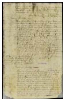
Letter from the commander to the people at the east end of Long Island (NYSA_A1881- 78_V23_0060)