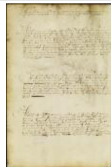
Order to levy payment from all persons refusing to pay their share of the forced loan (NYSA_A1881-78_V23_0256a)