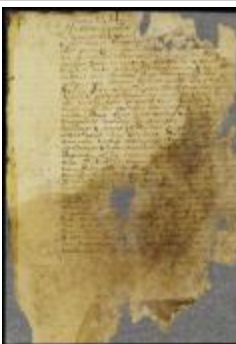
Patent of Paulus Regrinar for land on Staten Island (NYSA_A1881-78_V23_0433_21)