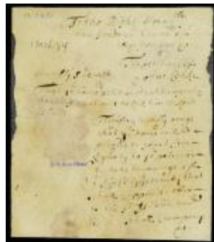
Petition of George Cooke for permission to go to Road Island (NYSA_A1881-78_V23_0316)