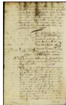
Petition presented by delegates of Oysterbay, with order granting the same (NYSA_A1881-78_V23_0024)