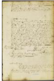
Letter from gov. Colve to the schout and magistrates of Bergen (NYSA_A1881-78_V23_0183)