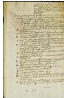
Inventory of papers delivered in the case of Jacob Varrevanger vs. Cornelis Steenwyck (NYSA_A1881-78_V23_0353)