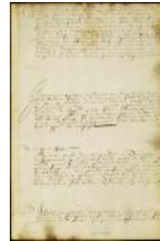
Order to pay for materials furnished for the repairs of Fort Willem Hendrick (NYSA_A1881-78_V23_0239)