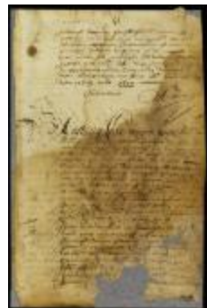
Patent of Johannis van Brugh for land in New Jersey (NYSA_A1881-78_V23_0433_41)