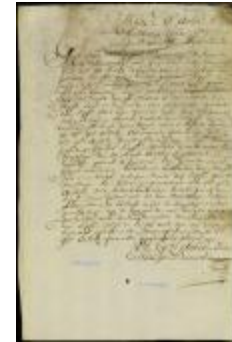
Petition of Peter Stoutenburgh for a piece of land to be used as a kitchen garden (NYSA_A1881-78_V23_0394)