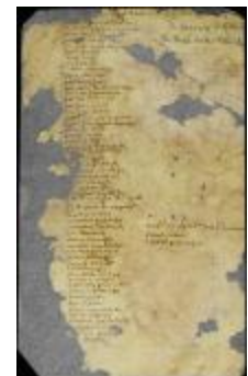
Names of persons residing between the Fresh water and Harlem and of negroes (NYSA_A1881-78_V23_0275)