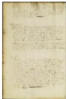
Appointment of commissioners to investigate charges against the sheriff of Staten Island (NYSA_A1881-78_V23_0201a)