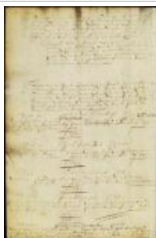
Valuation of the houses near the fort ordered to be demolished and of the lots given in stead (NYSA_A1881-78_V23_0122)