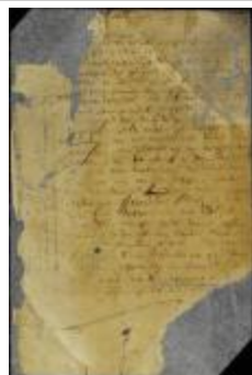
Report of referees in the case of Gabry vs. Velyn (NYSA_A1881-78_V23_0388)