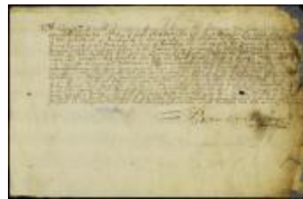
Decision of the court at Elizabethtown in the case of the town of Piscataway vs. the town of Woodbridge (NYSA_A1881-78_V23_0358)