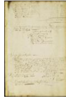
Order to the Dutch towns to send delegates to New Orange to confer with the governor (NYSA_A1881-78_V23_0229)