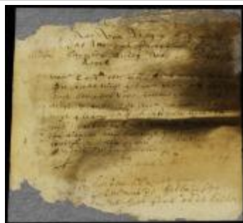
List of confiscated lands, houses and other effects left by the gov. of New Netherland at his departure (NYSA_A1881-78_V23_0424a)