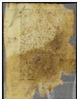
Patent of Gerrit Janse Roos for a lot in New Orange (NYSA_A1881-78_V23_0433_23)