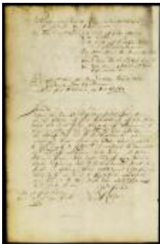
Letter from gov. Colve to Hempstead (NYSA_A1881-78_V23_0108)