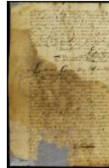
Patent of Gerrit Hendrickse for a house and lot in New Orange (NYSA_A1881-78_V23_0433_38)