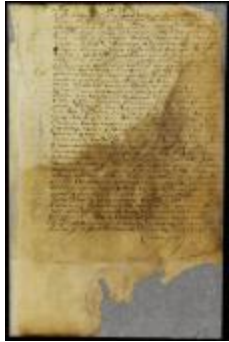
Patent of Lodewyck Post for a house and lot in New Orange (NYSA_A1881-78_V23_0433_35)