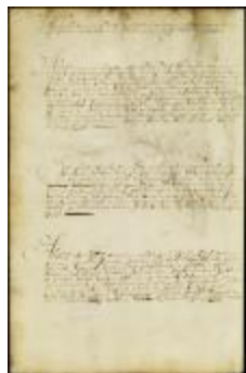
Order to settle the accounts of the late gov. Lovelace (NYSA_A1881-78_V23_0256b)