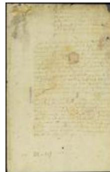
Petition of Bartholomew Appelgate and others for leave to purchase a tract of land from the Indians (NYSA_A1881-