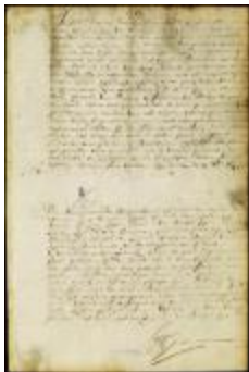
Names of the militia officers of New Orange and their oath (NYSA_A1881-78_V23_0179)