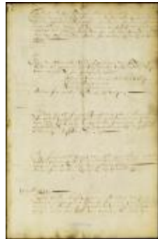
Report of capt. Knyff and the other commissioners sent to administer the oath of allegiance (NYSA_A1881-78_V23_0125c)