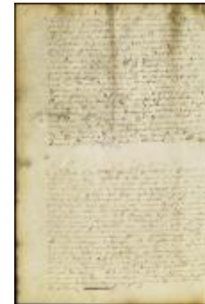
Various orders in view of a threatened attack from New England (NYSA_A1881-78_V23_0178)