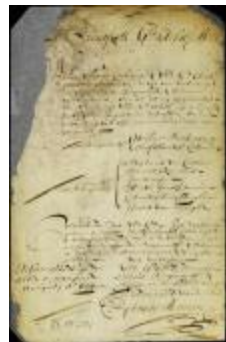
Nomination of burgomasters and schepens for New Orange for the ensuing year (NYSA_A1881-78_V23_0371)