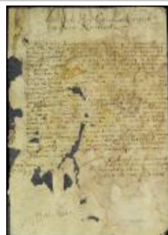
Petition of the schout and magistrates of Flushing (NYSA_A1881-78_V23_0304a)