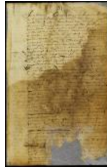
Patent of Jacobus van de Water for a house and lot in New Orange (NYSA_A1881-78_V23_0433_37)