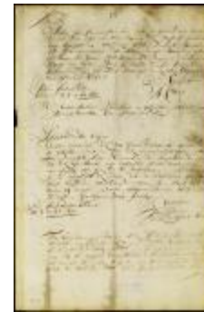
Minute of the attendance of the burgomasters of New Orange on the gov. council (NYSA_A1881-78_V23_0111b)