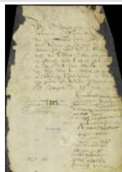
Certificate signed by sundry citizens of New Orange in favor of Anna Vermont (NYSA_A1881-78_V23_0309)