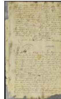
Order fixing Nicholas Bayard's salary (NYSA_A1881-78_V23_0079)