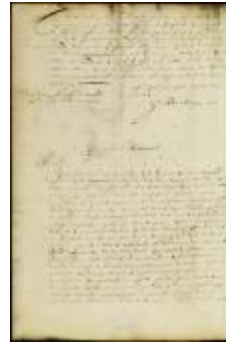
Letter from gov. Colve to gov. Winthrop (NYSA_A1881-78_V23_0162)