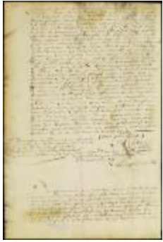
Order forbidding citizens of New Orange to pass the night out of that city without leave (NYSA_A1881-78_V23_0224)