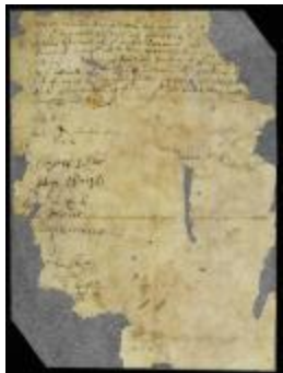
Oath of allegiance subscribed at Oysterbay, with names of the signers (NYSA_A1881-78_V23_0277e)