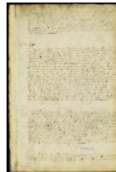
Orders on various matters relating to New Jersey; order to the magistrates of Heemstede to investigate certain charges