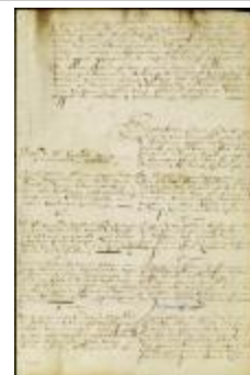
Propositions of the Mohawk Indians to gov. Colve and his answer (NYSA_A1881- 78_V23_0247)