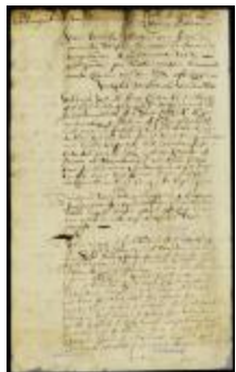
Oath of office of magistrates (NYSA_A1881-78_V23_0026)