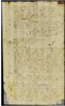
Order for the departure of ex-governor Lovelace (NYSA_A1881-78_V23_0063a)