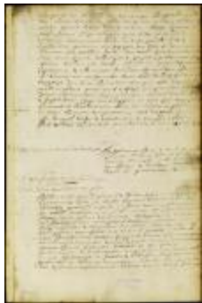
Court minutes (NYSA_A1881-78_V23_0217)