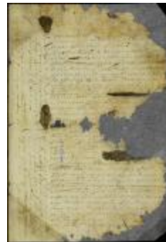
Letter from gov. Andros to gov. Colve (NYSA_A1881-78_V23_0414)