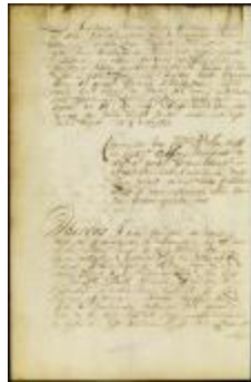
Order to the inhabitants of Fordham to send a nomination for magistrates (NYSA_A1881-78_V23_0104)