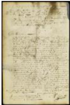
Letter from gov. Colve to the schout and magistrates of Harlem and Fordham (NYSA_A1881-78_V23_0186)