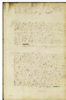
Order for payment by the W. I. Company of debts due individual creditors in New Netherland (NYSA_A1881-78_V23_0263)