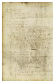
Court minutes (NYSA_A1881-78_V23_0266)