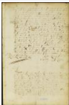
Proclamation ordering the demolition of houses adjoining fort Willem Hendrick (NYSA_A1881-78_V23_0119)