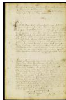
Oath to be administered to the magistrates and militia officers at Esopus (NYSA_A1881-78_V23_0145)