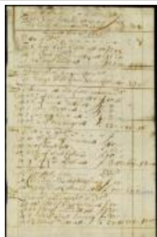
Some leaves of an account book with prices of various articles (NYSA_A1881-78_V23_0295)