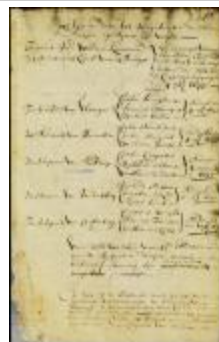
Appointment of magistrates for Flushing and adjoining English towns on Long Island (NYSA_A1881-78_V23_0045)