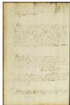
Writ of appeal from a judgment of the court of New Orange in the case of the fiscal vs. Van Deventer (NYSA_A1881-78_V23_0210a)