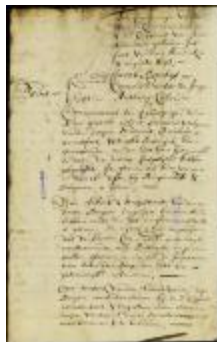
Minute of the qualifying of the magistrates of several towns (NYSA_A1881-78_V23_0020)