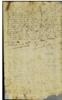
Commission of Nicholas Bayard to be secretary of the province (NYSA_A1881-78_V23_0077)