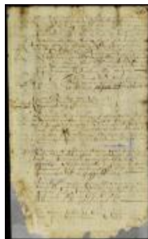
Minute of the departure of Mohawk chiefs from New Orange (NYSA_A1881-78_V23_0071)