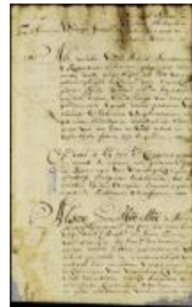
Proclamation seizing all property belonging to the English or French within the province of New Netherland (NYSA_A1881-