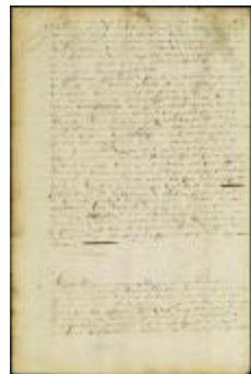
Commission of assessors to make a return of all estates in New Orange over 1,000 guilders (NYSA_A1881-78_V23_0206b)