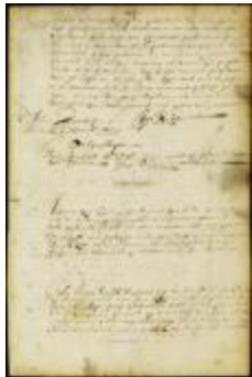
Permit to Madame Corlear to trade with the Indiginous Peoples at Schenectady and order respecting an black person enslaved