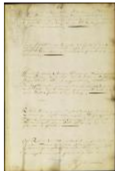
Council minutes (NYSA_A1881-78_V23_0165)