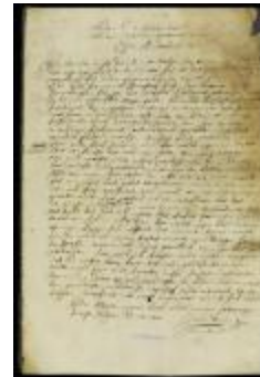
Petition of Isaac Melyn to be released from imprisonment (NYSA_A1881-78_V23_0397)