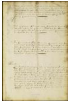
Letter from gov. Winthrop to gov. Colve (NYSA_A1881-78_V23_0161b)