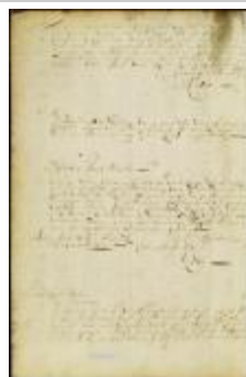
Order to schout Jacob Strycker to call on constables to account for and pay public taxes (NYSA_A1881-78_V23_0118a)