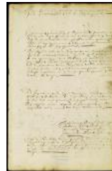
Appointment of Isaac Grevenraet to be schout at Esopus, arrests for sedition, confiscation of furs belonging to Thomas