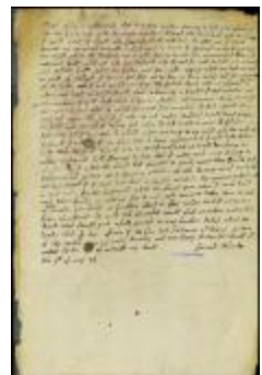
Declaration of Jonas Wood as to a conversation he had with gov. Lovelace (NYSA_A1881-78_V23_0337)