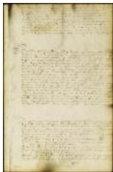
Order to survey lots in New Orange for various persons (NYSA_A1881-78_V23_0251b)