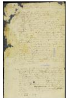
Evidence that Jan Spigelaer sold rum on the public fast and prayer day (NYSA_A1881-78_V23_0319)