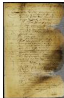
List of articles presented by capt. Knyff to the Lutheran church (NYSA_A1881-78_V23_0424b)