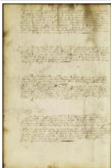
Order on a difference between the towns of Woodbrige and Piscataway (N. J.) (NYSA_A1881-78_V23_0260)