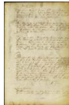
Permit to Lewis Morris; order to the magistrates at Nevesings; order for a new election at Shrewsbury (NYSA_A1881-