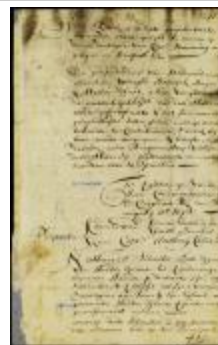
Minute of the submission of the proprietors of Shelter and Gardiner's Islands (NYSA_A1881-78_V23_0033)