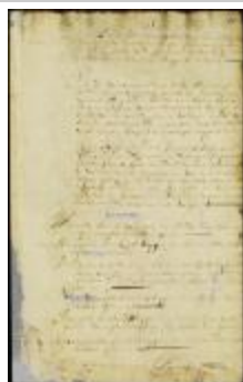
Census of Brooklyn and other towns on the west end of Long Island (NYSA_A1881- 78_V23_0051)