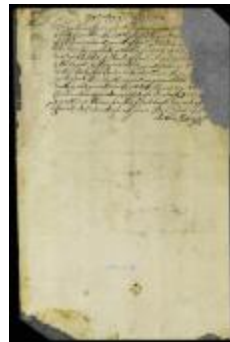
Petition of the town of Oysterbay for a certain tract of land adjoining that place (NYSA_A1881-78_V23_0363)