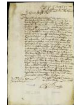
Petition of Balthazar Bayard to be appointed commissary of exports and imports (NYSA_A1881-78_V23_0333)