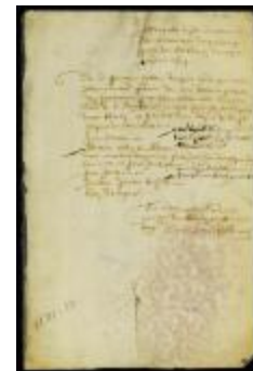
Nomination of magistrates for Hurley and Marbletown (NYSA_A1881-78_V23_0373)