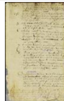
Petition for privileges from Fort Orange (Albany) (NYSA_A1881-78_V23_0047)