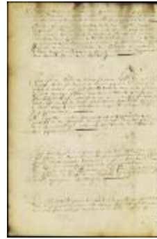
Council minute that all persons are bound to contribute to the support of the precentor and schoolmaster (NYSA_A1881-