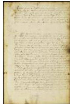
Order to capt. Ewoutsen to proceed to Nantucket and endeavor to save a small Dutch craft there (NYSA_A1881-