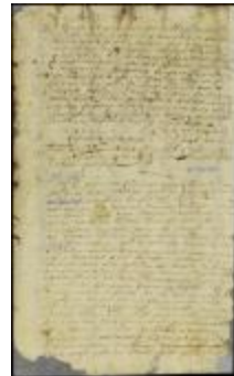
Commission of Nicholas Bayard to be receiver-general (NYSA_A1881-78_V23_0078)