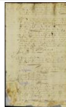
Order continuing to the colonie of Renselaerwyck privileges for one year (NYSA_A1881-78_V23_0053)