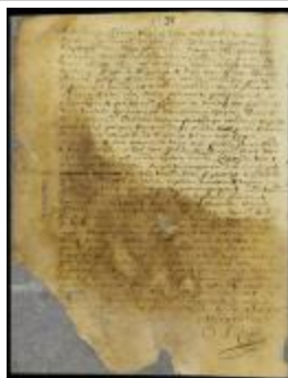
Patent of Simon Barentse Blanck for a lot in New Orange (NYSA_A1881-78_V23_0433_28)