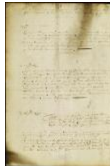
Examination of the captains of the New England ships brought in by captain Ewoutsen (NYSA_A1881-78_V23_0166)