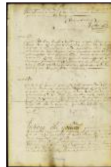
Report of the submission of Huntington and Seatalcott and of the appointment of magistrates there (NYSA_A1881-