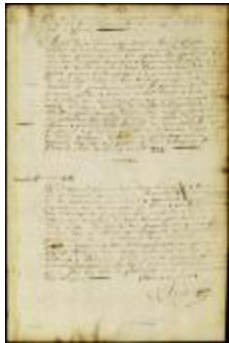
Order postponing the case of Smith vs. the town of Huntington until May (NYSA_A1881-78_V23_0215b)