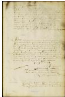
Instructions for captain Vonck (NYSA_A1881-78_V23_0191b)