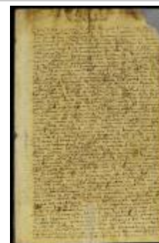
Protest of town of Huntington against the judgment of the governor and council (NYSA_A1881-78_V23_0386)