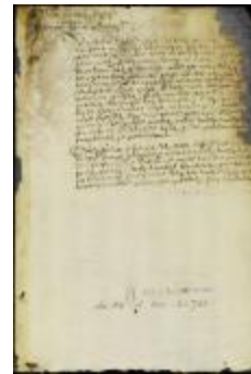
Complaint against George Demis for smuggling rum into Long Island (NYSA_A1881-78_V23_0355b)