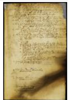
Names of persons whose houses have been removed for the purpose of strengthening Fort Willem Hendrick, with