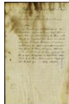
Release of the authorities of the city of New Orange from their oath to the English government (NYSA_A1881-78_V23_0004)