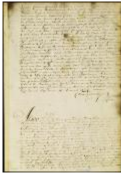
Order for a forced loan to defray the expenses incurred for the repair of the fort at New Orange (NYSA_A1881-