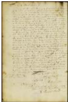
Translation of proclamation for a day of Humiliation and Thanksgiving into English (NYSA_A1881-78_V23_0158)