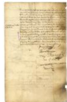
RESOLUTION to send a ship to St. Cruis for cattle (NYSA_A1883-78_V17_006b)