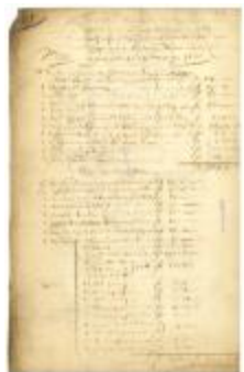
INVOICE of goods sent to New Netherland (NYS_A1883-78_V17_017)