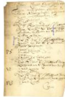
MANIFEST of animals and provisions loaded at Curaçao for New Netherland (NYSA_A1883-78_V17_062)