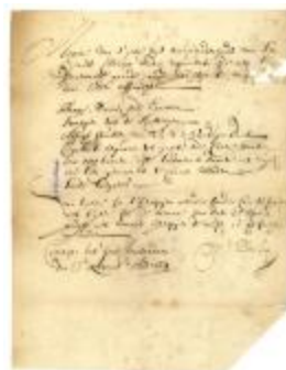
MEMORANDUM of necessities for Curaçao (NYSA_A1883-78_V17_098)