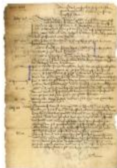
JOURNAL extracts concerning English actions along the coast of Guinea (NYSA_A1883-78_V17_088)