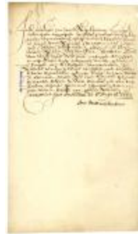
BILL OF LADING for twenty slaves loaded at Curaçao for New Netherland (NYSA_A1883-78_V17_061)