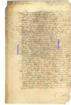
LETTER from Matthias Beck, vice-director of Curaçao to Don Jan de Salamanca, governor of Havana (NYSA_A1883-