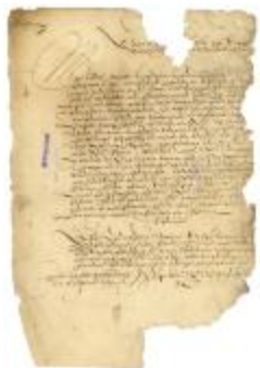
LETTER from Matthias Beck, vice-director of Curaçao to Petrus Stuyvesant (NYSA_A1883-78_V17_042)