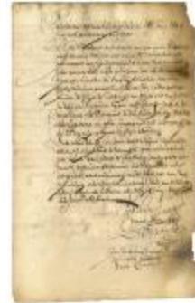
RESOLUTION concerning naval operations (NYSA_A1883-78_V17_008e)