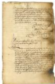
RESOLUTION to trade for horses and goats at St. Cruis, to return the blacks from Bonaire, to trade salt for beans