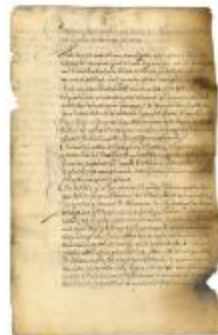
RESOLUTION concerning replacement of personnel and concerning Spaniards captured on Bonaire (NYSA_A1883-