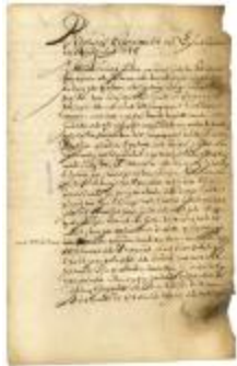
RESOLUTION to send blacks and materials to Bonaire, and bread to two cruising ships (NYSA_A1883-78_V17_009b)