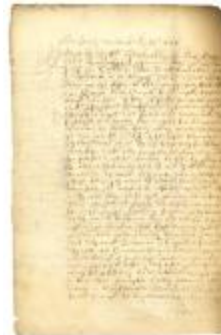
RESOLUTION concerning disposition of the cargo imported by Isaac de Fonseca (NYSA_A1883-78_V17_025b)