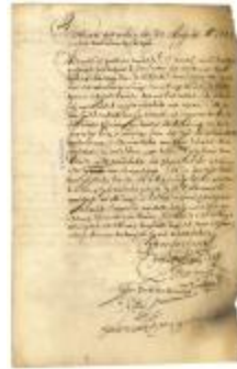
RESOLUTION concerning departure of Stuyvesant, appointment of a provisional director (NYSA_A1883-78_V17_009d)