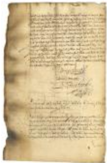
RESOLUTION to catch turtles (NYSA_A1883-78_V17_005c)