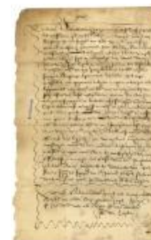
Copy of Document 92 (NYSA_A1883-78_V17_093)