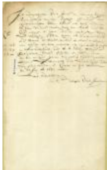
Copy of Document 72 (NYSA_A1883-78_V17_078)