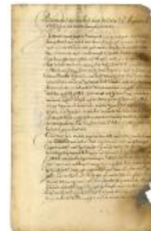
RESOLUTION to send a yacht to Aruba, concerning captured Spaniards, employment of a supercargo (NYSA_A1883-