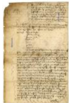
Copy of Document 89 (NYSA_A1883-78_V17_090)