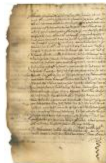
RESOLUTION to attack St. Martin (NYSA_A1883-78_V17_007d)