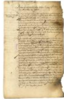
RESOLUTION concerning rations and employment of personnel (NYSA_A1883-78_V17_008d)