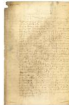
LETTER from Matthias Beck, vice-director of Curaçao to Petrus Stuyvesant (NYSA_A1883-78_V17_026)