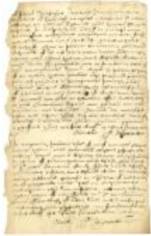
BOND of Petrus Stuyvesant concerning the purchase of provisions from the commissary on Curaçao (NYSA_A1883-78_V17_020)