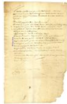
MEMORANDUM of necessities for Curaçao. (NYSA_A1883-78_V17_083)