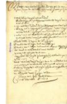
MEMORANDUM of necessities for Curaçao (NYSA_A1883-78_V17_034)