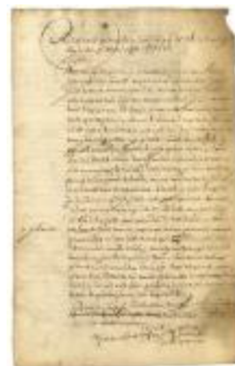
RESOLUTION to seek a harbor in Ireland for Stuyvesant's ship during his return to the fatherland (NYS_A1883-78_V17_010d)