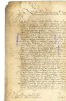
LETTER from Matthias Beck, vice-director of Curaçao to Petrus Stuyvesant (NYSA_A1883-78_V17_040)