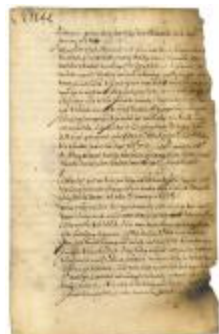
RESOLUTION to send a ship out on reconnaissance (NYSA_A1883-78_V17_007c)