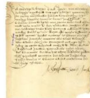
BILL OF LADING for forty slaves loaded at Curaçao for New Netherland (NYSA_A1883-78_V17_073)