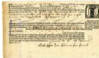
BILL OF LADING for salt loaded at Curaçao for New Netherland (NYSA_A1883-78_V17_036a)