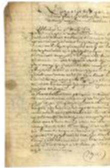
RESOLUTION concerning regulation of the salt trade at Curaçao and Bonaire (NYSA_A1883-78_V17_029b)