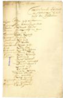
LIST of the officers and crew aboard Den Eijckenboom (NYSA_A1883-78_V17_064)