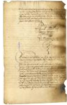
RESOLUTION concerning replacement personnel (NYSA_A1883-78_V17_004b)