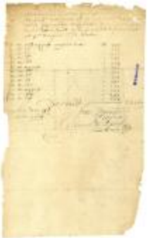
MANIFEST of sugar loaded at St. Christopher for New Netherland (NYSA_A1883-78_V17_082)