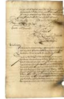
RESOLUTION concerning shipment of soldiers from Brazil to New Netherland (NYSA_A1883-78_V17_008b)