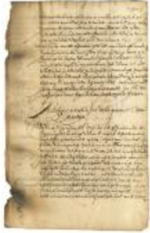
RESOLUTION concerning officers involved in attack on fort on St. Martin (NYSA_A1883-78_V17_007f)