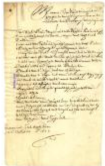
Copy of Document 34 (NYSA_A1883-78_V17_035)