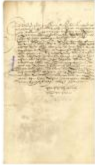
BILL OF LADING for salt loaded at Curaçao for New Netherland (NYSA_A1883-78_V17_051b)