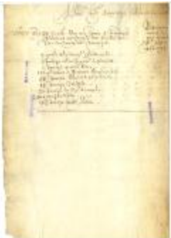
ACCOUNT (debit/credit) of Augustyn Beaulieu (NYSA_A1883-78_V17_038)