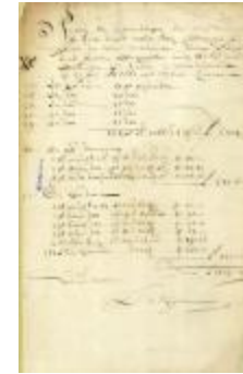
MANIFEST of cloth loaded at Curaçao for New Netherland (NYSA_A1883-78_V17_077)