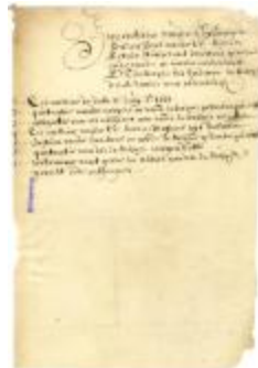
INVENTORY of papers sent from Curaçao to Petrus Stuyvesant (NYSA_A1883-78_V17_071)