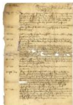
Copy of Document 88 (NYSA_A1883-78_V17_091)