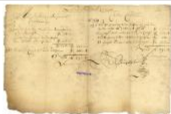
ACCOUNT (debit-credit) of Balthazar Stuyvesant (NYS A1883-78_V17_105)