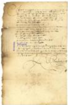
RECEIPT of provisions and materials received from New Netherland (NYS A1883-78_V17_100)