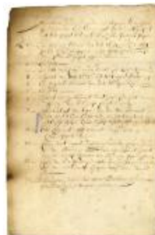
INVENTORY of papers sent to Petrus Stuyvesant (NYS A1883-78_V17_106)