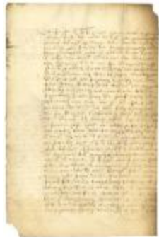
COUNCIL MINUTE concerning proposals on trade relations between Curaçao and Barbados (NYSA_A1883-78_V17_025a)