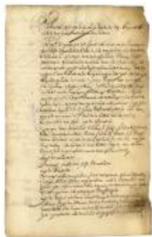
RESOLUTION to return Company servants and soldiers to the fatherland (NYS_A1883-78_V17_010b)