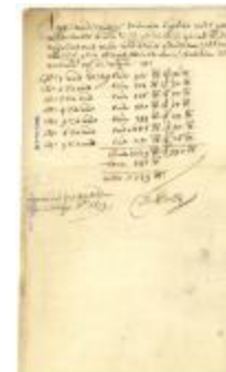
MANIFEST of goods loaded aboard the Nieuw Amstel bound for New Netherland (NYSA_A1883-78_V17_048a)