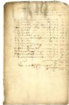
INVENTORY of goods brought to Curaçao from Guinea, 1655, destined for New Netherland (NYSA_A1883-78_V17_021)