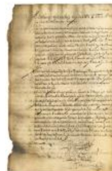
RESOLUTION concerning rationing of provisions, Spanish prisoners, employment of personnel (NYSA_A1883-78_V17_007a)