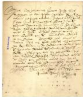
BILL OF LADING for twenty-two horses loaded at Aruba for New Netherland (NYSA_A1883-78_V17_068a)