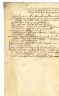
MEMORANDUM of necessities for Curaçao (NYSA_A1883-78_V17_050)