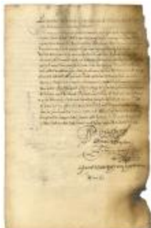
RESOLUTION to send a ship to St. Cruis for cassava (NYSA_A1883-78_V17_005g)