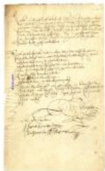
RECEIPT for provisions and materials sent from New Netherland to Curaçao aboard the Nieuw Amstel (NYSA_A1883-78_V17_045)