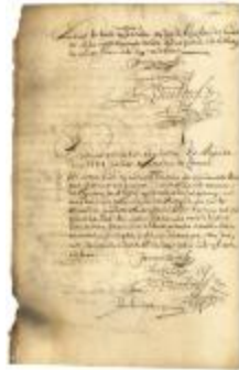
RESOLUTION expanding the council (NYSA_A1883-78_V17_009c)