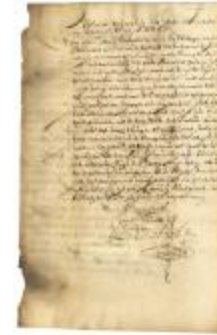
RESOLUTION to haul salt from Bonaire (NYSA_A1883-78_V17_009a)