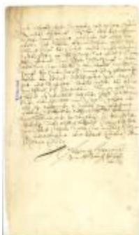
BILL OF LADING for salt loaded at Curaçao for New Netherland (NYSA_A1883-78_V17_046)