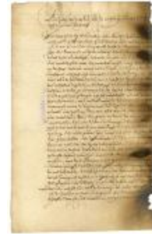
RESOLUTION concerning missions for ships present at Curaçao (NYSA_A1883-78_V17_003b)