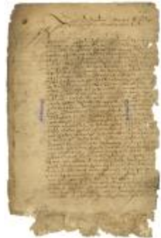
LETTER from Matthias Beck, vice-director of Curaçao to Petrus Stuyvesant (NYSA_A1883-78_V17_056)