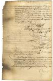
Resolution. To send people to New Netherland in the Blue Cock, as the director there is in want of assistance against the