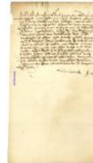
BILL OF LADING for ten slaves loaded at Curaçao for New Netherland (NYSA_A1883-78_V17_069)