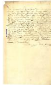
Copy of Document 73 (NYSA_A1883-78_V17_080)