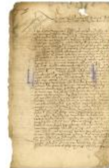
LETTER from Matthias Beck, vice-director of Curaçao to Petrus Stuyvesant (NYSA_A1883-78_V17_041)