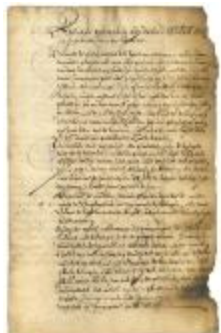
RESOLUTION concerning naval operations, establishing a day of prayer, retaining a flyboat in service, Spanish prisoners,