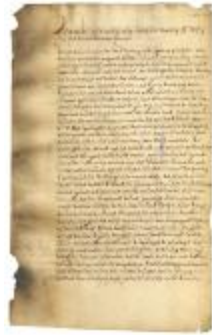
RESOLUTION concerning relief from the fatherlands (NYSA_A1883-78_V17_004a)