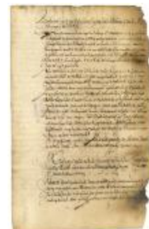
RESOLUTION to employ soldiers, regulate private skippers (NYSA_A1883-78_V17_007e)