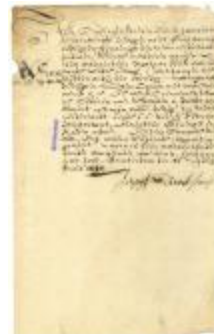
BILL OF LADING for seven cases of goods loaded at Curaçao for New Netherland (NYSA_A1883-78_V17_072)