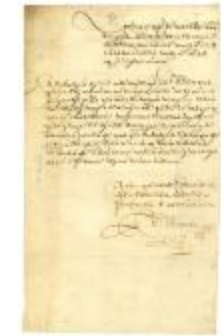
ORDER by the directors in Amsterdam prohibiting the sale of dyewood at Curaçao for thirty months (NYSA_A1883-