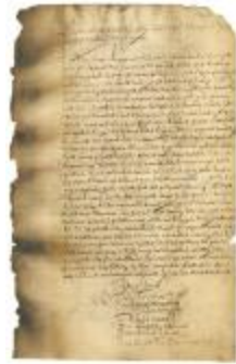
RESOLUTIONS concerning "freedoms and exemptions" granted to freemen (NYSA_A1883-78_V17_003a)