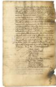
RESOLUTION to raise the siege on fort on St. Martin (NYSA_A1883-78_V17_007g)