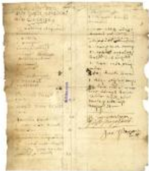
REGISTER of goods loaded at Curaçao for New Netherland (NYS A1883- 78_V17_108)