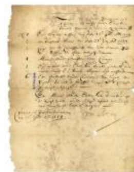
INVENTORY of papers sent to Petrus Stuyvesant (NYSA_A1883-78_V17_099)