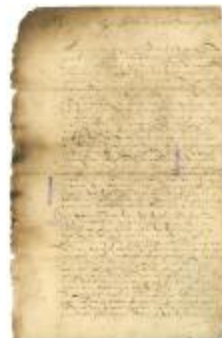
LETTER from Wilhelmus Volckeringh, domine on Curaçao, to Petrus Stuyvesant (NYS A1883-78_V17_110)