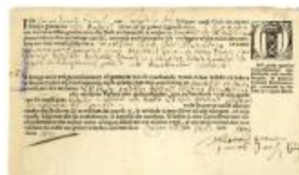
BILL OF LADING for dyewood and sugar loaded at Curaçao for New Netherland (NYSA_A1883-78_V17_047)