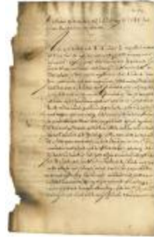
RESOLUTION to send Company servants from Brazil to New Netherland, to permit Commander Wiltschut to go to Pernambuco.