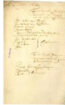
LIST of passengers leaving Curaçao for New Netherland aboard Den Eijckenboom and Nieuw Amstel (NYSA_A1883-78_V17_065)