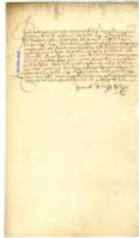
BILL OF LADING for 224 pieces of eight sent to Petrus Stuyvesant (NYSA_A1883-78_V17_060)