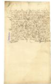
BILL OF LADING for salt loaded at Curaçao for New Netherland (NYSA_A1883-78_V17_058)