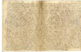
PROCLAMATION of Matthias Beck, for the capture of the pirates who seized the slaves aboard the St. Jan and other Company property (NYSA_A1883-78_V17_053)