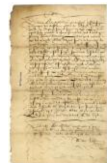
CHARTER of a captured English ship by Admiral de Ruyter to transport goods from Goree to Dutch fortress El Mina