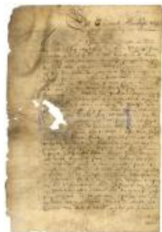
LETTER from Matthias Beck, vice-director of Curaçao to Petrus Stuyvesant and the council of New Netherland (NYSA_A1883-