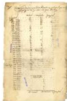
LIST of slaves who died aboard the slaver St. Jan, 30 June 1659-29 October 1659 (NYSA_A1883-78_V17_043b)