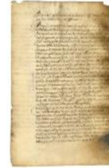
RESOLUTION to station military personnel on Bonaire, to appoint a commander for Bonaire, to seek food at neighboring islands