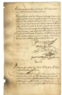
RESOLUTION concerning rations and provisions (NYSA_A1883-78_V17_006a)