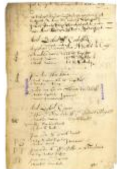
MANIFEST of goods loaded aboard the Nieuw Amstel bound for New Netherland (NYSA_A1883-78_V17_048b)