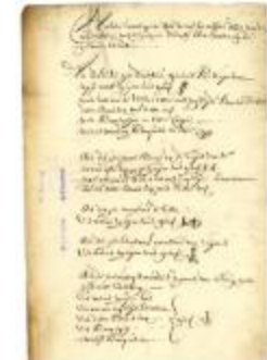
MANIFEST of goods sent from Curaçao to New Netherland (NYSA_A1883-78_V17_036b)