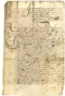
DEPOSITIONS relating to the seizure by pirates of slaves aboard the wrecked slaver St. Jan (NYSA_A1883-78_V17_052)