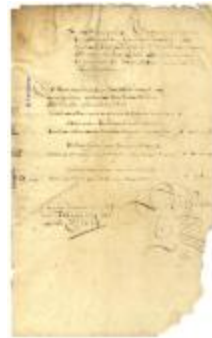
MANIFEST of goods loaded at Curaçao for New Netherland (NYSA_A1883-78_V17_084)