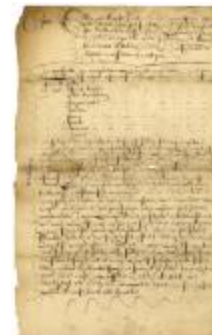
MINUTE of the war council of Admiral de Ruyter's squadron concerning the terms granted English merchant ships captured at