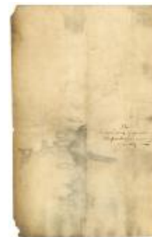
INSTRUCTIONS given by Petrus Stuyvesant to Matthias Beck, vice-director of Curaçao (NYS_A1883-78_V17_019)