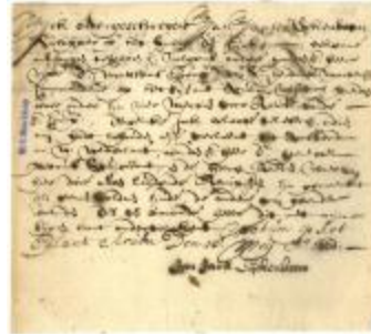
BILL OF LADING for fifty horses loaded at Aruba for New Netherland (NYSA_A1883-78_V17_068b)