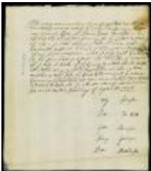
Certificate of the right of way of Hans Block through land now owned by capt. Cantwell (NYSA_A1879-78_V20_0091)