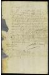
Letter from Helmer Willbank to governor Andros (NYSA_A1879-78_V20_0109)