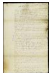
Conference between governor Andros, the magistrates at New Castle, Del. and the Indian sachems of New Jersey (NYSA_A1879- 78_V20_0062)