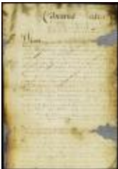
Ordinance making various rules for the government of the Delaware river (NYSA_A1879-78_V20_0098)