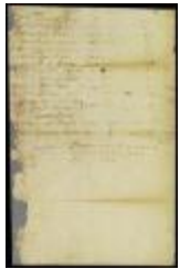
List of land patents sent to capt. Cantwell at Delaware (NYSA_A1879-78_V20_0086)