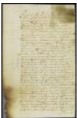
Copy of a patent granted to Peter Alricks (NYSA_A1879-78_V20_0002)