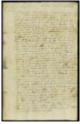
Letter from Helmer Willbank to governor Andros (NYSA_A1879-78_V20_0130)