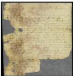
Letter from gov. Andros to the magistrates of the Whorekill and New Castle (NYSA_A1879-78_V21_0075)