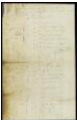
Names of the magistrates of New Castle, Upland, Whorekill and West New Jersey (NYSA_A1879-78_V21_0083)