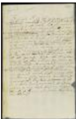
Letter from the council to the magistrates at New Castle (NYSA_A1879-78_V20_0150)