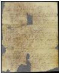
Minutes of council relative to capt. Burt's vessel (NYSA_A1879-78_V21_0064b)