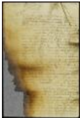
Letter from Ephraim Herman to capt. Brockholes (NYSA_A1879-78_V21_0144)