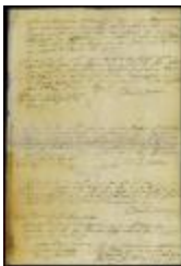
Copies of subpoenas issued in a suit against Cornelius Verhoof (NYSA_A1879-78_V21_0021c)