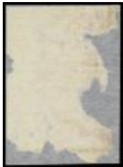
Unidentified fragment (NYSA_A1879-78_V21_0033a)