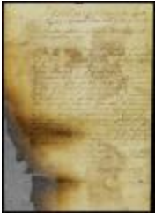
Petition of Cornelis Verhoof for leave to survey land for himself (NYSA_A1879-78_V21_0146)