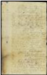
Case of Tymen Stiddem, declaring his right to certain land (NYSA_A1879-78_V21_0071)