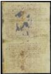
Minutes of the council in New York (NYSA_A1879-78_V20_0141)