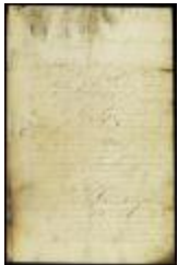
Petition of Arnlodus de La Grange relative to the island of Tinicum in the Delaware river (NYSA_A1879-78_V21_0051)