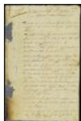
Instructions for Walter Wharton about Delaware (NYSA_A1879-78_V20_0021)