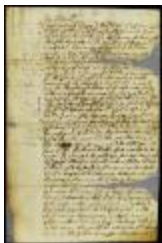
Letter from the magistrates to gov. Andros (NYSA_A1879-78_V20_0078)