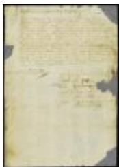
Remonstrance of inhabitants of New Castle against being compelled to repair one of the dykes (NYSA_A1879-78_V20_0072)