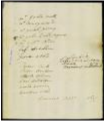
Nomination of magistrates for the Delaware river (NYSA_A1879-78_V20_0094)