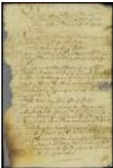
Directions for holding a special court of oyer and terminer at New Castle (NYSA_A1879-78_V20_0028)