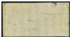
Survey of a tract of land near the Whorekill for Randell Revell at Slater Creek (NYSA_A1879-78_V20_0118a)