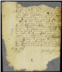
Permit to Casparus Herrmans to occupy and possess a tract of land on the Delaware river (NYSA_A1879-78_V20_0044)