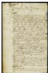
Schedule of surveyor's fees as allowed by the general assembly of Maryland (NYSA_A1879-78_V20_0106)