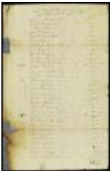
Names of those who were fined on account of the rebellion of the Long Finne and amount of the fines (NYSA_A1879-78_V20_0006)