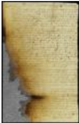
Letter from the magistrates of Deale to gov. Andros (NYSA_A1879-78_V21_0139)