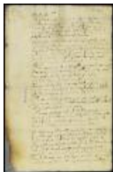
The result and reasons of the magistrates of Delaware against declaring war against the Indian murderers (NYSA_A1879-78_V20_0039)