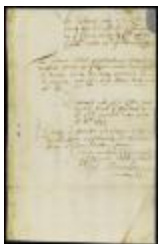
Extracts from letters from gov. Andros to the commander and collector at New Castle (NYSA_A1879-78_V20_0140)