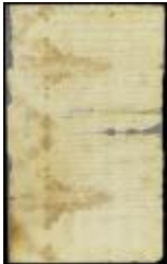
Petition of Jacobus Fabricius (NYSA_A1879-78_V20_0059)