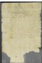
Dimensions and bounds of Prime hook near the Whorekill (NYSA_A1879-78_V20_0115b)