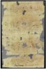
Civil and military appointments for Whorekill (NYSA_A1879-78_V20_0138)