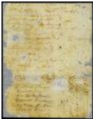
Names of persons at Salem, or Swamptown, where major Fenwick settled (NYSA_A1879-78_V21_0018)