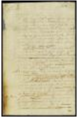
Letter from gov. Andros to the magistrates of New Castle (NYSA_A1879-78_V20_0103)