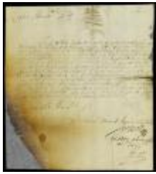
Letter from the magistrates to capt. Anthony Brockholls (NYSA_A1879-78_V21_0142)