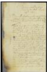
Minutes of a council held at New York incorporating New Castle, Delaware (NYSA_A1879-78_V20_0029)