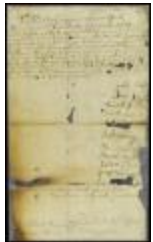
Petition of inhabitants of Crewcorne against the sale of liquor to Indians (NYSA_A1879-78_V21_0108)