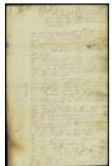
Directions for a special court to be held by the governor in Newcastle (NYSA_A1879-78_V20_0056)