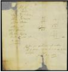
Names of prisoners shipped at New Castle (NYSA_A1879-78_V20_0008)