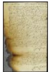
Letter from William Clark to gov. Andros (NYSA_A1879-78_V21_0118)