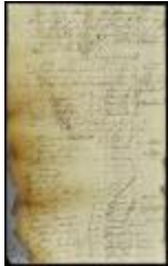
Census of the responsible housekeepers and their families residing at certain places on the Delaware river (NYSA_A1879-78_V21_0103)