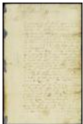
Letter from the magistrates to gov. Andros (NYSA_A1879-78_V20_0121)