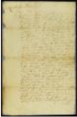
Letter from Helmer Willbank to governor Andros (NYSA_A1879-78_V20_0122)