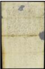
Fees of the surveyor in Maryland (NYSA_A1879-78_V20_0105)