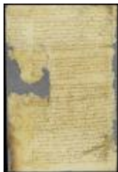
Conference with the Indians at Annockeninck respecting a recent murder (NYSA_A1879-78_V20_0014)