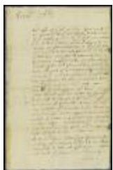
Letter from the magistrates to capt. Mattias Nicolls and the rest of the council (NYSA_A1879-78_V20_0156)