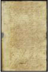
Letter from capt. Cantwell to gov. Andros (NYSA_A1879-78_V20_0084)