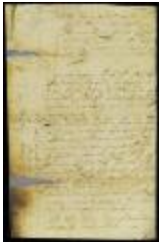
Form of holding the court at the fort in New Castle (NYSA_A1879-78_V20_0004)