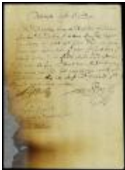
Certificate of various persons of New Castle as to the previous quiet character of Ambrose Backer's horse (NYSA_A1879-78_V21_0134)