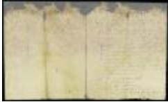
Fragment of a memorandum of the granting of warrants of survey, military commissions, etc (NYSA_A1879-78_V20_0061)