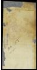
Unsigned petition for a grant of 4,000 acres of land (NYSA_A1879-78_V20_0060)