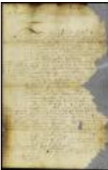
Letter from the court at New Castle to gov. Andros (NYSA_A1879-78_V20_0142)