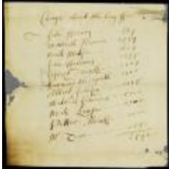
Names of persons having demands against the Long Fin (NYSA_A1879-78_V20_0007)