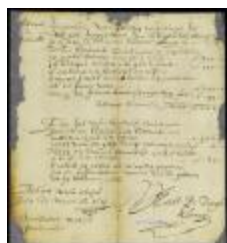
Inventory of goods saved out of Jan de Caper's ship (NYSA_A1879-78_V20_0018)