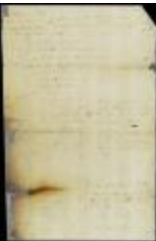
Names of the magistrates of New Castle, Upland, Whorekill and West New Jersey (NYSA_A1879-78_V21_0109)