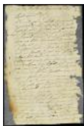
Letter from Edmund Cantwell to gov. Lovelace (NYSA_A1879-78_V20_0038)