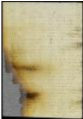
Letter from Ephraim Herman to capt. Brockholls (NYSA_A1879-78_V21_0143)