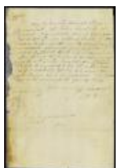
Letter from secretary Nicolls to the magistrates at Whorekill (NYSA_A1879-78_V20_0108)