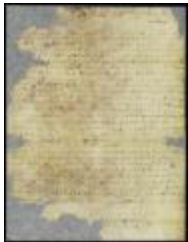
Letter from Wm. Clark to gov. Andros concerning the settlement of the district (NYSA_A1879-78_V21_0058a)