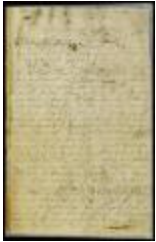
Returns of survey of several tracts of lands in Delaware (NYSA_A1879-78_V20_0101)