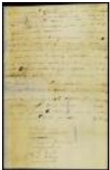
Names of the persons at the Whorekill eligible for magistrates, with list of those appointed (NYSA_A1879-78_V21_0015)