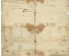
Map of Great Lots No. 15 and 16 in the Hardenbergh Patent, Sullivan County (NYSL_SC17820_B3_F6)