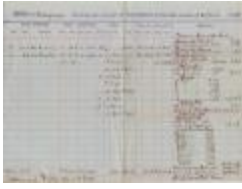
Monthly Account of Operations at Mongaup Tannery (NYSL_SC17820_B14_F10_005)