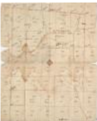
Map of Part of the Middle Division of Great Lot No. 4 of the Hardenbergh Patent, within the Town of Rockland (NYSL_SC17820_B3F4_001)