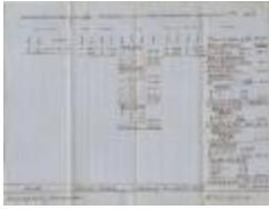
Monthly Account of Operations at Mongaup Tannery (NYSL_SC17820_B14_F10_004)