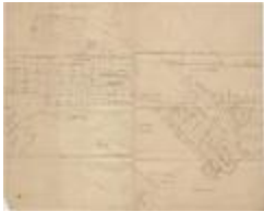
A Map of Partition of Land near the boundaries of Albany, Greene and Schoharie Counties (NYSL_SC17820_B4_F14)