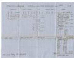
Monthly Account of Operations at Mongaup Tannery (NYSL_SC17820_B14_F10_001)