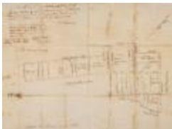
A Map of Lands applied for by Sundry persons by virtues of Improvements and occupancies there of prior to the 22 July 1782 situate in the County of Ulster in the Town of Mamakating (NYSL_SC17820_B3_F15)