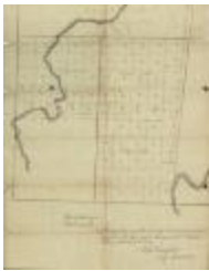
Map of Warren Township (NYSL_SC17820_B14_F15)