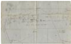
A Map and Survey of W 1/2 of [Division] No. 25 in [Great Lot] No. 2, Hardenbergh Patent (NYSL_SC17820_B3F2_001)