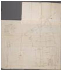
A Map of Lot No. 45 of the first division of the Minisink Patent (NYSL_SC17820_B4_F10)