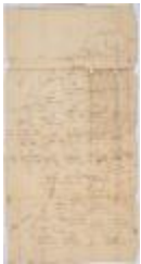
A Map of copied by Wm Cockburn of 40, 000 Acres Granted to Alexander McKee etc. in 1770. [Partitioned] Land into 40 lots for the [iii] (NYSL_SC17820_B4_F8)