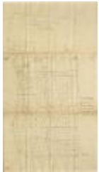
A Map of Great Lot. No. 19 in the Hardenbergh Patent (NYSL_SC17820_B3_F7)