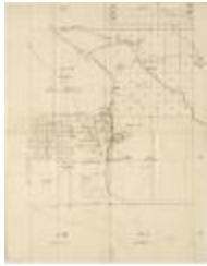
A Map of Land in Franklin Co. including Lots no. 7, 8, 10, 11, 13, 14, 16, and 17 near Dicki[n]son and Brandon (NYSL_SC17820_B4_F18)