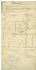
A Map of Township No. 13 in great Tract No. 1 Macomb's Purchases on the River St. Regis in the Town of Dickinson in Franklin County (NYSL_SC17820_B7_F3)