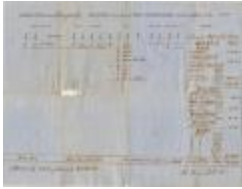
Monthly Account of Operations at Mongaup Tannery (NYSL_SC17820_B14_F10_002)