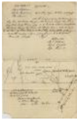
A Map of West Part Of Lot No. 15 in Great Lot No. 35 of the Hardenbergh Patent situate in the town of Hancock in Delaware County (NYSL_SC17820_B3_F14)