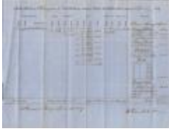
Monthly Account of Operations at Mongaup Tannery (NYSL_SC17820_B14_F10_003)