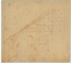
Kayaderosera Patent, Line between Lots 11 and 12. Map #892 (NYS A0273-78_892)