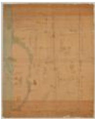
Map of Phillipstown, Dutchess County. Map #430 (NYSA_A0273-78_430)