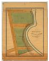
Plan for subdividing the State Lands south of Erie Canal and east of West Street. Map #453 (NYSA_A0273-78_453)