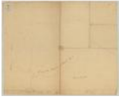
Map of Lake's Patent, adjoining the Wallumschack Patent. Map #770A (NYS A0273-78_770A)