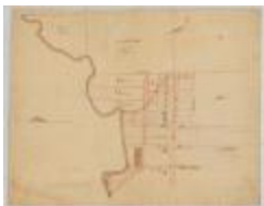
Map of the village of Johnstown, Fulton county. Map #880 (NYSA_A0273-78_880)