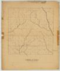
Virgil, No. 24, Cortland county. Map #854 (NYSA_A0273-78_854)