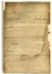
Letter from Governor Hunter to Jean Cast (NYSA_A1894-78_V058_013)