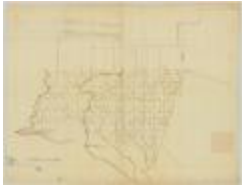
Map of subdivision of Fonda's Patent, Oneida county. Map #723 (NYSA_A0273-78_723)