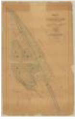
Map of Coarse Salt Lands at Syracuse, N. Y. Map #494 (NYS A0273-78_494)