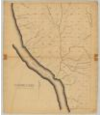
Milton, No. 17, Tompkins and Cayuga counties. Map #847 (NYSA_A0273-78_847)