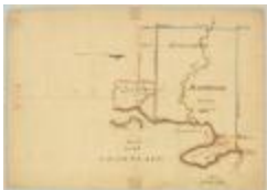
Map of township of Plattsburgh, 28,000 acres, on Lake Champlain. Map #721 (NYSA_A0273-78_721)