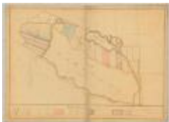
Kayaderosera Patent, 8th, 9th and 10th allotment. Part of Saratoga Patent. Map #882 (NYSA_A0273-78_882)