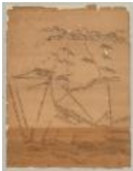
Map of the Town of Kinderhook. Map #411 (NYSA_A0273-78_411)