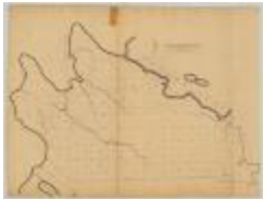
Cicero, No. 6, Onondaga county. Map #836 (NYSA_A0273-78_836)