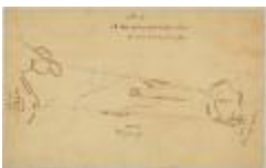
Map of Mayfield Patent, Fulton county; 15,000 acres. Map #862 (NYSA_A0273-78_862)