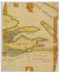
Map of Long Point on Lake George. Warren County. Map #672 (NYSA_A0273-78_672)