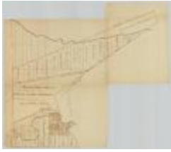
Lands of Philip Schuyler, with others adjoining. Map #811 (NYS_A0273-78_811)