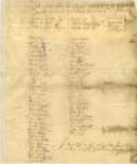
Muster Roll of the Independent Company of the Manor of Livingston in 1715 (NYSA_A1894-78_V060_069)