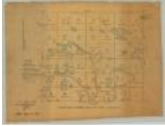
Macomb's Purchase. Great Lot No. 1, Township 20, Franklin County. Map #513 (NYSA_A0273-78_513)