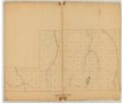
Pompey, No. 10, Onondaga county. Map #840 (NYSA_A0273-78_840)