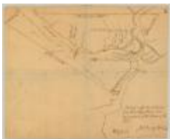
Map of lands adjoining Lake George near Fort Ticonderoga. Map #673 (NYSA_A0273-78_673)