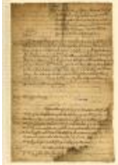
Petition of Vincentius Antonides (NYSA_A1894-78_V056_015)