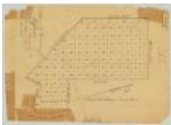
Map of Hoffman Township on Scaron lake. Essex county. Map #806 (NYS A0273-78_806)