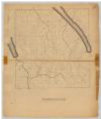
Sempronius, No. 13, Cayuga county. Map #843 (NYSA_A0273-78_843)