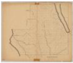
Scipio, No. 12, Cayuga county. Map #842 (NYSA_A0273-78_842)