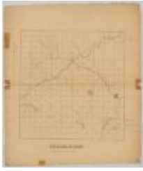
Dryden, No. 23, Tompkins County. Map #853 (NYSA_A0273-78_853)