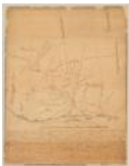
Map of the Town of Coxsackie, Green County. Map #420 (NYSA_A0273-78_420)