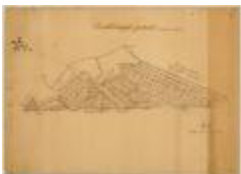
Map of Coxeborough Patent. Map #52 (NYSA_A0273-78_52)