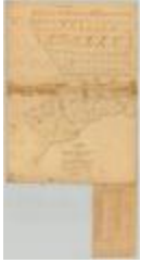
Rudolph Staley's tract, 34,000 acres, also Conradt Frank's tract, 3000 acres at Burnet Field. Map #873 (NYSA_A0273-78_873)