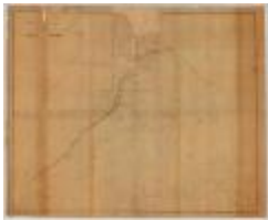
Map of the Township of West Chester. Map #424 (NYSA_A0273-78_424)