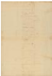
Map of Lynottville, between Goldsboro and Franklin townships. Map #773 (NYS A0273-78_773)