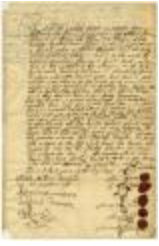
1711 Indian deed to Phillip Schuyler for use of 2,000 acres in the County of Albany (NYSA_A0272-78_V06_p042a)