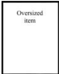
Map of Township of Lake Pleasant, Hamilton County. Map #587 (NYSA_A0273-78_587)