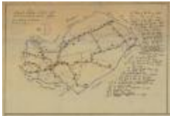
Map of the Town of White Plains, Westchester County. Map #404D (Copy) (NYSA_A0273-78_404D)