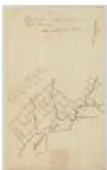
Map of land adjacent to Scroon lake. Map #810 (NYS A0273-78_810)