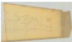
Lake George from original plot. Map #476B (NYSA_A0273-78_476B)