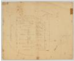
Township of Nettle Field; also Belvedere; Otsego county. Map #763 (NYSA_A0273-78_763)