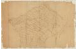
Map of Great Hardenbergh Patent. Map #140 (NYSA_A0273-78_140)