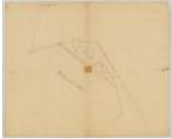
Map of Lake's Patent adjoining Wallumschack Patent. Map #770B (NYS A0273-78_770B)