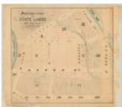
Map of Subdivisions of lands near Church Street, Syracuse. Map #458B (NYSA_A0273-78_458B)