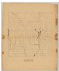
Tully, No. 14, Cortland and Onondaga counties. Map #844 (NYSA_A0273-78_844)