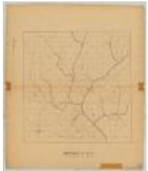
Homer, No. 19, Cortland county. Map #849 (NYSA_A0273-78_849)