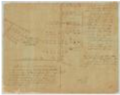
Map of lots in the village of Johnstown, Fulton county. Map #875 (NYSA_A0273-78_875)