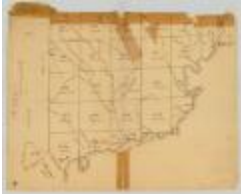
Hasenclever's Patent on Canada creek, Herkimer county, adjoins Cosby's Manor. Map #784 (NYS_A0273-78_784)