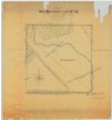
Sempronius, Lot No. 61. Cayuga County. Map #521 (NYSA_A0273-78_521)