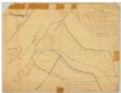
Map of land at Niagara Falls, part of Mile Strip. Map #805 (NYS A0273-78_805)