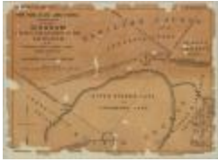
Corner Location of Benson Township, Jerseyfield Patent and Lawrence Patent. Map #512 (NYSA_A0273-78_512)