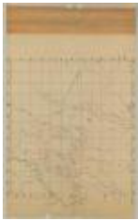
Totten and Crossfield's Purchase, Township 40 showing Raquette Lake. Map #503A (NYS A0273-78_503A)