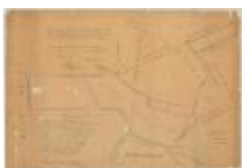
Map of several pieces of land situated in the Town of Bushwick, Kings County. Map #464 (NYSA_A0273-78_464)