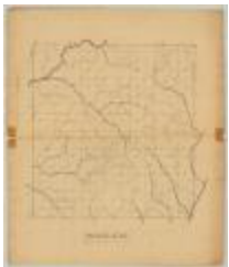
Solon, No. 20, Cortland county. Map #850 (NYSA_A0273-78_850)