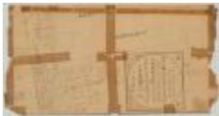
Map of land given to the Canadian and Nova Scotia Refugee's. Clinton county. Map #826A (NYS_A0273-78_826A)