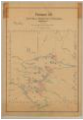
Totten and Crossfield's Purchase, Township 40 showing Raquette Lake. Map #503 (NYS A0273-78_503)