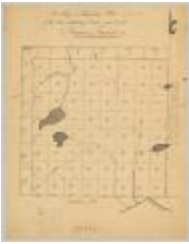
Old Military Tract, Township 3, Clinton county; granted to Benj. Birdsall. Map #799 (NYS A0273-78_799)