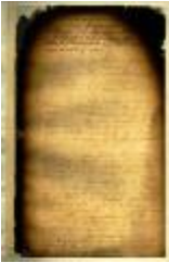
Council Minutes, May 15, 1710 (NYSA_A1895-78_V010_497)