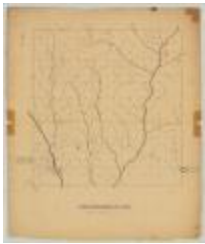
Cincinnatus, No. 25, Cortland county. Map #855 (NYSA_A0273-78_855)