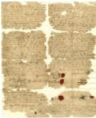
Indian deed to Rebecca Scot for land south of the Mohawk river, 1715 (NYSA_A0272-78_V06_p139b)