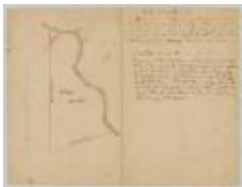
Kingsborough Patent, Lot No. 399, Fulton County. Map #885 (NYSA_A0273-78_885)