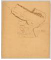
Map of Wallomsack Patent and lands adjoining, Rensselaer Co. Map #883 (NYSA_A0273-78_883)