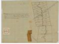
Map of Northampton Patent. also the Philip Livingston Patent. Map #639 (NYSA_A0273-78_639)