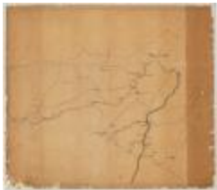
Map of the Town of Shawangunk, Ulster County. Map #433 (NYSA_A0273-78_433)