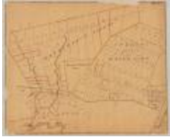
Map of Wallomsack Patent; also Snyders Patent called Mapletown. Map #884 (NYSA_A0273-78_884)