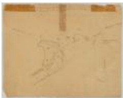
Kingsborough Patent, Lots 7, 8, 9, and 10, Fulton Co. Map #891A (NYSA_A0273-78_891A)