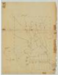
Map of Willsborough and adj. lands on Lake Champlain. Map #761 (NYSA_A0273-78_761)