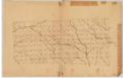
Old Military Tract, Township 6, Clinton county and Township 7, Franklin county. Map #798 (NYS A0273-78_798)