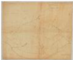
Map of Stone Arabia Patent, Alexander's Patent, Depeyster's and Van Slyck's patent. Map #879