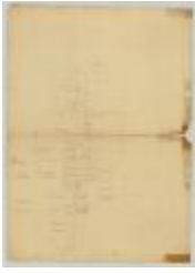
Land Patents north from the Batten kill, Washington county. Map #753 (NYSA_A0273-78_753)