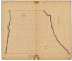
Ovid, No. 16, Seneca county. Map #846 (NYSA_A0273-78_846)