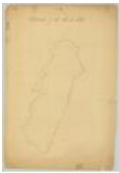
Protraction of Isle La Motte, Lake Champlain, Vermont. Map #726 (NYSA_A0273-78_726)