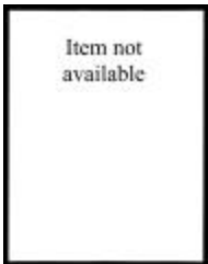
Boundary line between the Towns of Exeter and Burlington. Map #507 (NYS A0273-78_507)