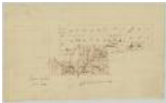
Sketch of land in Steuben township, Oneida county; copy of Cockburn's survey. Map #735 (NYSA_A0273-78_735)