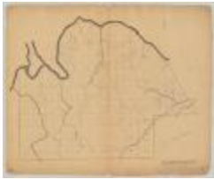
Camillus, No. 5, Onondaga county. Map #835 (NYSA_A0273-78_835)