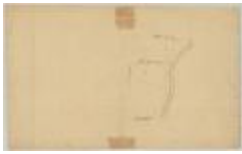
Survey of land for John Garnsey; 1000 acres. Map #765 (NYSA_A0273-78_765)