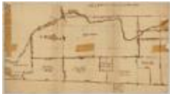
Coxe's Patent, also Hamden Tract, on Susquehanna river. Map #820 (NYS_A0273-78_820)