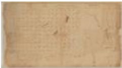
Map of Canadian Refugee Lands in Clinton county and Township of Mooers on Lake Champlain. Map #789 (NYS_A0273-78_789)