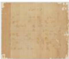
Map of Township Cato (No. 3). Map #103 (NYSA_A0273-78_103)