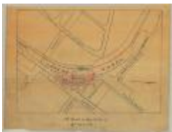
Map of Hoyt's Salt Block, 1st Ward, Syracuse. Map #508 (NYS A0273-78_508)