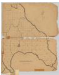
Lysander, No. 1, Oswego and Onondaga counties. Map #831 (NYS_A0273-78_831)