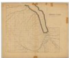
Ulysses, No. 22, Tompkins county. Map #852 (NYSA_A0273-78_852)