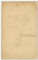
Survey of land for Alex Turner, 25,000 acres, on the Batten kill, and various others adjoining. Map #717 (NYSA_A0273-78_717)