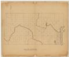
Galen, No. 27, Wayne county. Map #857 (NYSA_A0273-78_857)