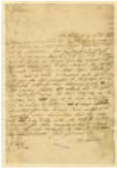
Letter from Governor Hunter to Jean Cast (NYSA_A1894-78_V055_112)