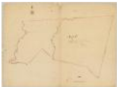
Map of Jellis Fonda, 40,000 acres, in Oneida county. Map #722 (NYSA_A0273-78_722)