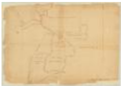
Map of various grants south and adjoining map #669. Map #670 (NYSA_A0273-78_670)