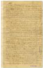
Contract of Robert Livingston for supplying Palatines with provisions (NYS A1894-78_V054_099)