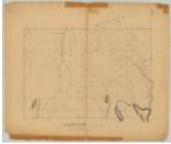
Cato, No. 3, Cayuga county. Map #833 (NYSA_A0273-78_833)