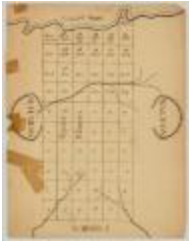
Map of Gage's Patent with Subdivisions, on Canada creek. Map #796 (NYS A0273-78_796)