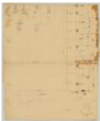
Canadian and Nova Scotia Refugee Lands, Clinton county. Map #744A (NYSA_A0273-78_744A)