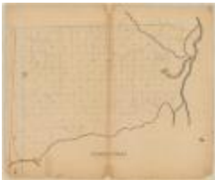
Junius, No. 26, Seneca county. Map #856 (NYSA_A0273-78_856)