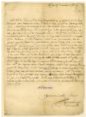
Memorandum of ammunition and seeds required for the Palatines (NYS A1894-78_V054_101b)