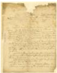
Resolution of the Council of War (NYS A1894-78_V055_061)