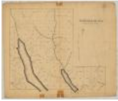
Marcellus, No. 9, Onondaga county. Map #839 (NYSA_A0273-78_839)