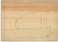
Bluff Point, in Raquette Lake, Hamilton County. Map #500 (NYS A0273-78_500)