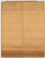
Map of a certain tract of land in Westchester County, commonly called the East Patent. Map #416 (NYSA_A0273-78_416)