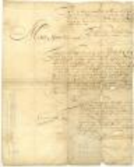
Petition of Elias Boudinot for land north of Saratoga, 1715 (NYSA_A0272-78_V06_p139a)