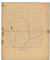
Fabius No. 13, Cortland and Onondaga counties. Map #845 (NYSA_A0273-78_845)