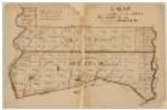
Map of Lott's Patent, also of Magin's Patent. Map #803 (NYS A0273-78_803)