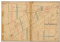
Kayaderosera Patent, Allotments Nos. 17 to 25, except No. 21, Saratoga county. Map #888 (NYSA_A0273-78_888)