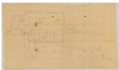
Townships of Chenango, Randolph, etc. Map #737 (NYSA_A0273-78_737)