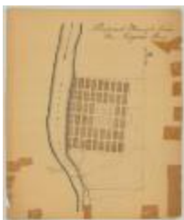
Proposed Town on Niagara river. Map #791 (NYS_A0273-78_791)