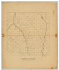
Locke, No. 18, Tompkins and Cayuga counties. Map #848 (NYSA_A0273-78_848)