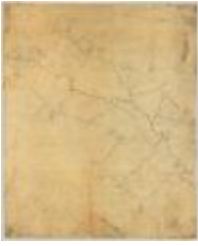
Map of Oriskany Patent. Oneida County. Map #465 (NYSA_A0273-78_465)