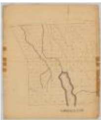
Aurelius, No. 8, Cayuga county. Map #838 (NYSA_A0273-78_838)