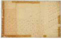
Map of part of Mayfield Patent, Fulton county. Map #870 (NYSA_A0273-78_870)