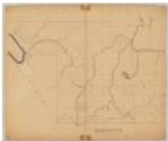
Manlius, No. 7, Onondaga county. Map #837 (NYSA_A0273-78_837)