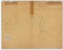
Kingsborough Patent, Lots 7, 8, 9, and 10, Fulton Co. Map #891B (NYS A0273-78_891B)