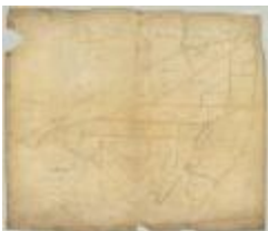
Map of Kayaderosra Patent, Saratoga county. Map #858 (NYSA_A0273-78_858)