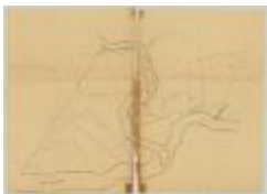
Maps of Corporation Lands at Fort Hunter, Montgomery county. Map #828 (NYS_A0273-78_828)