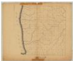
Hector, No. 21, Tompkins county. Map #851 (NYSA_A0273-78_851)