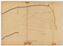
Romulus, No. 11, Seneca county. Map #841 (NYSA_A0273-78_841)