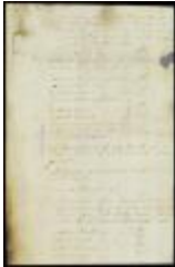
Actions entered for trial and other matters to be called up at a special court to be held at New Castle (NYSA_A1879-78_V20_0063a)