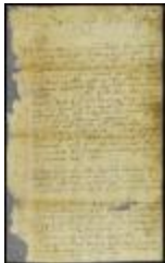
Minute of the court at New Castle of matters to present to governor Andros (NYSA_A1879-78_V20_0159)