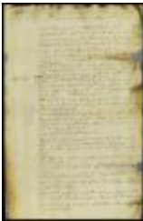
Proceedings of a special court held at New Castle, Delaware (NYSA_A1879-78_V20_0063b)