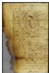
Letter from Cornelius Verhoofe (NYSA_A1879-78_V21_0126)