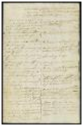
Answers given to capt. Cantwell's proposals about affairs on the Delaware river (NYSA_A1879-78_V20_0096)