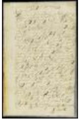
Letter from Edmund Cantwell to gov. Andros (NYSA_A1879-78_V20_0131)