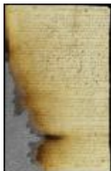
Letter from the magistrates of Deale to gov. Andros (NYSA_A1879-78_V21_0139)