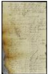
Census of the responsible housekeepers and their families residing at certain places on the Delaware river (NYSA_A1879-78_V21_0103)