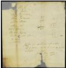
Names of prisoners shipped at New Castle (NYSA_A1879- 78_V20_0008)