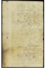
Case of Tymen Stiddem, declaring his right to certain land (NYSA_A1879-78_V21_0071)