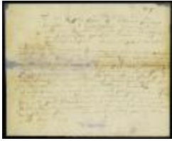
Petition of Luke Watson about an order to take up stray horses about the Whorekill (NYSA_A1879-78_V21_0009)