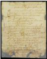
Memorandum of commissions and papers delivered to captain Cantwell (NYSA_A1879-78_V20_0045)