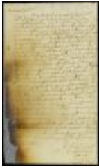
Letter from Philip Pocock to gov. Andros (NYSA_A1879-78_V21_0100)