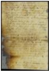
Minute of grants of land to Ephraim Herman and Lawrence Cock (NYSA_A1879-78_V21_0115)