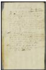
Memorandum of gov. Andros's orders in answer to various petitions (NYSA_A1879-78_V20_0099)