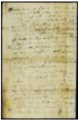
Order in regard to grist mills and recording of patents and deeds (NYSA_A1879-78_V20_0050b)