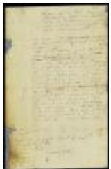
Commission for militia officers for Newcastle, Cranehook, Verdriete kook, Upland, Passayunck, Apoquemini and Whorekill, in Delaware (NYSA_A1879-78_V20_0053)