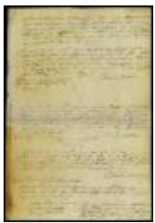
Copies of subpoenas issued in a suit against Cornelius Verhoof (NYSA_A1879-78_V21_0021c)