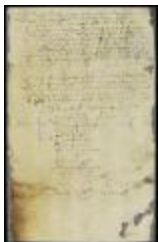
Relation about the wreck of Jan de Caper's ship and a man found murdered (NYSA_A1879-78_V20_0010)