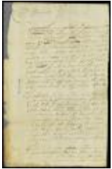
Letter from gov. Andros to capt. Cantwell (NYSA_A1879-78_V20_0089)