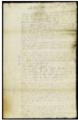
Conference between governor Andros, the magistrates at New Castle, Del. and the Indian sachems of New Jersey (NYSA_A1879-78_V20_0062)