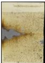
Petition of Walter Dickinson relative to a tract of land (NYSA_A1879- 78_V21_0117)