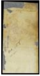
Unsigned petition for a grant of 4,000 acres of land (NYSA_A1879-78_V20_0060)