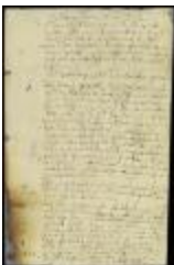
Propositions made about the fortifications at Delaware (NYSA_A1879- 78_V20_0011)