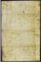
Commission of Edmund Cantwell to be surveyor in Delaware (NYSA_A1879-78_V20_0050a)