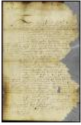
Letter from the court at New Castle to gov. Andros (NYSA_A1879-78_V20_0142)