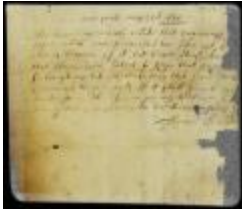
Acknowledgment concerning a certain paper which is mislaid (NYSA_A1879-78_V21_0113)