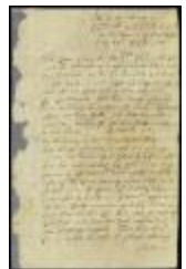
Proceedings of the commander and justices in New Castle in relation to major Fenwick (NYSA_A1879-78_V20_0155)