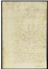
Will of William Tom of New Castle (NYSA_A1879-78_V20_0151)