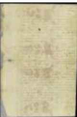
Petition to the court of for grants of land on the west side of he Delaware river (NYSA_A1879-78_V20_0134)