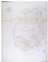
Sketch Showing the Proposed Boundary of the State Forest Reservation in the Adirondack Region, In Accordance with the Decision of Senate Special Committee on State Lands 1884 (NYSA_B1405-96_261)