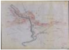
Survey of Hudson River, Sheet 1 (NYSA_B1405-96_62)