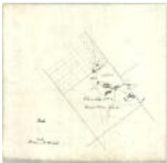
Map of Township Number 8 and Moose River Tract (NYSA_B1405-96_109A)