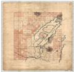
Map of Lake Placid (NYSA_B1405-96_90A)