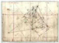
Map of Bell Hill and Various Hills and Mountains in the Adirondacks (NYSA_B1405-96_30B)