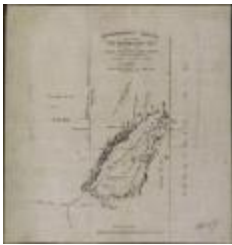
Reconnaissance Sketch Showing the "Beaver Dam Fly" in Township No. 35, Totten and Crossfield's Purchase. (NYSA_B1405-96_145)