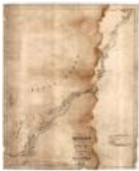
Map of Saranac River, from Union falls to Clayburg showing part of the Town of Black Brook (NYSA_B1405-96_175D)