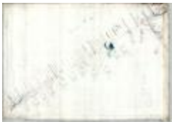
Map of Timber Lands around Watson's Corner (NYSA_B1405-96_71E)