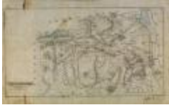
Map of Ticonderoga (NYSA_B1405-96_157)