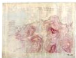
Map of Township 9 and 10 Totten & Crossfield Purchase, Hamilton County, NY (NYSA_B1405-96_107A4)