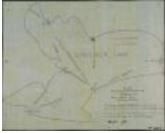
Map Showing Ice Measurements of Limekiln Lake (NYSA_B1405-96_207)