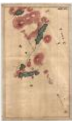
Map of the Border between Totten and Crossfield's Purchase, and Macomb's Purchase, including Burnt Lake and Salmon Lake (NYS B1405-96_2B03)