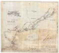
Map of a Portion of the West Branch of the Ausable River (NYSA_B1405-96_118A15)