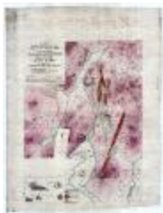
Map Exhibiting the Relative Position of the Veins of Iron Ore in and Adjoining the Village of McIntyre (NYSA_B1405-96_102A)