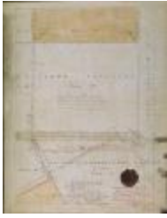
Totten & Crossfield's Purchase, {Line Between Township No. 47 and No. 50 (NYSA_B1405-96_122)