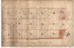
Map of a Part of Hyde Township (NYSA_B1405-96_423)