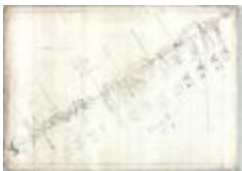
Map of Timber Lands on Totten and Crossfield Purchase and Brown's Tract (NYSA_B1405-96_71D)