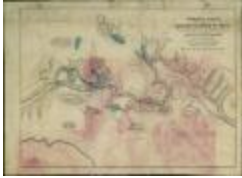
Ground Plan of Beds and Veins of Magnetic Oxide of Iron: Traversing the Hypersthene and Feldspathic Rocks at Adirondack Essex County, New York (NYSA_B1405-96_310)