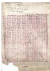
Map of Township No. 9 of the Old Military Tract in the County of Franklin (NYSA_B1405-96_98A)