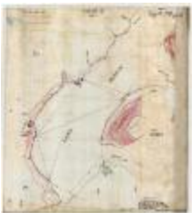
Map of a Portion of the Shore Line of Lake Placid, showing Gull Rock and Moose Island (NYSA_B1405-96_118A05)