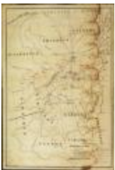
Sketch Showing the Progress of the Primary Triangulation (NYSA_B1405-96_367)