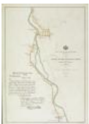
Map of the Survey of the Sacondaga [sic] River Between Station 484 and Station 551 (NYSA_B1405-96_395)