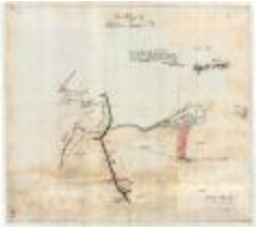
Map Showing Survey of Mud Pond and its Outlet (NYSA_B1405-96_118A13)