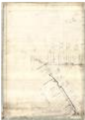
Map of Timber Lands around the Oswegatchie River (NYSA_B1405-96_71C)