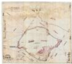
Map of Moose Island, Located in Lake Placid (NYSA_B1405-96_118A09)