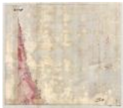
Map showing marshland, trees, and elevation, with numbered points 40-63 along an unnamed river (NYSA_B1405-96_107A1)