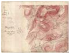
Map of Township Number 10 (Marked #3 of Series) (NYSA_B1405-96_107B2)