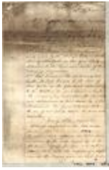
Document describing the Ceding of Lands by the St. Regis Indians (NYSA_B1405-96_150A01 attachment)