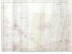
Map of Bad Luck Ponds (NYS B1405-96_04)