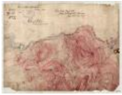
Map of Townships 9 and 10 in the Totten and Crossfield Purchase (Marked #2 of Series) (NYSA_B1405-96_107B1)