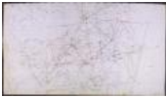
Central Adirondack Triangulation Network Diagram with Primary Triangulation Station Names (NYSA_B1405-96_46)