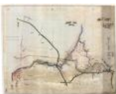
Map of a Part of Elba River with the Inlet of the Lake Placid Outlet and Adjacent Highways (NYSA_B1405-96_118A12)