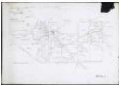
Map of Lands as Divided September 1889 (NYSA_B1405-96_239)