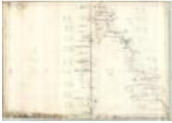
Map of Timber Lands in part of St. Lawrence County (NYSA_B1405-96_71G)