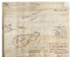
Map of Connery Pond (NYSA_B1405-96_118A)