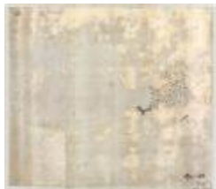
Map showing marshland and trees, with numbered points along an unnamed river, and the trail to Burnham (NYSA_B1405-96_107A2.tif)