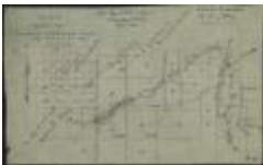
Map Showing the Location of Edmond's Ponds, Now Cascade Lakes (NYSA_B1405-96_148)