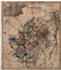
Map of the New York Wilderness (NYSA_B1405-96_119A)