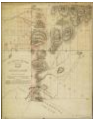
Map of State Lands in Great Lots 4 & 5 of Palmers Purchase, Rear Division (NYSA_B1405-96_42)