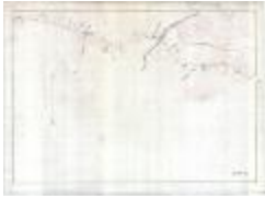
Map of a Part of Indian River (NYS B1405-96_03)