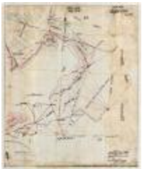
Map of a portion of the shore line of Lake Placid and Paradox Bay (NYSA_B1405-96_118A04A)