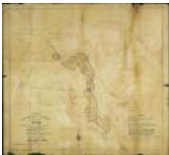
Map Showing the Closure of the Lines Run by Transit for the Determination of the Southeasterly Corner of the County of Franklin in the Line of Essex at the Preston Ponds (NYSA_B1405-96_462)