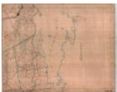
Map of the Towns of Chesterfield, Lewis, Wilsborough and Essex (NYSA_B1405-96_150A06)