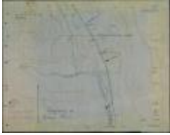
Topographical map of the Salmon River, Clinton County, N.Y. (NYSA_B1405-96_18)