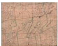
Map of the Towns of Au Sable, Franklin, Black Brook, Chesterfield, Lewis, Jay, Wilmington, Keene, North Elba, and St. Armand (NYSA_B1405-96_150A07)