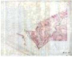
Map of Township Number 10 (NYSA_B1405-96_107A5)