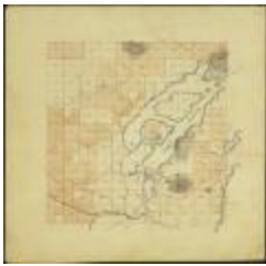
Lake Placid (NYSA_B1405-96_346)