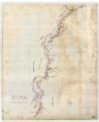
Map of the Western Branch of the Ausable River (NYSA_B1405-96_118AE)