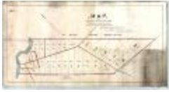
Map of Land Ceded by the St. Regis Indians to the State of New York in the year 1824 containing 1023.34 acres (NYSA_B1405-96_150A01)