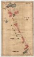
Map of the Border between Totten and Crossfield's Purchase, and Macomb's Purchase (NYS B1405-96_2B02)