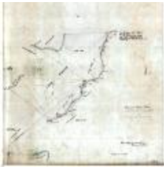
Map of Eastern Coast of Lake Placid (NYSA_B1405-96_118A01)