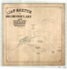
Map of Big Moose Lake and the Adjacent Lakes, Ponds, Streams and Trails (NYSA_B1405-96_14)