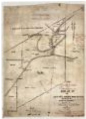
Map of Lot No. 31 Rogers Patent in Town of North Hudson (NYSA_B1405-96_105A.tif)