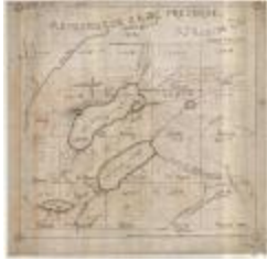
Map of the Adirondack Game Preserve, owned by the J&J Rogers Co., AuSable Forks (NYSA_B1405-96_75)