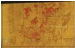
Map of the Adirondack Forest and Adjoining Territory (NYSA_B1405- 96_512)