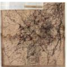
Map of the New York Wilderness (Damaged) (NYSA_B1405-96_119B)