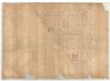
Map of Bayard's or Freemason's Patent (NYSA_B1405-96_223)