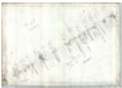
Map of Timber Lands between Totten and Crossfield's Purchase and Brown's Tract (NYSA_B1405-96_71B)