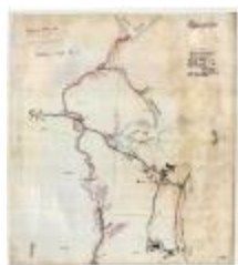
Map of Part of the Outlet of Lake Placid Showing False Outlet (NYSA_B1405-96_118A11)