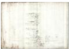
Map of Timber Lands around the Township of Burnt Hill (NYSA_B1405-96_71F)