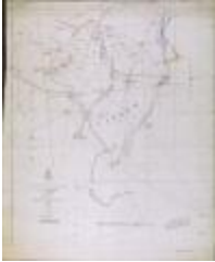
Progress Sketch of the Primary Triangulation (NYSA_B1405-96_125)