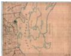
Map of the Towns of Plattsburgh, Beekmantown, Schuyler Falls, Peru and Au Sable (NYSA_B1405-96_150A04)