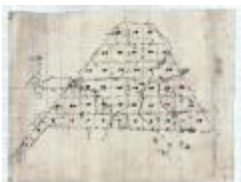
Map of Long Pond (NYSA_B1405-96_11B)