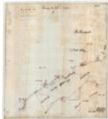
Map of the Shore Line of Lake Placid, showing Echo Bay (NYSA_B1405-96_118A07)