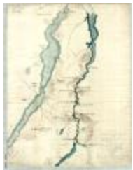
Map of the Inlet of Lake Champlain and Part of Lake George (NYSA_B1405-96_252)