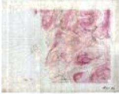
Map of Dunning Mountain (NYSA_B1405-96_107A6)