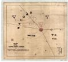
Map of the North West Corner of Totten and Crossfield (NYSA_B1405-96_5B)