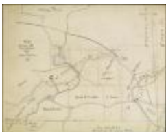
Map Showing the True Boundaries of Lands at Ampersand and Saranac (NYSA_B1405-96_366)