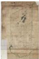
Map of Forest Port (NYSA_B1405-96_7A)