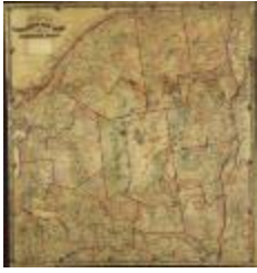
New Map of Northern New York Including the Adirondack Region (NYSA_B1405-96_413)