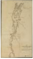
Map of French and English Grants on Lake Champlain (NYSA_B1405-96_202)