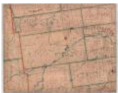
Map of the Towns of Plattsburgh, Beekmantown, Schuyler Falls, Peru and Au Sable, Ellenburg, Bellmont, Franklin, Black Brook, Saranac and Dannemora