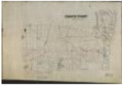
Map of Crown Point (NYSA_B1405-96_170)