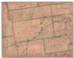
Map of the Towns of Plattsburgh, Beekmantown, Schuyler Falls, Peru and Au Sable, Ellenburg, Belmont, Franklin, Black Brook, Saranac and Dannemora (NYSA_B1405-96_150A05)