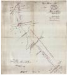
Totten & Crossfield Purchase and Maccomb's Purchase (NYSA_B1405-96_103A)