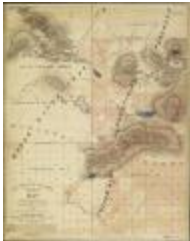
Map Showing the Location of the NW Corner of Township No. 3, in Totten and Crossfield's Purchase on the Boundary of Township No. 8, Moose River Tract Including the West Canada Lakes (NYSA_B1405-96_245)