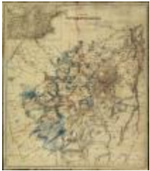
Map of the New York Wilderness [showing triangulations of the Adirondack Mountains] (NYSA_B1405-96_454)