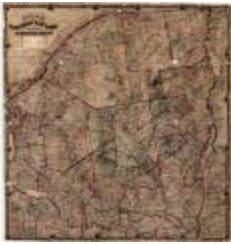
Map of Northern New York Including the Adirondack Region (NYSA_B1405-96_424)