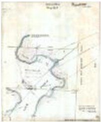
Map of a Portion of the North East Shore of Lake Placid (NYSA_B1405-96_118A03)