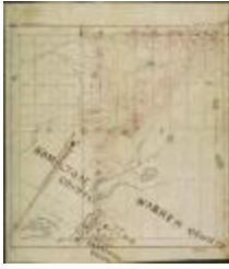
Map of State Lands in Great Lots No.4 & No.5 of Palmers Purchase, Rear Division (NYSA_B1405-96_155)