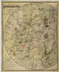
Map of the Adirondack Wilderness (NYSA_B1405-96_6)