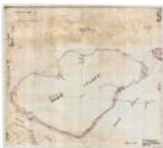
Map of the East Shore and outlet of Mirror Lake (NYSA_B1405-96_118A10)