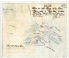
Map of a Portion of Lake Placid showing Pollywog Bay, Index Point, and Sunset Strait (NYSA_B1405-96_118A04attachment)