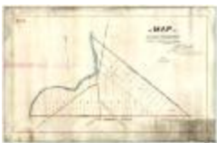
Map of Land Ceded by the St. Regis Indians to the State of New York in the Year 1825 containing 888.66 acres (NYSA_B1405-96_150A)