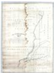
Map Showing the Division Lines Between the Arthurborough, Nobleborough and Vrooman Patents (NYSA_B1405-96_43A)