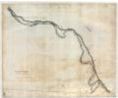
Map of the West Branch of the Ausable River (NYSA_B1405-96_118AF)