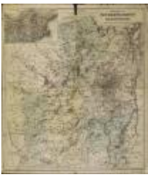
Colton's Map of the New York Wilderness and the Adirondacks (NYSA_B1405-96_7)