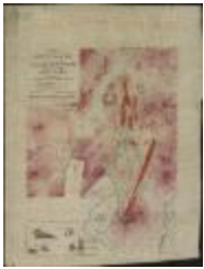
A Map exhibiting the relative position of the Veins of Iron Ore in and adjoining the Village of McIntyre, Essex County, New York, belonging to the Adirondack Iron and Steel Co. (NYSA_B1405-96_311)