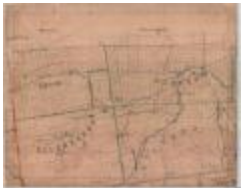
Map of the Towns of Clinton, Altona, Ellensburgh and Moders, Located in Clinton County (NYSA_B1405-96_150A03)