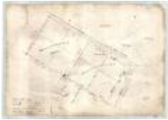
Map of Nobleborough and Arthurborough (NYSA_B1405-96_126)