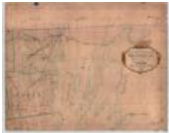
Map of North Eastern New York near Lake Champlain (NYSA_B1405-96_150A02)