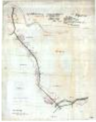
Map Showing a Survey of the Highway from Chellis Place (NYSA_B1405-96_118A14)