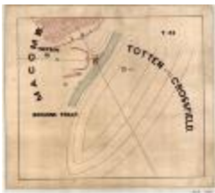
Map of Brown's Tract (NYSA_B1405-96_6B)