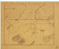
Map of Township No.12, Old Military Tract and Town of North Elba (NYSA_B1405-96_11)