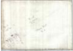
Map of Timber Lands near Totten and Crossfield's Purchase and Brown's Tract (NYSA_B1405-96_71A)