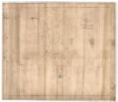
Plan of the Carthage and Champlain Road from Beach's Lake to Raquette Lake (NYSA_B1405-96_21B)