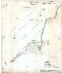
Map of a portion of the East shore of Lake Placid, north east from Pulpit Rock to a point south east from Hawk Island (NYSA_B1405-96_118A02)