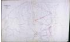
Progress Sketch of the Primary Triangulation (NYSA_B1405-96_174)