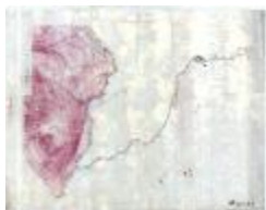
Map of Oak and Pine Mountain near the confluence of the Lake Pleasant and North branches of the Sacandaga River (NYSA_B1405-96_107A3)