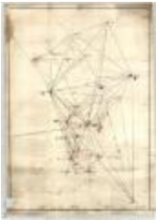
Map of Mountains in Saratoga County (NYSA_B1405-96_142A)