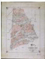
Map of Township No. 8, John Brown's Tract (NYSA_B1405-96_179)