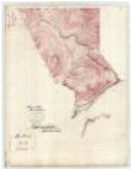
Map of Township Number 10 (Marked #4 of Series) (NYSA_B1405-96_107B3)