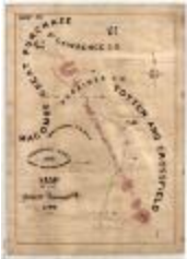
Map Showing the Western Boundary Line of Totten and Crossfield's Purchase (NYS B1405-96_2B01)