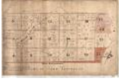
Map of a Part of Hyde Township (NYSA_B1405-96_423)