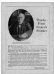
Thanks from France's Premier