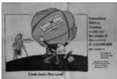
"Uncle Sam's New Load?" (NYSA_A3167-78A_B7_Compulsory_Service_Cartoon)