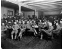
World War I soldiers stationed at Watervliet Arsenal, YMCA. Sunday Afternoon Tea