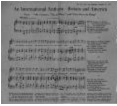
International Anthem (NYS A3167-78A_B7_WW1_Material_07)