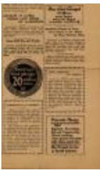
Food Rationing 2 (NYS A3167-78A_B7_WW1_Material_09_p2)