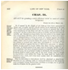
An Act for granting a more effectual relief in cases of certain trespasses (NYSA_13036-78_L1783_Ch031_printed)