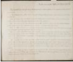
An Act concerning the rights of the citizens of this state (NYSA_13036-78_L1787_Ch001)