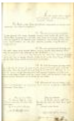
An act for the more effectual protection of the property of married women (NYSA_13036-78_L1848_Ch200)