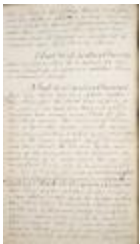
An Act relative to slaves and servants (NYSA_13036-78_L1817_Ch137_p2)