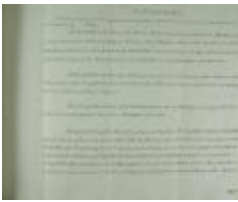
An Act concerning slaves (NYSA_13036-78_L1788_Ch040)