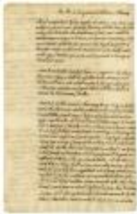
An Act for the gradual abolition of slavery (NYSA_13036-78_L1799_Ch062)