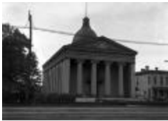
Montgomery County Courthouse located in Fonda, New York. September 30, 1936 (NYS_A0245-77_Montgomery_B09_31)