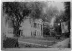
Site of old Fort Stanwix in Rome, New York, 1926 (NYS_A0245-77_Oneida_B10_34)