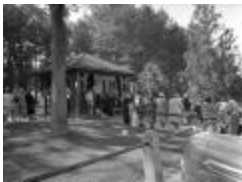
Hathorn Spring in Saratoga Springs, New York. August 11, 1941