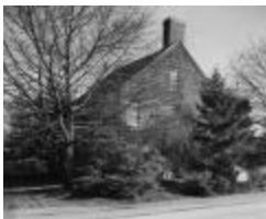
Walt Whitman Home located in Huntington, New York (NYS_A0245-77_Nassau_B09_53)