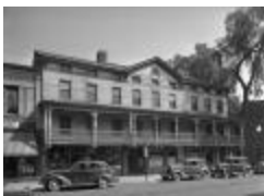
Medbery Hotel in Ballston Spa, New York. July 25, 1941 (NYS_A0245-77_Saratoga_B13_50)