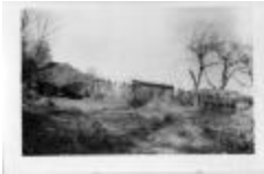
Camouflaged Tank (NYSA_A3166-78_B1_F18_HedgeTank)