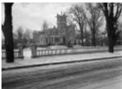
"The Pink House", Wellsville (NYSA_A0245-77_Allegany_B02_12)