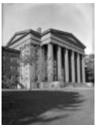
Utica Psychiatric Center located in Utica, October 7, 1937 (NYS A0245-77_Oneida_B10_33)