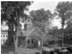
Fulton County Courthouse, in Johnstown, New York. September 10, 1941 (NYSA_A0245-77_Fulton_B04_31)