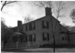
Kent-Delord House, Headquarters of the British Army in Plattsburgh, New York. May 12, 1937.