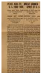
Food Rationing 7 (NYS A3167-78A_B7_WW1_Material_09_p7)