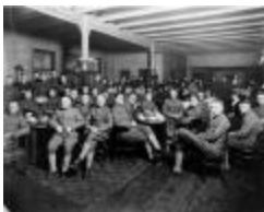
World War I soldiers stationed at Watervliet Arsenal, YMCA. Sunday Afternoon Tea