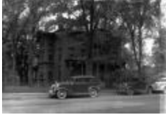
Langdon House, Church and Main Streets in Elmira, New York. September 5, 1927 (NYSA_A0245-77_Chemung_B02_36)