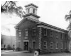
Cobblestone Masonic Temple in Warsaw, New York (NYS_A0245-77_Wyoming_B25_32)