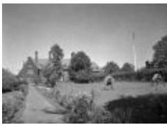
Sarah Lawrence College in Yonkers, New York