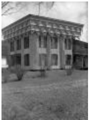
"Wedding Cake House" in Georgetown, New York. April 19, 1938