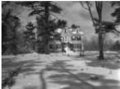
Van Buren House in Kinderhook, March 7, 1947 (NYSA_A0245-77_Columbia_B02_59)