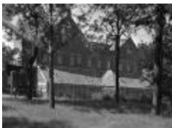
Home of Charles Steinmetz in Schenectady, New York. June 21, 1941