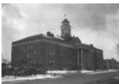
International Business Machines Corporation, Johnson City, New York. February 28, 1937