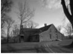
Schuyler Home - "The Flatts" in Watervliet, November 20, 1941 (NYSA_A0245-77_Albany_B01_09)