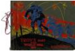
"Troy's Part in the World War 1918" (NYSA_A3167-78A_B1_F1_Troy)