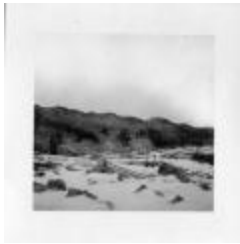
Fort Douaumont (NYSA_A3166-78_B1_F18_FortDouaumont)