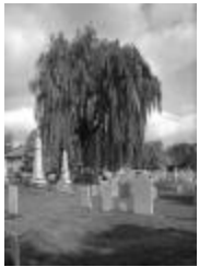
Pioneer Cemetery in Canandaigua, New York. October 11, 1937 (NYS_A0245-77_Ontario_B11_30)