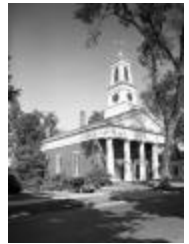
Trumansburg First Presbyterian Church of Ulysses in Trumansburg. August 28, 1938 (NYSA_A0245-77_Tompkins_B21_6)