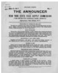
Food Supply Poster (NYSA_A3167-78A_B5_WWICommittee_PatriotismThroughEducation)