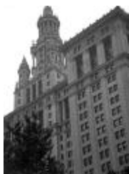
Manhattan Municipal Building in New York City, June 26, 1938 (NYS A0245-77_NewYork_B09_76)