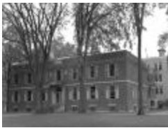
Crandall Public Library in Glens Falls, New York. September 28, 1938