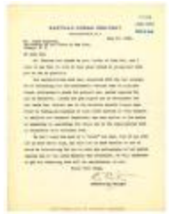
Eastman Kodak's Contributions to the War Effort (NYSA_A3166-78_B1_F05_EastmanKodak)