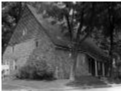
Jean Hasbrouck House in New Paltz, New York