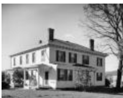
Tavern and Shoemaker in Herkimer County. August 23, 1941 (NYSA_A0245-77_Herkimer_B04_61)