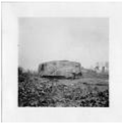
Captured German Tank (NYSA_A3166-78_B1_F18_GermanTank)