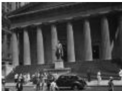
United States Treasury Building in New York City, August 6, 1938 (NYS A0245-77_NewYork_B09_78)