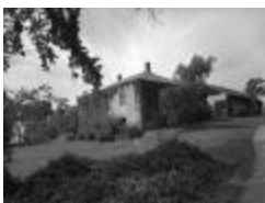
Gouverneur Morris' home in Gouverneur, New York. September 20, 1937 (NYSA_A0245-77_SaintLawrence_B12_40)