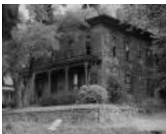
Clara Barton's Home in Dansville, New York (NYSA_A0245-77_Livingston_B05_58)