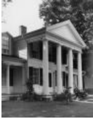
Barlow House in Wyoming Village, New York (NYS_A0245-77_Wyoming_B24_11)