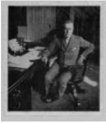
Woodrow Wilson (NYSA_A3167-78A_B5_WWI_RedCrossPortraits_Wilson)