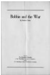
"Bobbie and the War" (NYSA_A3167-78A_B5_Bobbie)