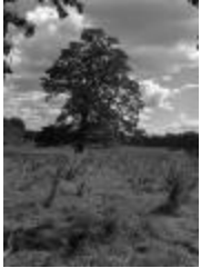
Site of the Treaty of Big Tree in Geneseo, New York (NYS A0245-77_Livingston_B07_12)