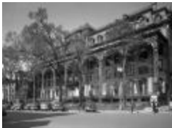
United States Hotel in Saratoga Springs, New York. May 15, 1939