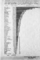
Total Troops Furnished by each State and Territory During the War, April 7, 1917 to November 11, 1918. Including Regular Army, National Guard, Navy, Marine Corps, Coast Guard and U. S. Guards (NYSA_A3166-78_B1_F16_Troops_Bargraph)