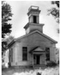
Old Johnsonburg Congregational Church in Sheldon, New York (NYSA_A0245-77_Wyoming_B23_7)