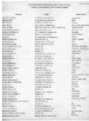
List of Contractors for Aircraft Materials Within the State of New York (NYSA_A3166-78_B2_F02_Contractors)