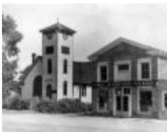
Pike Grange Hotel in Pike, New York (NYSA_A0245-77_Wyoming_B23_41)