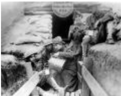
World War I - Salvation Army (NYSA_A3167-78A_B2_SalvationArmy)