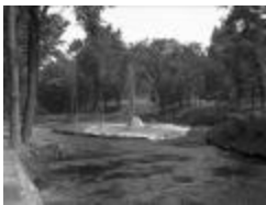
Hayes Spring Geyser in Saratoga Springs, New York. July 1941