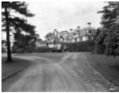
Wadsworth Homestead, Geneseo (NYS A0245-77_Livingston_B08_32)