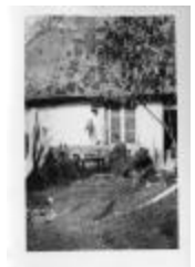
Machine Gunners at Meal Time (NYSA_A3166-78_B1_F18_MachineGunners)