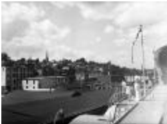
Photograph of Newburgh from Day Line Steamer. July 1937 (NYS_A0245-77_Orange_B11_36)