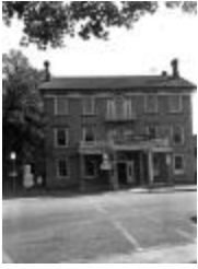
Masonic Temple in Caledonia, New York (NYS A0245-77_Livingston_B06_30)