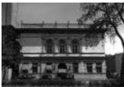
Hart Memorial Library in Troy, New York. September 23, 1936