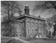
Old Boy's Academy in Albany, 1817 (NYSA_A0245-77_Albany_B01_14)