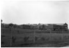
Ann Lee Home - Albany Airport, September 11, 1936 (NYSA_A0245-77_Albany_B01_11)