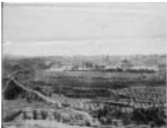
Jerusalem countryside (NYSA_A3167-78A_B2_F8_03)