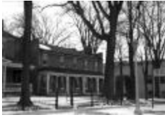
Red Brick Tavern in Gouverneur, New York. February 28, 1937 (NYS_A0245-77_SaintLawrence__B12_33)