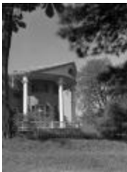
The "Turtle" House, Greenport, New York, October 4, 1938. (NYSA_A0245-77_Columbia_B02_69)