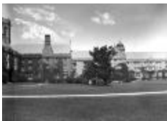
Emma Willard School in Troy, New York. September 26, 1936 (NYSA_A0245-77_Rensselaer_B12_15)