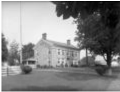
Swarts Tavern in Schoharie, New York. August 31, 1937