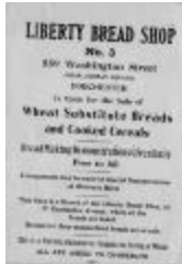
Liberty Bread Shop (NYSA_A3167-78A_B6_Reports_Patriotic_Soc_Liberty_Bread_Shop)