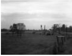
Imperial Paper and Color Corporation Plant in Glens Falls, New York. September 27, 1938 (NYSA_A0245-77_Warren_B21_62)