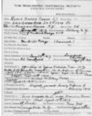
Rufus Baker Crain Service Record (NYSA_A3166-78_B1_F18_Crain_record)