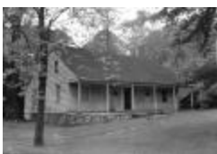
Washington's Headquarters in White Plains, New York. May 17, 1937