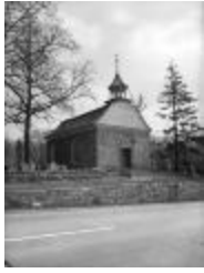
Old Dutch Church of Sleepy Hollow in Tarrytown, New York. April 13, 1938 (NYSA_A0245-77_Westchester_B22_45_A)