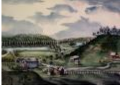
Drawing of Fort Johnson by Guy Johnson (NYS_A0245-77_Montgomery_B09_17)