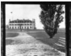
The "French Castle" at Fort Niagara in Youngstown, New York (NYS A0245-77_Niagara_B10_13)