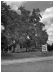
The Scythe Tree in Seneca County, New York. August 23, 1941