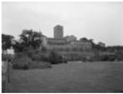
The Cloisters in Fort Tryon Park in New York. August 7, 1938 (NYS A0245-77_NewYork_B09_70)