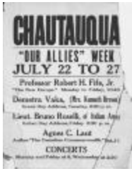
Our Allies Week (NYSA_A3167-78A_B7_Chautauqua_Allies)