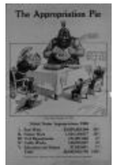
Appropriation Cartoon (NYSA_A3167-78A_B7_Appropriation_Pie)