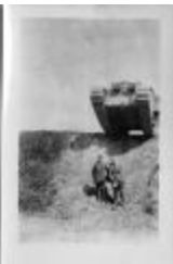
British Tank (NYSA_A3166-78_B1_F18_BritishTank)