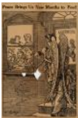
"Peace Brings Us New Mouths to Feed" (NYS A3167-78A_B7_WW1_Material_14)