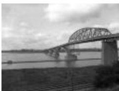
Peace Bridge in Buffalo, New York. October 13, 1937 (NYS A0245-77_Erie_B03_41)