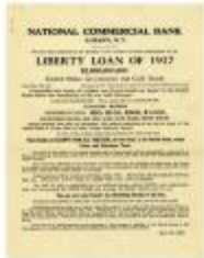
Liberty Loan of 1917 (NYSA_A3167-78A_B7_WW1_Material_05)