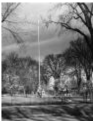
Montcalm Park in Oswego, New York (NYS_A0245-77_Oswego_B11_55)