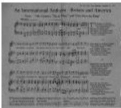
International Anthem (NYSA_A3167-78A_B7_WW1_Material_07)