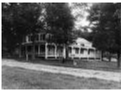
Dowling House in Lake George, New York