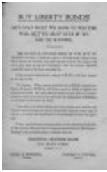
Buy Liberty Bonds (NYSA_A3167-78A_B7_WW1_Material_04)