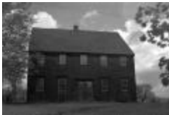
Quaker Meeting House, Quaker Hill, New York. May 17, 1937 (NYS A0245-77_Dutchess_B03_28)