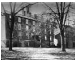
Starkey Seminary Sunshine Lodge in Lakemont, New York. August 19, 1941