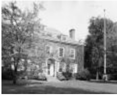
Fort Johnson in Amsterdam, New York. June 17, 1941 (NYS_A0245-77_Montgomery_B09_10)