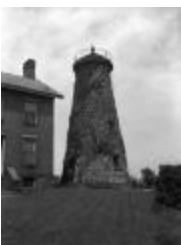
Charlotte-Genesee Lighthouse in Rochester, New York. July 15, 1937