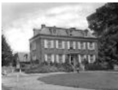
Van Cortland Manor House in the Van Cortland Park, Bronx, New York. June 25, 1938 (NYSA_A0245-77_Bronx_B02_14)