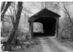
Hyde Hall Bridge in East Springfield, New York (NYS_A0245-77_Otsego_B11_58)