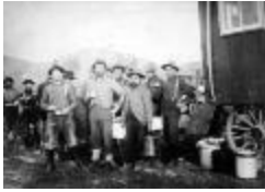
River drivers having breakfast. (NYSA_A0097-78_001)