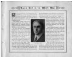
Troy's Part in the World War (NYSA_A3167-78A_B1_F1_TroyContributions)