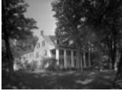
Brookside Tavern in Ballston Spa, New York. August 8, 1942