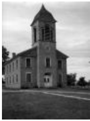
Esperance Presbyterian Church in Esperance, New York