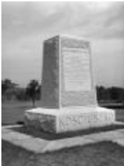
Memorial of General Thaddeus Kosciuszko in Saratoga Battlefield in Schuylerville. July 15, 1941