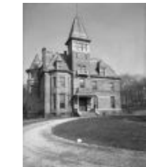
Yonkers Science Museum, February 5, 1938 (NYSA_A0245-77_Westchester_B22_40)