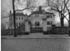
Morris-Jumel Mansion located in New York City. October, 1948 (NYS A0245-77_NewYork_B09_69)