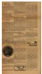
"Spend Food Carefully!" (NYS A3167-78A_B7_WW1_Material_10)