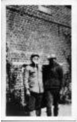
Gas Mask (NYSA_A3167-78A_B3_F9_04)