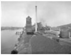
Niagara Hudson Coke Plant in Troy, New York. September 30, 1937 (NYSA_A0245-77_Rensselaer_B12_9)