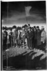
East Jerusalem (NYSA_A3167-78A_B2_F8_01)