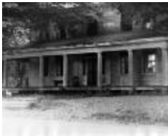
Folsom House located in Folsomdale, New York (NYSA_A0245-77_Wyoming_B22_65)