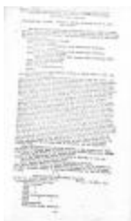
The Ninety-Second Division (NYSA_A3166-78_B2_F01_92)