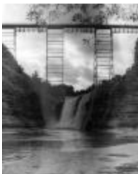
Erie Railroad Bridge over the Upper Falls of the Genesee River in Letchworth Park (NYSA_A0245-77_Livingston_B05_33)