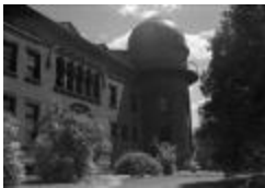
Dudley Observatory and Bender Lab in Albany, 1936 (NYSA_A0245-77_Albany_B01_15)