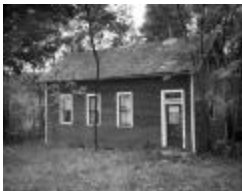
Red School House in Wyoming County, New York (NYS_A0245-77_Wyoming_B24_25)