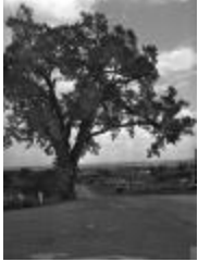
Lafayette Tree in Geneva, New York. September 23, 1941 (NYS_A0245-77_Ontario_B11_12)