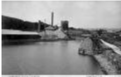
Crown Point Iron Company Furnaces in Crown Point, New York (NYSA_A0245-77_Essex_B04_7)