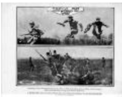
Troy Soldiers Charge (NYSA_A3167-78A_B1_F1_TroySoldiers)