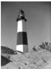
Montauk Point Lighthouse in East Hampton, New York. October 8, 1938 (NYSA_A0245-77_Suffolk_B20_52)