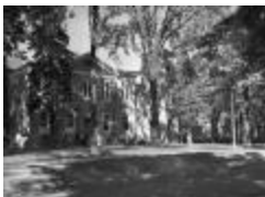
Cazenovia Seminary in Cazenovia, New York. September 21, 1941 (NYS A0245-77_Madison_B08_62)