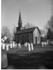
Dutch Reformed Church, Fishkill, April 13, 1938 (NYS A0245-77_Dutchess_B03_23)