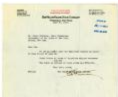
The Welch Grape Juice Company's Contributions to the War Effort (NYSA_A3166-78_B1_F05_Welch2)