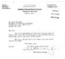
The Welch Grape Juice Company's Contributions to the War Effort (NYSA_A3166-78_B1_F05_Welch1)