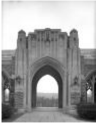
War Memorial in Ithaca, New York