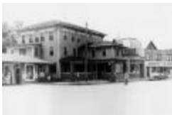
Arcade Hotel in Arcade, New York (NYSA_A0245-77_Wyoming_B23_31)