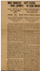
Food Rationing 5 (NYS A3167-78A_B7_WW1_Material_09_p5)