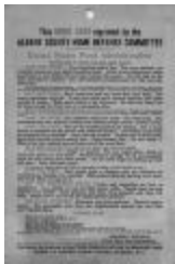
Home Card (NYSA_A3167-78A_B7_WW1_Material_01)