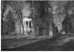
Knox School in Cooperstown. October 12, 1941 (NYSA_A0245-77_Otsego_B11_63_B)