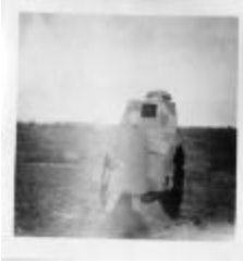
Renault Tank (NYSA_A3166-78_B1_F18_RenaultTank)