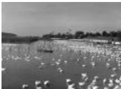
Duck Farm in Long Island, New York. June 16, 1938 (NYSA_A0245- 77_Suffolk_B20_48)