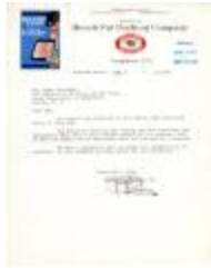
Beech Nut Packing Company's Contributions to the War Effort (NYSA_A3166-78_B1_F05_BeechNut)