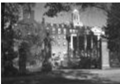
Otesaga Hotel (in summer) in Cooperstown, New York. October 12, 1936 (NYS_A0245-77_Otsego_B11_63_A)