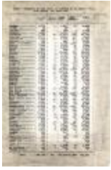
Number Furnished by Each State and Serving in the United States Navy During the World War (NYSA_A3166-78_B1_F16_NavyPersonnel)