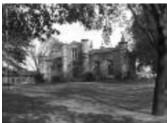
MacKaye Castle in Buffalo, New York. October 24, 1937 (NYS A0245-77_Erie_B03_24)