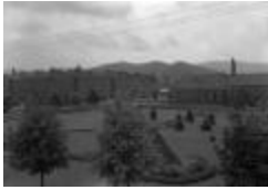
St. Bonaventure College in Olean, New York, 1937 (NYSA_A0245-77_Cattaraugus_B02_18)