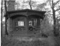
Mark Twain Study in Elmira, New York. October 20, 1937 (NYSA_A0245-77_Chemung_B02_37)