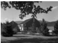
Woodstock School of Painting Studio in Woodstock, New York. September 9, 1937 (NYSA_A0245-77_Ulster_B21_30)