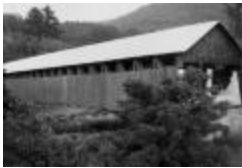
Blenheim Bridge in North Blenheim, New York (NYSA_A0245- 77_Schoharie_B20_34_A)