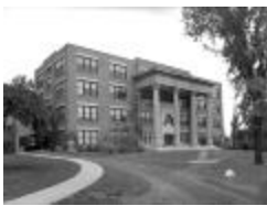
John Rogers Hegeman Hall at Keuka College in Penn Yan, New York. October 10, 1937 (NYS_A0245-77_Yates_B25_46)