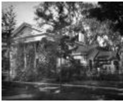
Madame Jumel Mansion in Saratoga Springs, New York. August 7, 1941