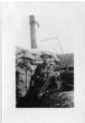
Trench Mortar Crew (NYSA_A3166-78_B1_F18_Ypres)