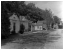
Village Street in Cooperstown, New York. June 1935 (NYSA_A0245-77_Otsego_B12_3)