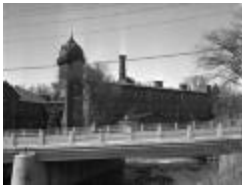
Bischoff Chocolate Factory in Ballston Spa, New York. April 26, 1941 (NYS A0245-77_Saratoga_B14_26)