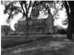
Smyth Home and Tavern located in Fort Edward, New York (NYSA_A0245-77_Washington_B22_26)