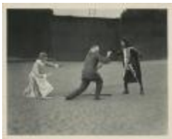
Pageant to commemorate events of the Revolutionary War (NYSA_B0567-85_B1_638_2)