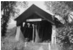
Blenheim Bridge in North Blenheim, New York (NYSA_A0245- 77_Schoharie_B20_34_B)