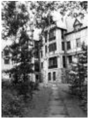
Will Rogers Memorial Hospital. Saranac Lake