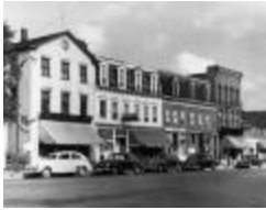
Krull's Store in Attica, New York (NYS_A0245-77_Wyoming_B23_56)