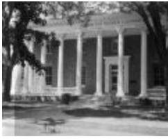
Headquarters of the New York State Historical Association in Cooperstown, New York. October 15, 1941