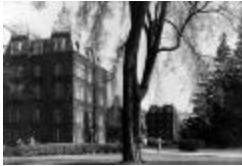
Main Building of Vassar College in Poughkeepsie, New York (NYS A0245-77_Dutchess_B03_20)