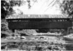
Wagner's Hollow Bridge in Palatine, New York (NYS_A0245-77_Montgomery_B09_19_A)