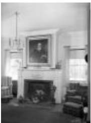
Gerrit Smith Portrait in Peterboro, New York. August 29, 1941