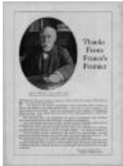
Thanks from France's Premier