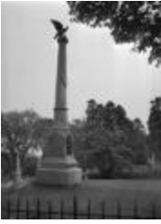
Monument marking the resting place of Colonel Elmer Ephraim Ellsworth in Saratoga Springs. July 29, 1941