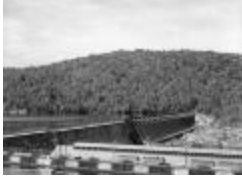
Spiers Falls Power Dam in Glens Falls, New York, 1938