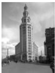
Niagara Mohawk "Electric Building" in Buffalo, New York. October 17, 1937 (NYS A0245-77_Erie_B03_50)