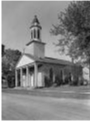
Christ Episcopal Church in Sackets Harbor, New York. May 15, 1938 (NYSA_A0245-77_Jefferson_B05_9)