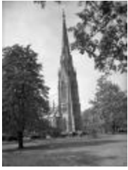
Cathedral of the Incarnation in Garden City, New York. October 9, 1938 (NYS A0245-77_Nassau_B09_56)