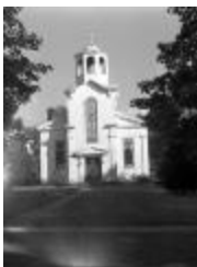
Roman Catholic Church in Leicester, New York