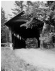
Wagner's Hollow Bridge in Palatine, New York (NYS_A0245-77_Montgomery_B09_19_B)