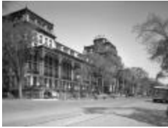
Grand Union Hotel in Saratoga Springs, New York. May 15, 1939 (NYS_A0245-77_Saratoga_B12_57)