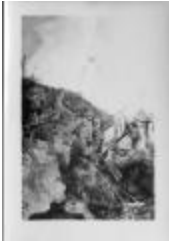
Machine Gun Team (NYSA_A3166-78_B1_F18_MachineGunners_France)