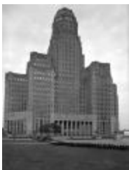
City Hall in Buffalo, New York. October 12, 1937 (NYS A0245-77_Erie_B03_37)