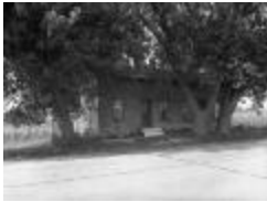
Otis House, located South of Henderson Harbor, New York. September 24, 1937 (NYSA_A0245-77_Jefferson_B05_16)