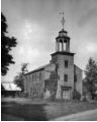
Universalist Church in Greenfield, New York. July 8, 1941 (NYS_A0245-77_Saratoga_B12_42)