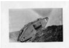
Canadian Tank (NYSA_A3166-78_B1_F18_CanadianTank)