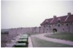
Views of Fort Ticonderoga in Ticonderoga, New York. July 14, 1938 (NYSA_A0245-77_Essex_B03_83)