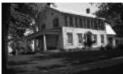
Quaker Homestead in Philadelphia, New York