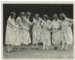
Indians and Pageant, Sullivan Campaign, Elmira, Canajoharie (NYSA_B0567-85_B1_638_1)