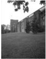
Cornell Armory in Ithaca, New York. October 21, 1937 (NYSA_A0245-77_Tompkins_B21_5)