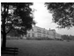
Warren County Sanatorium in Lake George, New York. September 27, 1938 (NYSA_A0245-77_Warren_B21_57)