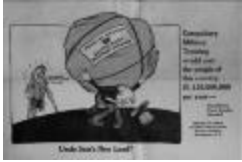
"Uncle Sam's New Load?" (NYSA_A3167-78A_B7_Compulsory_Service_Cartoon)