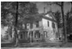
Old Court House in Clavarack, New York. May 16, 1937 (NYSA_A0245-77_Columbia_B02_60)