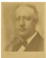
Portrait, Alfred E. Smith (NYSA_A3167-78A_B3_Alfred_E_Smith)