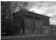
Old American House in Delaware County, New York. May 24, 1937 (NYSA_A0245-77_Delaware_B02_75)