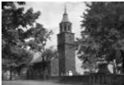
Saint Paul's Church in Mount Vernon, New York. May 17, 1937 (NYSA_A0245-77_Westchester_B22_39)