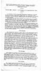
The Ninety-Third Division (NYSA_A3166-78_B2_F01_93HH)