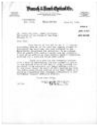
Bausch and Lomb's Contributions to the War Effort (NYSA_A3166-78_B1_F05_BauschLomb)