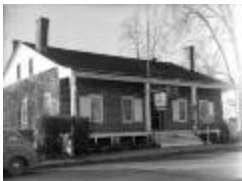
The Old '76 Tappan House in Tappan, New York. October 1948 (NYSA_A0245-77_Rockland_B12_30)