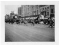
Johnston Memorial Scottish Pipe Band (NYSA_A3166-78_B1_F18_JohnstonBand)