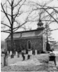
Sleepy Hollow Church in Tarrytown, New York. April 13, 1938 (NYSA_A0245-77_Westchester_B22_45_B)