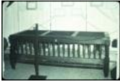
Utica Psychiatric Hospital (NYSA_B1560-97_B08_33)