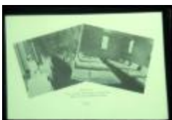
Utica Psychiatric Hospital (NYSA_B1560-97_B08_32)