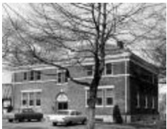
Laboratory, Utica Psychiatric Hospital (NYSA_B1560-97_B01_F13B_2)