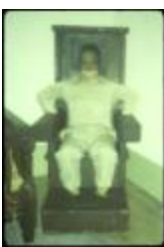
Utica Psychiatric Hospital (NYSA_B1560-97_B08_28)