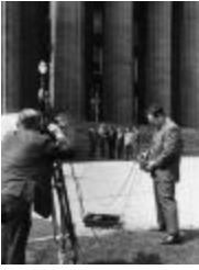
Utica Psychiatric Hospital (NYSA_B1560-97_B01_F01B_1)