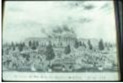
Utica Psychiatric Hospital (NYSA_B1560-97_B08_05)