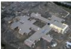
Utica Psychiatric Hospital (NYSA_B1560-97_B08_D)