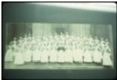
Utica Psychiatric Hospital (NYSA_B1560-97_B08_08)