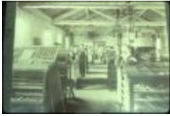
Utica Psychiatric Hospital (NYS B1560-97 B08_14)