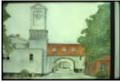
Utica Psychiatric Hospital (NYSA_B1560-97_B08_35)