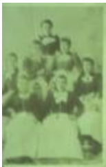
Utica Psychiatric Hospital (NYS B1560-97 B08_18)