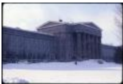
Utica Psychiatric Hospital (NYSA_B1560-97_B08_36)