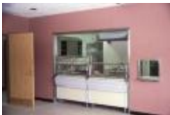
Utica Psychiatric Hospital (NYSА_B1560-97_B08_I)