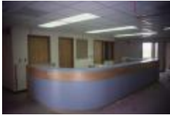
Utica Psychiatric Hospital (NYSА_B1560-97_B08_H)