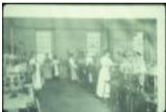
Utica Psychiatric Hospital (NYSA_B1560-97_B08_10)