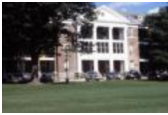
Utica Psychiatric Hospital (NYSA_B1560-97_B08_C)