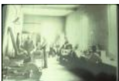
Utica Psychiatric Hospital (NYSA_B1560-97_B08_13)