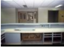
Utica Psychiatric Hospital (NYSА_B1560-97_B08_G)