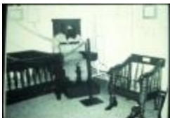
Utica Psychiatric Hospital (NYSA_B1560-97_B08_27)