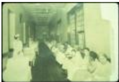
Utica Psychiatric Hospital (NYSA_B1560-97_B08_26)