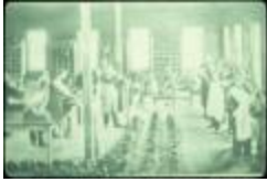
Utica Psychiatric Hospital (NYS B1560-97 B08_15)