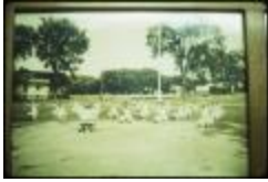
Utica Psychiatric Hospital (NYSA_B1560-97_B08_23)