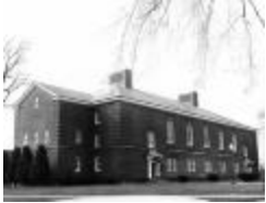
Utica Psychiatric Hospital (NYSA_B1560-97_B01_F13A_4)