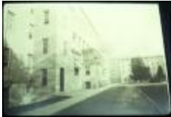
Utica Psychiatric Hospital (NYSA_B1560-97_B08_06)