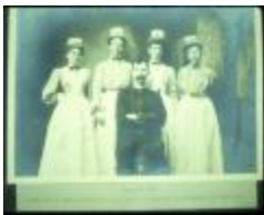
Utica Psychiatric Hospital (NYS B1560-97 B08_19)