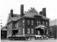
Walcott House, Utica Psychiatric Hospital (NYSA_B1560-97_B01_F13A_5)