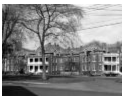
Dunham Hall, Utica Psychiatric Hospital (NYSA_B1560-97_B01_F13B_3)