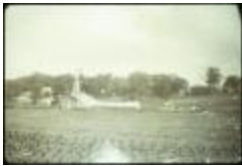
Utica Psychiatric Hospital (NYS B1560-97 B08_17)