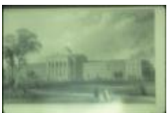
Utica Psychiatric Hospital (NYSA_B1560-97_B08_02)