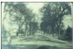
Utica Psychiatric Hospital (NYSA_B1560-97_B08_03)