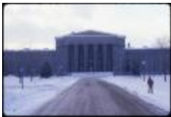
Utica Psychiatric Hospital (NYSA_B1560-97_B08_37)