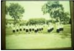
Utica Psychiatric Hospital (NYSA_B1560-97_B08_24)