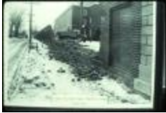
Utica Psychiatric Hospital (NYSA_B1560-97_B08_34)