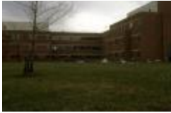
Utica Psychiatric Hospital (NYSА_B1560-97_B08_F)