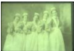
Utica Psychiatric Hospital (NYS B1560-97 B08_20)