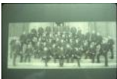
Utica Psychiatric Hospital (NYSA_B1560-97_B08_12)