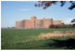
Utica Psychiatric Hospital (NYSA_B1560-97_B08_B)