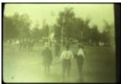
Utica Psychiatric Hospital (NYSA_B1560-97_B08_25)