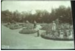
Utica Psychiatric Hospital (NYS B1560-97 B08_16)