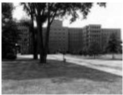
Brigham Building, Utica Psychiatric Hospital (NYSA_B1560-97_B01_F13B_1)