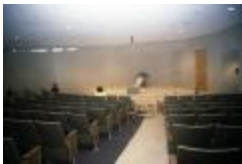
Utica Psychiatric Hospital (NYSА_B1560-97_B08_J)