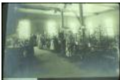
Utica Psychiatric Hospital (NYSA_B1560-97_B08_11)