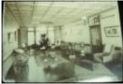
Utica Psychiatric Hospital (NYSA_B1560-97_B08_22)