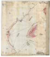
Map of a Portion of the N. W. Shore of Lake Placid, showing North Elba townline (NYSA_B1405-96_118A06)