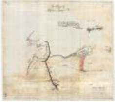
Map Showing Survey of Mud Pond and its Outlet (NYSA_B1405-96_118A13)