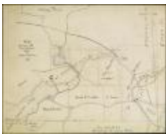
Map Showing the True Boundaries of Lands at Ampersand and Saranac (NYSA_B1405-96_366)