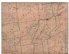
Map of the Towns of Au Sable, Franklin, Black Brook, Chesterfield, Lewis, Jay, Wilmington, Keene, North Elba, and St. Armand (NYSA_B1405-96_150A07)