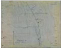
Topographical map of the Salmon River, Clinton County, N.Y. (NYSA_B1405-96_18)