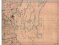
Map of the Towns of Plattsburgh, Beekmantown, Schuyler Falls, Peru and Au Sable (NYSA_B1405-96_150A04)