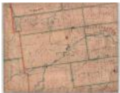
Map of the Towns of Plattsburgh, Beekmantown, Schuyler Falls, Peru and Au Sable, Ellenburg, Belmont, Franklin, Black Brook, Saranac and Dannemora (NYSA_B1405-96_150A05)