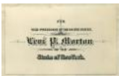
Electoral College ballot for Levi Morton as Vice President (NYSA_B0023-78_V1_1888_Morton)