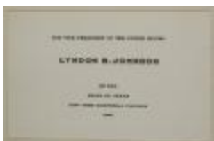
Electoral College ballot for Lyndon Johnson as Vice President (NYSA_B0023-79_V2_p314_1960_Johnson)