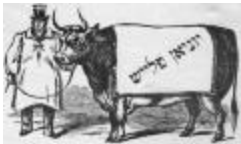
Union Label. Hebrew Butcher Workmen Union No. 1 of New York (NYSA_12979-79_B1_F13_13)