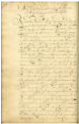
Land patent granted to Thomas Bell of Onckway alias Fairfield (NYSA_A0487-78_V01)