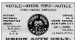
Union Label. Actors National Protective Union of America (NYSA_12979-79_B1_F55_55)