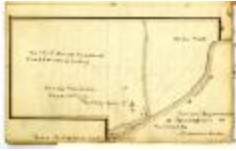
Map of Indian Reservation at Squawky-hill (NYSA_A0025-78_B4_V58_p33)