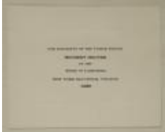
Electoral College ballot for Herbert Hoover as President (NYSA_B0023-79_V2_p269_1928_Hoover)