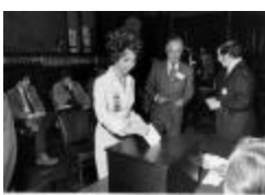
Electoral College, 1976 (photograph 5) (NYSA_19416-96_B1_1976_photo_005)