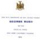
Electoral College ballot for George H. W. Bush as Vice President (NYSA_19416-96_B1_1984_Bush)