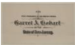
Electoral College ballot for Garret Hobart as Vice President (NYSA_B0023-79_V2_p029_1896_Hobart)