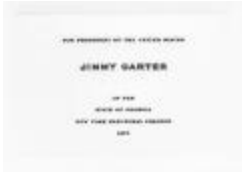
Electoral College ballot for Jimmy Carter as President (NYSA_19416-96_B1_1976_Carter)