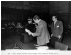
Electoral College, 1976 (photograph 6) (NYSA_19416-96_B1_1976_photo_006)