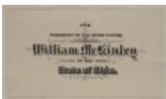
Electoral College ballot for William McKinley as President (NYSA_B0023-79_V2_p029_1896_McKinley)