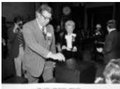
Electoral College, 1976 (photograph 2) (NYSA_19416-96_B1_1976_photo_002)