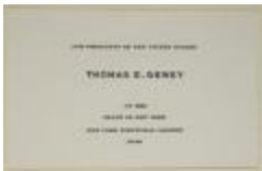
Electoral College ballot for Thomas E. Dewey as President (NYSA_B0023-79_V2_p297_1948_Dewey)