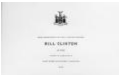
Electoral College ballot for Bill Clinton as President (NYSA_19416-96_B1_1992_Clinton)