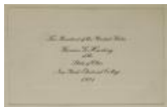
Electoral College ballot for Warren G. Harding as President (NYSA_B0023-79_V2_p231_1920_Harding)