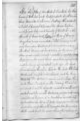
Executive Pardon (NYSA_B0042-78_V1)