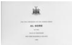
Electoral College ballot for Al Gore as Vice President (NYSA_19416-96_B1_1992_Gore)