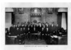
Electoral College, 1901 (NYSA_B0023-79_V2_p093)