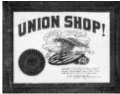
Union Label. Journeymen Barber's International Union of America (NYSA_12979-79_B2_F27_101)