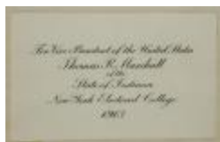
Electoral College ballot for Thomas Marshall as Vice President (NYSA_B0023-79_V2_p189_1912_Marshall)