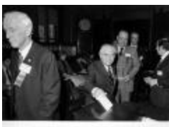
Electoral College, 1976 (photograph 4) (NYSA_19416-96_B1_1976_photo_004)