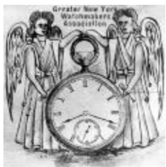
Union Label. Greater New York Watchmakers Association