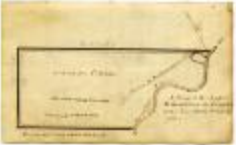
Map of the Indian Reservation at Canawagus (NYSA_A0025-78_B4_V58_p51)