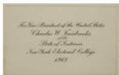
Electoral College ballot for Charles Fairbanks as Vice President (NYSA_B0023-79_V2_p211_1916_Fairbanks)