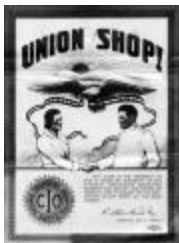
Union Label. National Organizing Committee of the Barber and Beauty Culturists (NYSA_12979-79_B3_F48_187)