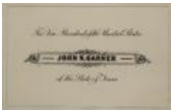
Electoral College ballot for John Garner as Vice President (NYSA_B0023-79_V2_p278_1932_Garner)