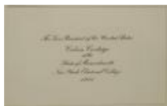
Electoral College ballot for Calvin Coolidge as Vice President (NYSA_B0023-79_V2_p231_1920_Coolidge)