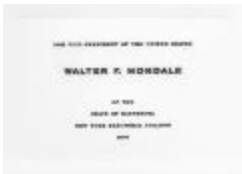
Electoral College ballot for Walter Mondale as Vice President (NYSA_19416-96_B1_1976_Mondale)