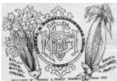
Union Label. Farmers and Market Gardeners Union (NYSA_12979-79_B1_F45_45)