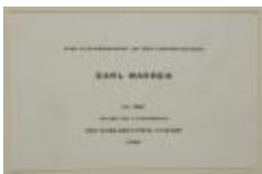
Electoral College ballot for Earl Warren as Vice President (NYSA_B0023-79_V2_p297_1948_Warren)