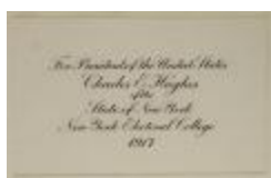
Electoral College ballot for Charles Evans Hughes as President (NYSA_B0023-79_V2_p211_1916_Hughes)