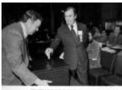
Electoral College, 1976 (photograph 1) (NYSA_19416-96_B1_1976_photo_001)