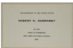
Electoral College ballot for Hubert Humphrey as President (NYSA_B0023-79_V2_p328_1968_Humphrey)