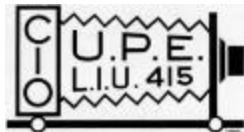
Union Label. United Photographic Employees Local Industrial Union (NYSA_12979-79_B3_F35_174)