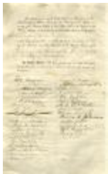
Electoral College. Appointment of Frederick Douglass by Electors (NYSA_B0023-78_V1_1872_Douglass_Frederick_2)