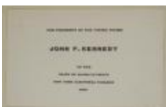
Electoral College ballot for John F. Kennedy as President (NYSA_B0023-79_V2_p314_1960_Kennedy)