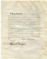
Acknowledgement signed by Frederick Douglass of receipt of electoral votes (NYSA_B0023-78_V1_1872_Douglass_Frederick_1)