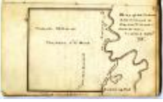
Map of the Indian Reservations at Big-tree and Little-Beards Town (NYSA_A0025-78_B4_V58_p41)