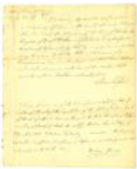
Alien deposition, William Hyland, 1825 (NYSA_A1869-78_B1F1_Dep8_HylandW)