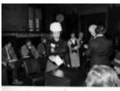
Electoral College, 1976 (photograph 3) (NYSA_19416-96_B1_1976_photo_003)