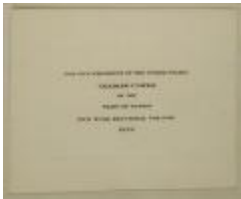
Electoral College ballot for Charles Curtis as Vice President (NYSA_B0023-79_V2_p269_1928_Curtis)