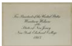
Electoral College ballot for Woodrow Wilson as President (NYSA_B0023-79_V2_p189_1912_Wilson)