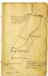
Map of Indian Reservation at Kane-audea (NYSA_A0025-78_B4_V58_p1)