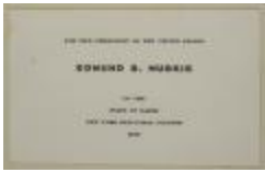
Electoral College ballot for Edmund Muskie as Vice President (NYSA_B0023-79_V2_p328_1968_Muskie)