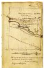
Map of the Indian Reservation at Gardeau (NYSA_A0025-78_B4_V58_p15)