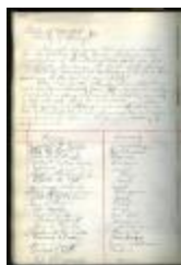
Sworn oath signed by electors, 1921 (NYSA_B0023-79_V2_p220-223)