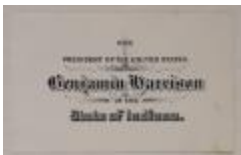
Electoral College ballot for Benjamin Harrison as President (NYSA_B0023-78_V1_1888_Harrison)