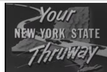
The Thruway and Syracuse Tomorrow!, 1951 (NYSA_14512-91_mpf16_aaaa_bb)