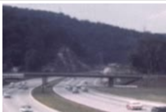
New York Division of Traffic – Helicopter Shots (4th of July traffic), 1958 (NYSA_14512-91_mpf16_1958-07-04)