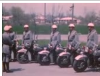
State Police Motorcycle School, 1961 (NYSA_14512-91_mpf16_1961-05-aa)