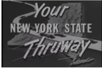
The Thruway and Buffalo Tomorrow!, 1951 (NYS_14512-91_mpf16_aaaa_cc)