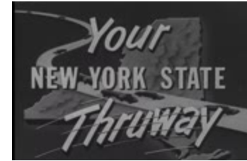
The Thruway and Utica-Rome Tomorrow!, 1951 (NYS_14512-91_mpf16_aaaa_ff)