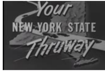
The Thruway and the Capital District!, 1951 (NYS_14512-91_mpf16_aaaa_dd)