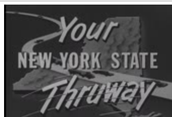
The Thruway and New York City Tomorrow!, 1951 (NYSA_14512-91_mpf16_aaaa_aa)