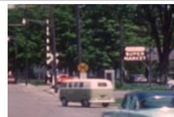
Thruway Bridge Opening (Tappan Zee), 1955 (NYSA_14512-91_mpf16_1955-12-15b)