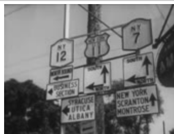
The Thruway and Binghamton Tomorrow, 1951 (NYSA_14512-91_mpf16_1951-aa-aa)