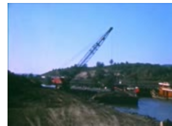
Erie Canal Relocation, 1952 (NYSA_14512-91_mpf16_1952-aa-aa)