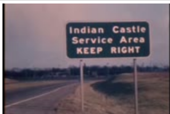
Indian Castle SA + Sign, 1950s (NYSA_14512-91_mpf16_1950s-aa-aa)