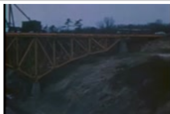
Normanskill Bridge (under construction), 1953 (NYSA_14512-91_mpf16_1953-12-aa)