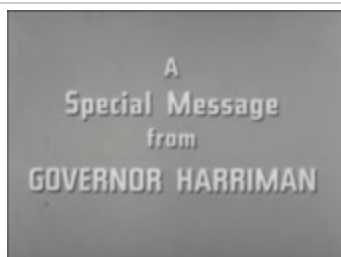
Governor W. Averell Harriman's 4th of July Highway Safety Announcement, ca. 1950s (NYSA_14512-91_mpf16_1950s-aa-bb)