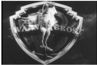
The Thruway to Tomorrow!, 1950 (NYS_14512-91_mpf16_aaaa_gg)