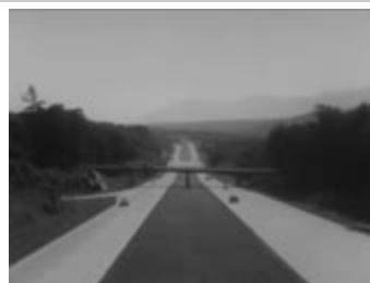
Opening of the Tappan Zee Bridge on the New York Thruway, 1955 (NYSA_14512-91_mpf16_1955-12-15a)