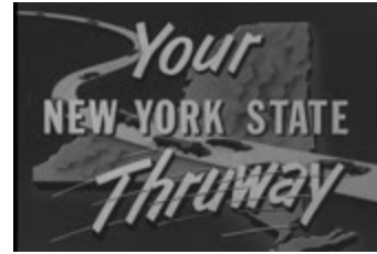
The Thruway and Rochester Tomorrow!, 1951 (NYS_14512-91_mpf16_aaaa_ee)