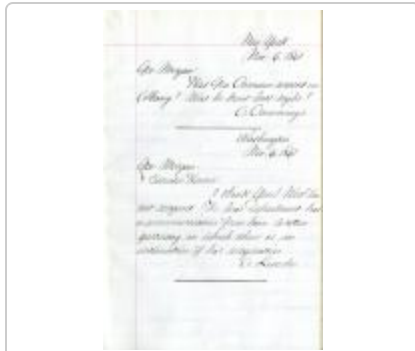
[Transcript, Telegram from Abraham Lincoln to Governor Morgan and Senator Harris] (NYSA_A4149-78_B2_V6_11-06-1861)