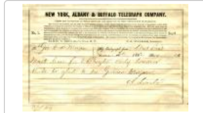
[Telegram from Abraham Lincoln to Governor Edwin D. Morgan] (NYSA_A4149-78_B3_V7_p99)