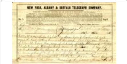
Telegram from Abraham Lincoln to Governor Edwin D. Morgan (NYSA_A4149-78_B3_V7_p111)