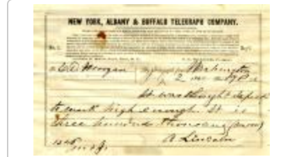
[Telegram from Abraham Lincoln to Governor Edwin D. Morgan] (NYSA_A4149-78_B3_V7_p109)