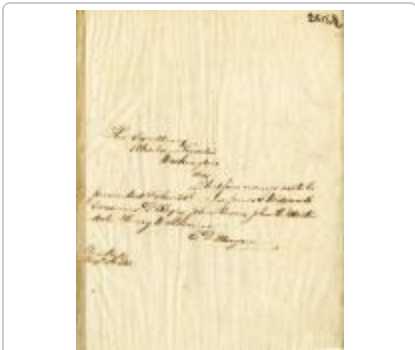
[Telegram from Governor Edwin D. Morgan to Abraham Lincoln]