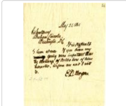
[Telegram from Governor Edwin D. Morgan to Abraham Lincoln] (NYSA_A4149-78_B4_V10_p034)