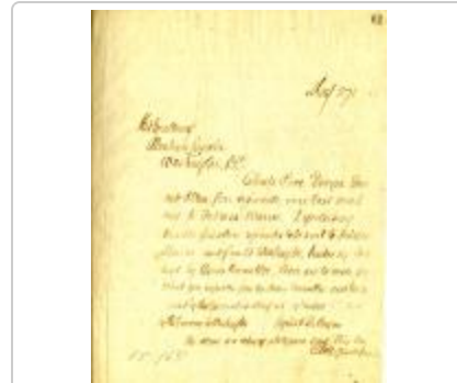
[Telegram from Governor Edwin D. Morgan to Abraham Lincoln, copy]