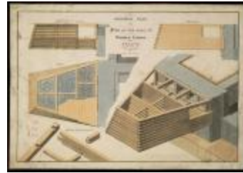
General Plan for Pier at the Head of Double Locks. Erie Canal. (NYSA_B0380-85_0657)