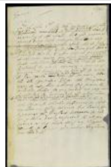
Letter from the council to the magistrates at New Castle (NYSA_A1879-78_V20_0150)