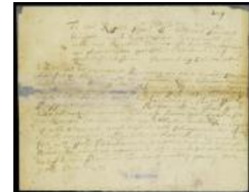
Petition of Luke Watson about an order to take up stray horses about the Whorekill (NYSA_A1879-78_V21_0009)