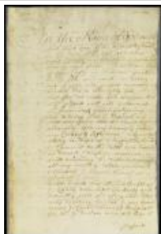
Will of William Tom of New Castle (NYSA_A1879-78_V20_0151)