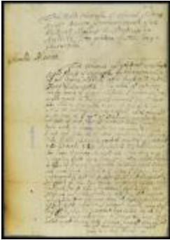
Petition of Thomas Spry claiming a colt seized and sold by capt. Billopp (NYSA_A1879-78_V21_0014)