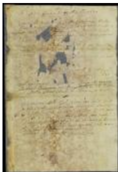
Minutes of the council in New York (NYSA_A1879-78_V20_0141)