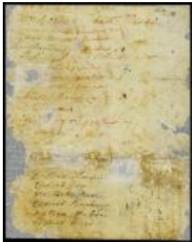
Names of persons at Salem, or Swamptown, where major Fenwick settled (NYSA_A1879-78_V21_0018)