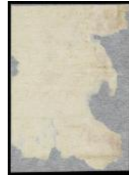
Unidentified fragment (NYSA_A1879-78_V21_0033a)