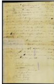
Names of the persons at the Whorekill eligible for magistrates, with list of those appointed (NYSA_A1879-78_V21_0015)