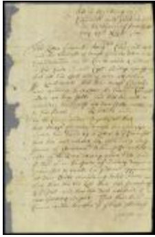
Proceedings of the commander and justices in New Castle in relation to major Fenwick (NYSA_A1879-78_V20_0155)