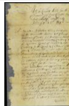
Proceedings of a court held at New Castle against Walter Wharton (NYSA_A1879-78_V20_0153)