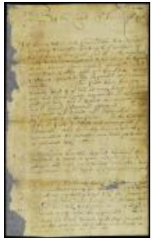
Minute of the court at New Castle of matters to present to governor Andros (NYSA_A1879-78_V20_0159)