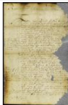
Letter from the court at New Castle to gov. Andros (NYSA_A1879-78_V20_0142)