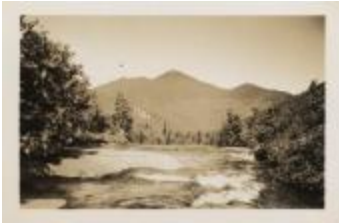
McIntyre [sic] from Indian Falls (NYSL_SC19469_B3_F40_P2_b)