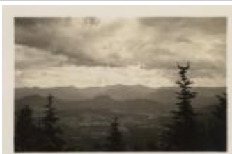
Whiteface [Mountain] (NYSL_SC19469_B3_F43_P2)