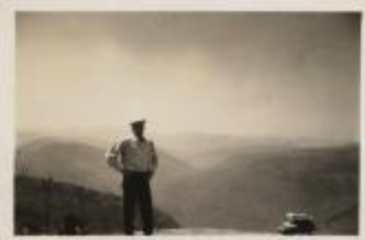
Plateau Mt. (NYSL_SC19469_B2_F25_P7)