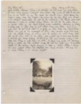
Description with photograph of hike up Big Slide Mountain (NYSL_SC19469_B3_F33_P11)