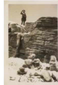
Slide Mountain (NYSL_SC19469_B2_F24_P6)