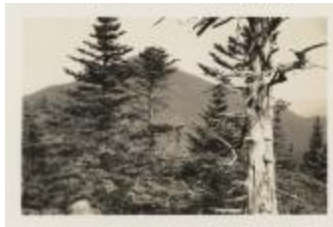
Iroquois Mt. From Summit of Mt. Herbert (NYSL_SC19469_B4_F52_P9)