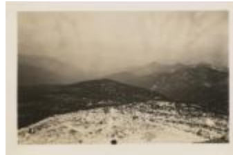
[Mount] Marcy Trip (NYSL_SC19469_B1_F13_P8)