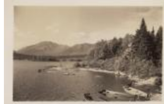
[Mount] Marshall (NYSL_SC19469_B7_F91_P4)