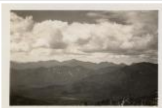
Mt. Macomb (NYSL_SC19469_B3_F45_P5)