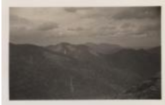
[View from] Haystack Mt. (NYSL_SC19469_B7_F91_P2)