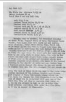
Diary entry for Big Slide Mountain Trip (NYSL_SC19469_B2_F30_P3)