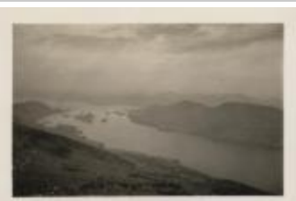
Black Mt. (NYSL_SC19469_B2_F29_P4)