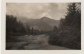
Haystack Mt. (NYSL_SC19469_B7_F91_P1)