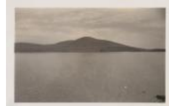
Kempshall Mt. (NYSL_SC19469_B7_F95_P3)