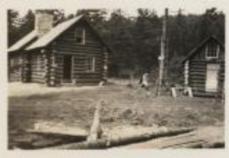
Cabins Near Lake Colden (NYSL_SC19469_B4_F52_P8)