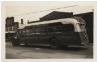
[Mount] Marcy Trip (NYSL_SC19469_B1_F13_P5_a)