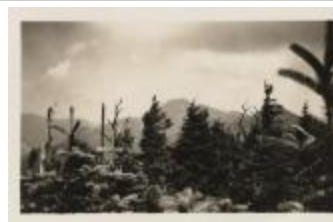
Mt. Dix From South Dix (NYSL_SC19469_B4_F46_P1)