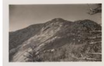
Gothic[s]-Saddleback [Mountains] (NYSL_SC19469_B6_F90_P2)