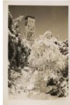
[Fire tower on] Slide Mt. (NYSL_SC19469_B2_F24_P5)