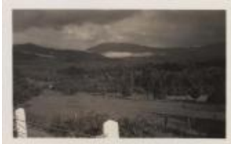
Indian Pass (NYSL_SC19469_B5_F73_P2)