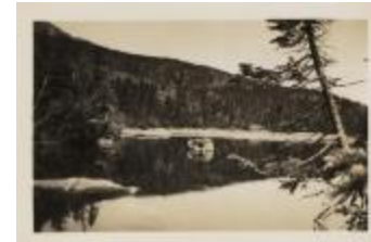
[Mount] Marcy (NYSL_SC19469_B3_F40_P6)