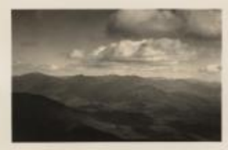
[View from] Santononi (NYSL_SC19469_B4_F59_P3)