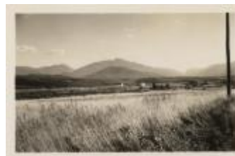
Mt. McIntyre [sic] (NYSL_SC19469_B4_F48_P8_b)