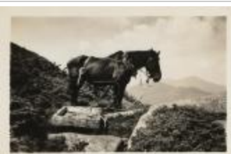
Horse atop Mt. Marcy used to bring up radio (NYSL_SC19469_B4_F48_P1)