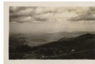
View East, Lake Champlain (NYSL_SC19469_B2_F28_P4)