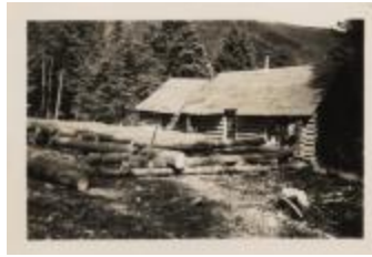
Ranger's Cabin, Lake Colden (NYSL_SC19469_B3_F39_P8)