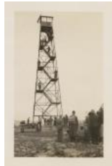
Fire tower Atop Hunter Mt. (NYSL_SC19469_B4_F58_P2a)