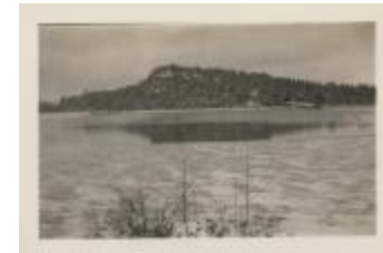
Crane Mountain [from Crane Pond] (NYSL_SC19469_B5_F63_P2a)