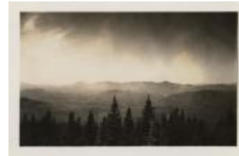
From Vanderwhacker Mt. View West (NYSL_SC19469_B4_F58_P6)