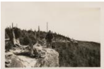
Hunter Mt. (NYSL_SC19469_B2_F22_P5)