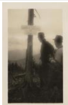
[Trail to] Cascade Mt. (NYSL_SC19469_B2_F26_P2)