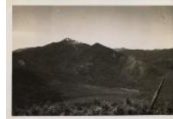
[Algonquin and Wright Mts from] Phelps Mt. (NYSL_SC19469_B6_F83_P4)