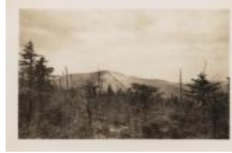
Slide Mt. Catskills (NYSL_SC19469_B6_F78_P3)