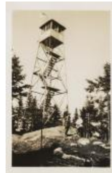
Fire tower on Vanderwhacker Mt. (NYSL_SC19469_B4_F58_P5)