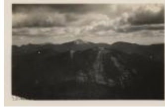
Algonquin [Mountain] (NYSL_SC19469_B4_F56_P2)