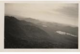
Elk Lake and Clear Pond from Mt. Dix (NYSL_SC19469_B2_F30_P8)