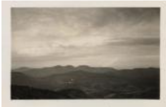
[View from] Hunter Mt. (NYSL_SC19469_B2_F22_P3_b)