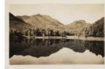
Marcy Dam (NYSL_SC19469_B3_F40_P2_a)