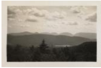
Black Head Mt. (NYSL_SC19469_B3_F37)