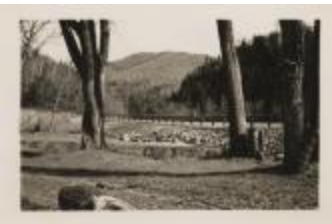
Round Mt. from Start of Trail (NYSL_SC19469_B2_F28_P6)