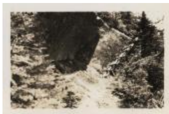
Ladder of Gothics [Mountain] (NYSL_SC19469_B3_F32_P2)