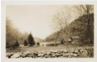
Slide Mountain (NYSL_SC19469_B2_F24_P2)