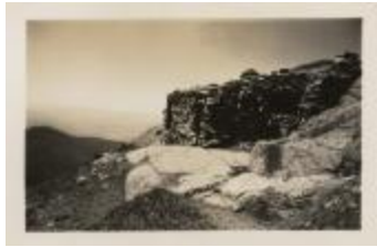
Shelter on Marcy (NYSL_SC19469_B3_F40_P3)