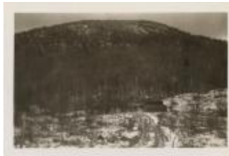
Crane Mountain (NYSL_SC19469_B5_F63_P1)