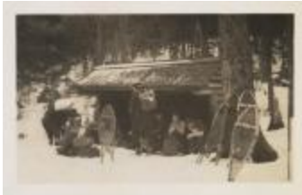
[Mount] Marcy Trip [group in shelter] (NYSL_SC19469_B1_F13_P7)