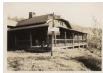
John's Brook Lodge (NYSL_SC19469_B3_F33_P2)