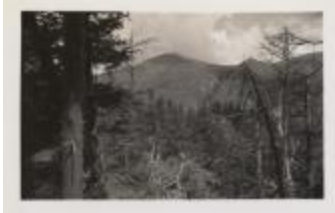
Cliff Mt. (NYSL_SC19469_B6_F88_P1)