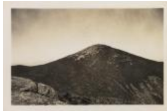
Marcy from Skylight (NYSL_SC19469_B3_F40_P4)