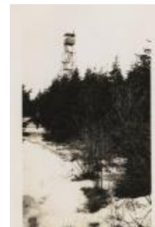
[Fire tower on] Hunter Mt. (NYSL_SC19469_B2_F22_P4)