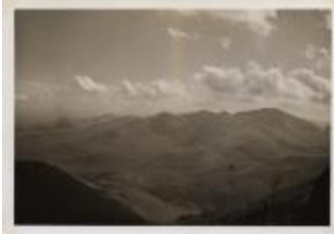
View from Giant [Mountain] (NYSL_SC19469_B6_F87_P4)