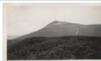
Whiteface Mt. from Mt. Esther (NYSL_SC19469_B3_F44_P1)