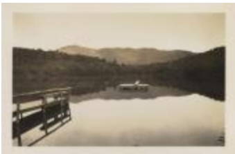
Heart Lake (NYSL_SC19469_B3_F41_P2)