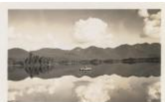
Elk Lake Toward the Great Range (NYSL_SC19469_B3_F45_P1_b)