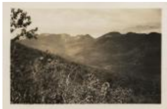
Noonmark [Mountain] (NYSL_SC19469_B3_F41_P4)