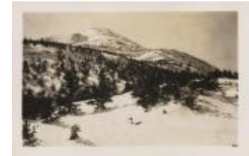
Mt. Marcy (NYSL_SC19469_B1_F13_P10_ref)