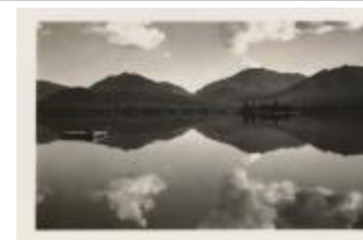
Elk Lake (NYSL_SC19469_B3_F45_P1_a)