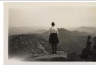
[Summit of] Mt. Dix (NYSL_SC19469_B2_F30_P7)