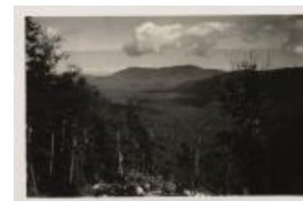
Mt. Ampersand from Seymour (NYSL_SC19469_B4_F51_P4)