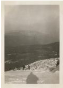
[Mount] Marcy Trip (NYSL_SC19469_B1_F13_P12)