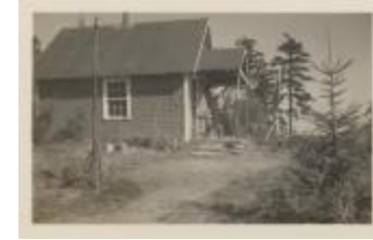
Rangers Cabin Atop Snowy Mt. (NYSL_SC19469_B4_F57_P5)