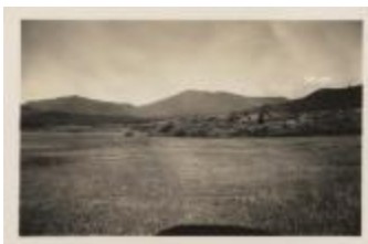
Cascade Mt. (NYSL_SC19469_B4_F48_P8_a)