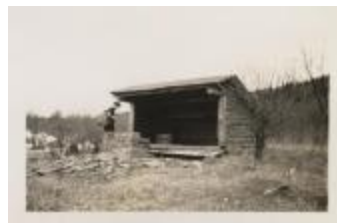
[Shelter on] Hunter Mt. (NYSL_SC19469_B2_F22_P3_c)