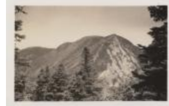
[Approaching] Gothic[s]-Saddleback (NYSL_SC19469_B6_F90_P2_b)