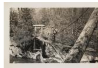
[Crossing] John's Brook (NYSL_SC19469_B3_F33_P3)