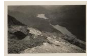
[Mount] Colden (NYSL_SC19469_B3_F42_P1)