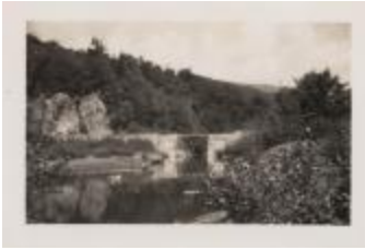
Indian Pass [Trail] (NYSL_SC19469_B5_F73_P1)