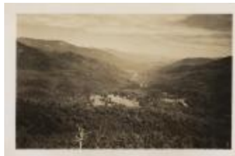
Noonmark [Mountain] (NYSL_SC19469_B3_F41_P5)