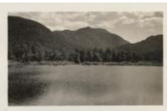
Avalanche Lake (NYSL_SC19469_B3_F42_P6)