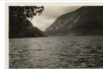
View Across Flowed Lands (NYSL_SC19469_B4_F47_P1)