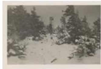
Crane Mountain [Fire Tower] (NYSL_SC19469_B5_F63_P2)