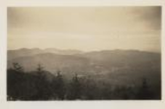
[View from] Hunter Mt. (NYSL_SC19469_B4_F58_P2)