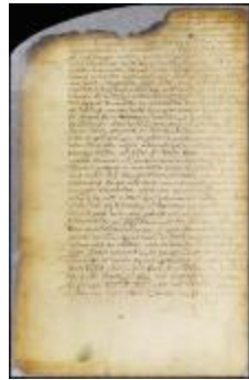
Patent of Loursens Pietersz for a lot on Manhattan Island (NYSA_A1880-78_VGG_0175)