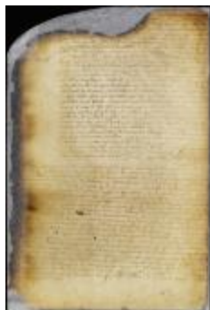
Patent of Egbert Woutersz for land across the North river (New Jersey) (NYS_A1880- 78_VGG_0216b)