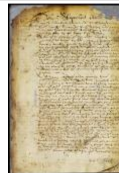
Ordinance against drinking during divine service or after nine o'clock in the evening (NYSA_A1875-78_V16_pt1_0005)