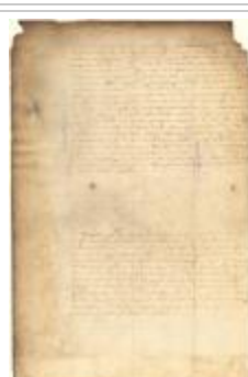
Dutch colonial council minutes, 20 September 1647 (NYSA_A1809- 78_V04_p332)