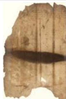
Dutch colonial council minutes, 11 March 1647 (NYSA_A1809-78_V04_p286)