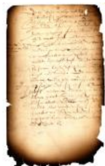
Memorandum Concerning the Sighting of Another Whale before Fort Orange (NYSL_sc7079_dehooghes-memo-