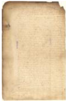
Dutch colonial council minutes, 25 September 1647 (NYSA_A1809- 78_V04_p334-335)