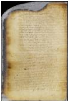
Patent of Johannes la Montagne for land on Manhattan Island (Harlem) (NYS_A1880- 78_VGG_0216a)