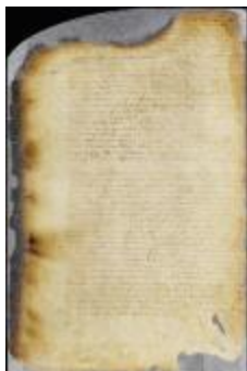
Patent of Sybolt Claesz for land on Manhattan Island (NYSA_A1880- 78_VGG_0220b)