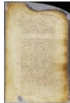
Patent of Cornelis Teunisz for a lot on Manhattan Island (NYS_A1880- 78_VGG_0215)