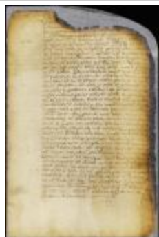
Patent of Cornelis Jacobsz Stille for a lot on Manhattan Island (NYS_A1880-78_VGG_0195)