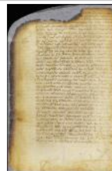
Patent of George Rapalje for a lot on Manhattan Island (NYS_A1880-78_VGG_0194)