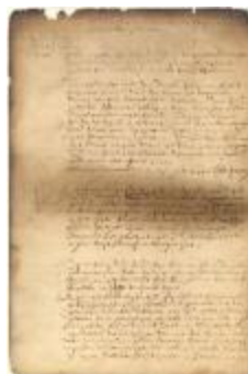
Dutch colonial council minutes, 10 January 1647 (NYSA_A1809-78_V04_p280)