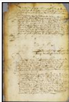
Ordinance regulating the port of New Amsterdam, the loading and unloading of ships, and establishing passes