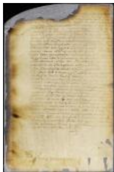
Patent of Augustyn Herman for land on Manhattan Island (NYSA_A1880- 78_VGG_0218)