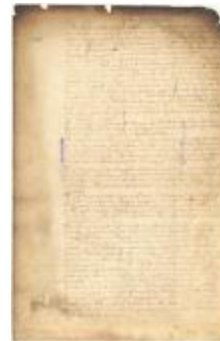
Dutch colonial council minutes, 15 October 1647 - 21 February 1648 (NYSA_A1809- 78_V04_p344-348)