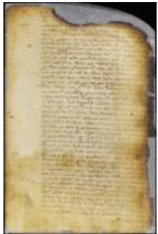
Patent of Jeuryaen Blanck for a lot on Manhattan Island (NYS_A1880- 78_VGG_0213)