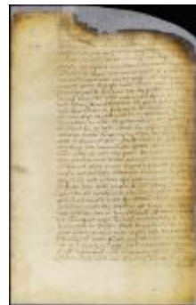
Patent of Peter van der Linden for land on Manhattan Island (NYSA_A1880-78_VGG_0181)