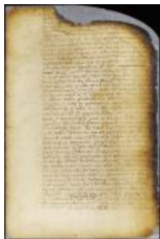
Patent of Abraham Planck for a lot on Manhattan Island (NYS_A1880-78_VGG_0187)