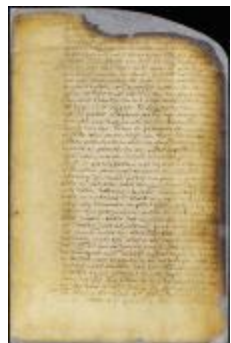
Patent of Peter Monfoort for a lot on Manhattan Island (NYS_A1880-78_VGG_0191)