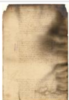
Dutch colonial council minutes, 23-25 July 1647 (NYSA_A1809-78_V04_p321-323)