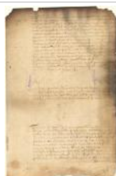
Dutch colonial council minutes, 22 July 1647 (NYSA_A1809-78_V04_p317)