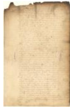
Dutch colonial council minutes, 5 December 1647 (NYSA_A1809-78_V04_p353-354)