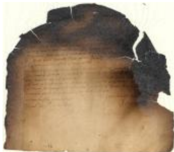
New Amsterdam, November 15, 1647. Letter. Director Stuyvesant to Governor Winthrop; complaints against New Haven (NYSA_A1810-78_V11_05b)