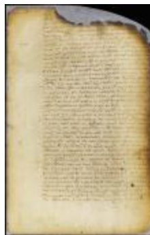
Patent of Cosyn Gerritsz for land on Manhattan Island (NYSA_A1880-78_VGG_0185)