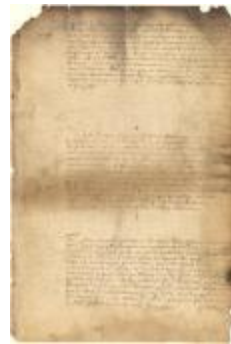
Dutch colonial council minutes, 20-28 June 1647 (NYSA_A1809-78_V04_p297)