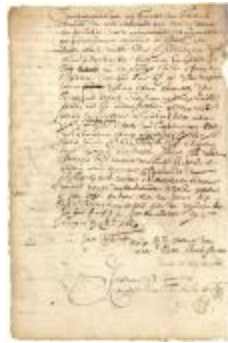
Note of Pieter Ebel in favor to Gillis Pietersen for the balance of the purchase price of a house (NYSA_A0270-