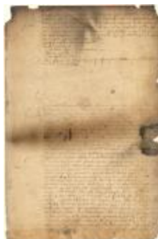
Dutch colonial council minutes, 31 May - 14 June 1647 (NYSA_A1809-78_V04_p289-292)