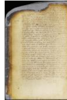
Patent of Cornelis Willemsz for a lot on Long Island (NYSA_A1880-78_VGG_0178)