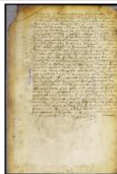
Ordinance regulating buildings in New Amsterdam (NYSA_A1875-78_V16_pt1_0009)