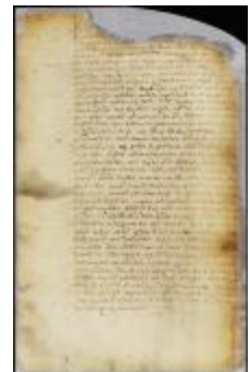
Patent of Tonis Nysen for a lot on Manhattan Island (NYSA_A1880-78_VGG_0203)