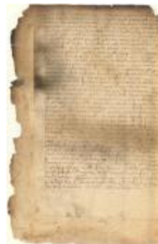
Dutch colonial council minutes, 4 July 1647 (NYSA_A1809-78_V04_p302)