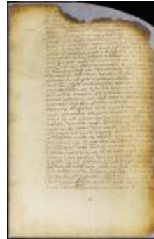
Patent of Robert Bottelaer for a lot on Manhattan Island (NYSA_A1880-78_VGG_0176)