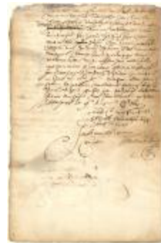
Bond of Catalyn van Straseele in favor of Dirck Cornelissen from Wensveen (NYSA_A0270-78_V2_168b)