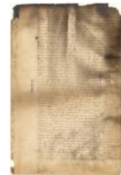
Dutch colonial council minutes, 4 July 1647 (NYSA_A1809-78_V04_p303)