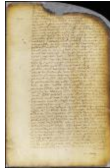
Patent of Cors Pietersz for a lot on Manhattan Island (NYSA_A1880-78_VGG_0164)