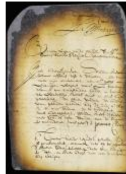
Note of William Kieft in favor of Mr. La Montagne for 200 guilder for a mare (NYSA_A1809-78_V10_pt1_0203)