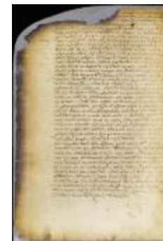
Patent of Volckert Evertsz for land on Long Island (NYSA_A1880-78_VGG_0173)