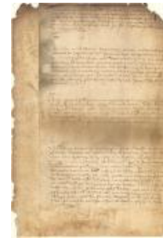
Dutch colonial council minutes, 20-24 June 1647 (NYSA_A1809-78_V04_p298)