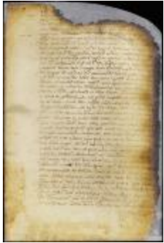
Patent of Peter van Campen for land on Manhattan Island (NYS_A1880- 78_VGG_0209)