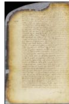
Patent of Claes van Elslant for land on Manhattan Island (NYSA_A1880-78_VGG_0182)