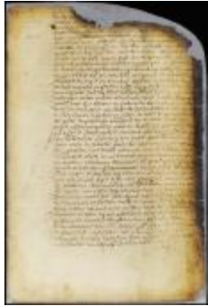
Patent of Olof Stevensz van Cortland for a lot on Manhattan Island (NYSA_A1880-78_VGG_0174)