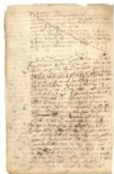
Power of attorney from Huygen Broers to collect wages from the West India Company (NYSA_A0270-78_V2_158b)