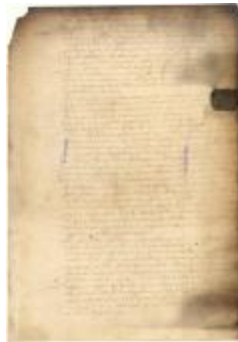
Dutch colonial council minutes, 25 September 1647 (NYSA_A1809- 78_V04_p335)