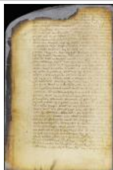
Patent of Cornelis van Tienhoven for land on Long Island (NYS_A1880-78_VGG_0188)