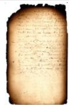
Promissory Note of De Hooges to the Deacons of Rensselaerswijck (NYSL_sc7079_dehooghes-memo-