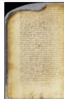
Patent of Harmen Meyndertsz van Bogaert for land on Manhattan Island (NYS_A1880-78_VGG_0190)