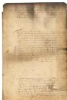
Dutch colonial council minutes, 4-11 July 1647 (NYSA_A1809-78_V04_p305)