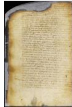
Patent of Ariaen Pietersen for a tract of land on Manhattan Island (NYS_A1880- 78_VGG_0212)