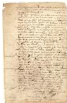
Declaration of Harmen Meyndertsen van den Bogaert and others respecting an attack by the Raritan Indians (NYSA_A0270-