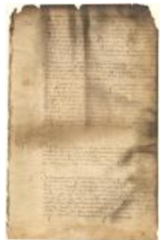
Dutch colonial council minutes, 28 June - 3 July 1647 (NYSA_A1809-78_V04_p299)