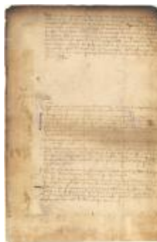
Dutch colonial council minutes, 11-16 July 1647 (NYSA_A1809-78_V04_p306)