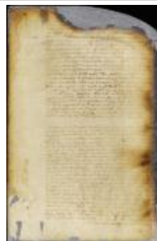
Patent of Thomas Hall for land on Manhattan Island (NYSA_A1880- 78_VGG_0219b)