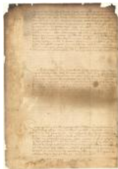
Dutch colonial council minutes, 18-20 June 1647 (NYSA_A1809-78_V04_p296)