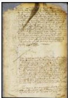
Ordinance against furnishing strong drink to indigenous peoples and for the proper preservation of fences (NYSA_A1875-