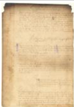
Dutch colonial council minutes, 18 July 1647 (NYSA_A1809-78_V04_p312-315)