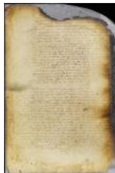
Patent of Maryn Adriaensz for land on the west side of the North river (New Jersey) (NYS_A1880-78_VGG_0217a)