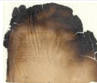
Letter from Director General Stuyvesant to Deputy Governor Goodyear (NYSA_A1810-78_V11_06b)