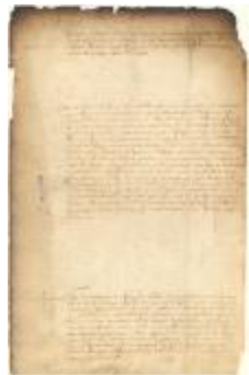
Dutch colonial council minutes, 22-30 November 1647 (NYSA_A1809- 78_V04_p352)