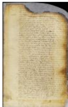
Patent of Harmen Smeman for a lot on Manhattan Island (NYSA_A1880-78_VGG_0207)