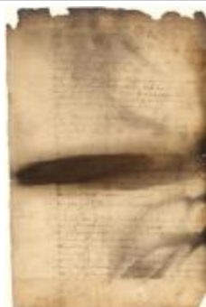
Dutch colonial council minutes, 7-14 February 1647 (NYSA_A1809-78_V04_p283)