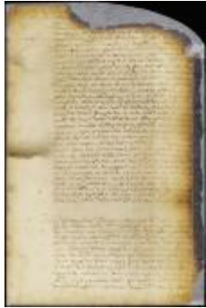
Patent of Francisco for land on Manhattan Island (NYSA_A1880-78_VGG_0199a)