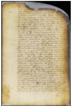
Patent of Paulus Heymanz for a lot on Manhattan Island (NYSA_A1880-78_VGG_0166)