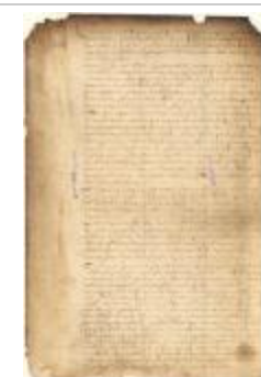
Dutch colonial council minutes, 22 - 23 July 1647 (NYSA_A1809-78_V04_p318-320)