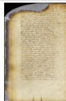
Patent of Gilyam Cornelse for a lot on Manhattan Island (NYS_A1880-78_VGG_0198)