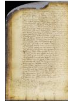
Patent of Hans Kierstede for a lot on Manhattan Island (NYSA_A1880-78_VGG_0165)