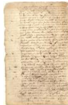
Declaration of Paulus Leendersen van der Grist that in a voyage from Curaçao he had by stress of weather been obliged to put into