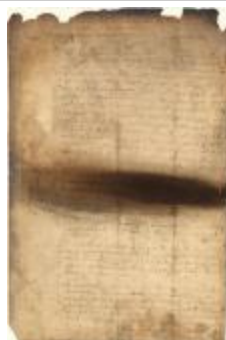
Dutch colonial council minutes, 21 February - 11 March 1647 (NYSA_A1809-78_V04_p284-285)