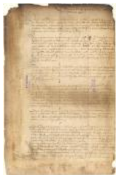
Dutch colonial council minutes, 4 July 1647 (NYSA_A1809-78_V04_p304)