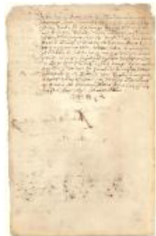
Permit to Jean Labatie of Fort Orange to build a house within the fort and to brew therein (NYSA_A0270-78_V2_157e)