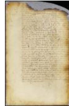
Patent of Jan for a land on Manhattan Island (NYSA_A1880-78_VGG_0201)