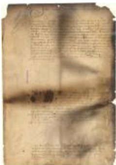
Dutch colonial council minutes, 27 May 1647 (NYSA_A1809-78_V04_p287)