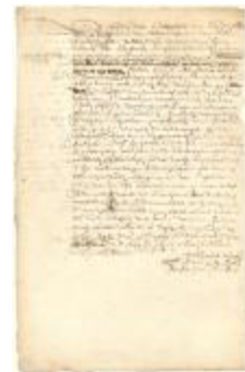
Deed from Sibout Claessen to Pieter Cock of a lot on Manhattan Island, near the garden of Jan Damen (NYSA_A0270-