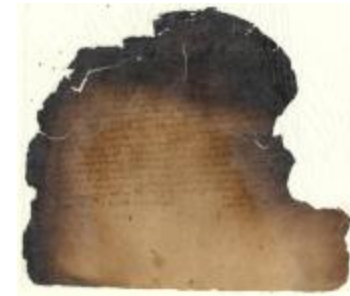
Response of Governor Winthrop and the commissioners of the United Colonies to Petrus Stuyvesant (NYSA_A1810- 78_V11_02b)