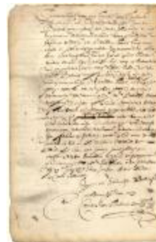
Bond of Jonathan Brewster of New Plymouth to Willem Turck for duffel cloth delivered to him (NYSA_A0270-78_V2_160l)