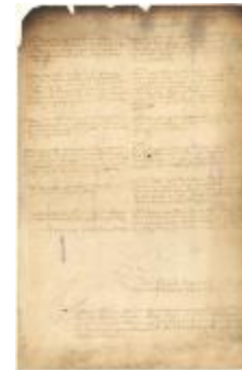
Dutch colonial council minutes, 11-15 November 1647 (NYSA_A1809- 78_V04_p349-351)