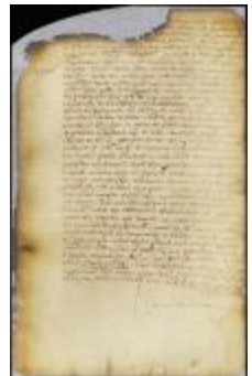
Patent of Peter Lourensz for a lot on Manhattan Island (NYSA_A1880-78_VGG_0202)