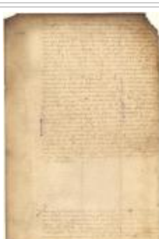
Dutch colonial council minutes, 25 July - 20 September 1647 (NYSA_A1809- 78_V04_p324-331)