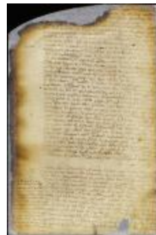
Patent of Tonis Kray for a lot on Manhattan Island (NYS_A1880-78_VGG_0214b)