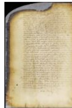
Patent of Cosyn Gerritsz for land on Manhattan Island (NYSA_A1880-78_VGG_0186)