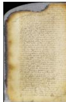
Patent of Tonis Nysen for a lot on Manhattan Island (NYSA_A1880-78_VGG_0208)