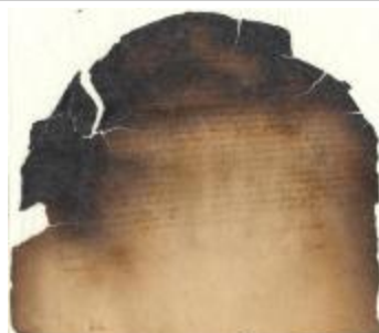
Letter from Governor Eaton to Director General Stuyvesant (NYSA_A1810-78_V11_05c)