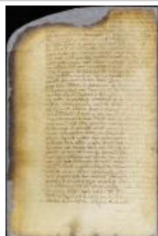
Patent of Lammert van Valeckenborch for a lot on Manhattan Island (NYS_A1880-78_VGG_0192)