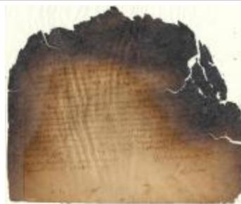
Letter from Stuyvesant to Jeremy Clarke, president of Rhode Island (NYSA_A1810-78_V11_03c)