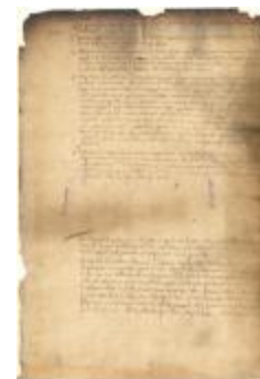
Dutch colonial council minutes, 16 July 1647 (NYSA_A1809-78_V04_p307)