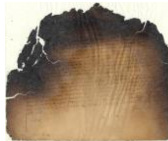
Second letter from Governor Eaton of New Haven to Director General Stuyvesant (NYSA_A1810-78_V11_03e)