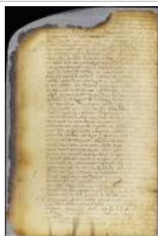
Patent of Jan Jansen van Dittersz for land on Long Island (NYS_A1880-78_VGG_0196)