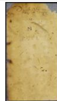
Title page (NYSA_A1875-78_V16_pt1_i)