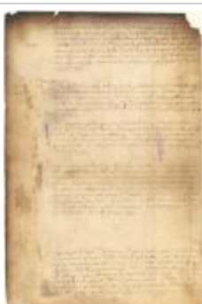
Dutch colonial council minutes, 18-22 July 1647 (NYSA_A1809-78_V04_p316)