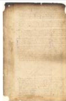
Dutch colonial council minutes, 18 July 1647 (NYSA_A1809-78_V04_p310)