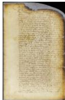
Patent of Gerrit Wolphertsen van Couwenhoven for land on Long Island (NYSA_A1880-78_VGG_0172)