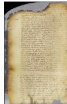
Patent of Jan Pietersen for a lot on Long Island (NYSA_A1880-78_VGG_0204b)