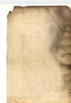
Dutch colonial council minutes, 22 September 1647 (NYSA_A1809- 78_V04_p333)