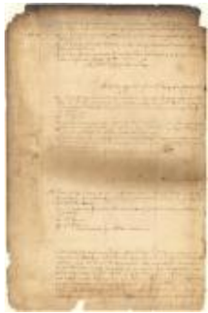
Dutch colonial council minutes, 14 June 1647 (NYSA_A1809-78_V04_p294-295)