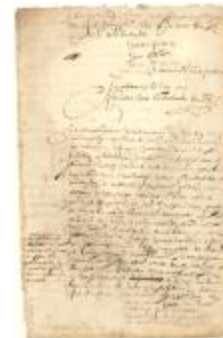
Promisory note of Egbert Woutersen to Dirck Cornelissen for carpenter's wages (NYSA_A0270-78_V2_158d)