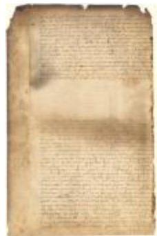
Dutch colonial council minutes, 3 July 1647 (NYSA_A1809-78_V04_p300-301)