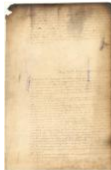
Dutch colonial council minutes, 28 September - 10 October 1647 (NYSA_A1809-78_V04_p339-343)