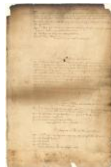
Dutch colonial council minutes, 14 June 1647 (NYSA_A1809-78_V04_p293)