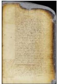
Patent of Olof Stevensz van Cortland for a lot on Manhattan Island (NYSA_A1880-78_VGG_0179)