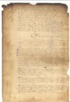
Dutch colonial council minutes, 18 July 1647 (NYSA_A1809-78_V04_p308)