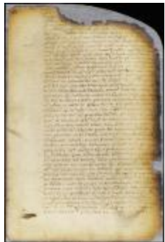
Patent of Claes van Elslant for land on Manhattan Island (NYSA_A1880-78_VGG_0183)