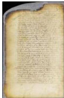
Patent of Thomas Bacxter for a lot on Manhattan Island (NYSA_A1880-78_VGG_0180)