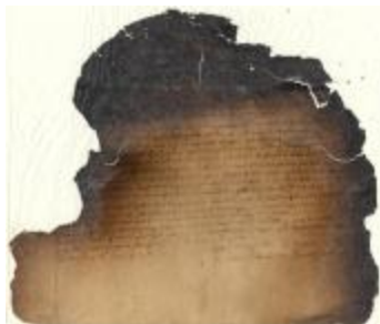
Letter from Governor William Bradford of New Plymouth to Petrus Stuyvesant (NYSA_A1810-78_V11_03a)