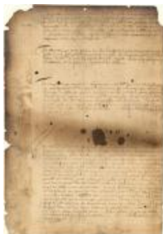
Dutch colonial council minutes, 27 May - 6 June 1647 (NYSA_A1809-78_V04_p288)