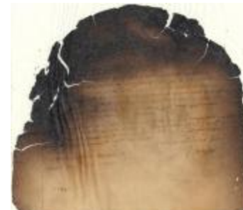
Letter from Director General Stuyvesant to Deputy Governor Goodyear of New Haven (NYSA_A1810-78_V11_04d)