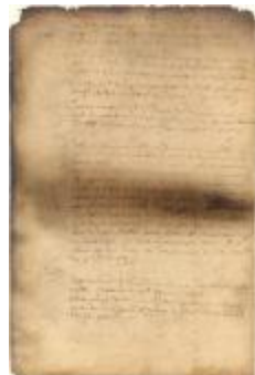
Dutch colonial council minutes, 17 January 1647 (NYSA_A1809-78_V04_p282)