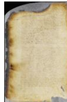
Patent of Daniel ——— for land on Manhattan Island (NYSA_A1880- 78_VGG_0220a)