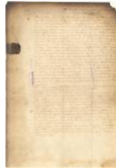
Dutch colonial council minutes, 28 September 1647 (NYSA_A1809- 78_V04_p336)