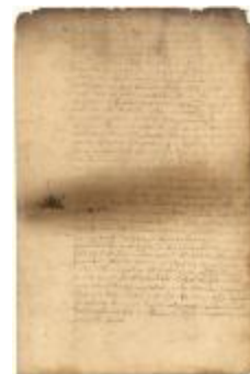
Dutch colonial council minutes, 16 January 1647 (NYSA_A1809-78_V04_p281)