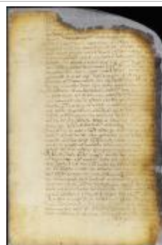
Patent of Claes Carstensen Noorman for land on the west side of the North river (New Jersey) (NYS_A1880-78_VGG_0197)