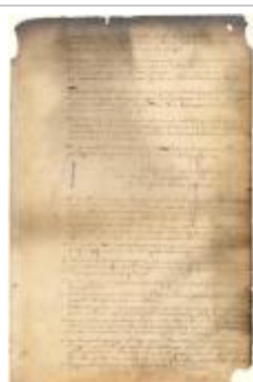
Dutch colonial council minutes, 18 July 1647 (NYSA_A1809-78_V04_p309)