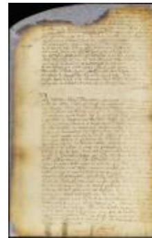
Patent of Bastiaen for land on Manhattan Island (NYSA_A1880-78_VGG_0200)