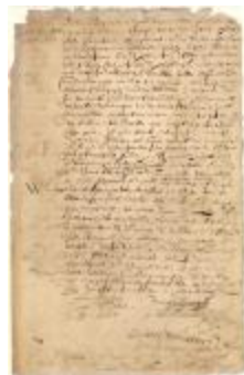
Bill of sale of the ship Amandare from Directors Stuyvesant and Kieft to Thomas Broughton (NYSA_A0270-78_V2_156a)