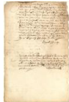
Counter bond by Willem Tomassen (NYSA_A0270-78_V2_164c)