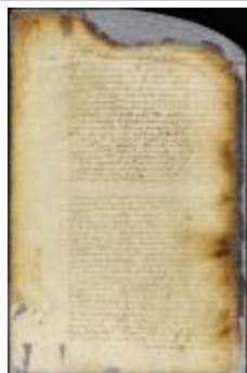
Patent of Isaac d'Foreest for land on Manhattan Island (NYSA_A1880- 78_VGG_0219a)