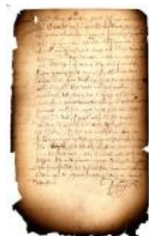
Memorandum Concerning the Sighting of a White Whale in the River Before Fort Orange (NYSL_sc7079_dehooghes-memo-