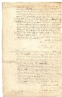
Power of attorney from Sibout Claessen to Harmen Bastiaensen to collect the balance of the purchase money for a house and lot