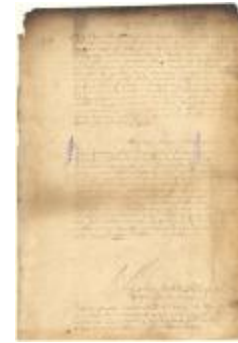
Dutch colonial council minutes, 18 July 1647 (NYSA_A1809-78_V04_p311)