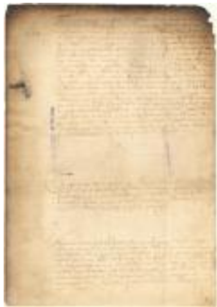
Dutch colonial council minutes, 28 September 1647 (NYSA_A1809- 78_V04_p338)