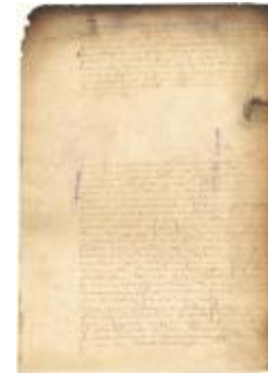
Dutch colonial council minutes, 28 September 1647 (NYSA_A1809- 78_V04_p337)