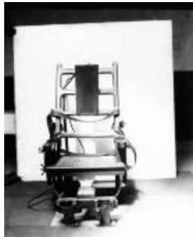
Front view of Sing Sing Prison electric chair (NYSA_B1514-97_B1_005)