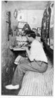
Inmate inside of Sing Sing Prison cell (NYSA_B1514-97_031)