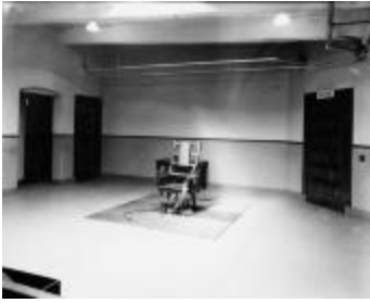
Sing Sing Prison electric chair (NYSA_B1514-97_001)