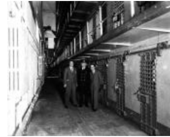
Row of Cells at Sing Sing Prison (NYSA_B1514-97_019)