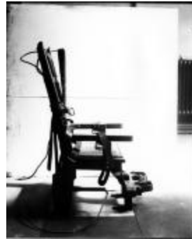
Side view of Sing Sing prison electric chair (NYSA_B1514-97_004)