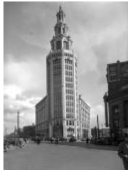
Niagara Mohawk "Electric Building" in Buffalo, New York. October 17, 1937 (NYSA_A0245-77_Erie_B03_50)