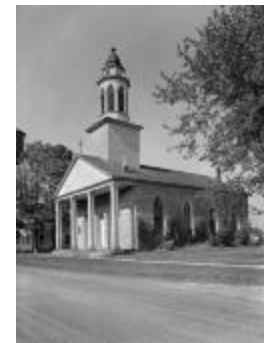
Christ Episcopal Church in Sackets Harbor, New York. May 15, 1938