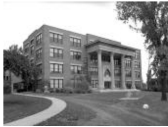
John Rogers Hegeman Hall at Keuka College in Penn Yan, New York. October 10, 1937