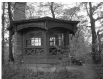
Mark Twain Study in Elmira, New York. October 20, 1937