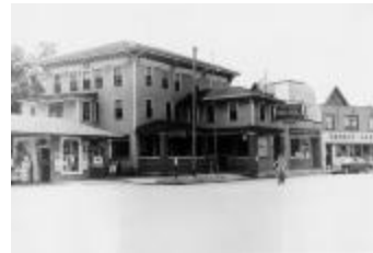
Arcade Hotel in Arcade, New York (NYS_A0245-77_Wyoming_B23_31)