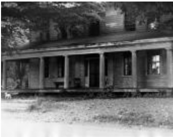
Folsom House located in Folsomdale, New York (NYS_A0245-77_Wyoming_B22_65)