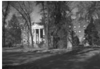
Knox School in Cooperstown. October 12, 1941