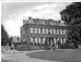
Van Cortland Manor House in the Van Cortland Park, Bronx, New York. June 25, 1938 (NYSA_A0245-77_Bronx_B02_14)