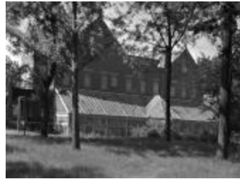
Home of Charles Steinmetz in Schenectady, New York. June 21, 1941