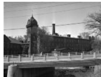
Bischoff Chocolate Factory in Ballston Spa, New York. April 26, 1941 (NYSA_A0245-77_Saratoga_B14_26)