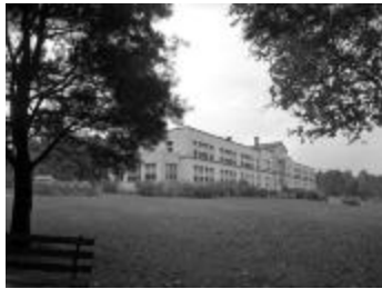
Warren County Sanatorium in Lake George, New York. September 27, 1938 (NYSA_A0245-77_Warren_B21_57)