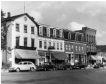
Krull's Store in Attica, New York (NYS_A0245-77_Wyoming_B23_56)