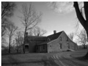
Schuyler Home - "The Flatts" in Watervliet, November 20, 1941 (NYSA_A0245-77_Albany_B01_09)