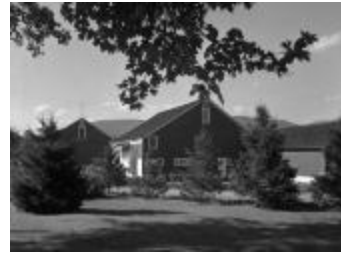
Woodstock School of Painting Studio in Woodstock, New York. September 9, 1937 (NYSA_A0245-77_Ulster_B21_30)