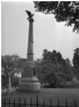
Monument marking the resting place of Colonel Elmer Ephraim Ellsworth in Saratoga Springs. July 29, 1941