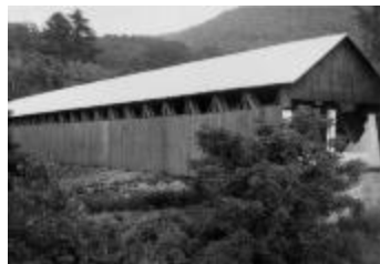
Blenheim Bridge in North Blenheim, New York (NYSA_A0245-77_Schoharie_B20_34_A)