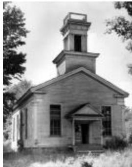
Old Johnsonburg Congregational Church in Sheldon, New York (NYS_A0245-77_Wyoming_B23_7)