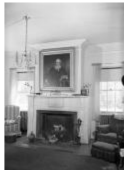
Gerrit Smith Portrait in Peterboro, New York. August 29, 1941 (NYS_A0245- 77_Madison_B08_66)