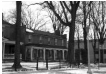
Red Brick Tavern in Gouverneur, New York. February 28, 1937 (NYSA_A0245-77_SaintLawrence_B12_33)