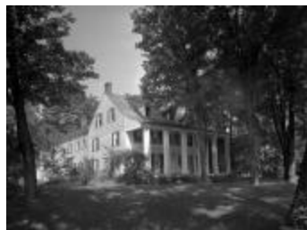
Brookside Tavern in Ballston Spa, New York. August 8, 1942