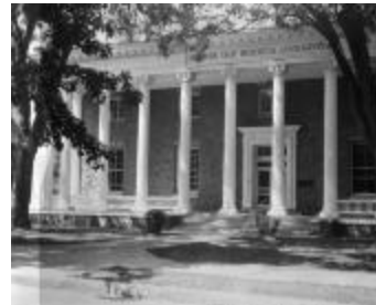
Headquarters of the New York State Historical Association in Cooperstown, New York. October 15, 1941