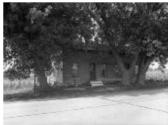
Otis House, located South of Henderson Harbor, New York. September 24, 1937 (NYSA_A0245-77_Jefferson_B05_16)