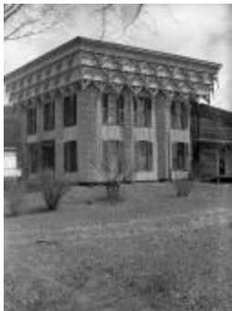
"Wedding Cake House" in Georgetown, New York. April 19, 1938 (NYS_A0245- 77_Madison_B08_61)