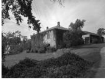
Gouverneur Morris' home in Gouverneur, New York. September 20, 1937 (NYSA_A0245-77_SaintLawrence_B12_40)