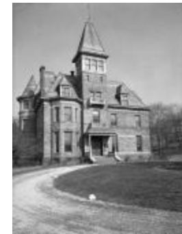
Yonkers Science Museum, February 5, 1938 (NYSA_A0245-77_Westchester_B22_40)