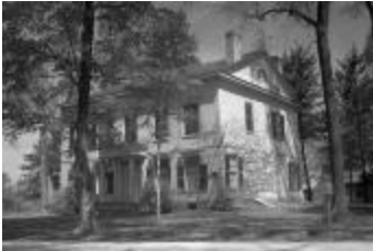
Old Court House in Clavarak, New York. May 16, 1937 (NYSA_A0245-77_Columbia_B02_60)