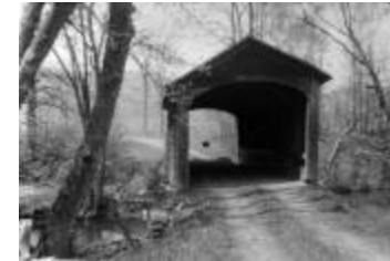
Hyde Hall Bridge in East Springfield, New York (NYSA_A0245-77_Otsego_B11_58)