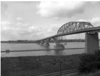
Peace Bridge in Buffalo, New York. October 13, 1937 (NYSA_A0245-77_Erie_B03_41)