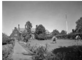
Sarah Lawrence College in Yonkers, New York