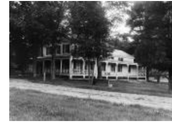
Dowling House in Lake George, New York (NYSA_A0245-77_Warren_B21_44)