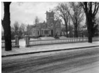
"The Pink House", Wellsville (NYSA_A0245-77_Allegany_B02_12)