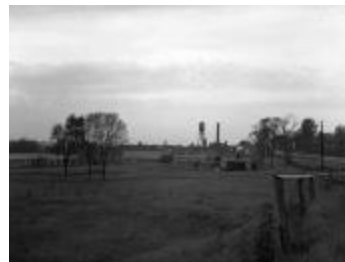
Imperial Paper and Color Corporation Plant in Glens Falls, New York. September 27, 1938 (NYSA_A0245-77_Warren_B21_62)