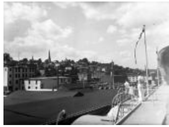
Photograph of Newburgh from Day Line Steamer. July 1937 (NYSA_A0245-77_Orange_B11_36)