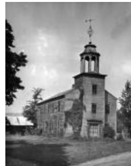
Universalist Church in Greenfield, New York. July 8, 1941