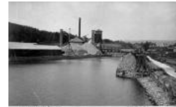
Crown Point Iron Company Furnaces in Crown Point, New York (NYSA_A0245-77_Essex_B04_7)