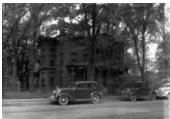
Langdon House, Church and Main Streets in Elmira, New York. September 5, 1927 (NYSA_A0245-77_Chemung_B02_36)