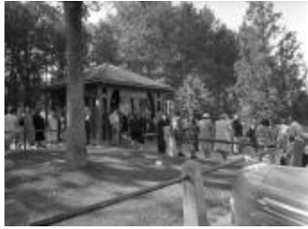
Hathorn Spring in Saratoga Springs, New York. August 11, 1941