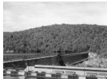
Spiers Falls Power Dam in Glens Falls, New York, 1938