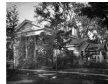
Madame Jumel Mansion in Saratoga Springs, New York. August 7, 1941 (NYSA_A0245-77_Saratoga_B14_28)