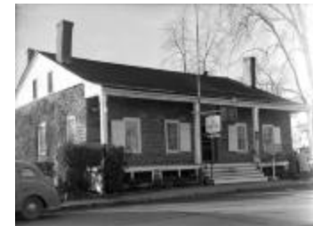
The Old '76 Tappan House in Tappan, New York. October 1948 (NYSA_A0245-77_Rockland_B12_30)