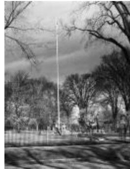
Montcalm Park in Oswego, New York (NYSA_A0245-77_Oswego_B11_55)