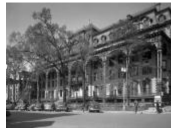
United States Hotel in Saratoga Springs, New York. May 15, 1939