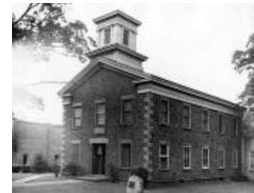
Cobblestone Masonic Temple in Warsaw, New York (NYS_A0245-77_Wyoming_B25_32)