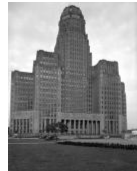
City Hall in Buffalo, New York. October 12, 1937 (NYSA_A0245-77_Erie_B03_37)