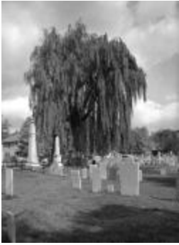
Pioneer Cemetery in Canandaigua, New York. October 11, 1937 (NYSA_A0245-77_Ontario_B11_30)