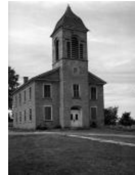
Esperance Presbyterian Church in Esperance, New York