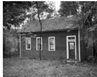
Red School House in Wyoming County, New York (NYS_A0245-77_Wyoming_B24_25)