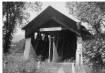
Blenheim Bridge in North Blenheim, New York (NYSA_A0245-77_Schoharie_B20_34_B)