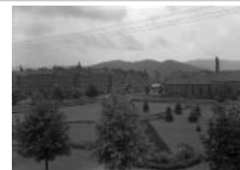
St. Bonaventure College in Olean, New York, 1937 (NYSA_A0245-77_Cattaraugus_B02_18)