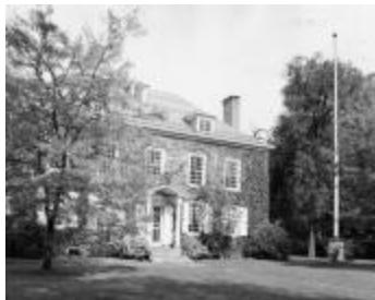
Fort Johnson in Amsterdam, New York. June 17, 1941 (NYS_A0245- 77_Montgomery_B09_10)