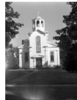
Roman Catholic Church in Leicester, New York