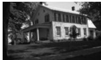
Quaker Homestead in Philadelphia, New York