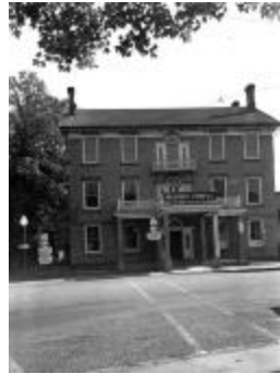
Masonic Temple in Caledonia, New York (NYS_A0245-77_Livingston_B06_30)