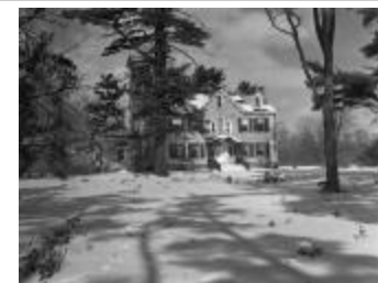
Van Buren House in Kinderhook, March 7, 1947 (NYSA_A0245-77_Columbia_B02_59)