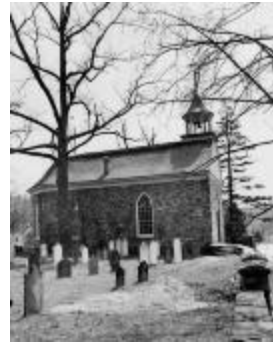
Sleepy Hollow Church in Tarrytown, New York. April 13, 1938 (NYS_A0245-77_Westchester_B22_45_B)