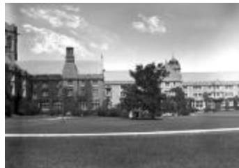
Emma Willard School in Troy, New York. September 26, 1936