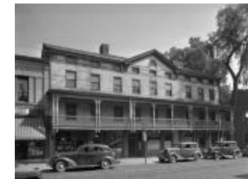
Medbery Hotel in Ballston Spa, New York. July 25, 1941 (NYSA_A0245-77_Saratoga_B13_50)