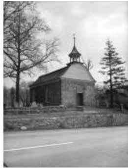
Old Dutch Church of Sleepy Hollow in Tarrytown, New York. April 13, 1938 (NYS_A0245-77_Westchester_B22_45_A)