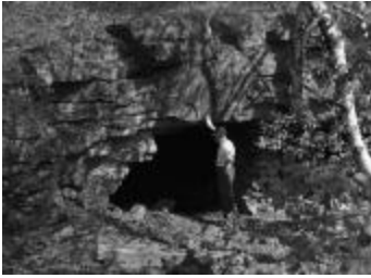
The Old Iron Mine in Ironville, New York. September 6, 1941 (NYSA_A0245-77_Essex_B04_17)