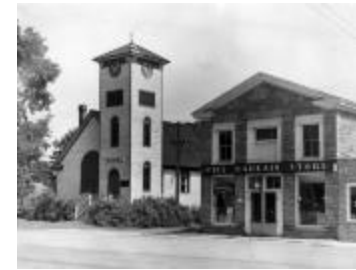
Pike Grange Hotel in Pike, New York (NYS_A0245-77_Wyoming_B23_41)