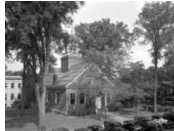
Fulton County Courthouse, in Johnstown, New York. September 10, 1941 (NYSA_A0245-77_Fulton_B04_31)