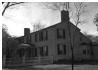
Kent-Delord House, Headquarters of the British Army in Plattsburgh, New York. May 12, 1937.