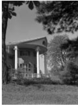
The "Turtle" House, Greenport, New York, October 4, 1938. (NYSA_A0245-77_Columbia_B02_69)