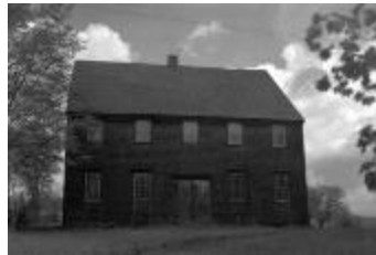
Quaker Meeting House, Quaker Hill, New York. May 17, 1937 (NYSA_A0245-77_Dutchess_B03_28)