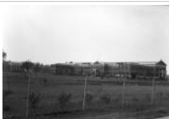
Ann Lee Home - Albany Airport, September 11, 1936 (NYSA_A0245-77_Albany_B01_11)