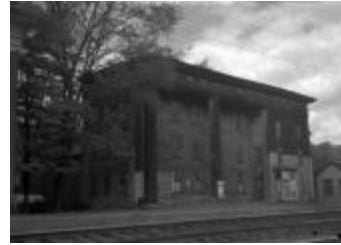
Old American House in Delaware County, New York. May 24, 1937 (NYSA_A0245-77_Delaware_B02_75)