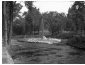
Hayes Spring Geyser in Saratoga Springs, New York. July 1941