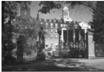
Otesaga Hotel (in summer) in Cooperstown, New York. October 12, 1936 (NYSA_A0245-77_Otsego_B11_63_A)