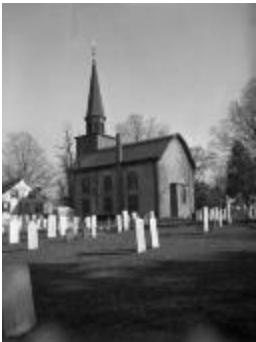
Dutch Reformed Church, Fishkill, April 13, 1938 (NYSA_A0245-77_Dutchess_B03_23)