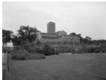
The Cloisters in Fort Tryon Park in New York. August 7, 1938 (NYS_A0245-77_NewYork_B09_70)