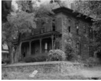
Clara Barton's Home in Dansville, New York (NYS_A0245-77_Livingston_B05_58)