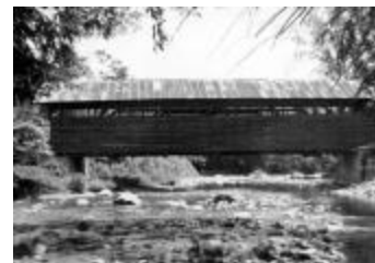
Wagner's Hollow Bridge in Palatine, New York (NYS_A0245- 77_Montgomery_B09_19_A)