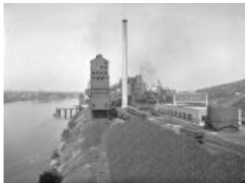
Niagara Hudson Coke Plant in Troy, New York. September 30, 1937 (NYSA_A0245-77_Rensselaer_B12_9)