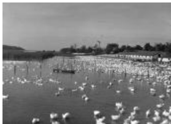
Duck Farm in Long Island, New York. June 16, 1938 (NYSA_A0245-77_Suffolk_B20_48)