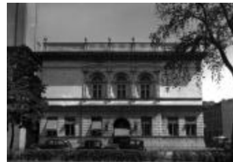
Hart Memorial Library in Troy, New York. September 23, 1936