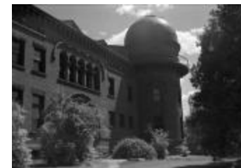
Dudley Observatory and Bender Lab in Albany, 1936 (NYSA_A0245-77_Albany_B01_15)