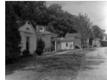
Village Street in Cooperstown, New York. June 1935 (NYSA_A0245-77_Otsego_B12_3)