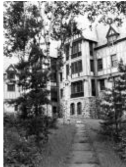
Will Rogers Memorial Hospital. Saranac Lake (NYSA_A0245-77_Franklin_B04_25)