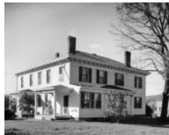
Tavern and Shoemaker in Herkimer County. August 23, 1941 (NYSA_A0245-77_Herkimer_B04_61)