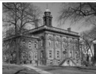
Old Boy's Academy in Albany, 1817 (NYSA_A0245-77_Albany_B01_14)