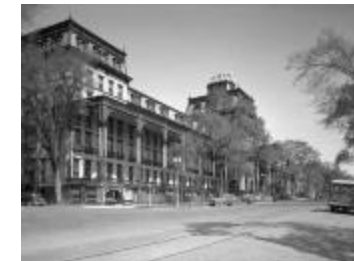
Grand Union Hotel in Saratoga Springs, New York. May 15, 1939 (NYSA_A0245-77_Saratoga_B12_57)