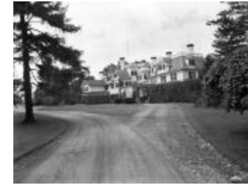
Wadsworth Homestead, Geneseo (NYS_A0245-77_Livingston_B08_32)