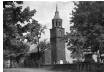
Saint Paul's Church in Mount Vernon, New York. May 17, 1937 (NYSA_A0245-77_Westchester_B22_39)