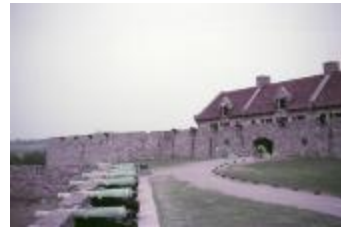
Views of Fort Ticonderoga in Ticonderoga, New York. July 14, 1938 (NYSA_A0245-77_Essex_B03_83)