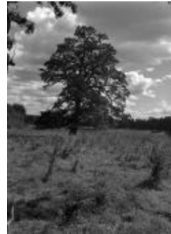
Site of the Treaty of Big Tree in Geneseo, New York (NYS_A0245- 77_Livingston_B07_12)