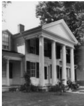
Barlow House in Wyoming Village, New York (NYS_A0245-77_Wyoming_B24_11)