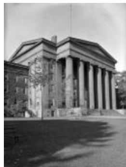
Utica Psychiatric Center located in Utica, October 7, 1937 (NYS_A0245-77_Oneida_B10_33)