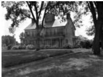
Smyth Home and Tavern located in Fort Edward, New York