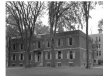
Crandall Public Library in Glens Falls, New York. September 28, 1938