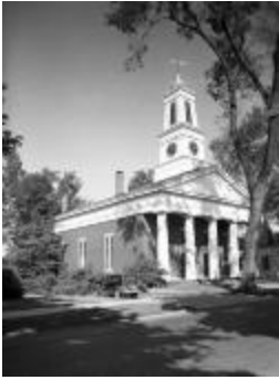
Trumansburg First Presbyterian Church of Ulysses in Trumansburg, August 28, 1938 (NYSA_A0245-77_Tompkins_B21_6)