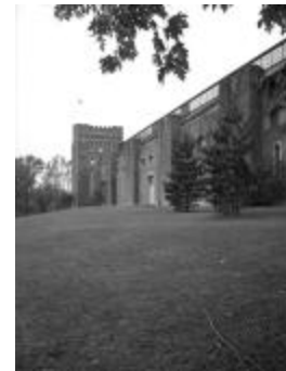
Cornell Armory in Ithaca, New York. October 21, 1937 (NYSA_A0245-77_Tompkins_B21_5)