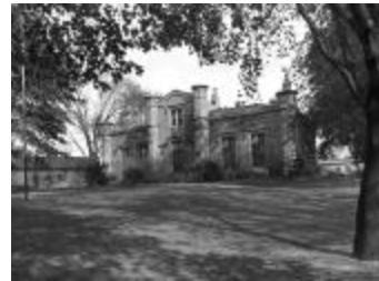
MacKaye Castle in Buffalo, New York. October 24, 1937 (NYSA_A0245-77_Erie_B03_24)