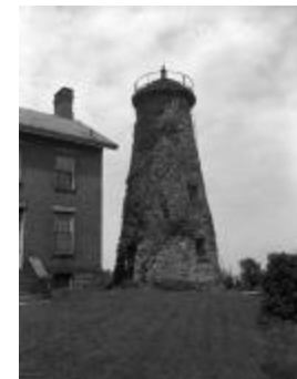
Charlotte-Genesee Lighthouse in Rochester, New York. July 15, 1937 (NYS_A0245-77_Monroe_B08_75)