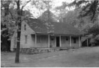
Washington's Headquarters in White Plains, New York. May 17, 1937 (NYS_A0245-77_Westchester_B22_43)