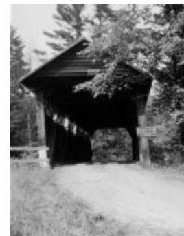
Wagner's Hollow Bridge in Palatine, New York (NYS_A0245- 77_Montgomery_B09_19_B)