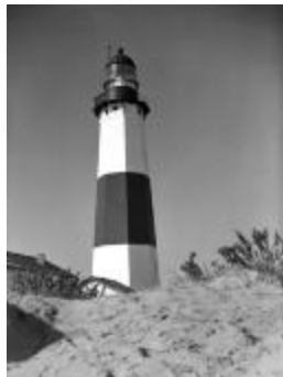
Montauk Point Lighthouse in East Hampton, New York. October 8, 1938 (NYSA_A0245-77_Suffolk_B20_52)