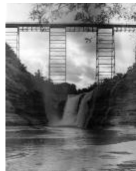
Erie Railroad Bridge over the Upper Falls of the Genesee River in Letchworth Park (NYSA_A0245-77_Livingston_B05_33)