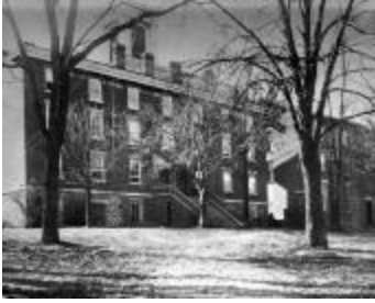
Starkey Seminary Sunshine Lodge in Lakemont, New York. August 19, 1941