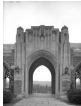
War Memorial in Ithaca, New York