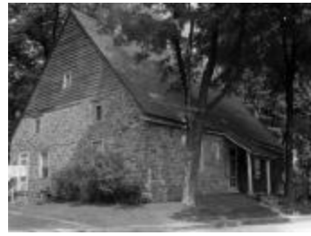
Jean Hasbrouck House in New Paltz, New York (NYSA_A0245-77_Ulster_B21_14)