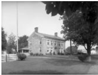
Swarts Tavern in Schoharie, New York. August 31, 1937 (NYSA_A0245-77_Schoharie_B20_25)