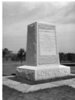
Memorial of General Thaddeus Kosciuszko in Saratoga Battlefield in Schuylerville. July 15, 1941 (NYSA_A0245-