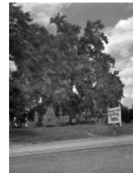
The Scythe Tree in Seneca County, New York. August 23, 1941