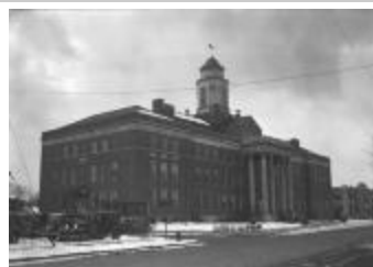
International Business Machines Corporation, Johnson City, New York. February 28, 1937