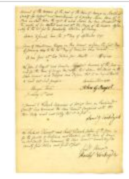
Payment for children born to enslaved persons in Orangetown, March 9, 1816 (NYSA_A0827-