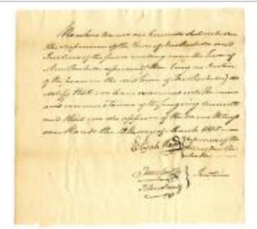
Payments for children born to enslaved persons in New Rochelle, March 21, 1805 (NYSA_A0827-78_B1_F05_New_Rochelle_p13-15)