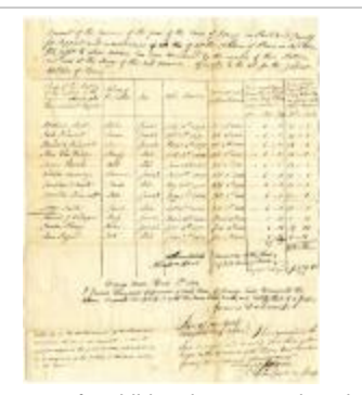
Payment for children born to enslaved persons in Orangetown, April 28, 1802 (NYSA_A0827-