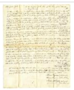
Payments for children born to enslaved persons in New Utrecht, February 13, 1802 (NYSA_A0827-