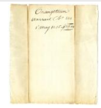
Payment for children born to enslaved persons in Orangetown, May 8, 1805 (NYSA A0827-