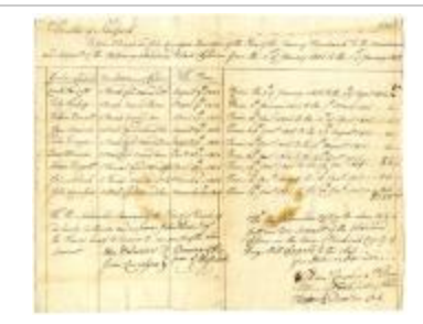
Payments for children born to enslaved persons in Bushwyck, February 3, 1808 (NYSA_A0827-78_B1_F02_Bushwyck_p09)