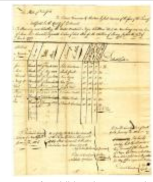
Payments for children born to enslaved persons in Northfield, February 4, 1806 (NYSA_A0827-78_B1_F08_Northfield_p01)