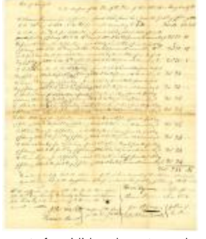
Payments for children born to enslaved persons in New Utrecht, March 14, 1804 (NYSA_A0827-