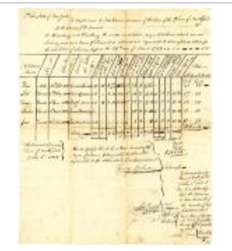
Payments for children born to enslaved persons in Northfield, October 13, 1802 (NYSA_A0827-78_B1_F08_Northfield_p04)