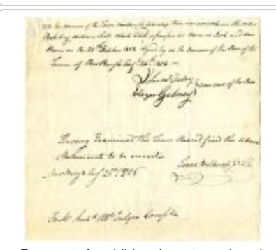
Payments for children born to enslaved persons in Newburgh, August 26, 1806 (NYSA_A0827-78_B1_F03_Newburgh_p03)