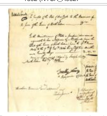
Payment for children born to enslaved persons in North Salem, February 7, 1806 (NYSA A0827-