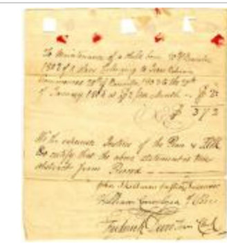
Payments for children born to enslaved persons in Bushwyck, January 20, 1804 (NYSA A0827-78 B1 F02 Bushwyck p10)