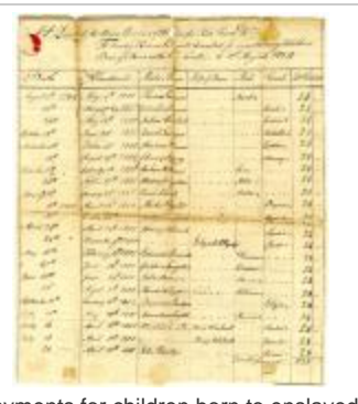
Payments for children born to enslaved persons in Newtown, February 3-December 4, 1804 (NYSA_A0827-