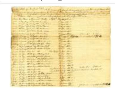
Payments for children born to enslaved persons in Newtown, November 28, 1803 (NYSA_A0827-78_B1_F06_Newtown_p03)