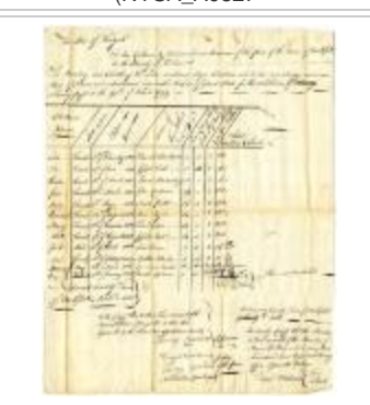
Payments for children born to enslaved persons in Northfield, March 7, 1805 (NYSA_A0827-78_B1_F08_Northfield_p02)