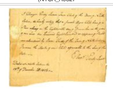
Certification of birth and abandonment of a child born to enslaved persons in North Salem, December 19, 1803 (NYSA_A0827-78_B1_F10_North_Salem_p05)