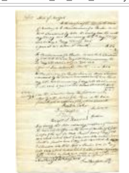
Payments for children born to enslaved persons in Newburgh, March 20, 1805 (NYSA_A0827-78_B1_F03_Newburgh_p01)