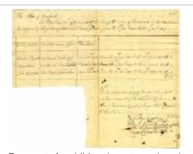
Payments for children born to enslaved persons in Bushwyck, February 13, 1808 (NYSA_A0827-78_B1_F02_Bushwyck_p01)