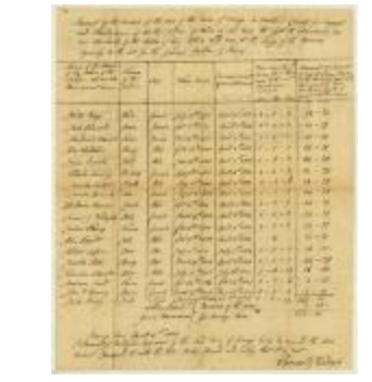
Account of the Overseers of the Poor of the Town of Orange (NYSA_A0827-78_Rockland_Orange)