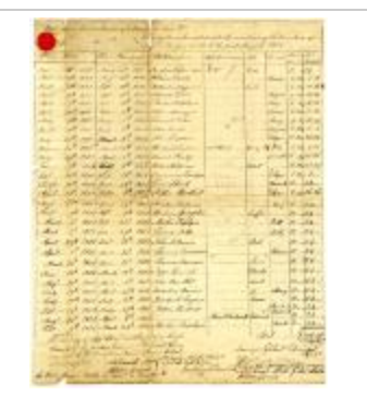
Payments for children born to enslaved persons in Newtown, December 6, 1805 (NYSA_A0827-78_B1_F06_Newtown_p04)