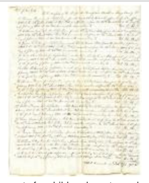
Payments for children born to enslaved persons in New Utrecht, February 21, 1803 (NYSA_A0827-