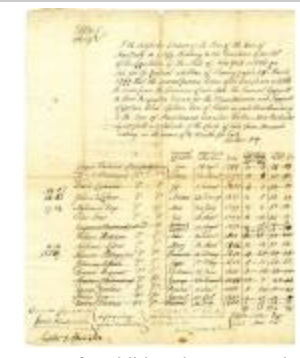
Payments for children born to enslaved persons in New Paltz, April 1, 1802 (NYSA_A0827-78_B1_F04_New_Paltz_p01)