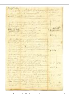
Payment for children born to enslaved persons in North Hempstead, March 26, 1804 (NYSA_A0827-