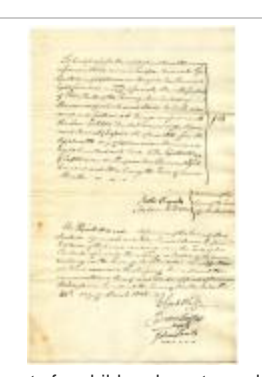
Payments for children born to enslaved persons in New Rochelle, May 10, 1807 (NYSA_A0827-