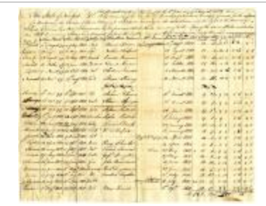
Payments for children born to enslaved persons in Newtown, September 23, 1802 (NYSA A0827-78 B1 F06 Newtown p02)