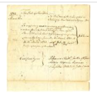
Payment for children born to enslaved persons in North Hempstead, October 2, 1802 (NYSA_A0827-