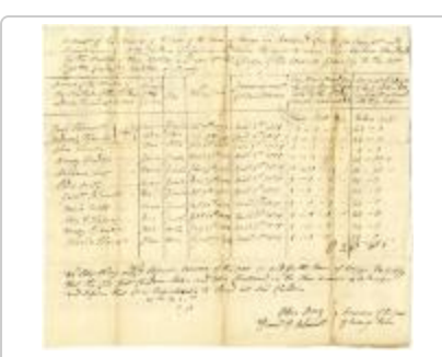
Payment for children born to enslaved persons in Orangetown, May 20, 1806 (NYSA_A0827-78_B1_F11_Orangetown_p02)