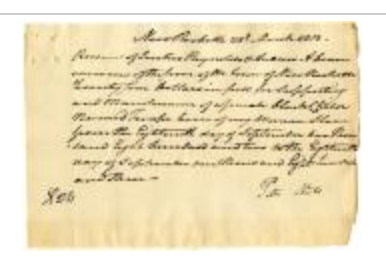
Payment for child named Temple born to enslaved persons in New Rochelle, March 23, 1803 (NYSA_A0827-78_B1_F05_New_Rochelle_p06)