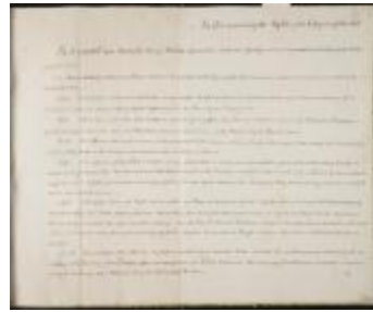
An Act concerning the rights of the citizens of this state (NYSA_13036-78_L1787_Ch001)