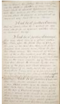
An Act relative to slaves and servants (NYSA_13036-78_L1817_Ch137_p2)