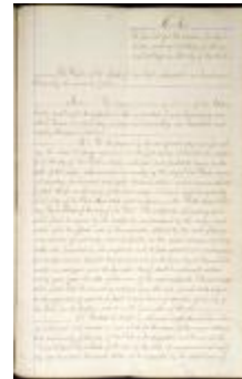
An Act to provide the erection of school houses and a building for the normal college in the City of New York, 1871 (NYSA_13036-78_L1872_Ch150)