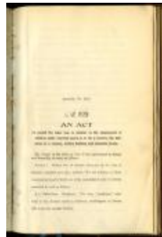
An Act to amend the labor law, in relation to the employment of children under fourteen years old in or for a factory, the definition of