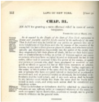
An Act for granting a more effectual relief in cases of certain trespasses (NYSA_13036-78_L1783_Ch031_printed)