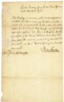
Claim of Jellis Fonda for land described in an Indian deed, 1784 (NYSA_A0272- 78_V37_p055a)