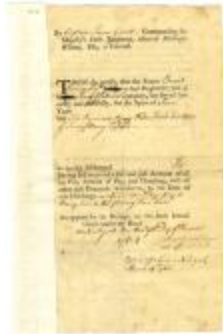
Certificate that Edmond Bowman served as serjeant in the 80th regiment, 1764 (NYSA_A0272-78_V40_p005)