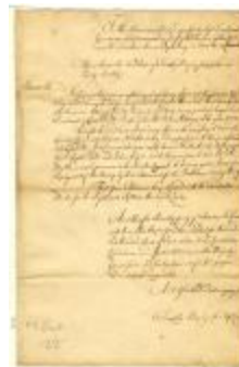
Petition of Timothy Bagley and others, praying a patent for 6000 acres of land (NYSA_A0272-78_V13_p006)