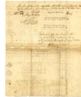
Certification of Indian deed to David Prym, 1766 (NYSA_A0272-78_V21_p165_s2)