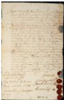
Indian deed to Isaac Swits for a tract of land, August 16, 1707 (NYSA_A0272-78_V04_p120b)