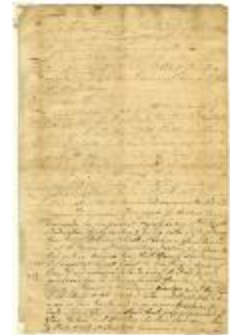
Petition of Lauchlin Campbell for land (NYSA_A0272-78_V13_p060)