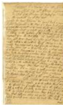
Description of a survey of two several tracts of land containing 1,000 acres each (NYS A_0272-78_V13_p045)