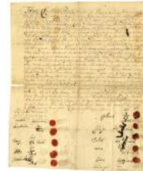
Indian deed to Peter Brower, for land on the south side of the Mohawk river, 1772 (NYSA_A0272-78_V32_p034)