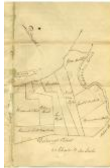
Map of land in Glen, Montgomery county, 1789 (NYSA_A0272-78_V48_p060_s7)