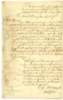
Petition of Edward Clarke, praying a patent for 600 acres of land (NYSA_A0272-78_V13_p028)