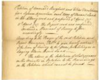
Copy of petition of Coenraat Borghardt and Elias Van Schaack, to purchase land, 1762 (NYSA_A0272-78_V16_p110b)