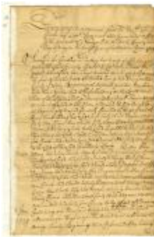
Return of a survey for Cornelius Dubois of two tracts of land (NYS A_0272-78_V13_p041)