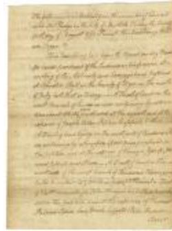
Proceedings of the colonial council, regarding petitions for purchasing land from the Indians (NYSA_A0272-78_V43_p020)