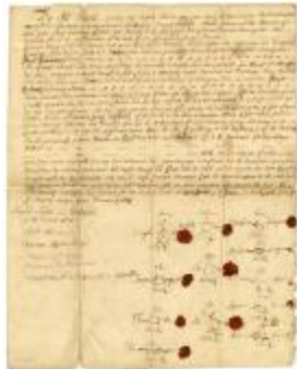
Indian deed to Peter Winne and others of land on the east side of the Hudson River, 1734 (NYSA_A0272-78_V11_p100)