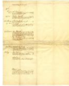
List of caveats (NYSA_A0272-78_V13_p010)