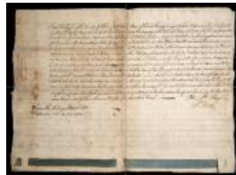
Deed from Mohawk Indians, 1751 (NYSA_A0272-78_V26_p127)