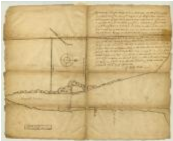
Survey of land near Hempstead Harbor, Long Island, 1683 (NYSA_A0272- 78_V02_p012)