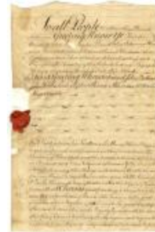
Indian deed for land on the south of the Mohawk River, 1769 (NYSA_A0272-78_V25_p057c)