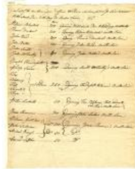
List of soldiers who have petitioned for land between Rattle Snake Den and Bay de Roches Fendu (NYSA_A0272-78_V40_p001e)