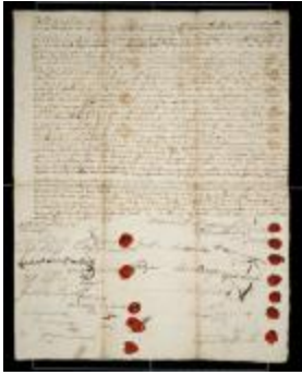
Indian deed to Lewis Morris and others for land south of the Mohawk river, September 6, 1722 (NYSA_A0272-78_V08_p190)