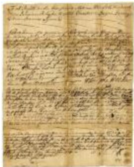
Indian deed to Petrus Van Driesen for land on the Mohawk river, 1731 (NYSA_A0272-78_V40_p095)