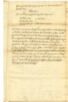
Order in council to regulate the ferriage or toll fees of the ferry referred to (NYSA_A0272-78_V13_p024b)