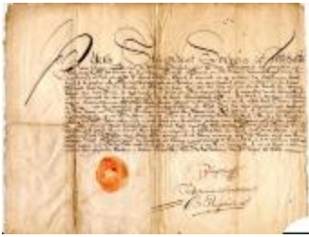
Deed signed by Peter Stuyvesant (NYSA_A0272-78_V01_p007)