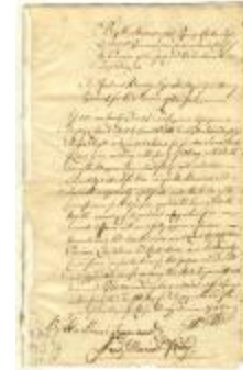
Warrant for patents for Arent Brat and others (NYSA_A0272-78_V13_p019)