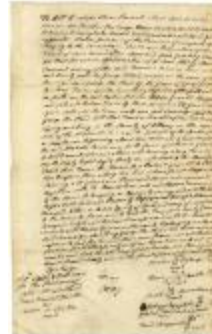
Indian deed copy to George Klock, 1761 (NYSA_A0272-78_V37_p148d)