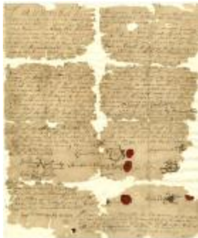
Indian deed to Rebecca Scot for land south of the Mohawk river, 1715 (NYSA_A0272-78_V06_p139b)