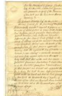
Warrant for a patent, to Arent Bratt and others, for four several tracts of land (NYSA_A0272-78_V13_p056a)