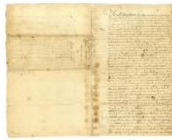
Indian deed to Jellis Fonda and associates, for land on the west side Canada creek or Wood creek, 1772 (NYSA_A0272-78_V32_p041)