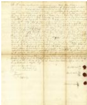
Indian deed to Captain Johan Jost Herkimer, 1751 (NYSA_A0272-78_V14_p118)