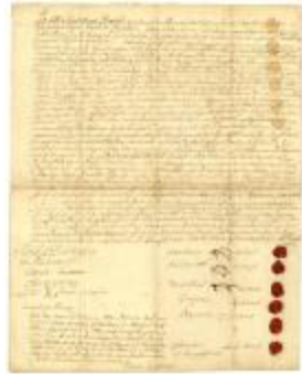
Indian deed to Lewis Morris and others for land south of the Mohawk river and islands, 1722 (NYSA_A0272-78_V08_p193)