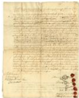
Indian deed to Walter Butler for land near Fort Hunter, 1735, with assignment of land, 1737 (NYSA_A0272-78_V12_p086)