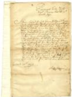
Land in manor of St. George, Long Island, 1693 (NYSA_A0272-78_V02_p217)