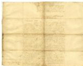
Application for Land Grant, Willem Tietsoort, Orange County, 1707 (NYSA_A0272-78_V04_p104)