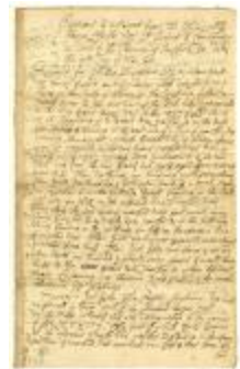
Return of a survey for Philip Livingston and others, for lands on the Mohawk River (NYSA_A0272-78_V13_p054)