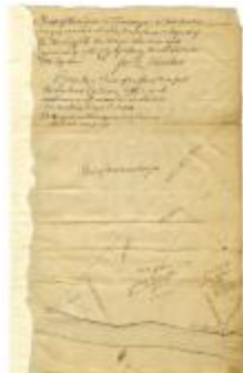
Map of the Albany Corporation lands, 1783 (NYSA_A0272-78_V47_p019)