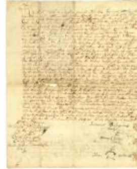
Indian deed to Stephen Bayard and others of land near the Kinderhook River, 1741 (NYSA_A0272-78_V13_p111)