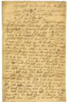
Return of a survey of land for Arent Bratt and others, west of Schoharie (NYSA_A0272-78_V13_p053)