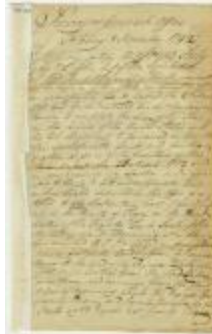
Return of survey, and map of the same, for Jonas Seely (NYSA_A0272-78_V53_p130)