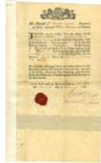
Certificate that Conrad Bool served as a soldier and corporal in the 3rd battalion 60th regiment, 1764 (NYSA_A0272-78_V40_p001f)