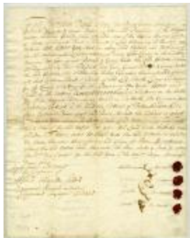
Indian deed to Hilleite Van Olinda, October 6, 1704 (NYSA_A0272-78_V04_p027b)