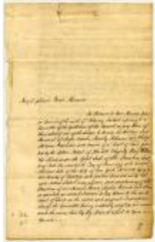
Report of the committee of council relating to Philipse Manor, 1765 (NYSA_A0272-78_V18_p142)