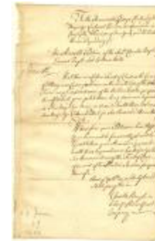
Petition of Charles Boyle and others, for license to purchase 6,000 acres of a tract of land near Connajoharie (NYS A_0272-