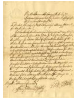
Warrant for a patent to Cadwallader Colden, Jun., and Co., 1738 (NYSA_A0272-78_V13_p003b)