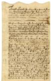
Indian deed for land near Schoharie creek, 1769 (NYSA_A0272-78_V25_p057a)