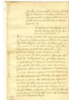
Warrant for a patent, to Philip Livingston and others, for five several tracts of land in the county of Albany (NYSA_A0272-