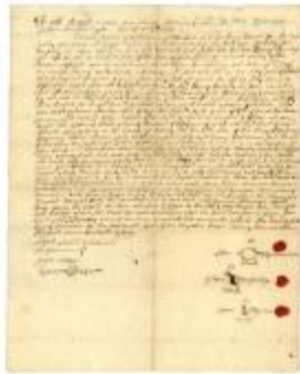
Indian deed to Henry Barclay of land on the south side of the Maquase river, 1740 (NYSA_A0272-78_V13_p069_s1)