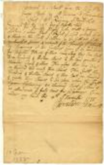
Return of a survey of a tract of land in the county of Albany laid out for Timothy Bagly and others (NYSA_A0272-78_V13_p008)