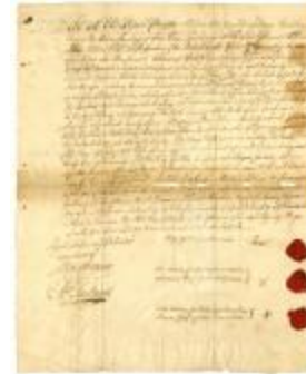
Indian deed to David Prym, 1766 (NYSA_A0272-78_V21_p165_s1)