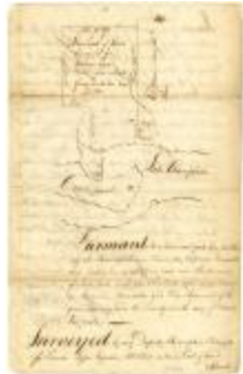
Survey for Francis Legge of land west of Lake Champlain, 1769 (NYSA_A0272-78_V25_p104b)