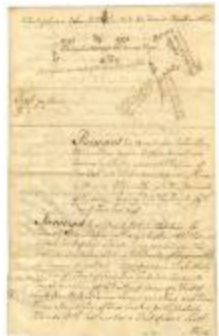
Survey for Beamsly Glazier of land on the Schoharie, 1772 (NYSA_A0272-78_V32_p039a)