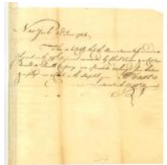
Certificate affirming James Ross's military service, 1766 (NYSA_A0272-78_V21_p066b)