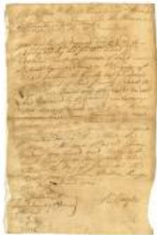
Warrant of land survey in Ulster County, 1720 (NYSA_A0272-78_V07_p176)