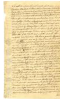
Indian deed to Teady Magin, 1754 (NYSA_A0272-78_V15_p112)