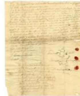
Indian deed to Colonel Cosby, for land on the Mohawk river, 1734 (NYSA_A0272-78_V11_p087)