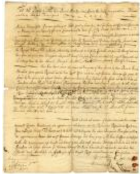
Indian deed to Jurch Hough and others, 1731 (NYSA_A0272-78_V10_p149)