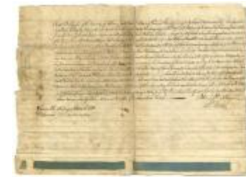
Certificate of Peter D. Schuyler and Robert Adams, 1770, relating to Indian deed to William Johnson, 1751 (NYSA_A0272-78_V26_p127b)