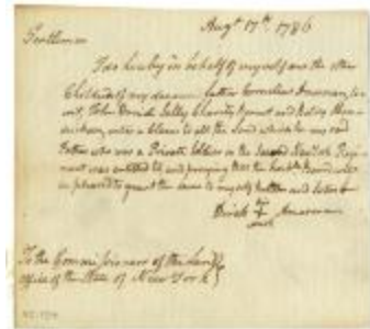
Claim of Dirck Amerman, 1786 (NYSA_A0272-78_V42_p134)