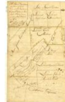
Map of area between the Connecticut river and Lake Champlain (NYSA_A0272-78_V23_p152)