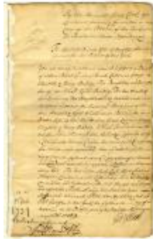
Warrant for patents for the Bradleys, and certificate (NYSA_A0272-78_V13_p021)