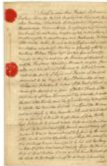
Indian deed to Jellis Fonda, 1772 (NYSA_A0272-78_V37_p055b)