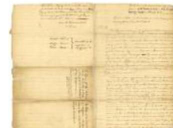
Petition on behalf of the inhabitants of New Canaan, New Concord, Spencer Town and New Britton, 1772 (NYSA_A0272-78_V32_p094)