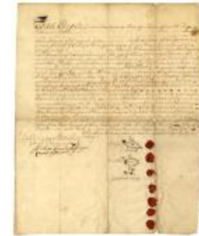
Indian deed to Jacob Lansingh of land at Canajoharie, 1735 (NYSA_A0272-78_V11_p194)