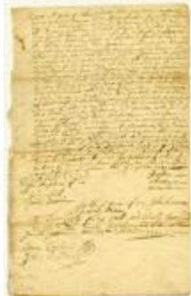
Indian deed to Engeltie, wife of Stephanus Gasherie, for a tract of land along Roundout Kill, Ulster County (NYSA_A0272-