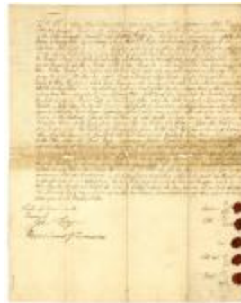
Indian deed to Lambartus Starnbergh, Scoharie county, 1753 (NYSA_A0272-78_V15_p051)