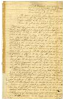
Answer of Cadwallader Colden, surveyor general, to the foregoing petition (NYSA_A0272-78_V13_p035)