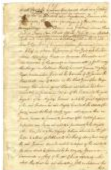
Indian deed for land lying on the west side of the Hudson River, 1772 (NYSA_A0272-78_V32_p043)