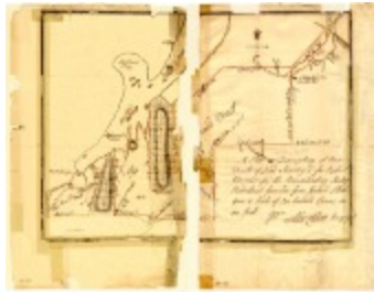
Map of two tracts of land surveyed for Robert Harpur, 1765 (NYSA_A0272-78_V18_p152)