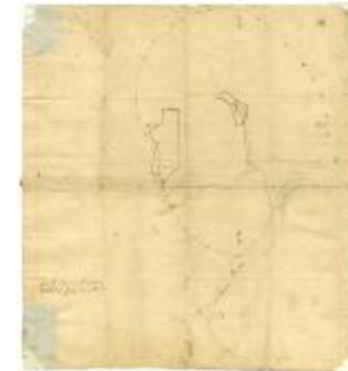
Draught of a tract of land on the west side of Hudson's river (NYSA_A0272-78_V13_p062)