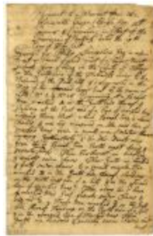
Return of a survey for Philip Livingston and others, for lands on the Mohawk river (NYSA_A0272-78_V13_p055)