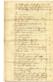
Table of fees for the ferry between the townships of Rye and Oysterbay (NYSA_A0272-78_V13_p024c)