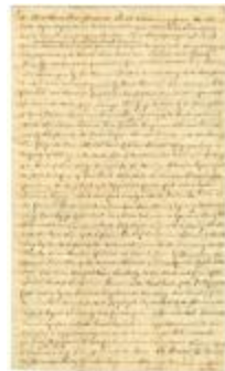
Copy of an Indian deed of land on the north of the Mohawk river, 1769 (NYSA_A0272-78_V25_p128)