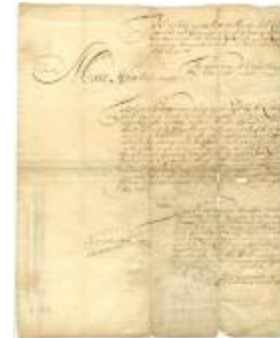
Petition of Elias Boudinot for land north of Saratoga, 1715 (NYSA_A0272-78_V06_p139a)