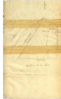
Map of land near Fort Hunter on the Mohawk river (NYSA_A0272-78_V45_p174)