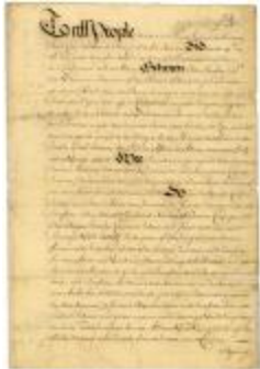
Exemplification of an Indian deed for land belonging to the Seneca, Cayuga and Onondaga, 1726 (NYSA_A0272-78_V10_p099)