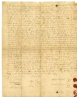
Schuyler's patent, 1754 (NYSA_A0272-78_V15_p104)