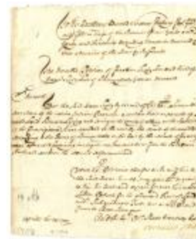
Petition of Cornelius Swits for a tract of land, 1708 (NYSA_A0272-78_V04_p120a)