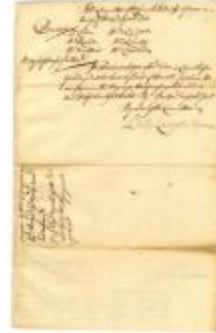
Report of Phillip Livingston on the petition of Henry Van Rensselaer, 1731 (NYSA_A0272-78_V11_p002b)