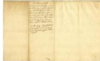
Petition against a Staten Island ferry, 1747, cover (NYSA_A0272-78_V14_p014b)