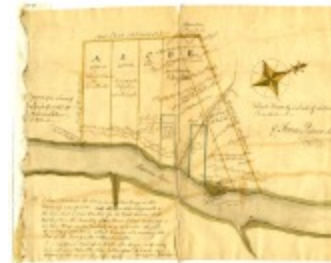
Map of a tract of land granted Francis Harrison and four others, 1767 (NYSA_A0272-78_V23_p034)