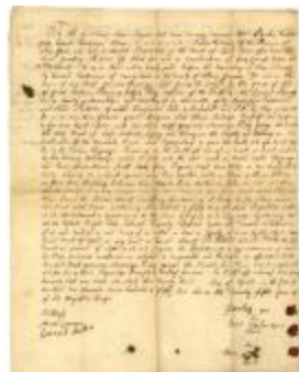
Indian deed to Coenrad Contreman of Canajoharie, 1752 (NYSA_A0272-78_V14_p145)