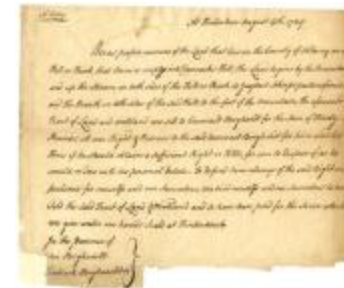
Exemplification of deed, dated 1729, to Coenradt Borghart, 1762 (NYSA_A0272-78_V16_p110a)