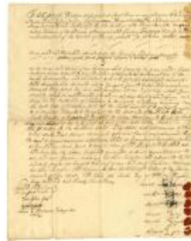
Indian deed to William York and others of land east side Schoharie kill, 1723 (NYSA_A0272-78_V09_p023)