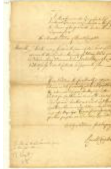
Petition of Ronald Campbell for land, 1738 (NYSA_A0272-78_V13_p001)