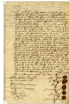
1711 Indian deed to Phillip Schuyler for use of 2,000 acres in the County of Albany (NYSA_A0272-78_V06_p042a)