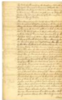
Exemplification of deed, dated 1729, to Coenradt Borghart, 1762 (NYSA_A0272-78_V16_p110c_1)