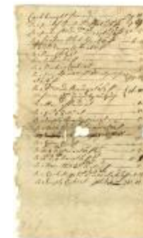
Obligations on George Clarke's land in Cherry Valley, 1752 (NYSA_A0272-78_V15_p079b)