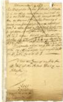
Warrant for a patent to Archibald Kennedy, for three several tracts of land in the county of Albany (NYSA_A0272-78_V13_p0025)