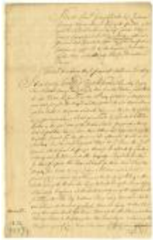
Certificate to Timothy Bagley (NYSA_A0272-78_V13_p012)