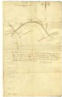
Map showing the location of Fort's ferry crossing on the Mohawk River (NYSA_A0272-78_V45_p126)