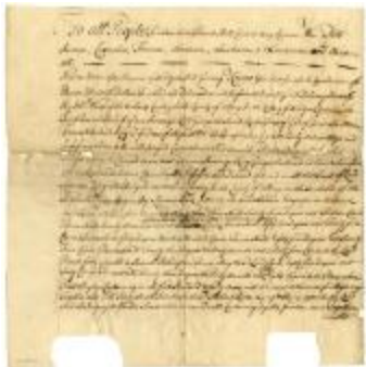
Indian deed to John Wemp of land on the south side of the Mohawk river, 1726 (NYSA_A0272-78_V12_p039a)