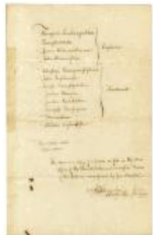
List containing the names of Indians commissioned by General Schuyler, on the 1st June, 1779 (NYSA_A0272-78_V49_p146)