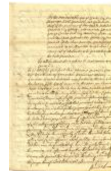
Certificate to Edward Collins and others, for a tract of land called Wallumschack (NYSA_A0272-78_V13_p037b)