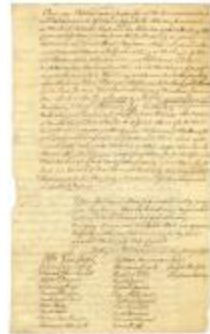
Petition against a Staten Island ferry, 1747 (NYSA_A0272-78_V14_p014a)