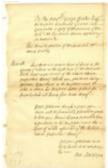
Petition of Henry Barclay for land (NYSA_A0272-78_V13_p063)