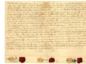
Deed from Mohawk Indians, October 28, 1754 with certificates dated October 25, 1754 (NYSA_A0272-78_V15_p123)