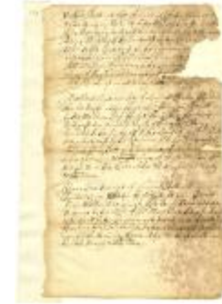
Survey of land on Long Island, 1676 (NYSA_A0272-78_V01_p073)