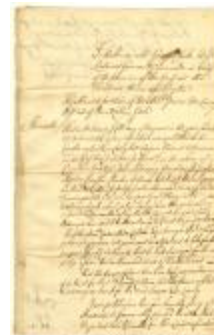
Petition of James De Lancey and Edward Collins for a patent to be granted for 12,000 acres of a certain tract of land