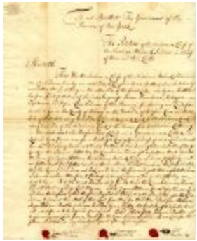
Petition of the Schoharie Mohawk Indians in relation to land on the west side of the Hudson River, around 1734 (NYSA_A0272-142a)