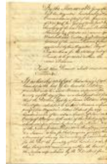
Certificate for Edward Clarke (NYSA_A0272-78_V13_p052b)