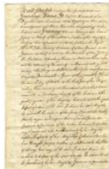
Indian deed to Ebenezer and Edward Jessup for land on the west side of the Hudson river, 1772 (NYSA_A0272-