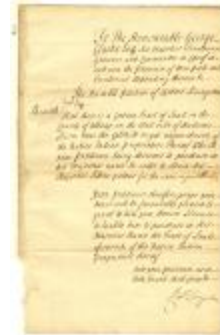
Petition of Roberts Livingston for land (NYSA_A0272-78_V13_p061)