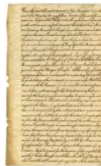
Copy of will of Major General John Bradstreet, 1774 and Will of Martha Bradstreet, 1781 (NYSA_A0272-78_V40_p125a)