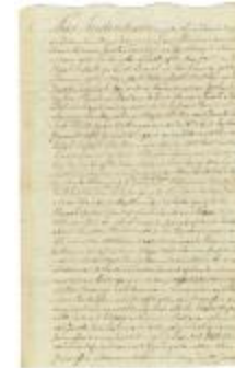
Indian deed to Elijah Russell, for lands near Hoosick (NYSA_A0272-78_V37_p049b)