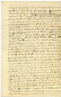
Indian deed to George Klock, 1761 (NYSA_A0272-78_V37_p148b)