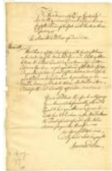
Petition of James Gillam, for land on the south side of Mohawk river (NYSA_A0272-78_V13_p048)