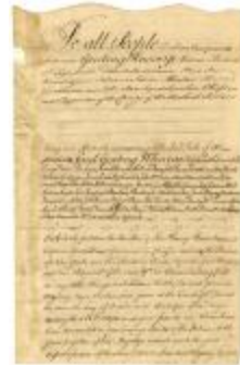
Indian deed for land near Sacandaga river, 1769 (NYSA_A0272-78_V25_p057b)