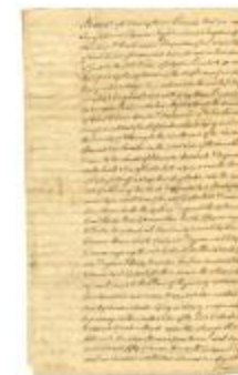
Exemplification of an Indian deed to Henry Remsen, 1764 (NYSA_A0272-78_V17_p145)