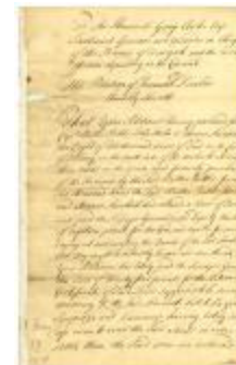
Petition of Jeremiah Dunbar, to have 6,000 acres of land laid out for him (NYSA_A0272-78_V13_p034)