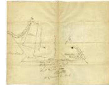
Map of land near Fort Hunter on the Mohawk river, 1790 (NYSA_A0272-78_V49_p146)