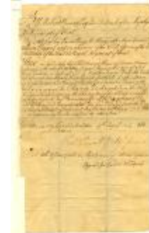
Certificate that Simon Bennis served as corporal in the 1st or royal regiment, 1763 (NYSA_A0272-78_V40_p001g)