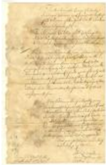
Petition of Phillip Livingston and others, for leave to purchase 12,000 acres of land, north of Mohawk river (NYSA_A0272-