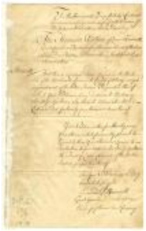
Petition of Leonard Gansevoort and others, for leave to purchase land (NYSA_A0272-78_V13_p016)