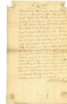
Caveat to petition against a Staten Island ferry, 1747 (NYSA_A0272-78_V14_p014c)