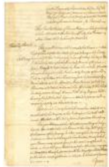
Petition of Thomas Palmer and others to purchase land, 1769 (NYSA_A0272-78_V26_p055)