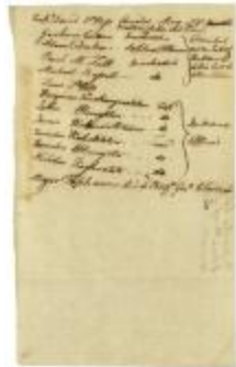
List of persons (whites and Indians) not compensated for military service, 1791 (NYSA_A0272-78_V50_p029)