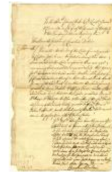
Petition of Cornelius Dubois, praying a patent for three several tracts of land (NYSA_A0272-78_V13_p027)