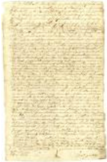
Indian deed to Jonathan Wickwere, 1771 (NYSA_A0272-78_V28_p039)