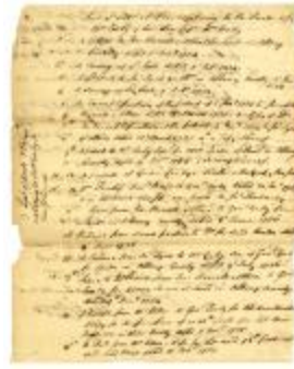
Memorandum of deed and leases of land in Rochester, 1733 and 1734 (NYSA_A0272-78_V13_p014)