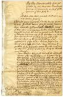
Patent to George Ingoldesby and others, for 32,000 acres of land on Mohawk river (NYSA_A0272-78_V13_p047)