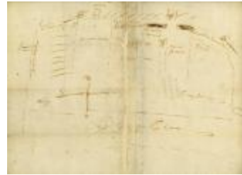
Undated manuscript sketch of Beverwyck now the City of Albany (NYSA_A0272- 78_V01_p058)