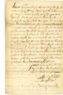
Survey for Francis Legge of land west of Lake Champlain, 1769 (NYSA_A0272-78_V25_p104a)