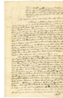
Petition of George Klock for a land survey, 1785 (NYSA_A0272-78_V37_p148a)