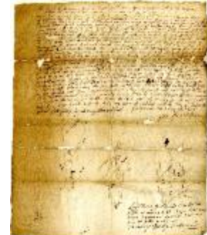
Descriptions of surveys of lands in Kingstown and Marbletown in Ulster County (NYSA_A0272-78_V02_p174)