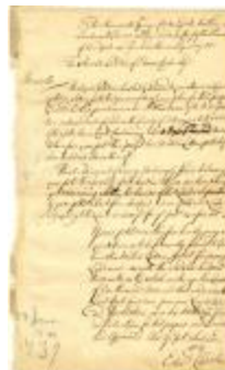
Petition of Edward Clark, praying for an additional grant of 400 acres (NYS A_0272-78_V13_p042)