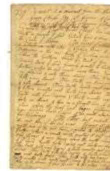
Return of a survey of land for Edward Clarke (NYS A_0272-78_V13_p046)