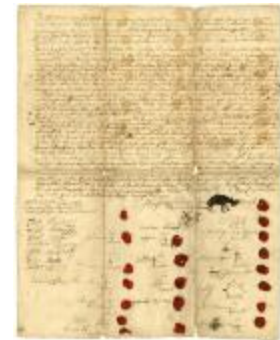
Indian deed to Lewis Morris and others for land south of the Mohawk river near the Noses, 1722 (NYSA_A0272-78_V08_p189)