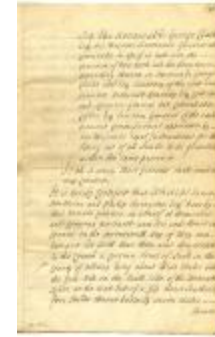
Certificate to Philip Livingston, for five tracts of land (NYSA_A0272-78_V13_p058b)