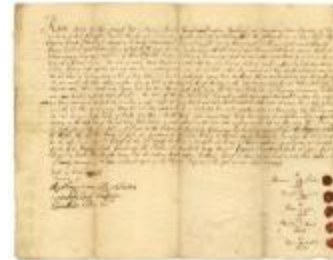
Indian deed to Casparis Bronck of land on the west side of the Hudson River, 1743 (NYSA_A0272-78_V13_p134)