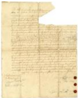
Indian deed to Jacob Glen and others of land on the south side of the Mohawk river, 1735 (NYSA_A0272-78_V11_p184)