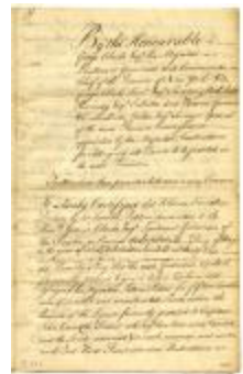
Certificate to Cornelius Dubois, for two certain tracts of land, part of Evans' patent (NYS A_0272-78_V13_p044b)