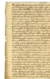
Copy of will of Major General John Bradstreet, 1774 (NYSA_A0272-78_V40_p125a)