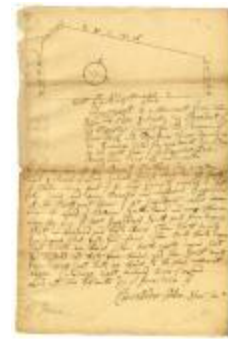
Survey of land in Ulster County, 1720 (NYSA_A0272-78_V07_p152)