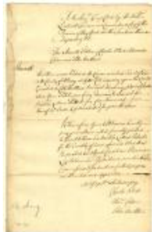
Petition of Charles O' Neill, for land at Catts kill (NYSA_A0272-78_V13_p051)