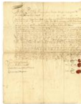
Indian deed to James Henderson of land on the south side of the Mohawk river, 1737 (NYSA_A0272-78_V12_p087)