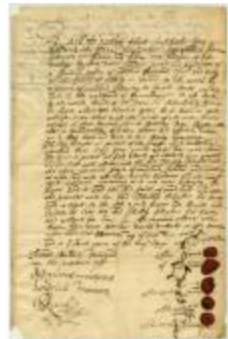
Indian deed to Phillip Schuyler for 2,000 acres in Albany County, 1711 (NYSA_A0272-78_V06_p042)