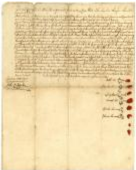
Indian deed to Philip Livingston and others of land above Saratoga, 1742 (NYSA_A0272-78_V13_p128)