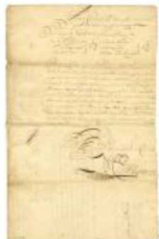
Council minutes regarding survey for Richard Sackett, 1704 (NYSA_A0272-78_V04_p020d)