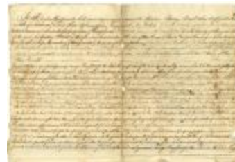
Indian deed to William Johnson, 1751 (NYSA_A0272-78_V26_p127a)