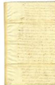
Petition of Hilleite van Olinda for a tract of land, 1704 (NYSA_A0272-78_V04_p027a)