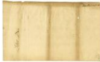
Wrapper for papers relating to the controversy between the heirs of General Bradstreet and the proprietors of the Hardenburgh Patent (NYSA_A0272- 78_V40_p125g)