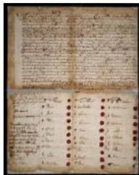
Indian Deed conveying land on the Mohawk River, 1732 (NYSA_A0272-78_V40_p096)