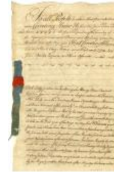
Indian deed for land at the mouth of Adiga creek, 1769 (NYSA_A0272-78_V25_p057d)