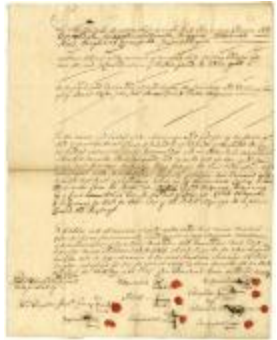
Indian deed to Conrardt Wyser and others of a tract of land in Mohawk country, 1723 (NYSA_A0272-78_V09_p058)