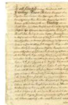
Indian deed to Totten and Crossfield for land on the west branch of the Hudson river, 1772 (NYSA_A0272-78_V32_p045)