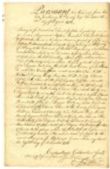
Return of survey of a certain tract of land called Wallumschack (NYS A_0272-78_V13_p038)