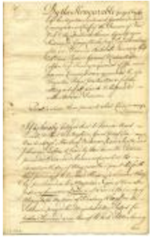
Certificate to Arent Bradt and others for several tracts of land (NYSA_A0272-78_V13_p056b)