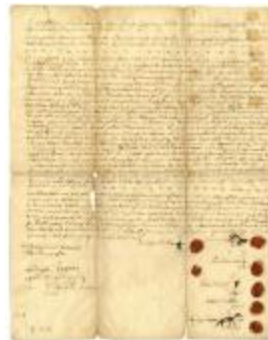
Indian deed to Lewis Morris and others for land south of the Mohawk river, 1722 (NYSA_A0272-78_V08_p102)