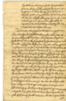
Certificate to Caldwellader Colden, the younger and others for a tract of land near Connajohery (NYSA_A0272-78_V13_p003a)