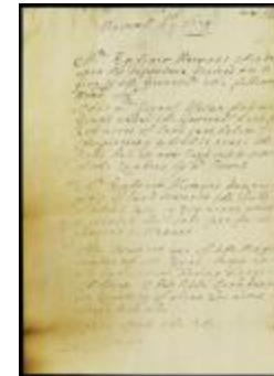
Memorandum of Ephraim Hermans for grants to Israel Helme, Otto Swanson and Laura Cock for 200 acres of land each