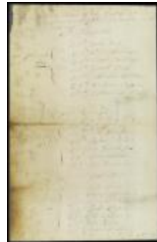
Names of the magistrates of New Castle, Upland, Whorekill and West New Jersey (NYSA_A1879-78_V21_0083)