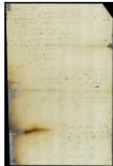
Names of the magistrates of New Castle, Upland, Whorekill and West New Jersey (NYSA_A1879-78_V21_0109)