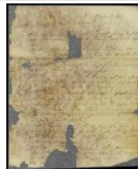
Minutes of council relative to capt. Burt's vessel (NYSA_A1879-78_V21_0064b)