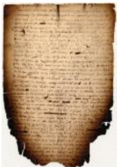
Letter of Maria van Rensselaer to Stephanus van Cortlandt (NYSL_sc7079- b06-f10_ncn)