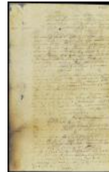
Case of Tymen Stiddem, declaring his right to certain land (NYSA_A1879-78_V21_0071)