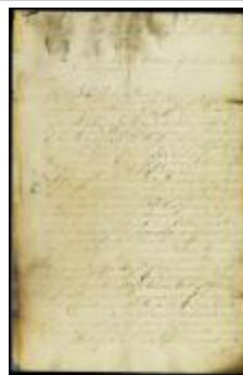
Petition of Arnlodus de La Grange relative to the island of Tinicum in the Delaware river (NYSA_A1879-78_V21_0051)