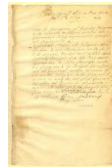
Council resolution on freedom of Native Americans from enslavement (NYSA_A1894-78_V028_174)