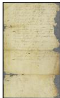
List of patents sent to capt. Edmund Cantwell which were refused to be signed (NYSA_A1879-78_V21_0057)