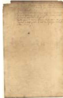
Dutch colonial council minutes, 7 December 1645 - 6 January 1646 (NYSA_A1809-78_V04_p241-244)