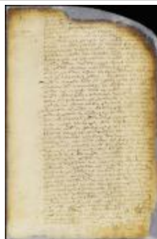
Patent of Frerick Lubbertsz for land on the East river (NYSA_A1880-78_VGG_0114)