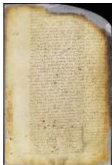
Patent of Jan Eversz Bout for land on Gouvanes kil (NYSA_A1880-78_VGG_0108)