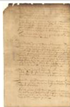
Dutch colonial council minutes, 20-21 July 1645 (NYSA_A1809-78_V04_p229)