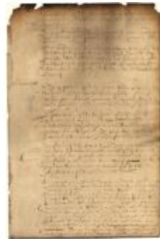
Dutch colonial council minutes, 3 November - 7 December 1645 (NYSA_A1809-78_V04_p239-240)