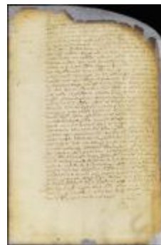
Patent of Edward Marrel for land on Manhattan Island (NYSA_A1880-78_VGG_0126)