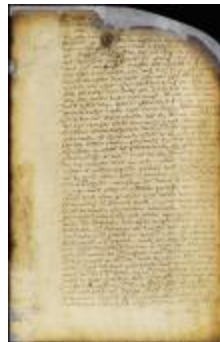
Patent of Thomas Sandersz for a lot on Manhattan Island (NYSA_A1880-78_VGG_0102)