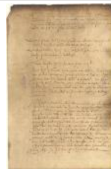
Dutch colonial council minutes, 2-8 May 1645 (NYSA_A1809-78_V04_p221)