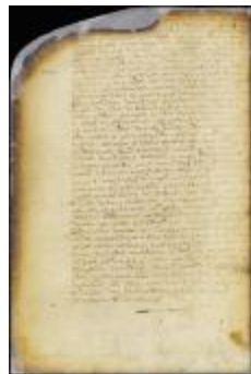
Patent of Peter Andersz for land on Manhattan Island (NYSA_A1880-78_VGG_0121)