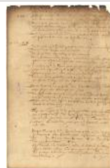
Dutch colonial council minutes, 21-27 July 1645 (NYSA_A1809-78_V04_p230)