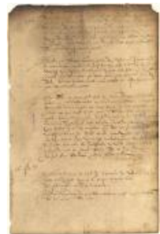
Dutch colonial council minutes, 10-12 January 1645 (NYSA_A1809-78_V04_p215)