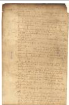
Dutch colonial council minutes, 20 July 1645 (NYSA_A1809-78_V04_p228)