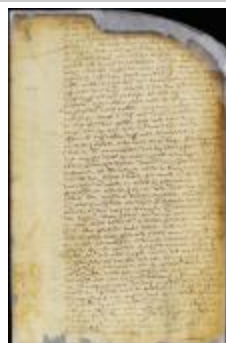
Patent of Harry Peers for land on Manhattan Island (NYSA_A1880-78_VGG_0110)