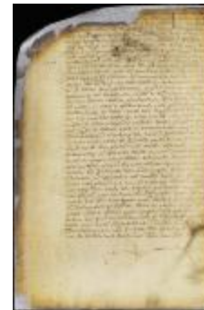
Patent of Leendert Aerden for a lot on Manhattan Island (NYSA_A1880-78_VGG_0103)