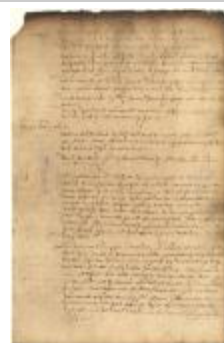
Dutch colonial council minutes, 16-20 June 1645 (NYSA_A1809-78_V04_p225)