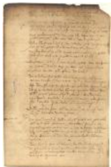
Dutch colonial council minutes, 21-23 March 1645 (NYSA_A1809-78_V04_p218)