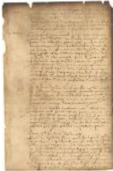
Dutch colonial council minutes, 11-12 October 1645 (NYSA_A1809-78_V04_p237-238)