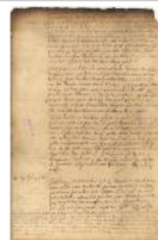
Dutch colonial council minutes, 20-29 June 1645 (NYSA_A1809-78_V04_p226)