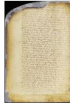
Patent of Isaac Deforeest for a lot on Manhattan Island (NYSA_A1880-78_VGG_0119)