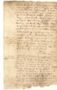
Declarations of Tobias Esaiassen and other soldiers respecting a goat found on the shore (NYSA_A0270-78_V2_143c)