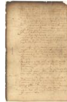
Dutch colonial council minutes, 21-28 September 1645 (NYSA_A1809-78_V04_p236)