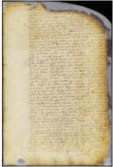
Patent of Cornelis Dircks for land on Long Island (NYSA_A1880-78_VGG_0128)