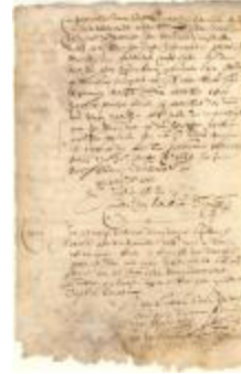
Copy of a note of Gysbert Lubbertsen (NYSA_A0270-78_V2_144c)