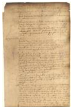
Dutch colonial council minutes, 4-15 July 1645 (NYSA_A1809-78_V04_p227)