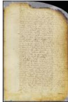
Patent of Andries Hudde for land on Long Island (NYSA_A1880-78_VGG_0118)