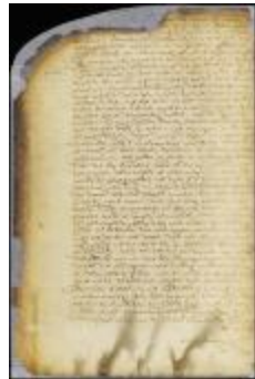
Patent of Cornelis Claesz for land on Manhattan Island (NYSA_A1880-78_VGG_0129)