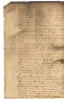
Dutch colonial council minutes, 7-21 September 1645 (NYSA_A1809-78_V04_p235)