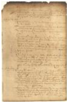
Dutch colonial council minutes, 27 July - 25 August 1645 (NYSA_A1809-78_V04_p231)