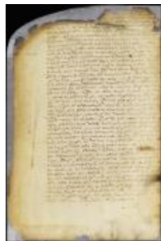
Patent of Big Manuel for land on the island of Manhattan (NYSA_A1880-78_VGG_0125)