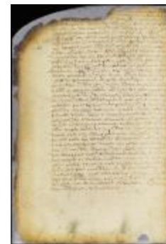
Patent of Hans Loodewyck for land on Manhattan Island (NYSA_A1880-78_VGG_0127)