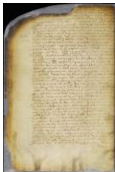
Patent of Claes Carsten for land on the East river (NYSA_A1880-78_VGG_0113)