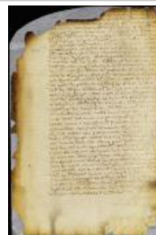
Patent of Jochim Calder for land on Manhattan Island (NYSA_A1880-78_VGG_0111)