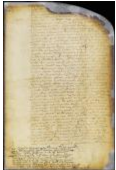
Patent of Leendert Aerden for land on Manhattan Island (NYSA_A1880-78_VGG_0120)