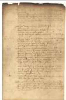
Dutch colonial council minutes, 10 June 1645 (NYSA_A1809-78_V04_p224)