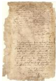
Release of all demands from Pieter Rouloffsen to Andries Hudde (NYSA_A0270-78_V2_147d)