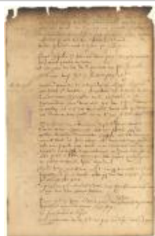
Dutch colonial council minutes, 30 March - 6 April 1645 (NYSA_A1809-78_V04_p219)