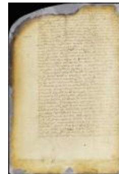
Patent of Edward Marrel for land on the East river (NYSA_A1880-78_VGG_0123)