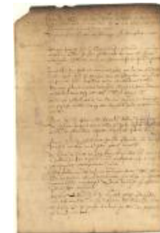
Dutch colonial council minutes, 9 March 1645 (NYSA_A1809-78_V04_p217)