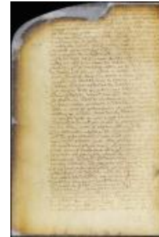
Patent of Robert Pinoyer for land on Long Island (NYSA_A1880-78_VGG_0147)