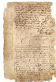
Declaration of Nicolaes Coorn regarding a statement made by Wilcock that a gold mine of which the Dutch were in search belonged