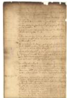
Dutch colonial council minutes, 5 January 1645 (NYSA_A1809-78_V04_p214)