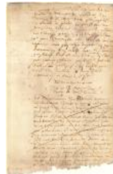
Bond of Isaac Allerton for 3750 guilders in favor of the owners of the frigate La Garce [canceled] (NYSA_A0270-78_V2_139f)