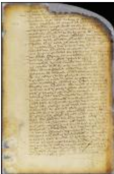
Patent of Cornelis van Tienhoven for land on Manhattan Island (NYSA_A1880-78_VGG_0100)