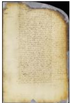
Patent of Touchyn Briel for land on Manhattan Island (NYSA_A1880-78_VGG_0124)