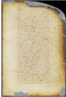
Patent of Juryaen Fradel for land east of Hellgate (NYSA_A1880-78_VGG_0116)