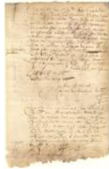
Notice of appeal from the judgment of the director and council against the master of the ship St. Pieter (NYSA_A0270-