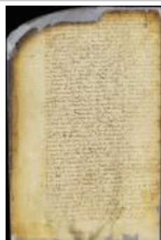
Patent of Claes Jansen van Naerden for land on Long Island (NYSA_A1880-78_VGG_0109)