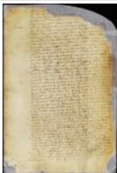
Patent of Harry Breser for land on the shore of the East river (NYSA_A1880-78_VGG_0112)