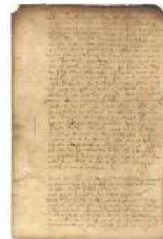
Dutch colonial council minutes, 23 February - 9 March 1645 (NYSA_A1809-78_V04_p216)