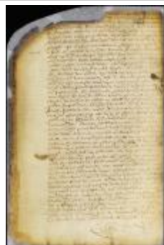
Patent of Ariaen Petersz for a lot on Manhattan Island (NYSA_A1880-78_VGG_0105)