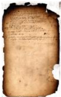
Notes and a Partial List of Acts and Memoranda in the First Series of Folios (NYSL_sc7079_dehooghes-memo-