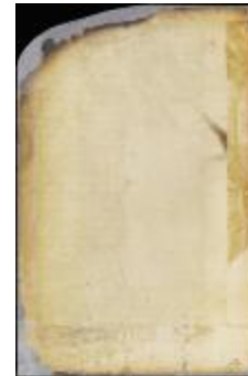
Indian deed for a tract of land on Long Island (NYSA_A1880-78_VGG_0052)