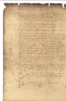
Dutch colonial council minutes, 6 April 1645 (NYSA_A1809-78_V04_p220)