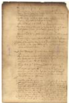
Dutch colonial council minutes, 11-29 May 1645 (NYSA_A1809-78_V04_p222-223)