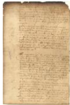
Dutch colonial council minutes, 30 August - 4 September 1645 (NYSA_A1809-78_V04_p232-234)