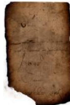
Title page (NYSL_sc7079_dehooghes-memo-book_B01)