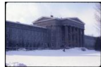
Utica Psychiatric Hospital (NYSA_B1560-97_B08_36)