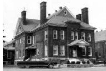
Walcott House, Utica Psychiatric Hospital (NYSA_B1560-97_B01_F13A_5)