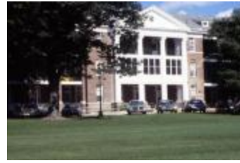
Utica Psychiatric Hospital (NYS A_B1560-97_B08_C)