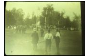
Utica Psychiatric Hospital (NYSA_B1560-97_B08_25)