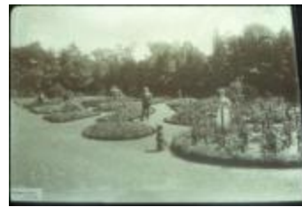
Utica Psychiatric Hospital (NYSA_B1560-97_B08_16)