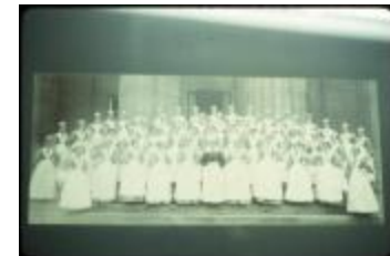
Utica Psychiatric Hospital (NYSA_B1560-97_B08_08)