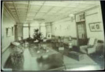
Utica Psychiatric Hospital (NYSA_B1560-97_B08_22)