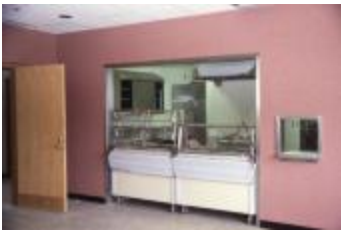
Utica Psychiatric Hospital (NYS A_B1560-97_B08_I)