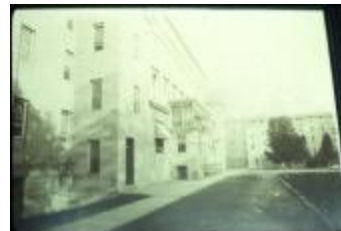
Utica Psychiatric Hospital (NYSA_B1560-97_B08_06)