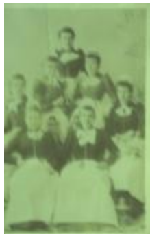
Utica Psychiatric Hospital (NYSA_B1560-97_B08_18)