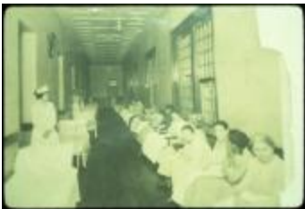
Utica Psychiatric Hospital (NYSA_B1560-97_B08_26)