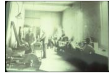
Utica Psychiatric Hospital (NYSA_B1560-97_B08_13)