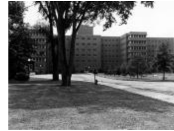
Brigham Building, Utica Psychiatric Hospital (NYSA_B1560-97_B01_F13B_1)