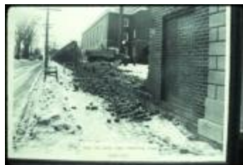
Utica Psychiatric Hospital (NYSA_B1560-97_B08_34)