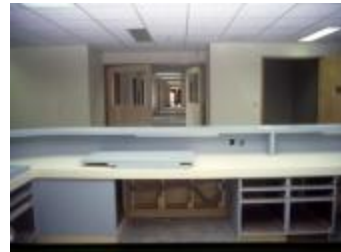
Utica Psychiatric Hospital (NYS A_B1560-97_B08_G)