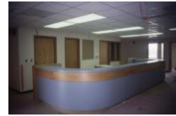
Utica Psychiatric Hospital (NYS A_B1560-97_B08_H)