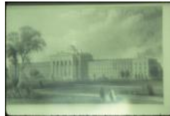
Utica Psychiatric Hospital