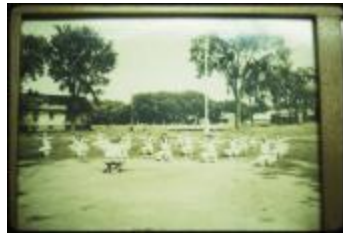
Utica Psychiatric Hospital (NYSA_B1560-97_B08_23)