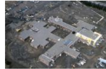
Utica Psychiatric Hospital (NYS A_B1560-97_B08_D)