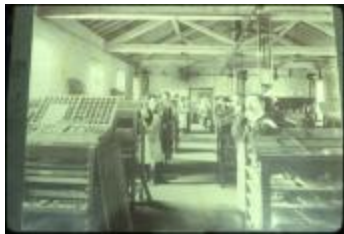
Utica Psychiatric Hospital (NYSA_B1560-97_B08_14)