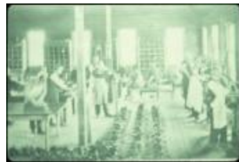
Utica Psychiatric Hospital (NYSA_B1560-97_B08_15)