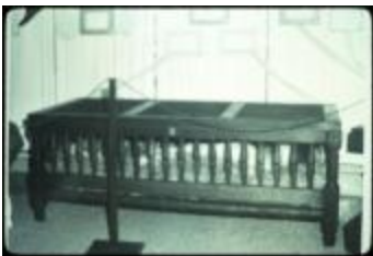
Utica Psychiatric Hospital (NYSA_B1560-97_B08_33)