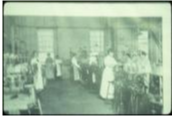
Utica Psychiatric Hospital (NYSA_B1560-97_B08_10)