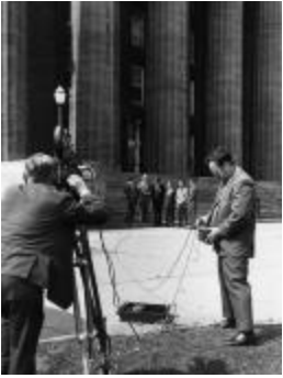
Utica Psychiatric Hospital (NYSA_B1560-97_B01_F01B_1)