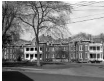
Dunham Hall, Utica Psychiatric Hospital (NYSA_B1560-97_B01_F13B_3)