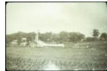
Utica Psychiatric Hospital (NYSA_B1560-97_B08_17)