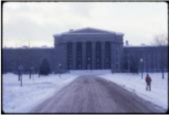
Utica Psychiatric Hospital (NYS A_B1560-97_B08_37)