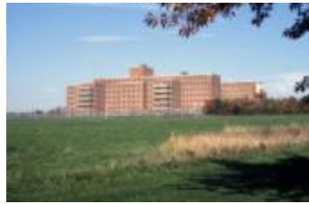
Utica Psychiatric Hospital (NYS A_B1560-97_B08_B)