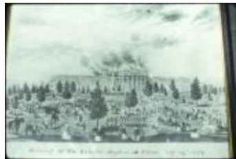
Utica Psychiatric Hospital (NYSA_B1560-97_B08_05)