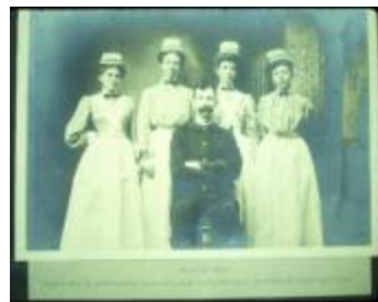
Utica Psychiatric Hospital (NYSA_B1560-97_B08_19)