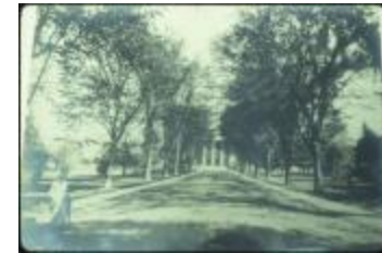
Utica Psychiatric Hospital (NYSA_B1560-97_B08_03)