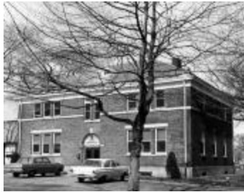
Laboratory, Utica Psychiatric Hospital (NYSA_B1560-97_B01_F13B_2)