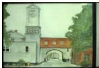
Utica Psychiatric Hospital (NYSA_B1560-97_B08_35)