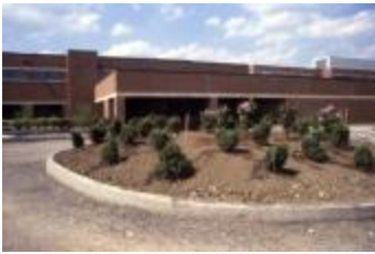
Utica Psychiatric Hospital (NYS A_B1560-97_B08_E)