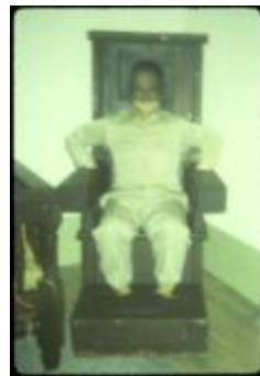
Utica Psychiatric Hospital (NYSA_B1560-97_B08_28)