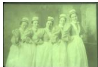
Utica Psychiatric Hospital (NYSA_B1560-97_B08_20)