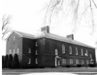
Utica Psychiatric Hospital (NYSA_B1560-97_B01_F13A_4)