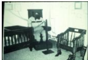
Utica Psychiatric Hospital (NYSA_B1560-97_B08_27)