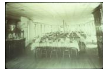
Utica Psychiatric Hospital (NYSA_B1560-97_B08_21)