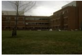
Utica Psychiatric Hospital (NYS A_B1560-97_B08_F)