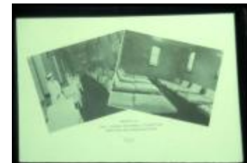
Utica Psychiatric Hospital (NYSA_B1560-97_B08_32)