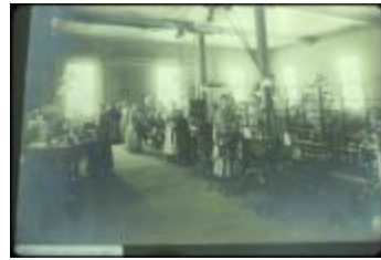
Utica Psychiatric Hospital (NYSA_B1560-97_B08_11)