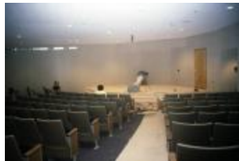
Utica Psychiatric Hospital (NYS A_B1560-97_B08_J)