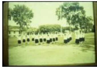
Utica Psychiatric Hospital (NYSA_B1560-97_B08_24)