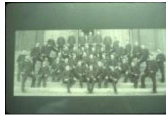
Utica Psychiatric Hospital (NYSA_B1560-97_B08_12)