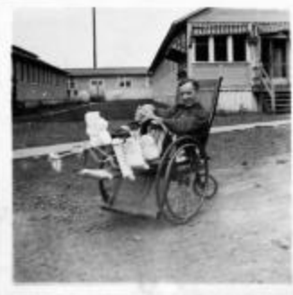
Eurie Bruss in a Wheelchair (NYSA_A0412-78_B02_F40_Bruss)