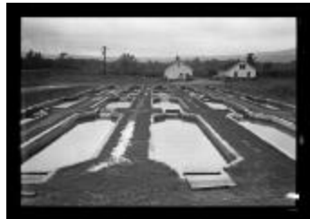
Rearing Ponds at Randolph Hatchery (NYSA_14297-87_2634)