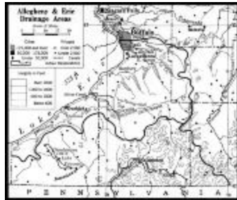
Physical Map of Allegheny and Erie Drainage Areas in New York. (NYSA_A3045-78_14521)