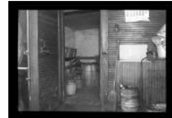
Randolph Hatchery, Interior of Refrigeration (NYSA_14297-87_2643)