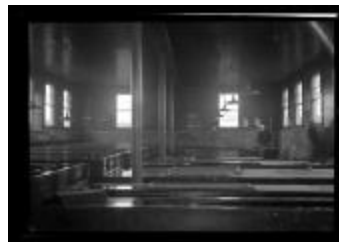
Randolph Hatchery Interior (NYSA_14297-87_2638)