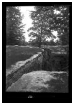
Photograph taken on a precipice (NYSA_14297-87_5175)