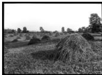
Hinsdale, Cattaraugus County (NYSA_A3045-78_Dn_AoX6)