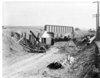
Bridge construction, Franklinville, NY (NYSA_17672-92_B11_1435_001)