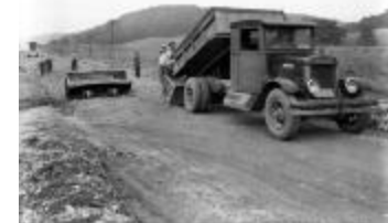
Little Valley, NY (NYSA_17672-92_B14_486_001)