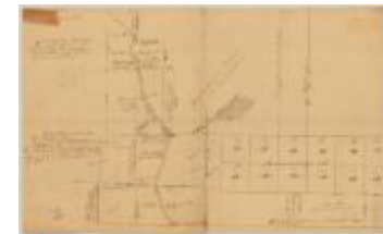
Patents along the Pennsylvania line, Hooper's tract, Randolph township. Map #739 (NYSA_A0273-78_739)