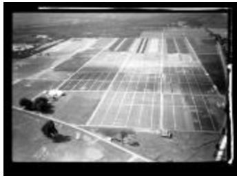
Salamanca, N.Y. Seed Beds 3 Yr. Old Red Pine (NYSA_14297-87_1933)