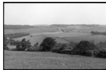
Newfield, Tompkins County (NYSA_A3045-78_Dn_C87)