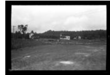
Rearing Ponds at Randolph Hatchery (NYSA_14297-87_2632)