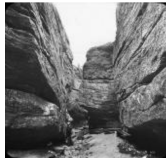
N.Y. Near Olean. Rock City. Among the Rocks. (NYSA_A3045-78_D47_OIY54_tif)