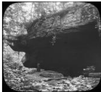
Rock City Shelving Rock (NYSA_A3045-78_D47_SR5)