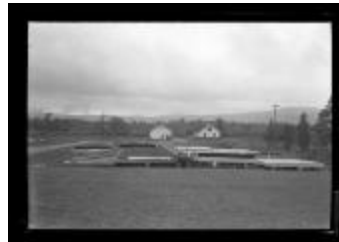
Rearing Ponds at Randolph Hatchery (NYSA_14297-87_2634a)