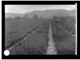
Salamanca, N.Y. Seed Beds 2 Yr. Old Red Pine (NYSA_14297-87_1934)