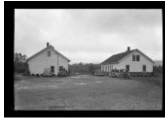
Randolph Hatchery Left Refrigeration House and Right Hatching Troughs (NYSA_14297-87_2642)