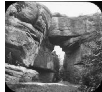
N.Y. Near Olean. Rock City. Natural Bridge. (NYSA_A3045-78_D47_OIY5_tif)