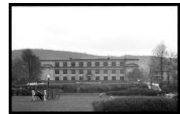
Salamanca, Cattaraugus County (NYSA_A3045-78_Dn_SaC)