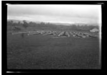
Rearing Ponds at Randolph Hatchery (NYSA_14297-87_2633)