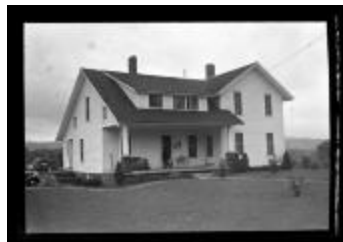
Hatchery Foreman's House at Randolph Hatchery (NYSA_14297-87_2637)