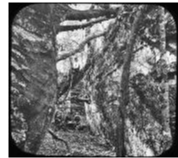
Rock City, showing Fissures or "Joints" (NYSA_A3045-78_D47_SR2)