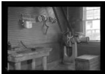
Randolph Hatchery, Chopping Block and Meat Chopper. (NYSA_14297-87_2644)