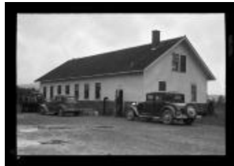
Randolph Hatcher Buildings (NYSA_14297-87_2641)