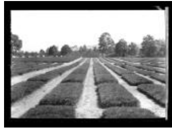
Salamanca, N.Y. Seed Beds 2 Yr. Old Red Pine (NYSA_14297-87_1935)