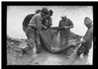
Young Fish in Hand Seine at Randolph Hatchery (NYSA_14297-87_2636)