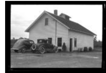
Randolph Hatchery Refrigeration House (NYSA_14297-87_2635)