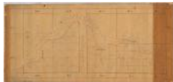
Map of the cession of the Holland Land Company to Erie Canal. Map #276 (NYSA_A0273-78_276)