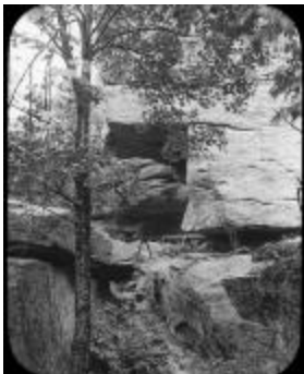
N.Y. Near Olean. Rock City. Huge Rocks. (NYSA_A3045-78_D47_OIY51_tif)