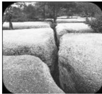
N.Y. Near Olean. Rock City. Top of Rocks. (NYSA_A3045-78_D47_OIY52_tif)