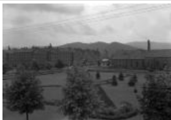
St. Bonaventure College in Olean, New York, 1937 (NYSA_A0245-77_Cattaraugus_B02_18)