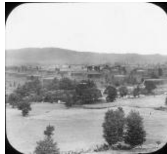
N.Y. Near Olean. Tank City. (NYSA_A3045-78_D47_OIY)