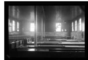
Randolph Hatchery Interior (NYSA_14297-87_2639)