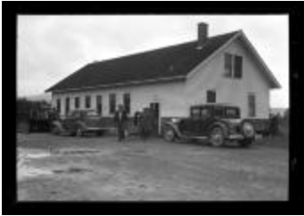
Randolph Hatcher Buildings (NYSA_14297-87_2640)