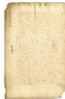
CHARTER PARTY of Den Eyckenboom to transport enslaved individuals from Guinea to Curaçao (NYSA_A1883-78_V17_044)