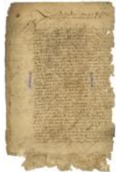
LETTER from Matthias Beck, vice-director of Curaçao to Petrus Stuyvesant (NYS_A1883-78_V17_056)