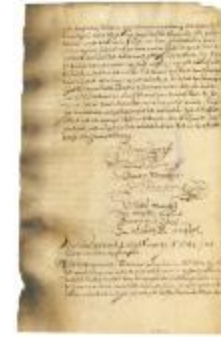
RESOLUTION permitting Company servants to return to the fatherland, and concerning ship's crews (NYS A1883-