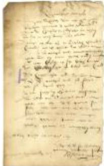
LETTER from Hendrick Martens, commander at Aruba, to Petrus Stuyvesant (NYSA_A1883-78_V17_067)