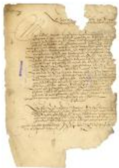
LETTER from Matthias Beck, vice-director of Curaçao to Petrus Stuyvesant (NYSA_A1883-78_V17_042)