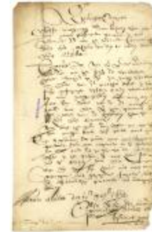
LETTER from Hendrick Martens, commander at Aruba, to Petrus Stuyvesant (NYSA_A1883-78_V17_066)