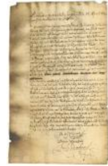
RESOLUTION to send Company blacks to Bonaire and to dispatch a sloop to catch turtles (NYS A1883-78_V17_005a)