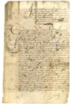
DEPOSITIONS relating to the seizure by pirates of enslaved individuals aboard the wrecked slaver St. Jan (NYS_A1883-