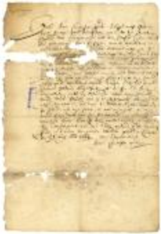
BILL OF LADING for 300 enslaved individuals loaded at Curaçao for New Netherland (NYSA_A1883-78_V17_086)