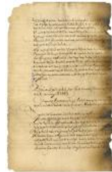
RESOLUTION. On five propositions for the Council of Curaçao concerning Bonaire and Aruba (NYS A1883-78_V17_002b)