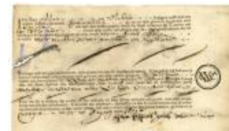
BILL OF LADING for five enslaved individuals loaded at Curaçao for New Netherland (NYSA_A1883-78_V17_051a)