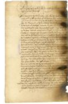
RESOLUTION concerning missions for ships present at Curaçao (NYS A1883-78_V17_003b)