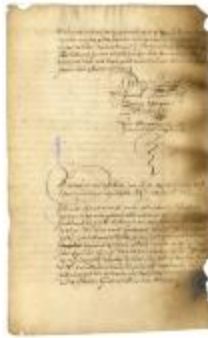
RESOLUTION concerning replacement personnel (NYS A1883-78_V17_004b)