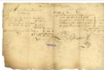
ACCOUNT (debit-credit) of Balthazar Stuyvesant (NYS A1883-78_V17_105)