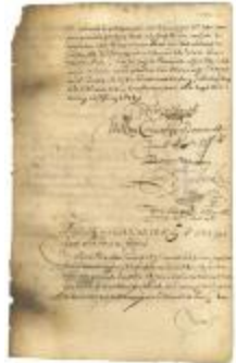
Resolution. To send people to New Netherland in the Blue Cock, as the director there is in want of assistance against