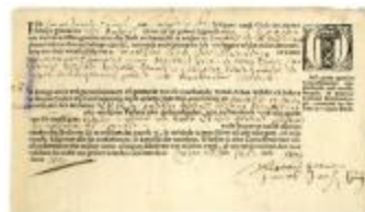
BILL OF LADING for dyewood and sugar loaded at Curaçao for New Netherland (NYSA_A1883-78_V17_047)