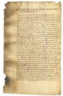
RESOLUTION concerning relief from the fatherlands (NYS A1883-78_V17_004a)