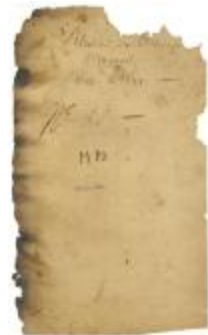
Five PROPOSALS concerning Bonaire & Aruba (NYS A1883-78_V17_002a)