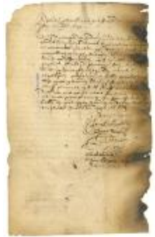
RESOLUTION against plundering gardens belonging to Blacks and indigenous peoples (NYS A1883-78_V17_002d)