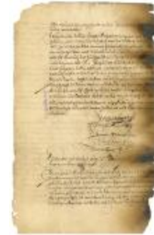
RESOLUTION concerning repairs to a yacht, search for seals and inspection of the salt pans on Bonaire (NYS A1883-