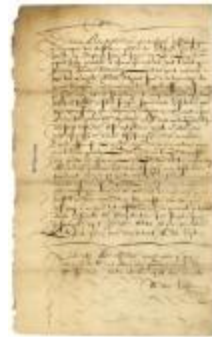
CHARTER of a captured English ship by Admiral de Ruyter to transport goods from Goree to Dutch fortress El Mina