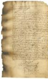
RESOLUTIONS concerning "freedoms and exemptions" granted to freemen (NYS A1883-78_V17_003a)