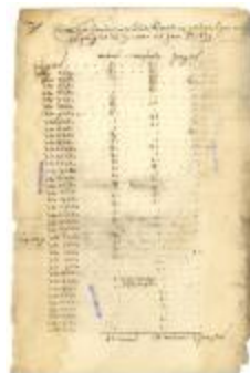
LIST of enslaved individuals who died aboard the slaver St. Jan, 30 June 1659-29 October 1659 (NYSA_A1883-78_V17_043b)