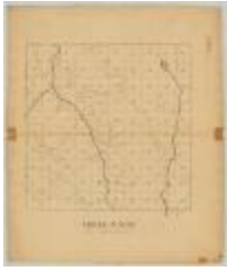
Locke, No. 18, Tompkins and Cayuga counties. Map #848 (NYSA_A0273-78_848)