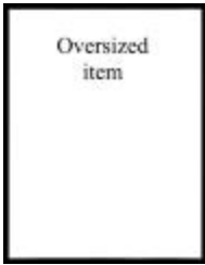
Map of Township of Lake Pleasant, Hamilton County. Map #587 (NYSA_A0273-78_587)