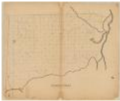
Junius, No. 26, Seneca county. Map #856 (NYSA_A0273-78_856)