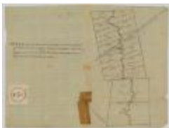
Map of Northhampton Patent. also the Philip Livingston Patent. Map #639 (NYSA_A0273-78_639)