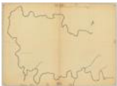
Delaware river, copied from a map by Metcalfe. Map #725 (NYSA_A0273-78_725)