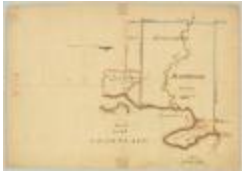
Map of township of Plattsburgh, 28,000 acres, on Lake Champlain. Map #721 (NYSA_A0273-78_721)