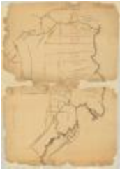
Map of lands on Lake Champlain near Ticonderoga. Map #747 (NYSA_A0273-78_747)