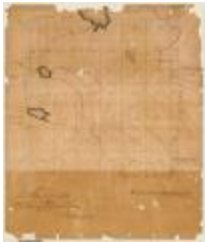
Map of Township No. 6, Totten and Crossfield's Purchase. Map #15 (NYSA_A0273-78_15)