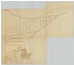
Lands of Philip Schuyler, with others adjoining. Map #811 (NYSA_A0273-78_811)