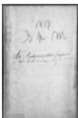
Engrossed minutes of the Supreme Court of Judicature, May 1817 (NYSA_JN531-17_R016_1817-05-05_1817-05-16)