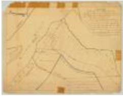
Map of land at Niagara Falls, part of Mile Strip. Map #805 (NYSA_A0273-78_805)