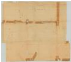
Map of the town of Marletown on Esopus creek. Map #786 (NYS A0273-78_786)