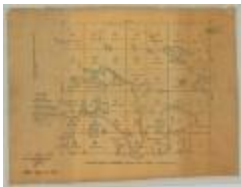
Macomb's Purchase. Great Lot No. 1, Township 20, Franklin County. Map #513 (NYS A0273-78_513)