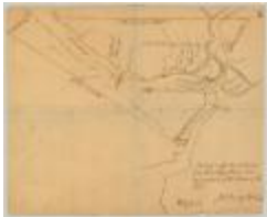
Map of lands adjoining Lake George near Fort Ticonderoga. Map #673 (NYS A0273-78_673)