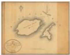
Map of Granadier and Fox Islands, situate in Lake Ontario. Map #270 (NYSA_A0273-78_270)