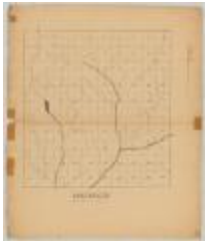
Fabius No. 13, Cortland and Onondaga counties. Map #845 (NYSA_A0273-78_845)