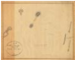
Map of Gull and Snake Island, situate on Lake Ontario. Map #267 (NYSA_A0273-78_267)