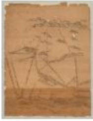
Map of the Town of Kinderhook. Map #411 (NYSA_A0273-78_411)