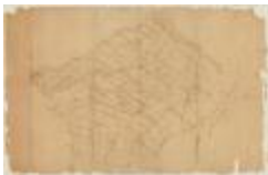
Map of Great Hardenbergh Patent. Map #140 (NYSA_A0273-78_140)