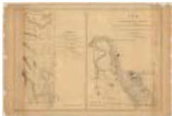
Map of east part of Onondaga Residence Reservation and Cowasselon Tract. Map #150 (NYSA_A0273-78_150)