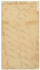
Map of part of the Hoosick Patent, Rensselaer county; by Beeker. Map #750 (NYSA_A0273-78_750)