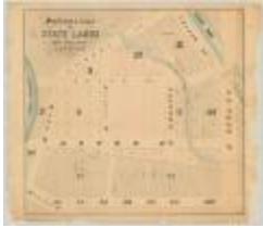
Map of Subdivisions of lands near Church Street, Syracuse. Map #458B (NYSA_A0273-78_458B)