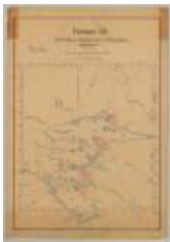
Totten and Crossfield's Purchase, Township 40 showing Raquette Lake. Map #503 (NYSA_A0273-78_503)