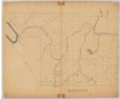
Manlius, No. 7, Onondaga county. Map #837 (NYSA_A0273-78_837)