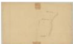
Survey of land for John Garnsey; 1000 acres. Map #765 (NYSA_A0273-78_765)