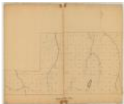
Pompey, No. 10, Onondaga county. Map #840 (NYSA_A0273-78_840)