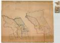
A map of the Oneida Reservation and subsequent purchases, 1798-1817