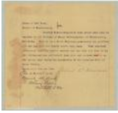
Document with Profile of the Walkkill river at Walden, Orange County. Map #472C (NYSA_A0273-78_472C)