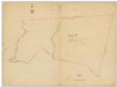
Map of Jellis Fonda, 40,000 acres, in Oneida county. Map #722 (NYSA_A0273-78_722)