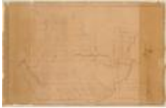
Map of a tract of unappropriated lands, lying in the towns of Elizabethtown and Keene. Map #11 (NYSA_A0273-78_11)