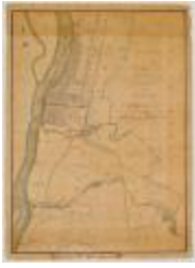
Map of the City of Troy. Map #152 (NYSA_A0273-78_152)