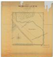
Sempronius, Lot No. 61. Cayuga County. Map #521 (NYS A0273-78_521)