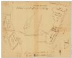
Long Island in Lake George, with adjacent uplands. Warren county. Map #693 (NYS A0273-78_693)