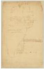
Survey of land for Alex Turner, 25,000 acres, on the Batten kill, and various others adjoining. Map #717 (NYSA_A0273-78_717)