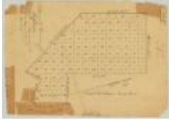
Map of Hoffman Township on Scaroon lake. Essex county. Map #806 (NYSA_A0273-78_806)