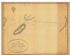
Map of Cherry Island, situate in the Chaumont Bay, Lake Ontario. Map #271 (NYSA_A0273-78_271)