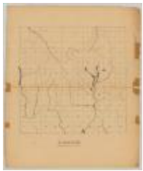
Tully, No. 14, Cortland and Onondaga counties. Map #844 (NYSA_A0273-78_844)