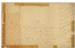
Map of part of Mayfield Patent, Fulton county. Map #870 (NYSA_A0273-78_870)