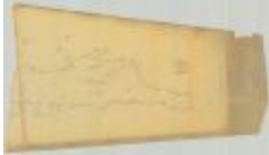
Lake George from original plot. Map #476B (NYSA_A0273-78_476B)