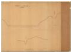
Profile of the Walkkill river at Walden, Orange County. Map #472A (NYSA_A0273-78_472A)