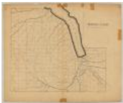
Ulysses, No. 22, Tompkins county. Map #852 (NYSA_A0273-78_852)