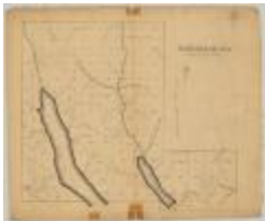
Marcellus, No. 9, Onondaga county. Map #839 (NYSA_A0273-78_839)