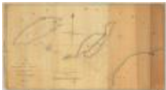
Map of Galloe, Little Galloe, Calf and Stoney Islands, situate in Lake Ontario. Map #268 (NYSA_A0273-78_268)