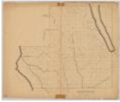
Scipio, No. 12, Cayuga county. Map #842 (NYSA_A0273-78_842)