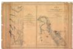
Map of the east part of the Onondaga Residence Reservation and Map of Cowasselon Tract, 1817 (NYSA_A0273-78_150a-150b)