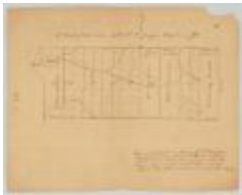
Map of first tract of Belvidere of George Croghan's Patent, Otsego county. Map #680 (NYS A0273-78_680)