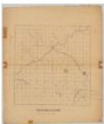
Dryden, No. 23, Tompkins County. Map #853 (NYSA_A0273-78_853)