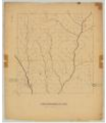
Cincinnatus, No. 25, Cortland county. Map #855 (NYSA_A0273-78_855)