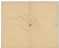
Map of Lake's Patent adjoining Wallumschack Patent. Map #770B (NYS_A0273-78_770B)