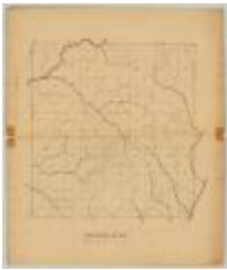
Solon, No. 20, Cortland county. Map #850 (NYSA_A0273-78_850)