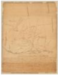
Map of the Town of Coxsackie, Green County. Map #420 (NYSA_A0273-78_420)