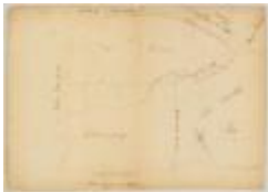
Map of second Township in Benson. Map #788 (NYS A0273-78_788)