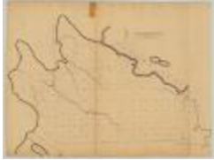
Cicero, No. 6, Onondaga county. Map #836 (NYSA_A0273-78_836)