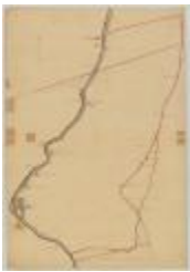
Map of township of Schenectady. Map #781 (NYS A0273-78_781)