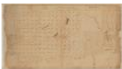
Map of Canadian Refugee Lands in Clinton county and Township of Mooers on Lake Champlain. Map #789 (NYS A0273-78_789)