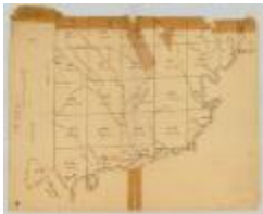
Hasenclever's Patent on Canada creek, Herkimer county, adjoins Cosby's Manor. Map #784 (NYS A0273-78_784)