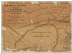
Corner Location of Benson Township, Jerseyfield Patent and Lawrence Patent. Map #512 (NYS A0273-78_512)