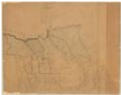
Map and copy of lands bordering Oneida Lake with references to Indian purchases, 1798-1817. Map#206 (NYSA_A0273-78_206)