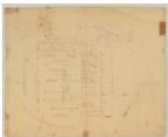
Township of Nettle Field; also Belvedere; Otsego county. Map #763 (NYSA_A0273-78_763)