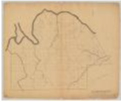
Camillus, No. 5, Onondaga county. Map #835 (NYSA_A0273-78_835)