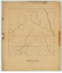
Virgil, No. 24, Cortland county. Map #854 (NYSA_A0273-78_854)