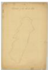
Protraction of Isle La Motte, Lake Champlain, Vermont. Map #726 (NYSA_A0273-78_726)