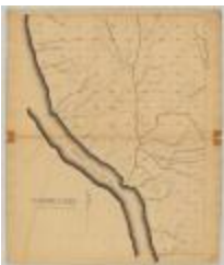
Milton, No. 17, Tompkins and Cayuga counties. Map #847 (NYSA_A0273-78_847)