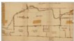
Coxe's Patent, also Hamden Tract, on Susquehanna river. Map #820 (NYSA_A0273-78_820)