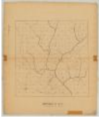
Homer, No. 19, Cortland county. Map #849 (NYSA_A0273-78_849)