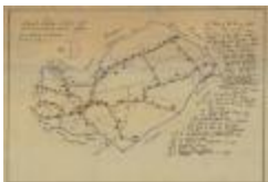
Map of the Town of White Plains, Westchester County. Map #404D (Copy) (NYSA_A0273-78_404D)