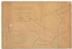
Map of several pieces of land situated in the Town of Bushwick, Kings County. Map #464 (NYSA_A0273-78_464)