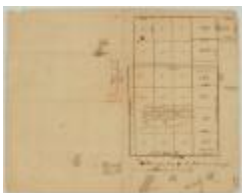
Canadian and Nova Scotia Refugee Lands, Clinton county. Map #746 (NYSA_A0273-78_746)