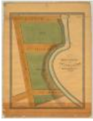
Plan for subdividing the State Lands south of Erie Canal and east of West Street. Map #453 (NYSA_A0273-78_453)