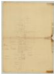
Land Patents north from the Batten kill, Washington county. Map #753 (NYSA_A0273-78_753)