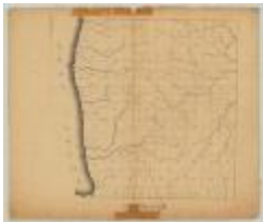
Hector, No. 21, Tompkins county. Map #851 (NYSA_A0273-78_851)