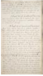
An Act relative to slaves and servants (NYSA_13036-78_L1817_Ch137_p2)