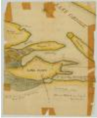
Map of Long Point on Lake George. Warren County. Map #672 (NYS A0273-78_672)