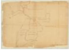
Map of various grants south and adjoining map #669. Map #670 (NYS A0273-78_670)