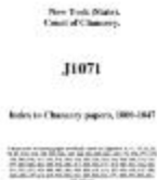
Index to Chancery Papers by complainant (NYSA_J1071-82_Index)