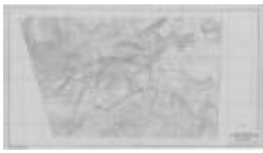
Highway corridor map: Contract CA 3125, Sheet 67-A (NYSA_B1804-02_Contract_CA_3125_067)