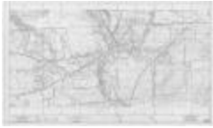
Highway corridor map: Contract D 22391, Sheet 2B (NYS B1804-02 Contract D22391_2B)