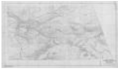
Highway corridor map: Contract CA 3125, Sheet 84-A (NYSA_B1804-02_Contract_CA_3125_084)