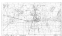
Highway corridor map: Contract D 22391, Sheet 1B (NYSA_B1804-02_Contract_D22391_1B)