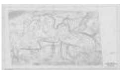
Highway corridor map: Contract CA 3125, Sheet 70-A (NYSA_B1804-02_Contract_CA_3125_070)