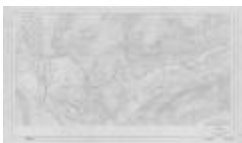
Highway corridor map: Contract CB 133B, Sheet 2B (NYSA_B1804-02_Contract_CB_133B_002)