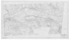
Highway corridor map: Contract CA 3125, Sheet 73-A (NYSA_B1804-02_Contract_CA_3125_073)