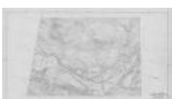
Highway corridor map: Contract CA 3125, Sheet 72-A (NYSA_B1804-02_Contract_CA_3125_072)