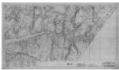
Highway Route Study of Selkirk, Schenectady and Vicinity. Albany and Schenectady Counties (NYSA_B1804-02_Contract_9764_33)