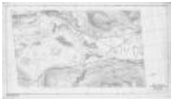
Highway corridor map: Contract CA 3125, Sheet 68-A (NYSA_B1804-02_Contract_CA_3125_068)