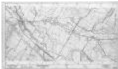
Highway corridor map: Contract D 22391, Sheet 5B (NYS B1804-02 Contract D22391_5B)