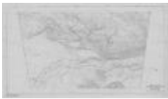
Highway corridor map: Contract CA 3125, Sheet 87-A (NYSA_B1804-02_Contract_CA_3125_087)