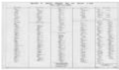
Highway corridor map: Contract D 22391, Index B, Sheet 1 of 1 (NYS B1804-02 Contract D22391_Index_B)