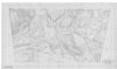
Highway corridor map: Contract CA 3125, Sheet 88-A (NYSA_B1804-02_Contract_CA_3125_088)