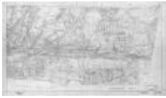
Highway corridor map for Route 9J, Columbiaville, Rensselaer County (NYSA_B1804-02_CB_133_Sheet12A)