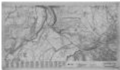
Highway Route Study of Selkirk, Schenectady and Vicinity. Albany and Schenectady Counties (NYSA_B1804-02_Contract_9764_27)