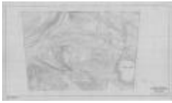
Highway corridor map: Contract CA 3125, Sheet 74-A (NYSA_B1804-02_Contract_CA_3125_074)