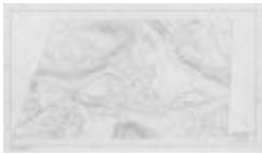
Highway corridor map: Contract CA 3125, Sheet 85-A (NYSA_B1804-02_Contract_CA_3125_085)