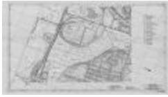
Highway Corridor Map of New York, Rt. 5, Fayetteville-Kirkville, Onondaga County (NYSA_B1804-02_9165)