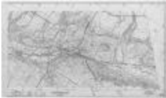
Highway corridor map: Contract D 22391, Sheet 4B (NYS B1804-02 Contract D22391_4B)