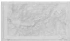
Highway corridor map: Contract CB 133B, Sheet 1B (NYSA_B1804-02_Contract_CB_133B_001)