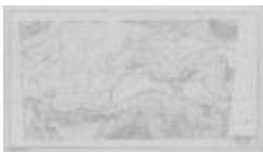
Highway corridor map: Contract CA 3125, Sheet 69-A (NYSA_B1804-02_Contract_CA_3125_069)