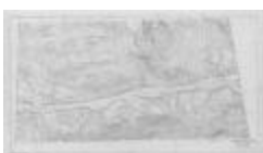
Highway corridor map: Contract CA 3125, Sheet 71-A (NYSA_B1804-02_Contract_CA_3125_071)