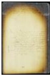
Nomination and appointment of magistrates of Heemsted (NYSA_A1809-78_V05_0426)