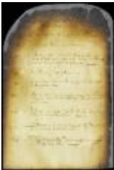
Register of ordinances and placards in Volume 6 (NYSA_A1809-78_V06_0389)