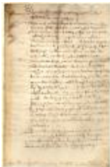
Duplicate of 12:7 dated 27 July 1654 (NYSA_A1810-78_V12_08)