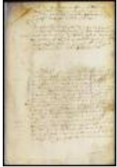
Ordinance imposing a tax on land and cattle (NYSA_A1875-78_V16_pt1_0053)