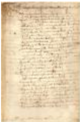
Letter from the directors in Amsterdam to Petrus Stuyvesant (NYSA_A1810-78_V12_07)