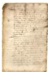
Letter from the directors at Amsterdam to Petrus Stuyvesant (NYSA_A1810-78_V12_10)