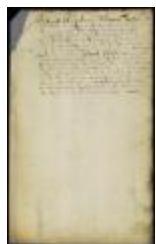
Patent of Gerrit Pietersen for land across the North river (New Jersey) (NYSA_A1880-78_VHHpt2_0033)