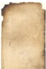
Dutch colonial council minutes, 1-7 July 1654 (NYSA_A1809-78_V04_p453)