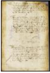
Ordinance regulating the duties of the provost marshal of Fort Amsterdam (NYSA_A1875-78_V16_pt1_0050)