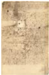
Abstract of a letter from the burgomasters and schepens of New Amsterdam to the directors of the WIC (NYSA_A1810-78_V12_06c)