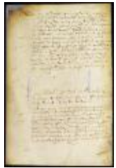
Ordinance against furnishing liquors to indigenous peoples (NYSA_A1875-78_V16_pt1_0055)