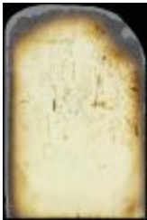
Scratch paper and endpapers of Volume 6 (NYSA_A1809-78_V06_0390)