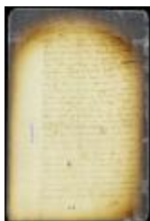
Order in the case of William Becker (NYSA_A1809-78_V05_0418)