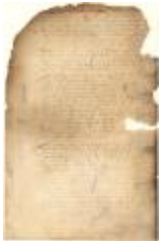
Dutch colonial council minutes, 8 April 1654 (NYSA_A1809-78_V04_p449)