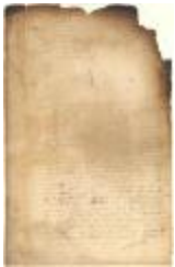
Dutch colonial council minutes, 22 July 1654 (NYSA_A1809-78_V04_p458)