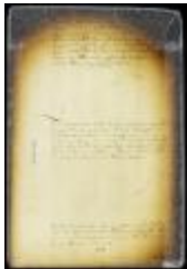
Order respecting the salary of Johannes Dyckman (NYSA_A1809-78_V05_0376a)