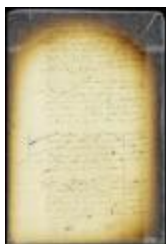
Motion to postpone the case of Van Curler vs. Spicer; granted (NYSA_A1809-78_V05_0402a)