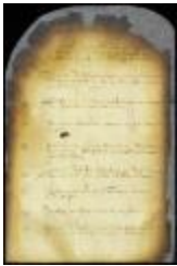
Register of the principal resolutions in Volume 6 (NYSA_A1809-78_V06_0385)