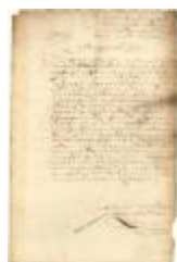
Resolution of the Chamber at Amsterdam (NYSA_A1810-78_V12_11)