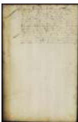
Patent of Jan Gerritsen van Immen for land across the North river (New Jersey) (NYSA_A1880-78_VHHpt2_0031)