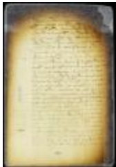
Indictment of Gerrit Trompetter (NYSA_A1809-78_V05_0378)