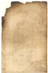
Dutch colonial council minutes, 22 July 1654 (NYSA_A1809-78_V04_p457)