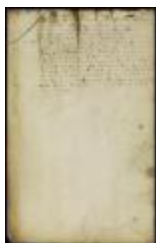
Patent of Jan Lubbertsen for of land across the North river (New Jersey) (NYSA_A1880-78_VHHpt2_0030)