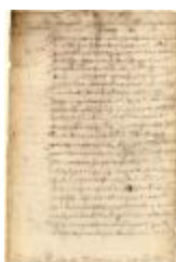
Letter from the directors in Amsterdam to Petrus Stuyvesant (NYSA_A1810-78_V12_13)