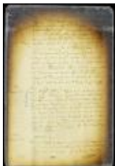
Order to Dirck van Schelluyne to defend Cornelis Willemsen (NYSA_A1809-78_V05_0366)