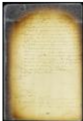
Letter from director and council to the magistrates of Heemsted, New Amsterdam (NYSA_A1809-78_V05_0427a)