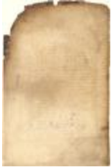
Dutch colonial council minutes, 11 July 1654 (NYSA_A1809-78_V04_p455)