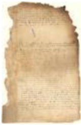
Dutch colonial council minutes, 28 January - 8 April 1654 (NYSA_A1809-78_V04_p448)