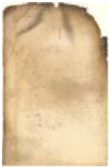
Dutch colonial council minutes, 11 July 1654 (NYSA_A1809-78_V04_p456)