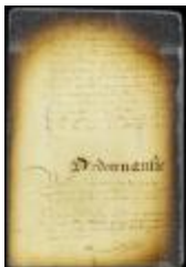
Ordinance regulating the duties of the provost marshal (NYSA_A1809-78_V05_0334)