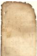
Dutch colonial council minutes, 1 July 1654 (NYSA_A1809-78_V04_p452)