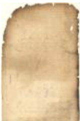
Dutch colonial council minutes, 1 July 1654 (NYSA_A1809-78_V04_p451)