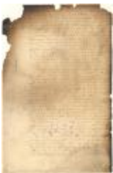
Dutch colonial council minutes, 22 July 1654 (NYSA_A1809-78_V04_p459)