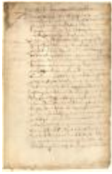
Letter from the directors at Amsterdam to the municipal officers at New Amsterdam (NYSA_A1810-78_V12_05)