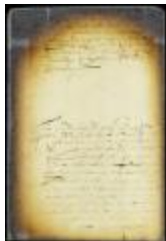
Resolution granting Andries Harpert an island opposite Fort Orange and a piece of wood land on the east bank (NYSA_A1809- 78_V05_0405b)