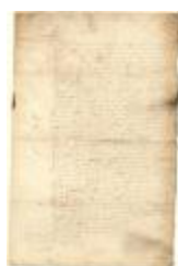
Letter from Schout Morris of Gravesend to Petrus Stuyvesant (NYSA_A1810-78_V12_12)