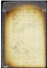
Indictment against Elias Emmens (NYSA_A1809-78_V05_0375b)