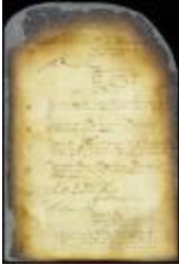
Index of entries in Volume 6 relating to the burgomasters and schepens of New Amsterdam (NYSA_A1809-78_V06_0382)