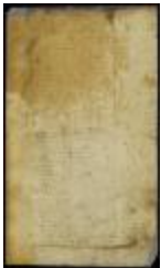
Patent of Lieve Jansen for land on Long Island (NYSA_A1880-78_VHHpt2_0001)