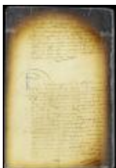
Motion of the fiscal that Cornelis Willemsen be examined (NYSA_A1809-78_V05_0338a)