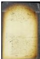
Letter from director and council to the governor of Connecticut (NYSA_A1809-78_V05_0394)