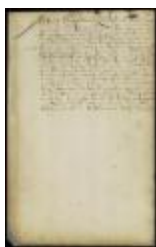
Patent of William Bredenbent for a lot in New Amsterdam (NYSA_A1880-78_VHHpt2_0028)