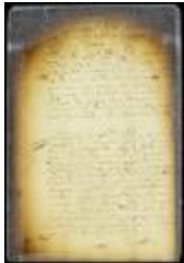
Authority to the magistrates of Midwout (Flatbush) to levy a tax of six guilders on each lot (NYSA_A1809-78_V05_0361a)