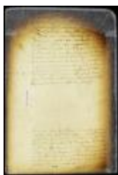
Appraisal of the Shark (NYSA_A1809-78_V05_0390)