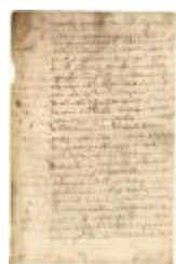
Duplicate of 12:13 (NYSA_A1810-78_V12_15)