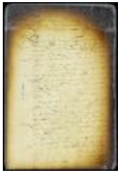
Examination of Samuel Touw (NYSA_A1809-78_V05_0360)