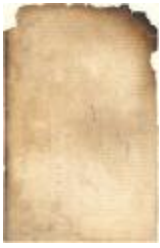
Dutch colonial council minutes, 11 July 1654 (NYSA_A1809-78_V04_p454)