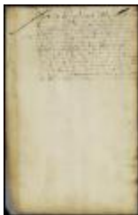
Patent of Jan Cornelissen for land across the North river (New Jersey) (NYSA_A1880-78_VHHpt2_0032)