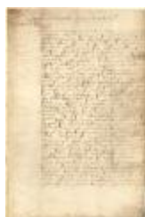
Copy of 12:13 (NYSA_A1810-78_V12_16)