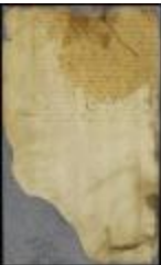
Patent of Annetje Bogardus for land on Long Island (NYSA_A1880-78_VHHpt2_0004)