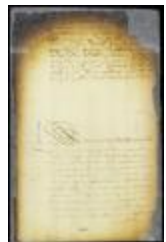
Answer to the protest of Hendrick van Elswyck (NYSA_A1809- 78_V05_0410)