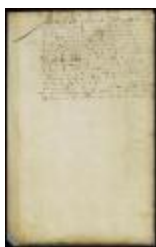
Patent of Ensign Dirck Smith for land on Long Island (NYSA_A1880-78_VHHpt2_0041)