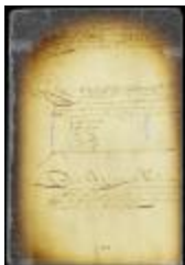
Appointment and qualification of Arent van Vlieringen as provoost (NYSA_A1809-78_V05_0337)