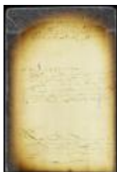
Order in the case of Visch vs. Withart in appeal (NYSA_A1809-78_V05_0403a)