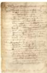
Letter from the directors at Amsterdam to the Director General and Council (NYSA_A1810-78_V12_09)