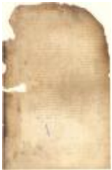
Dutch colonial council minutes, 8 April 1654 (NYSA_A1809-78_V04_p450)